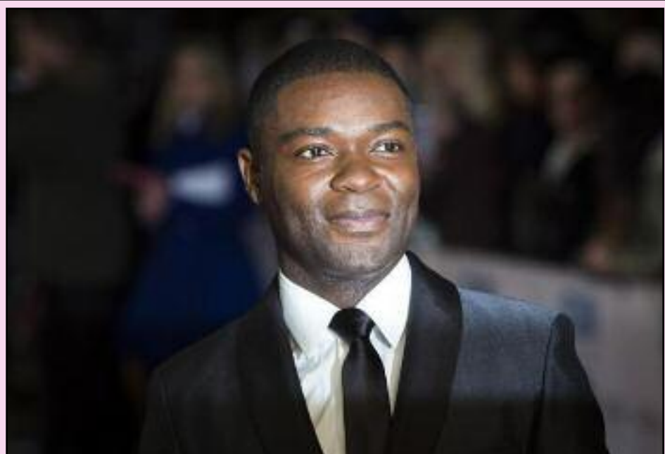
OYELOWO: I shouldn't have to feel like I have to move to America to have a notable career"

Oyelowo told the Radio Times : "There's a string of black British actors passing through where I live now in LA. We don't have 'Downton Abbey', or 'Call