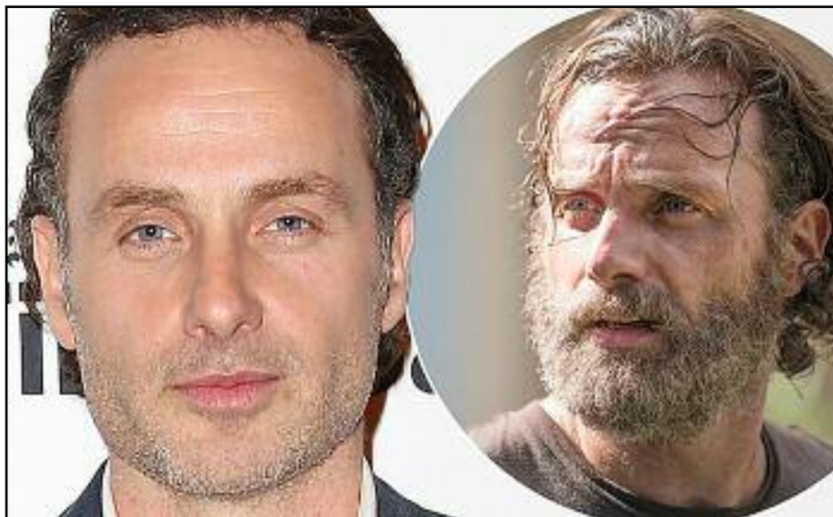
GRIMES AND PUNISHMENT: Andrew Lincoln anchors The Walking Dead

anything you've seen before when it comes to the midseason premiere, what happened and