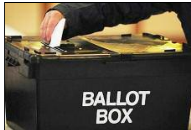
TROUBLE AHEAD: the Scottish Labour leader has warned that an SNP surge would benefit the Tories

Labour campaign there remains room for movement before May," he added.