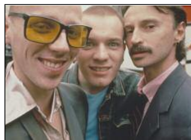
TRAINSPOTTING : another one along in a minute?

"The Scottish Government recognises and values the vision and the ambition of Scotland's screen sector and we are