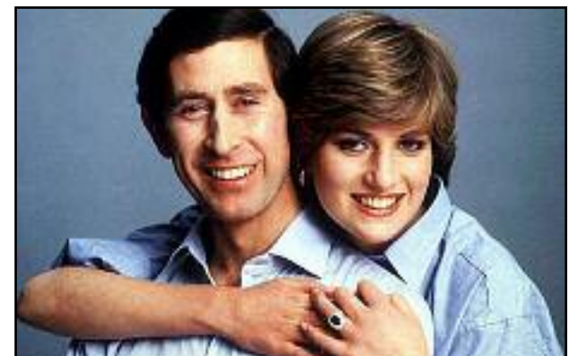
TROUBLE AHEAD: Charles and Diana in 1981

The biography has already caused controversy over its depictions of the Prince's court as a modern-day "Wolf Hall" riven with backstabbing and rivalry, and Clarence House has