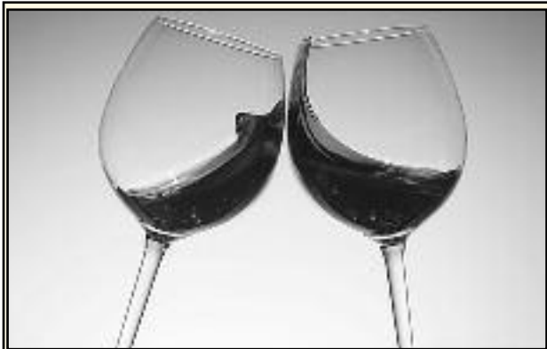
CHEERS: Brits have developed a growing fondness for Argentine wine in the past few years