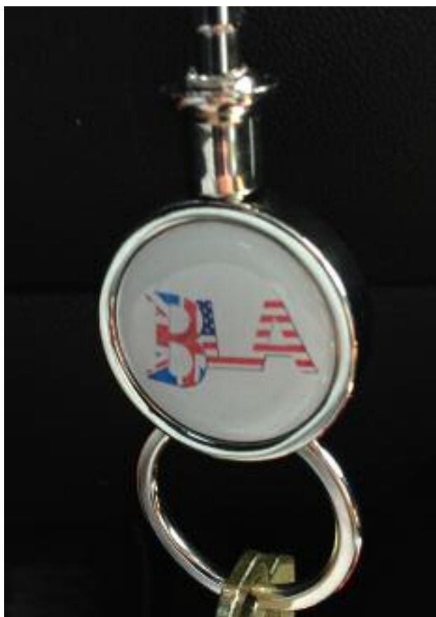
NOT A KEY MEMBER? hook up now for some of the best deals in town....