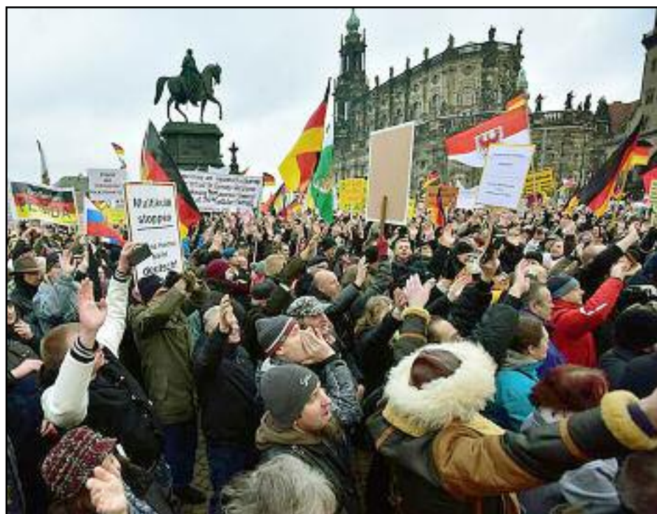
THE NEW RIGHT: The German-based organization held a large rally in Dresden following the Charlie Hebdo massacre last month in Paris

Pegida's progress in Germany has been hit by the resignation of five leaders amid fears the cause was being hijacked by extremists.