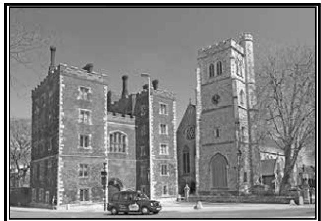
RICH HISTORY: St Mary at Lambeth is located next to Lambeth Palace, the Archbishop's offficial residence

The acid attack is one of three similar reports made to police in London over the past week.