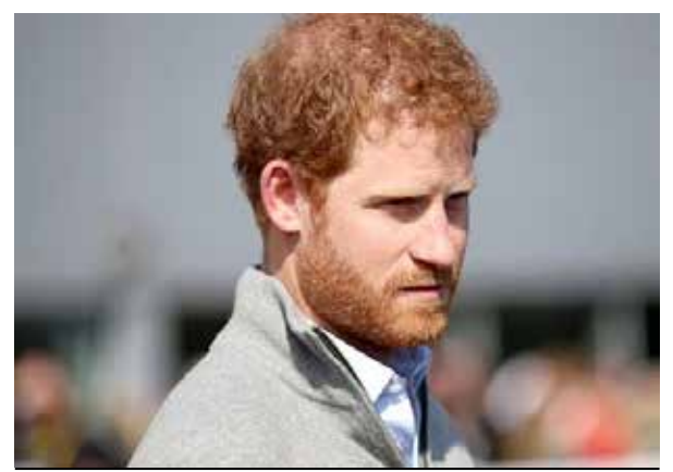
"My way of dealing with it was sticking my head in the sand, refusing to ever think about my mum, because why would that help?" - PRINCE HARRY

"And then [I] started to have a few conversations and actually all of