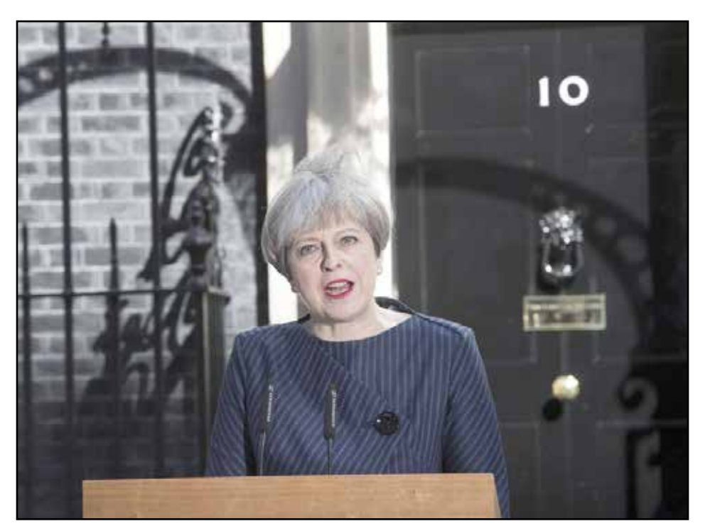
MAY: accused rival parties of 'game playing' over Brexit negotiations

"I have only recently and reluctantly come to this conclusion. Since I became prime minister I've said there should be no election until 2020, but now I have concluded that the only way to guarantee