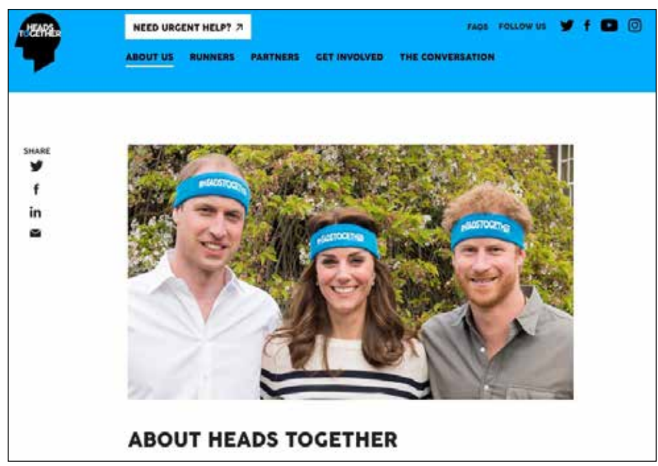
DOING GOOD WORK: the royal trio are promoting headstogether.co.uk

I think we have all been affected by this in one way or another - just the anxiety of starting a new life and moving to a new country is enough to send anyone a bit bonkers, and we all react in different ways. Mental health issues can be triggered by many things, not just traumatic events. I have struggled with mild anxiety and lethargy over the past couple of years and it turns out that for me it is caused by extremely low iron levels. I am fortunate enough to have found an excellent GP who made the discovery that I am anemic. This comes with many symptoms which can often be confused with mental health including problems. fatigue which