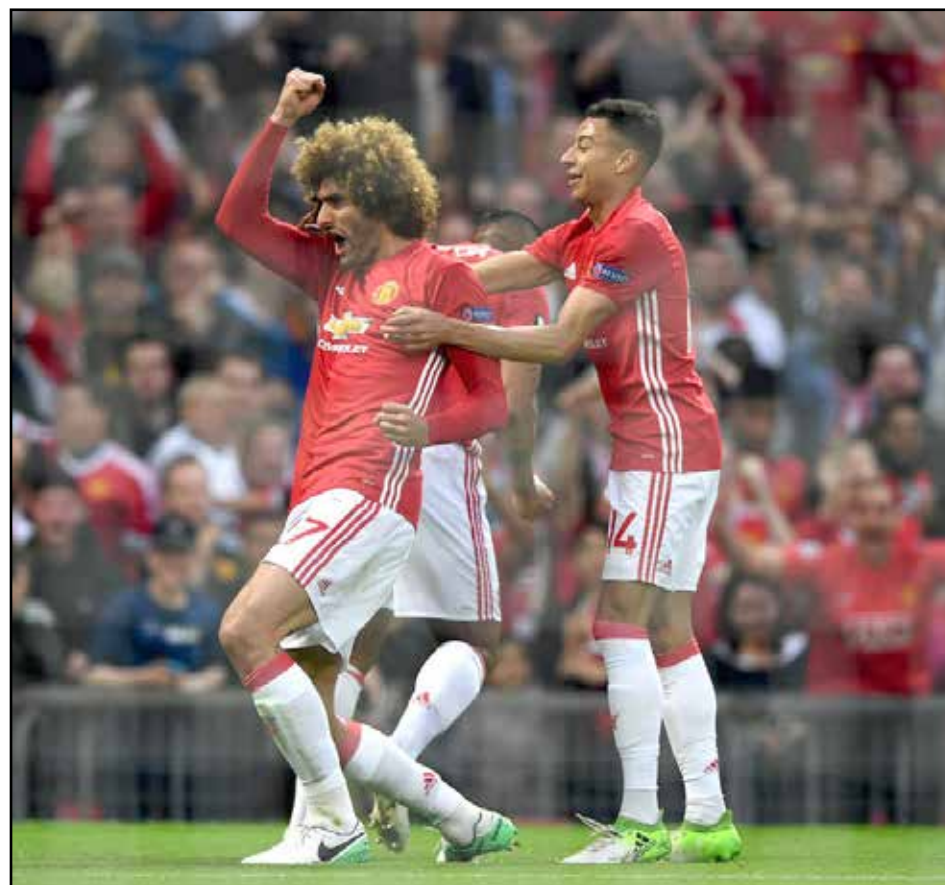
UNLIKELY HERO: Marouane Fellaini celebrates his goal for United

Now it is considered a must-win as the club looks to complete a clean sweep of the major competitions at home and abroad.