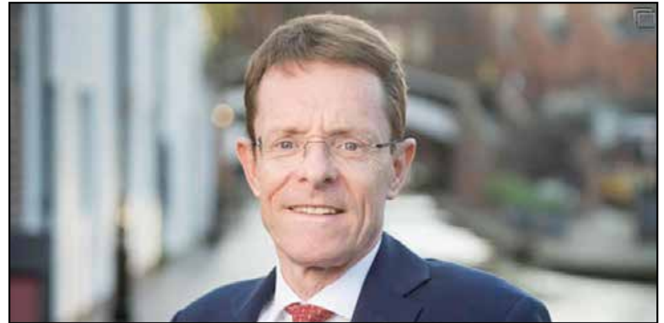
FROM CEO TO MAYOR: Former John Lewis boss Andy Street

These are "portentous" results, said The Times . Labour has been trounced and UKIP has been annihilated. The biggest surprise was how successful the Tories were in attracting former Labour