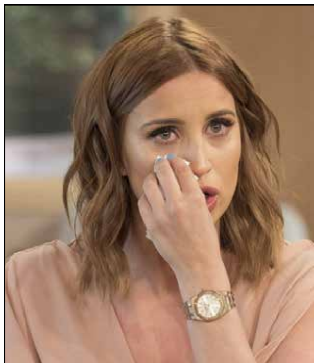
WATERWORKS: Ferne McCann on This Morning

The 26-year-old added: "This isn't how I imagined my first pregnancy to be, but this isn't about me, or the situation, my main priority is the baby".