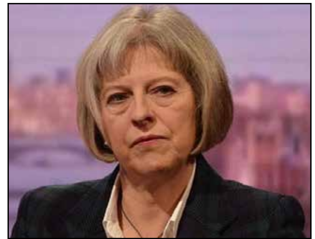
"A bloody difficult woman" - which British voters appreciate, according to opinion polls

But don't forget that some areas – notably, London – weren't voting in these elections, said The Guardian . The BBC's projection of what the national breakdown would have been had everyone been voting gives the two main parties of the Left – Labour and the Lib Dems – a combined support of 45%, two points ahead of the total figure for the Conservatives and