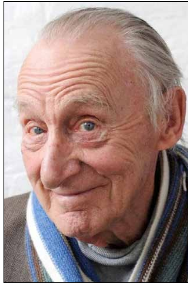
GEOFFREY BAYLDON: the actor enjoyed a multi-decade career on british television

"I've never been in love with sci-fi. It doesn't terribly interest me," Bayldon told SciFiBulletin . "I turned it down simply because I'd been playing old men and I