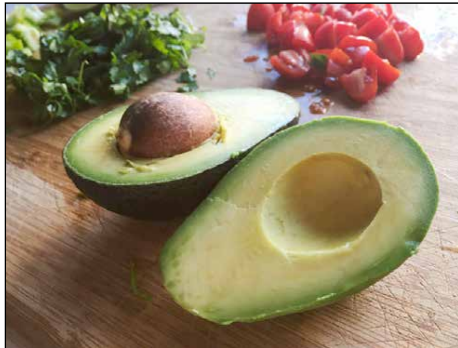
UNHEALTHY CHOICE? a spokesman blamed the spate of injuries from avocados on a 'minimal understanding of how to handle them' among British consumers

"I required immediate surgery to reattach them and have permanently damaged the feeling in my thumb and index