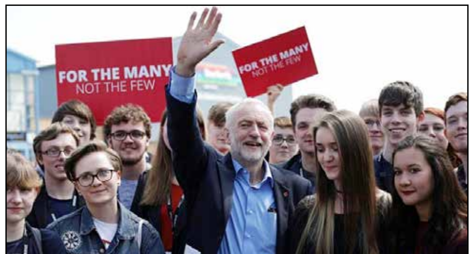
HARD LEFT TURN? Labour leader Jeremy Corbyn (center) believes his party's best electoral chance lies in a radical Social Democratic program

be returned to public ownership after the coalition government's "historic mistake" to sell it off in 2013, and the manifesto commits a Labour government to "take energy back into public ownership" by establishing a rival to the