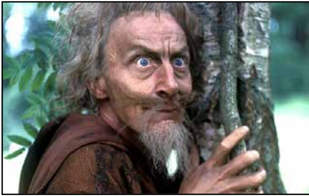
ICONIC ROLE: Catweazle ran for just two seasons on London Weekend Television

But it was as Catweazle that Bayldon found fame, entertaining a generation of children as a kooky 11th century wizard who is transported to modern day and befriends a young boy.