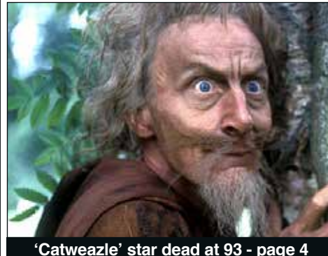
'Catweazle' star dead at 93 - page 4