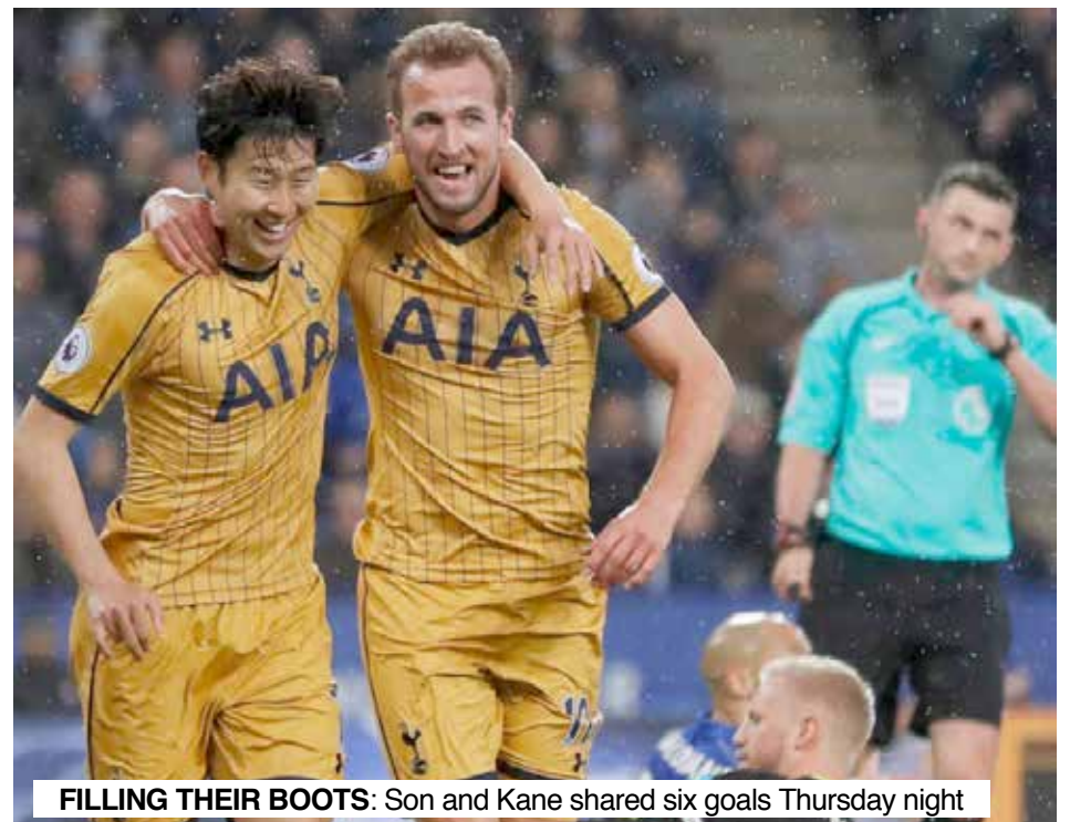
FILLING THEIR BOOTS: Son and Kane shared six goals Thursday night

They must surely consider themselves vindicated, despite such a heavy defeat. The Foxes were one point