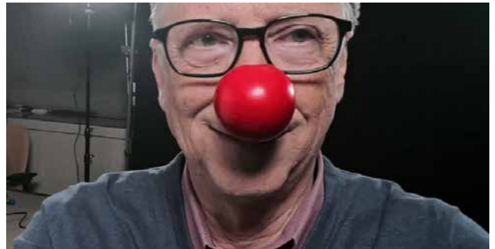
DOING HIS PART: Bill Gates will provide matching funds up to $1m for money raised via Facebook on Red Nose Day