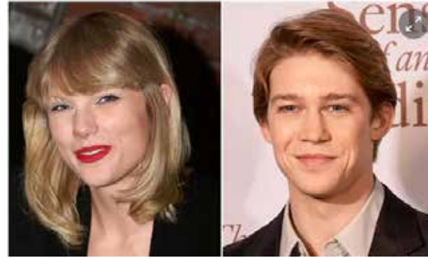
SWEET MUSIC? Taylor Swift is dating Joe Alwyn

“This isn’t a new couple alert or a secret relationship – the only people this has been a secret to is the media because all of us, Taylor and Joe’s closest friends and their families, were