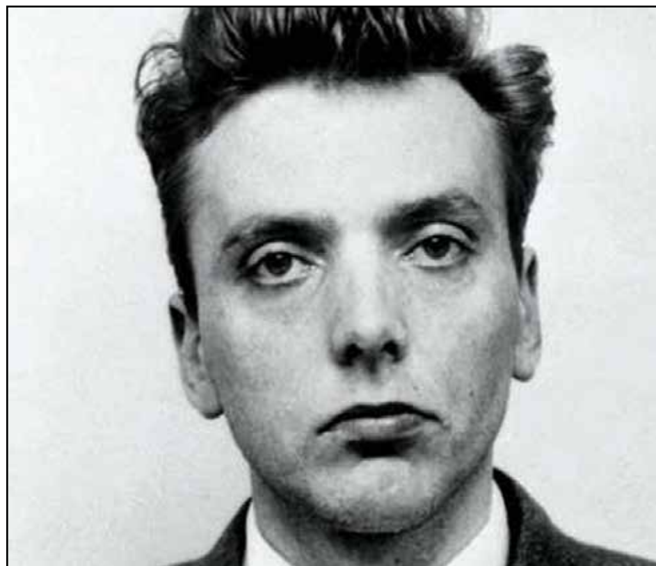
BEYOND BELIEF: Ian Brady was jailed in 1966 for crimes that shocked the nation

For almost two decades after they were jailed for life (Hindley was sent to Holloway, Brady at first to Durham), Brady was held for the most part