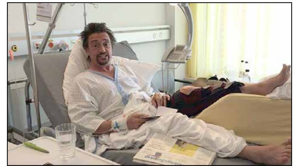
HAMMOND: the presenter joked he was getting 'a Swiss Army knee'

The second series of the Amazon Prime show was due to be broadcast in October this year. Fans speculated online that the crash might mean this could be delayed.