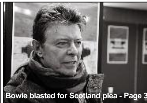
Bowie blasted for Scotland plea - Page 3