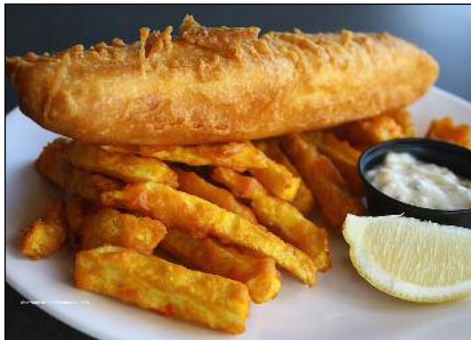
DELICACY? the bad weather has sparked a big rise in the price of cod and chips

"Fish are a bit like the stock market. It is the only product these days that is still auctioned. They sell for the price that buyers want to pay."