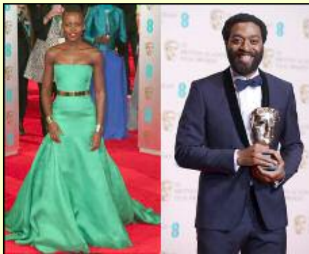
IRRESISTIBLE: Twelve Years A Slave's Lupita Nyong'o and Best Actor winner Chiwetel Ejiofor

The film's leading actor Chiwetel Ejiofor proved the bookies right, winning