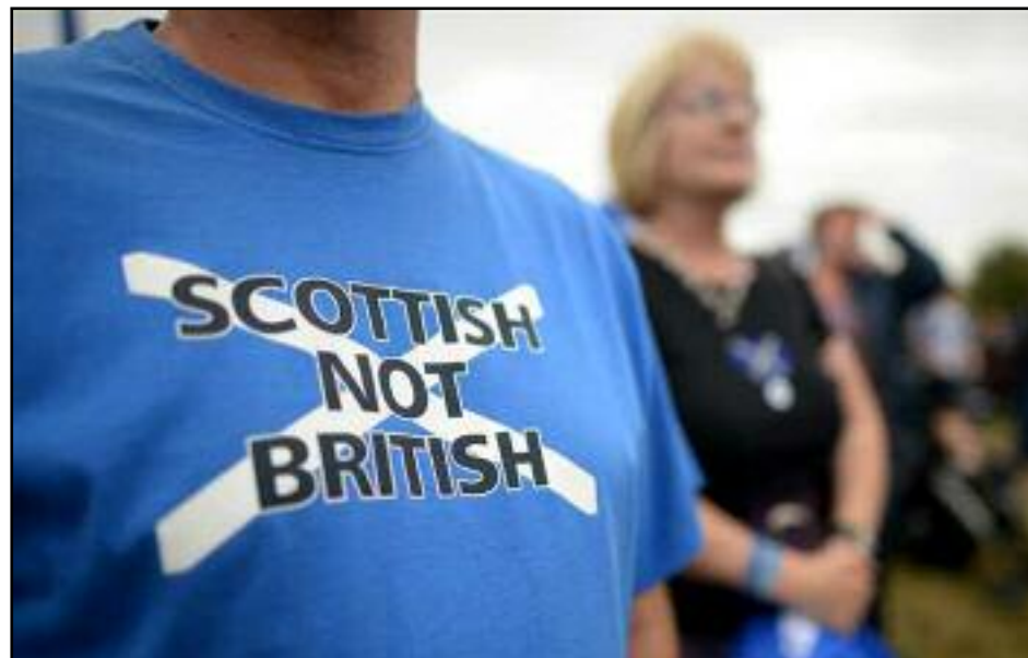
GETTING SHIRTY: the gap between the yes and no votes is closing...

A Survation/ Scottish Daily Mail poll carried out on February 17 and 18 of 1,005 people found 37.7 percent support independence, which it said could be compared to 36.9 percent recorded