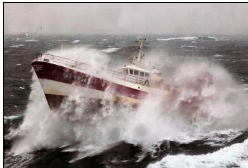
HEAVY WEATHER: atrocious conditions have forced many fisherman to stay home