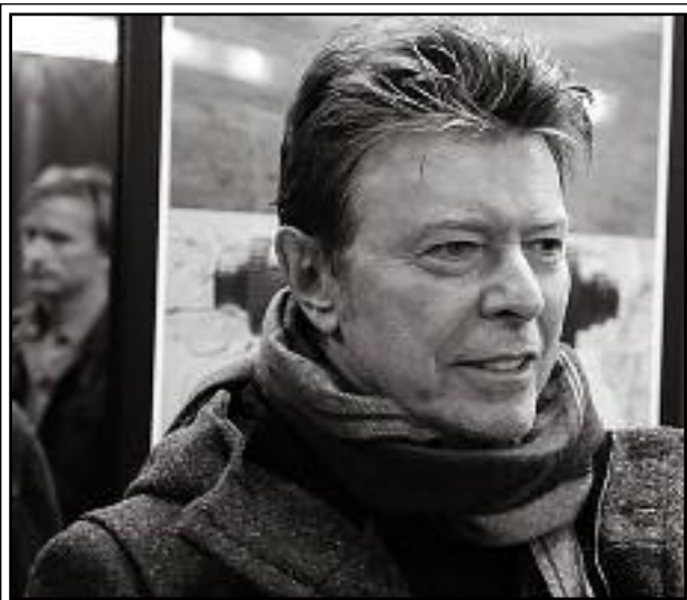
BOWIE: Best British Male Solo Artist at the Brits