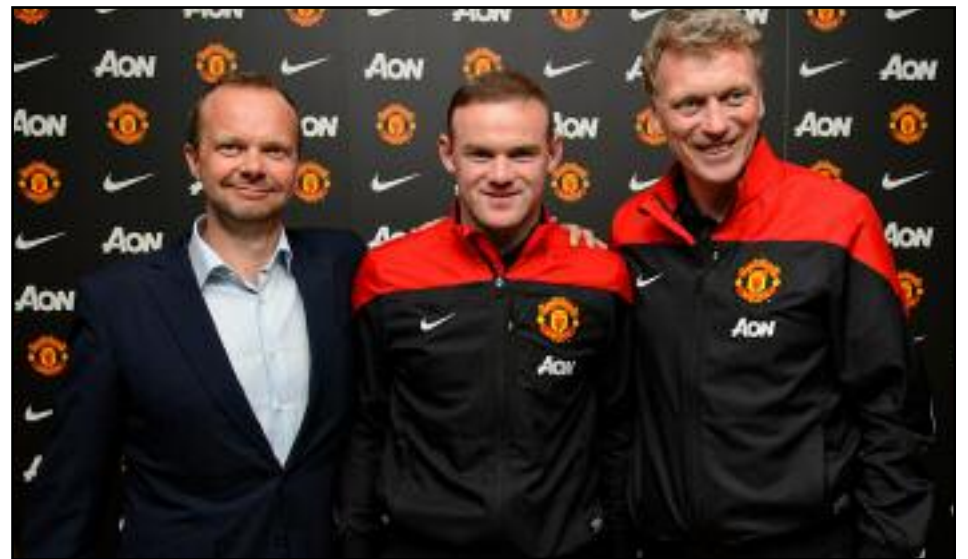
GOOD BUSINESS...AT LEAST FOR HIM: David Moyes insisted that Wayne Rooney would not be sold from United on his watch

always felt Wayne wanted to stay. He's a great player and hopefully we can keep him at a really high level which he has showed this season.