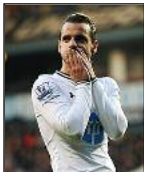
SOLDADO: shocking miss

It could have been worse for Spurs, Roman Zozulya heading against a post.