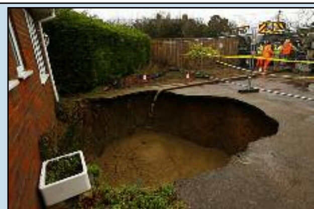
LOOK OUT BELOW: a sinkhole in Croxley Heath, Herts

In Ripon, North Yorkshire, another sinkhole opened up under a detached house,