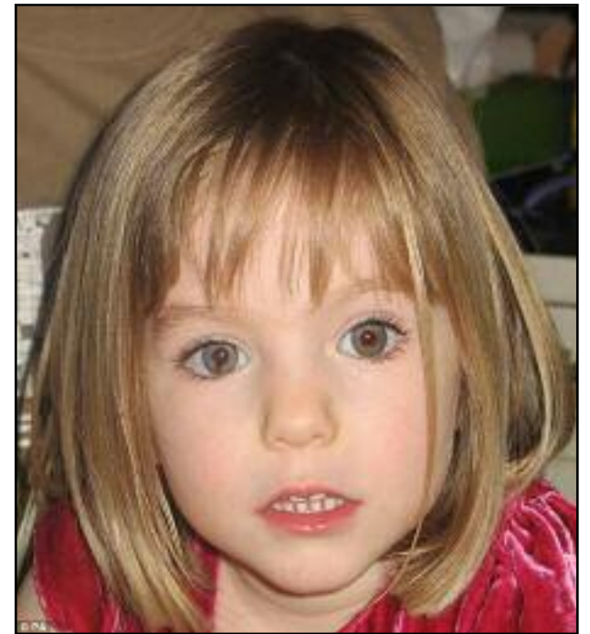
MADELEINE MCCANN: abducted in 2007

It is now known that between January and