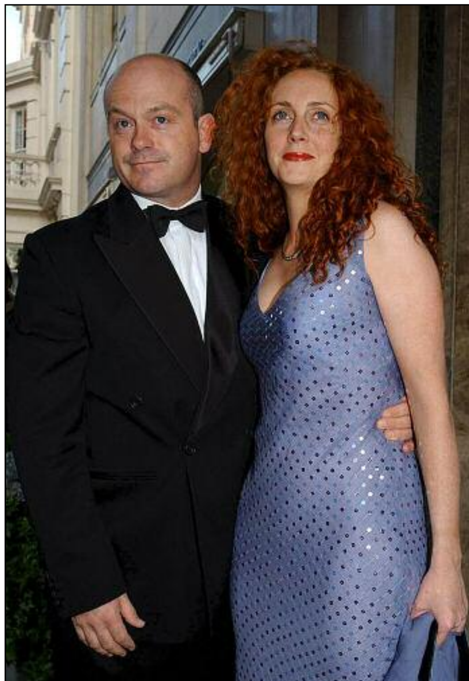
DOUBLE TROUBLE: "Ross was a good man but the two of us weren't meant to be," said Brooks of her relationship with EastEnders actor Ross Kemp