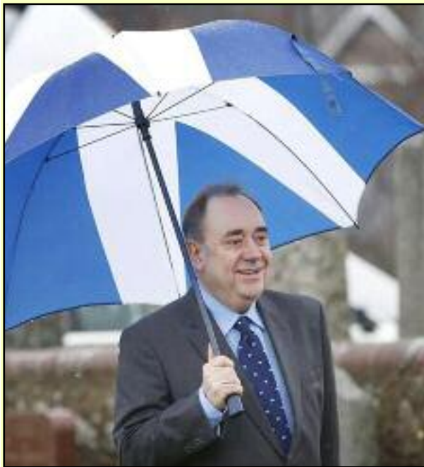
PUSHING HARD: First Minister Alex Salmond