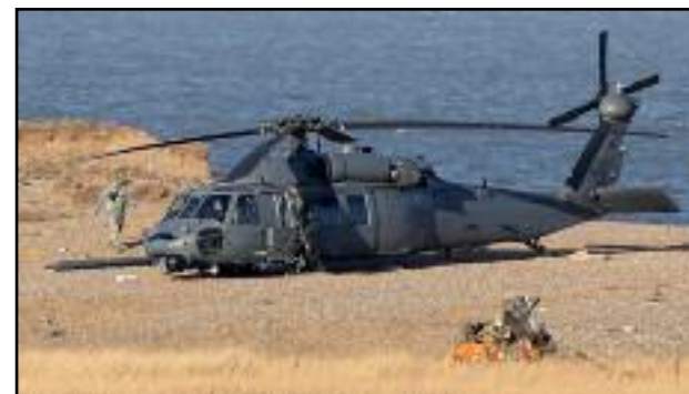
NOT FAR AWAY: a US Air Force helicopter went down in January at Cley next the Sea, killing four servicemen, 45 miles from Thursday's crash site