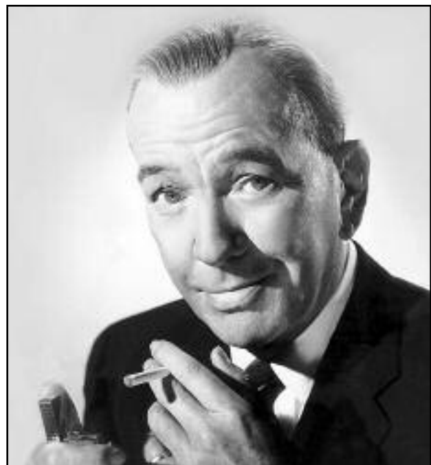
THE MASTER: Noel Coward

And opening this week at the Pasadena Playhouse is A Song At Twilight , Coward's late-life meditation on success and failure, joy and regret. The show stars Bruce Davison (a Best Supporting Actor Oscar nominee a few years back for his devastating performance in Longtime Companion),