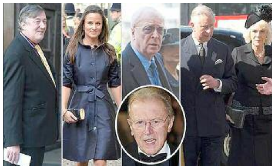
THE GREAT AND THE GOOD? Steven Fry, Pippa Middleton, Michael Caine and Prince Charles and Duchess of Cornwall were among those honoring Sir David Frost (inset)

interviews with Nixon in 1977, the slippery former president known as "Tricky Dicky" dramatically admitted that he had "let down the country".