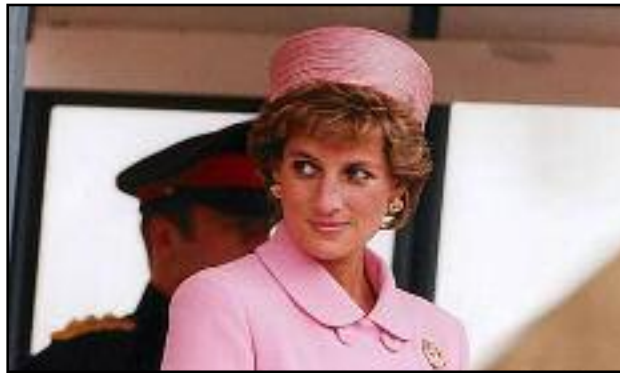
The court heard Diana wanted to "take on" Charles