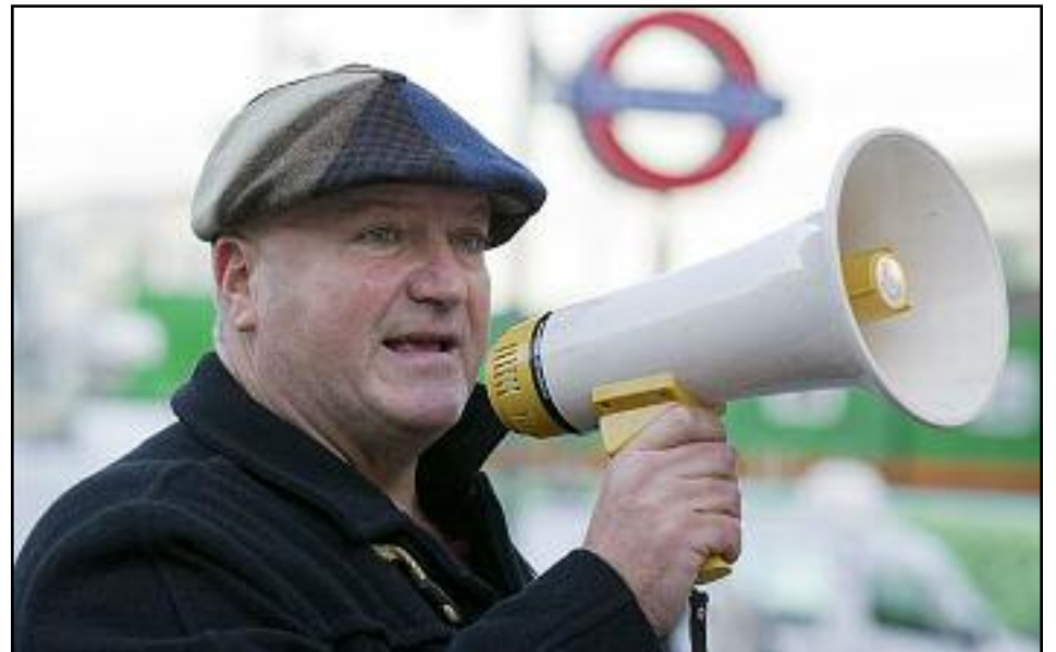
FIREBRAND: Mr Crow, one of the most high-profile, left-wing union leaders of his generation, was constantly involved in industrial disputes

"The next thing I heard at 10am this morning was