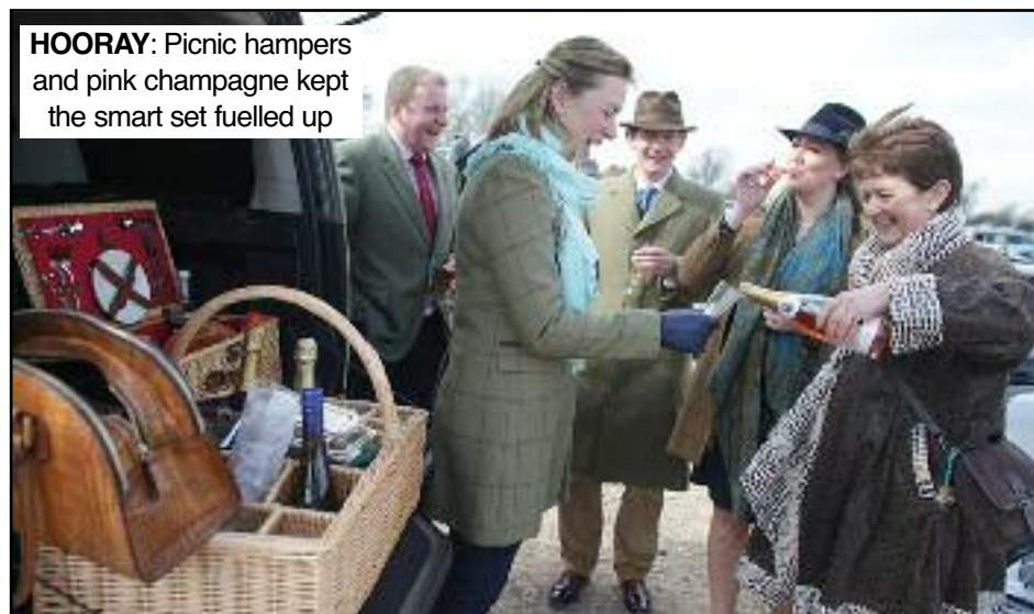
HOORAY: Picnic hampers and pink champagne kept the smart set fuelled up