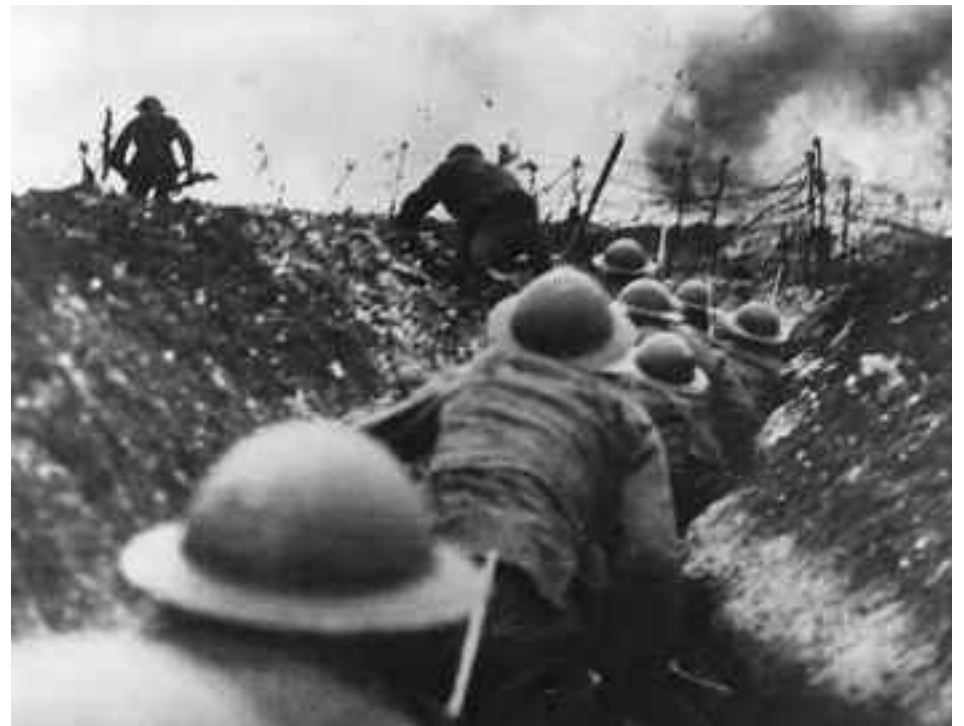
REMEMBRANCE: a raft of events is taking place in Britain this year to mark the 100th anniversary of the outbreak of World War One

Announcing the programme, Maria Miller said: "Culture is part of the fabric of British society. Ensuring a cultural element flows throughout the centenary will be vital part of our commemorations, particularly as a way of engaging young people and helping them make that connection with the