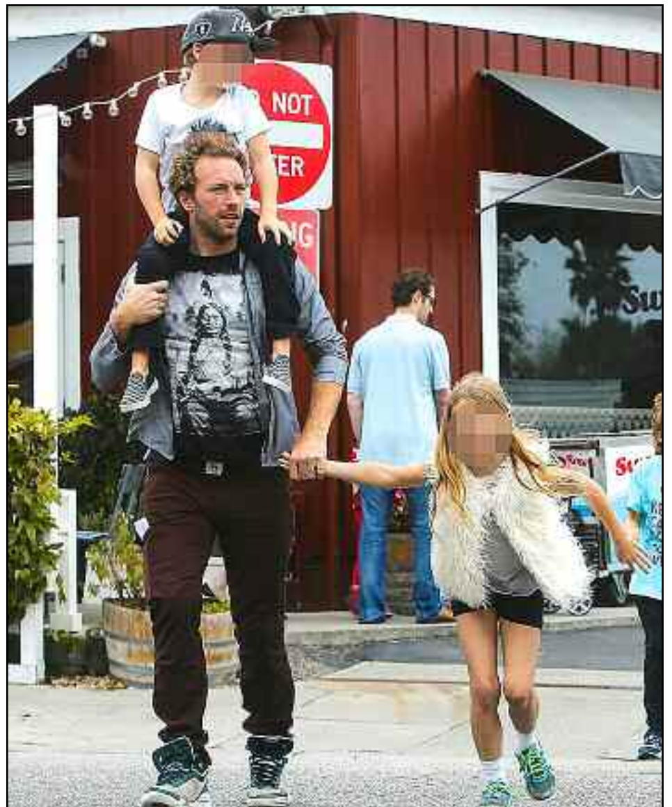
LAI D BACK: Martin's approach to parenting is seen by many observers as being far more fun loving and traditional than Paltrow's more regimented style