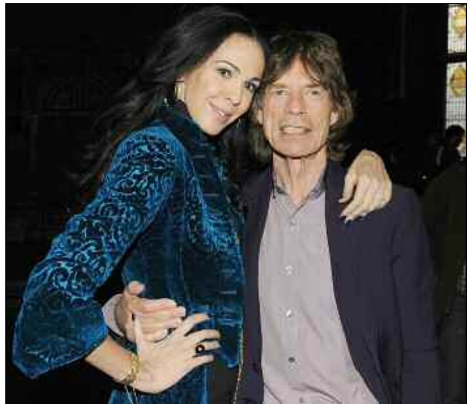
To the devil his due: Scott and Jagger had been together for more than a decade