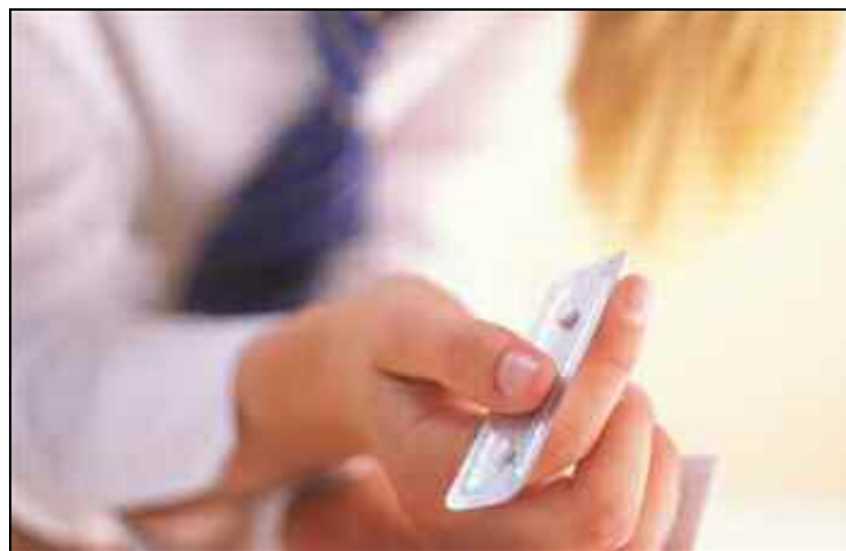
"Really worrying and deeply unwise": - the new measures have berthed a firestorm of controversy in the UK

The move was first mooted by Nice four years ago, but has been repeatedly delayed amid fears such a move could encourage promiscuity and increase the number