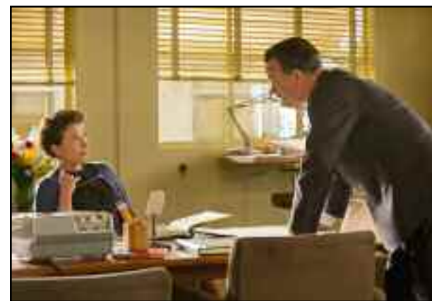
BEST OF ENEMIES: PL Travers (Emma Thompson) and Walt Disney (Tom Hanks)

■ The story of the rivalry between Walt Disney and Mary Poppins author PL Travers has its moments, but distracting head-hopping may make you dizzy