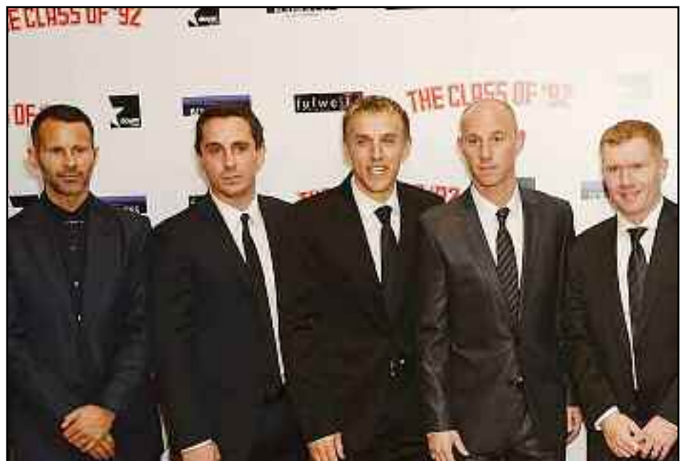
STILL IN THE GAME: Messrs Giggs, Neville, Butt and Scholes

His younger brother Phil, now United's first-team coach, added: "It is important to safeguard the hard work that is done in the lower leagues and it is going to be exciting to be able to feed our experience into the young players."