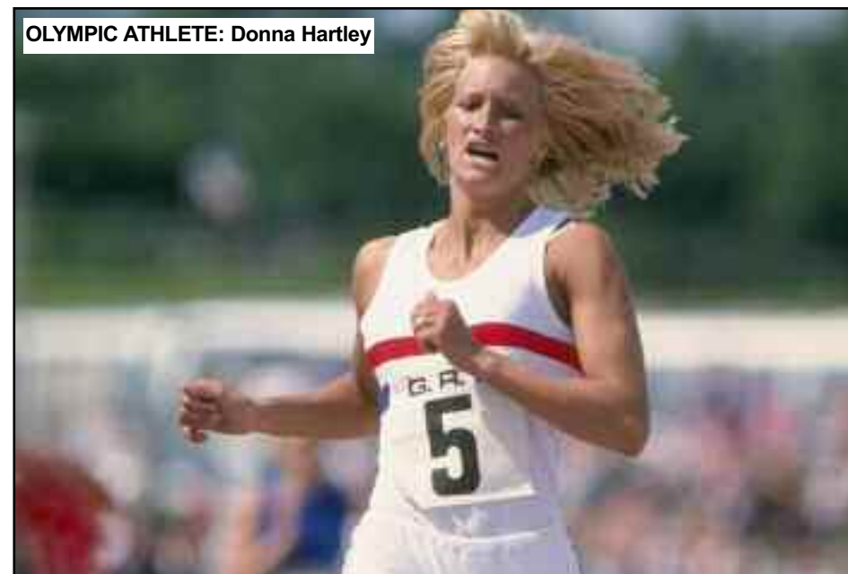
OLYMPIC ATHLETE: Donna Hartley

She was awarded an MBE in 1979, then grabbed a bronze in the 1980 Moscow Olympics. She became a champion bodybuilder after retiring from athletics.