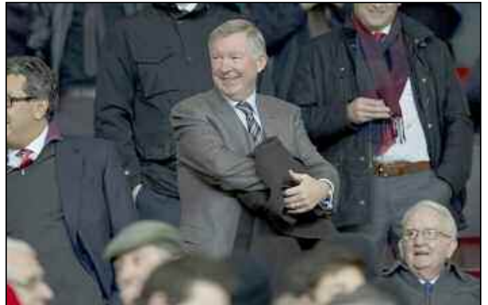
UNDER FIRE: Sir Alex Ferguson was all smiles before kick-off, but he was soon feeling the full force of United fans' anger

spirit of the players. "When I was playing, we could be two or three down but we never felt we were beaten," Scholes said. "Tonight I never