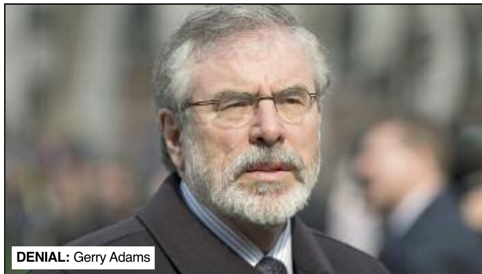
DENIAL: Gerry Adams

Despite extensive searches, the remains of seven of them have not been found. Adams, now a Sinn Fein member of the southern Irish parliament, is an Irish MP for Louth. He has always denied being a member of the IRA.