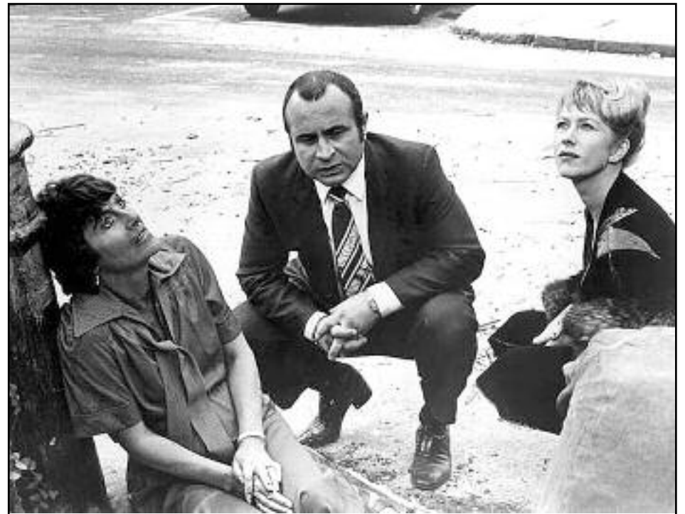
COCKNEY CAGNEY: Bob Hoskins came to Hollywood's attention in 1980 with his riveting performance as gangster Harold Shand in The Long Good Friday

was Snow White and the Huntsman , which was released in 2012 and also starred Twilight actress Kristen Stewart.