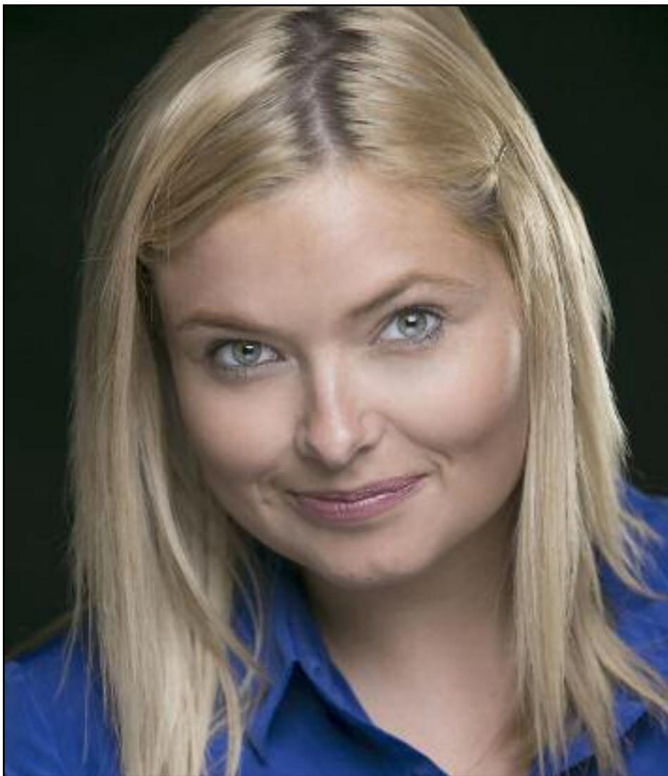
Make sure you're prepared both financially and emotionally for the move to LA, advises actress Lizzie Worsdell

Twitter: @lizzieworsdell http://www.spotlight.com/9210-5641-6254