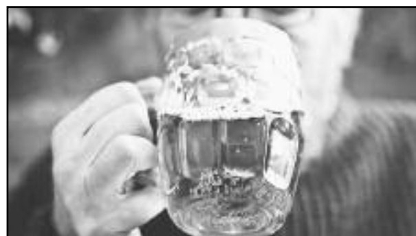
THAT'S COOL: the dimpled glass is no longer the exclusive preserve of the flat-capped bitter drinker