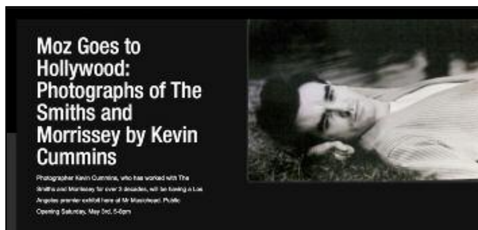
THIS CHARMING MAN: Kevin Cummins collection of photos can be seen until May 14th at Mr Musichead, 7511 Sunset Boulevard.

This week's exchange rate: £1 = $1.69 updated 6pm 05/01/14