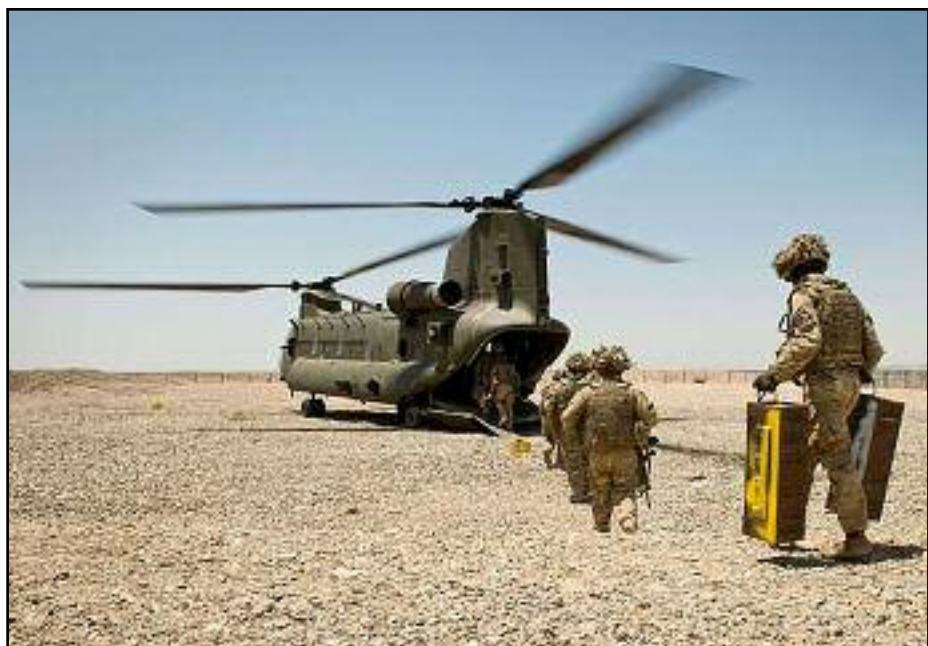
EXIT, FLYING: British soldiers head towards their Chinook during the closure of Observation Post Sterga 2 in Afghanistan's Helmand Province

"Alongside our coalition partners we also oversaw and provided security for the closure of Laskhar Gah Durai and FOB Price in March earlier this year. As the last Scottish Infantry Battalion in Afghanistan it has been a challenging and rewarding job being part of the drawdown of British Bases in Helmand and the handover of lead security responsibilities to the Afghan Security Forces."