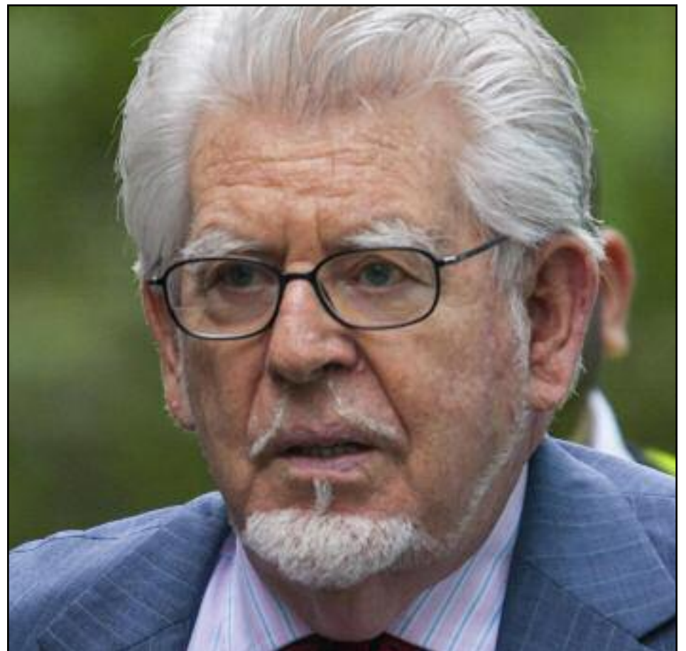
GRIM-FACED: Rolf Harris arriving at Southwark Crown Court on Thursday

Asked if she was sure that it was Mr Harris who groped her, the woman said in a trembling voice: "It was Rolf Harris without a doubt and I cannot bear seeing any image of