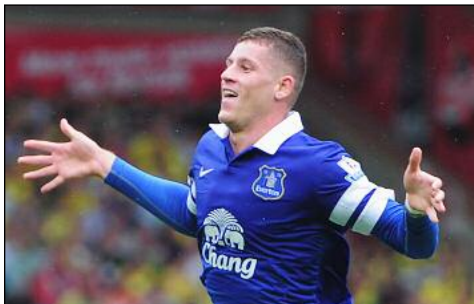
ROSS BARKLEY: the 20-year-old has been a revelation for Everton this season

Standby: John Ruddy (Norwich City), Jon Flanagan (Liverpool), John Stones (Everton), Michael Carrick (Manchester United), Tom Cleverley (Manchester United), Andy Carroll (West Ham United), Jermain Defoe (Toronto FC).