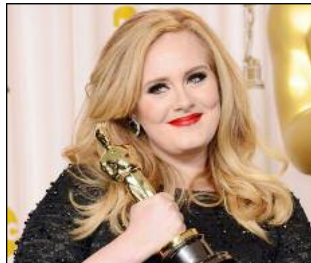
GOLDEN GIRL: singer Adele (above) has made a nifty £45m before her 30th birthday, while veteran rocker Sir Paul McCartney (below) has amassed £710m fortune over his long career

The list is based on land, property, and other assets such as art, racehorses and stocks and shares.