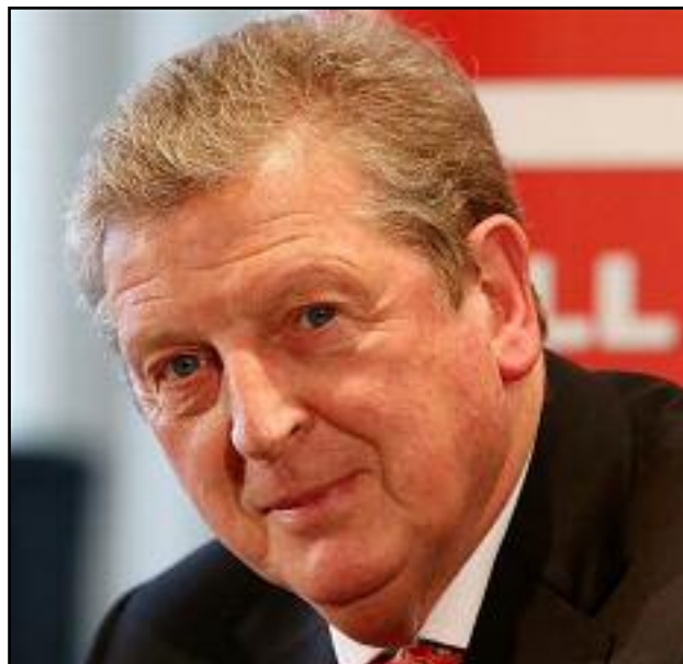
HODGSON: "I hope the squad will give a good account of itself and they won't let the country down."

Steven Gerrard," said Hodgson. "He still plays a very important role in his club side and his leadership qualities and ability as a player mean he fully justifies his