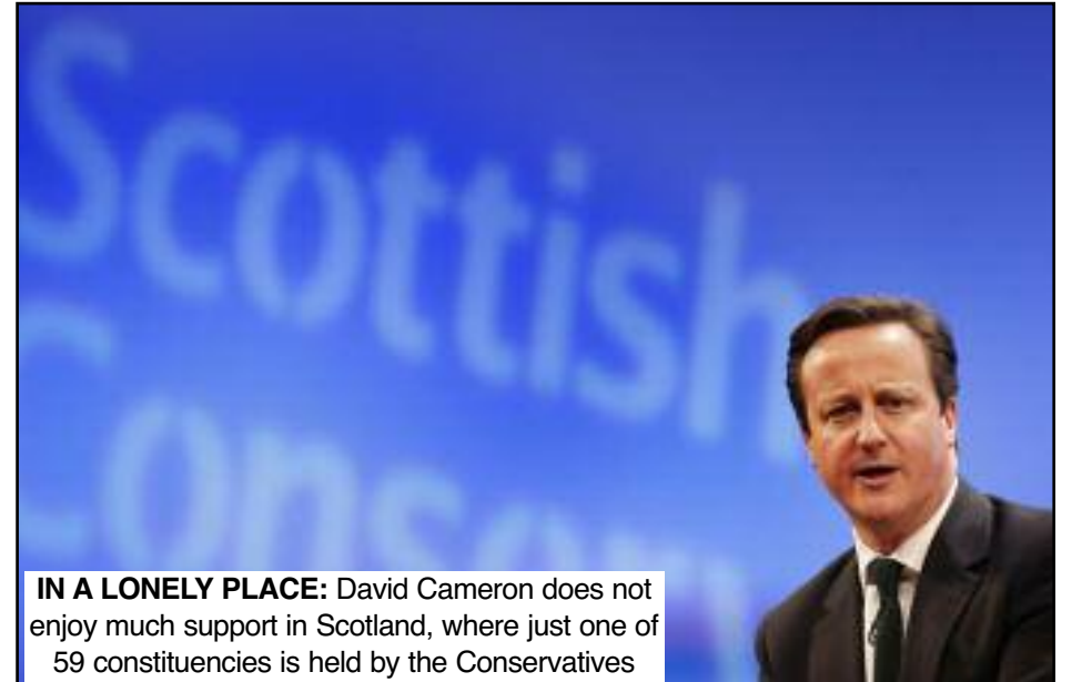
IN A LONELY PLACE: David Cameron does not enjoy much support in Scotland, where just one of 59 constituencies is held by the Conservatives

A survey this week found the gap between the two sides had narrowed to a new low of 9 percentage points from 22 points last September among Scots certain to vote, and 53 percent of voters described