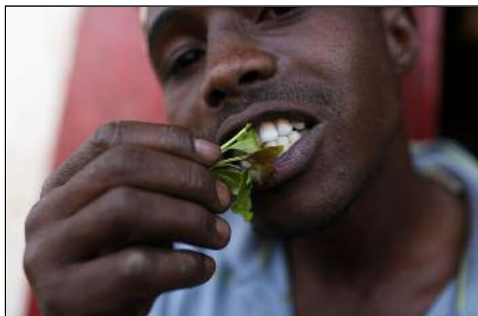
PLENTY TO CHEW ON: Last year Britain classified khat as a drug, effectively closing Kenya's last khat market in Europe

string of demands to keep the khat business going. Farmers last year called for British army training bases in Kenya be shut down, a demand that has been ignored by