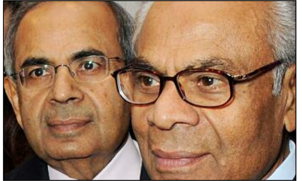
CHANGING OF THE GUARD: Sri and Gopi Hinduja (above) have replaced Uzbek-born Alisher Usmanov (below) at the top of the Sunday Times Rich List

The combined wealth of the Britain's super rich is now ahead of the pre-recession levels of 2008, when the total wealth of the UK's 75 billionaires was £201 billion.