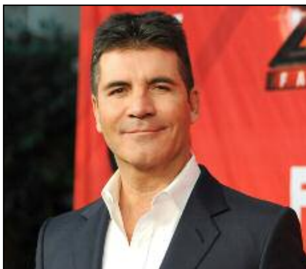
Coining it: Simon Cowell is raking it in thanks to his TV shows Britain's Got Talent and The X Factor

Cowell's £300m fortune place the father-of-one as the eighth richest music millionaire. He owns a £13m home in Beverly Hills, a £10m villa in Barbados, a £7.5m pile in