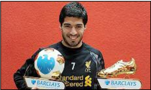
LUIS SUAREZ: PFA and FWA Player of the Year

for their first league title since 1990, before eventually finishing second, two points behind champions Manchester City.