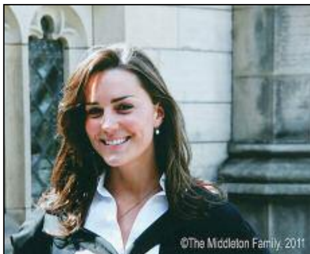
UNDERGRADUATE: Kate Middleton first came to the tabloid's attention while studying at St. Andrews University