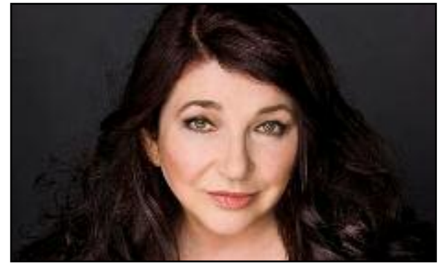
Kate Bush: 22 sold out shows in London

Bush's 'Aerial', 'Director's Cut' and 'The Red Shoes' albums also charted between 40 and 50 on Sunday. Elvis Presley holds the overall record for most