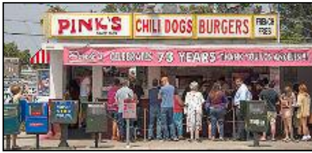
LA INSTITUTION: make mine a chili dog with everything...

seven billion hot dogs will have been eaten since July 4th! Make that seven billion and one, thanks to the Greek Theatre who have Pink's Hotdog available on site. Between you and me they aren't that great, so don't feel bad if you can't face the extremely long wait. Although, Orson Welles may disagree as he apparently consumed 18 Pink's hotdogs in one sitting. That's nothing to boast about, seeing as he died of a heart attack. LA is a funny place as any association is seen as better than none - Pink's other claim to fame is "Bruce Willis proposed to Demi here", well that worked out well too