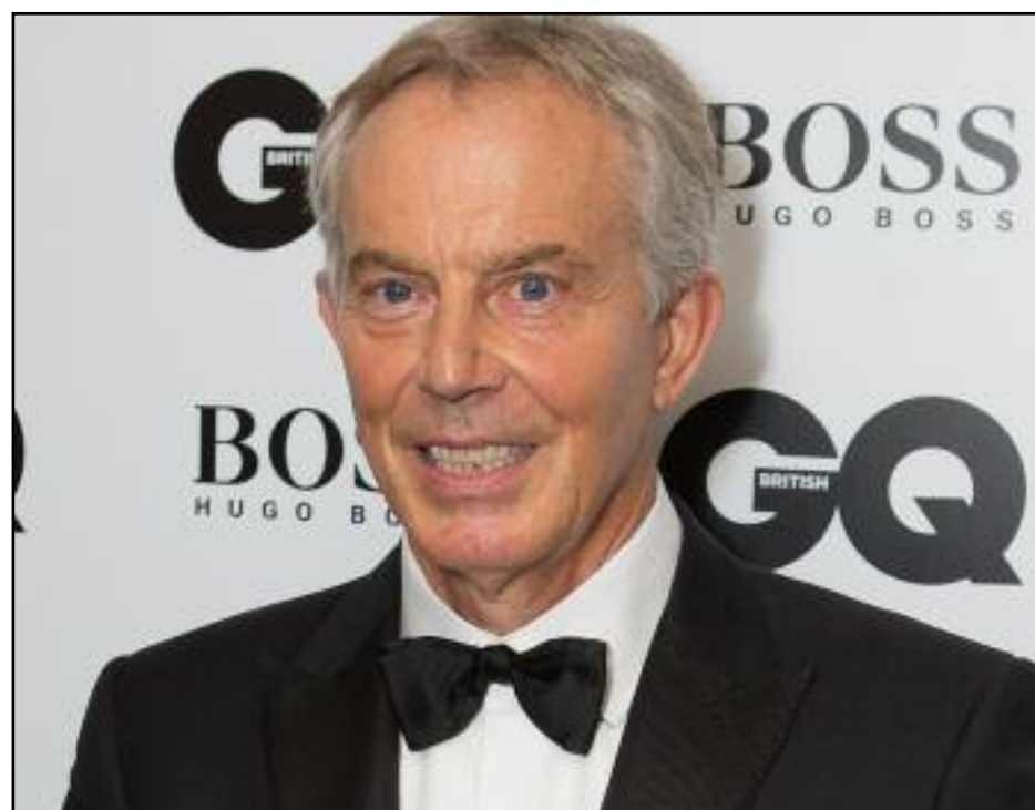
"Apparently, Tony Blair has won GQ's philanthropist of the year award. Finally these awards have grasped irony!" - Tweet from Gary Lineker