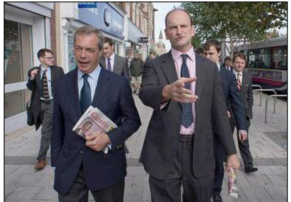
HARD-CHARGING: Ukip leader Farage (above left, with Douglas Carswell) said: "I'm going to keep playing double or quits until I lose."

Mr Farage's party has made inroads in Labour's northern strongholds in recent elections and he said: "We're going all out for the working class vote now.