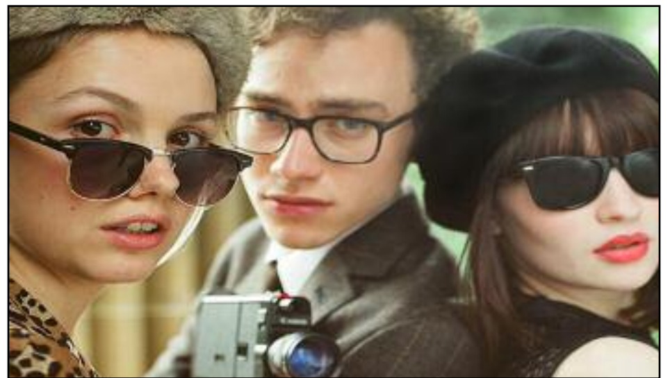
TALENT UP NORTH: Hannah Murray, Olly Alexander and Emily Browning all shine in this beguiling new Scottish musical

I first took note of Olly Alexander some years back in "Bright Star". He has an understated quality