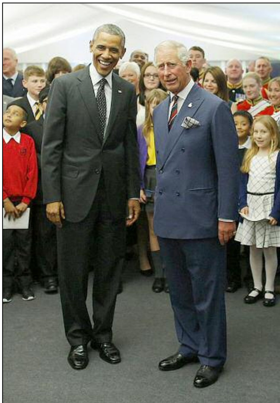
PRESIDENT AND THE PRINCE: Charles and Obama say Caerphilly for the camera