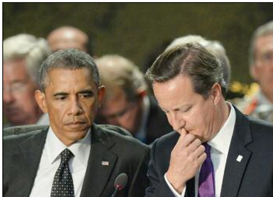
IN THE HUDDLE: the President and the Prime Minister met with other Nato leaders at Cardiff Castle on Thursday night to discuss the growing threat posed by IS forces

Anders Fogh Rasmussen, Nato secretary-general, said members had an 'obligation' to stop IS, adding: 'I'm sure that if the Iraqi government were to forward a request for Nato assistance, that would be considered