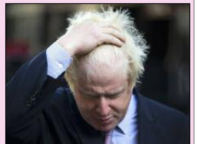
PULLING HIS HAIR OUT? Johnson said the Airports Commission has 'set the debate back by half a century'

The rejection of the estuary scheme will leave just three options on the table – two at Heathrow and one at Gatwick. By asking the Commission to report after 2015, the Government hopes to reduce the political controversy attached to any redevelopment of Heathrow – still the most likely option – which worries both Labour and the Conservatives.