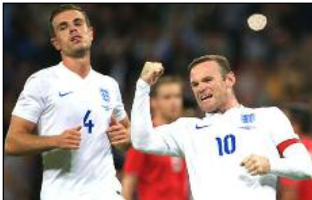
ONE BRIGHT SPOT: Rooney celebrates his goal

as preparation for Monday's testing Euro 2016 qualifier against Switzerland in Basel and it was an uninspiring affair played out in front of vast swathes of empty seats, with Wembley's top tier deserted and the one below hardly populated.