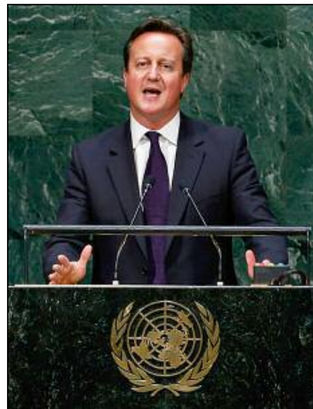
UN ADDRESS: Mr Cameron said the international community must not be "so frozen with fear" by old mistakes that it withdrew into "isolation"

"It's a desperate situation," he admitted. "But let's be clear about two things. One is that we are dealing with psychopathic, murderous, brutal people who will stop at nothing to carry out dreadful acts on these hostages."