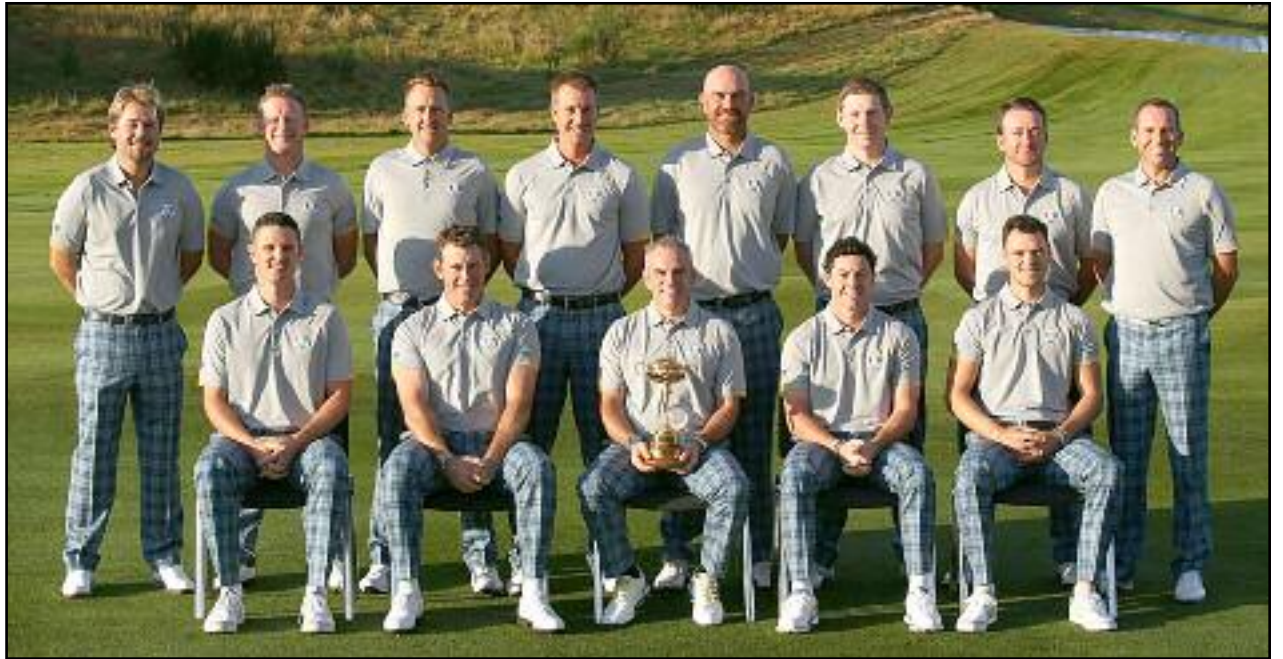
HIGH HOPES: the 2014 Europe Ryder Cup team: back row (from left) Dubuisson, Donaldson, Poulter, Stenson, Bjorn, Gallacher, McDowell, Garcia (front row, from left) Rose, Westwood, McGinley (capt), McIlroy, Kaymer

"They can try and target us all they want, but there's guys alongside us that can do just as good a job," said McIlroy, 25, who was delighted to hear the inspirational words from former Manchester