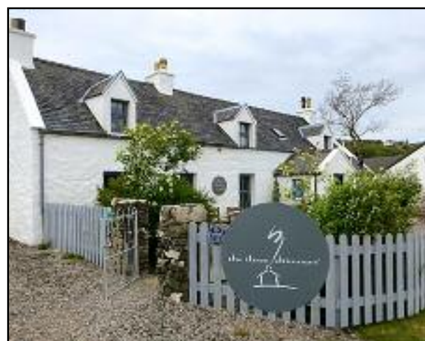
FAMED FOR ITS LOCAL PRODUCE: The Michelin-starred Three Chimneys in Skye

Hotel, near Fort William, is a favourite haunt of royalty, celebrities and leading politicians.