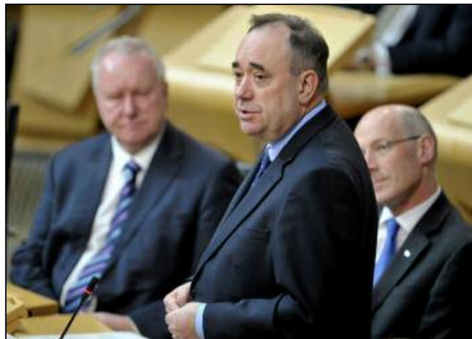
PROMISES: Salmond said the UK parties' vow for more powers must be delivered.

"While he might not have got the result he was looking for, we can all agree that the United Kingdom is now the settled will of the Scottish people.