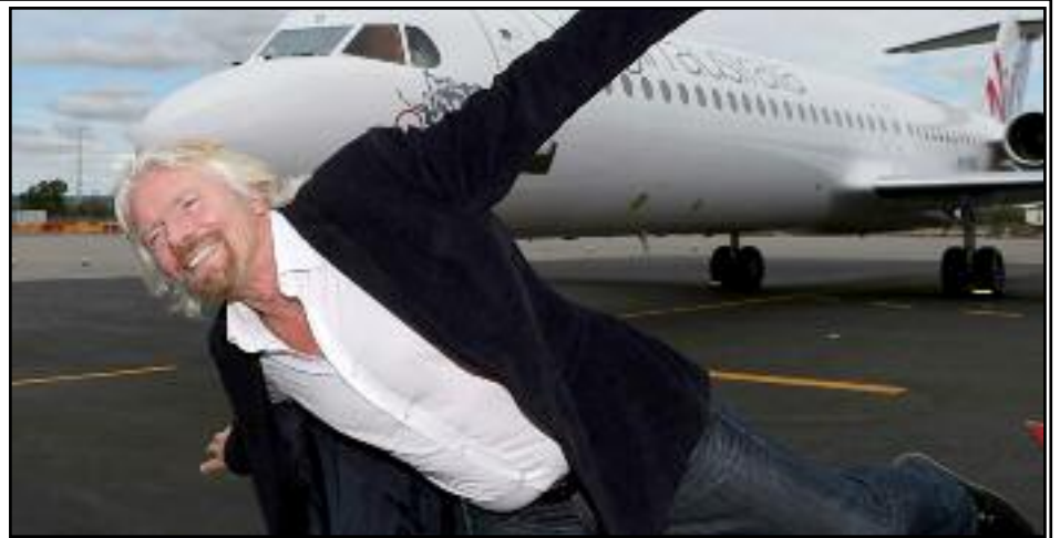
Branson described vacation policies in the US as 'particularly draconian'

what people get done, not on how many hours or days worked. Just as we don't have a nine-to-five policy, we don't need a vacation policy," he wrote.