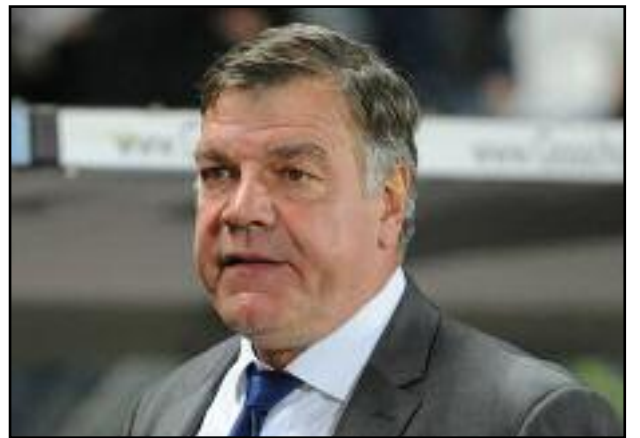
"They will be hurting the field and punish us and they know the only way they can put that right is to get out on to the field and punish us for it. "We will have to be careful about that."

Asked if it was a good time to face Van Gaal's side, the Hammers boss added: "No. I'm thinking a backlash.