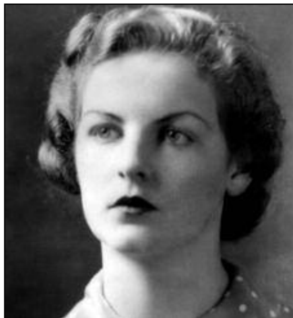
the then-Deborah Mitford was unimpressed by Adolf Hitler when they met in 1937

elder sister Pamela, was more focused on home life.