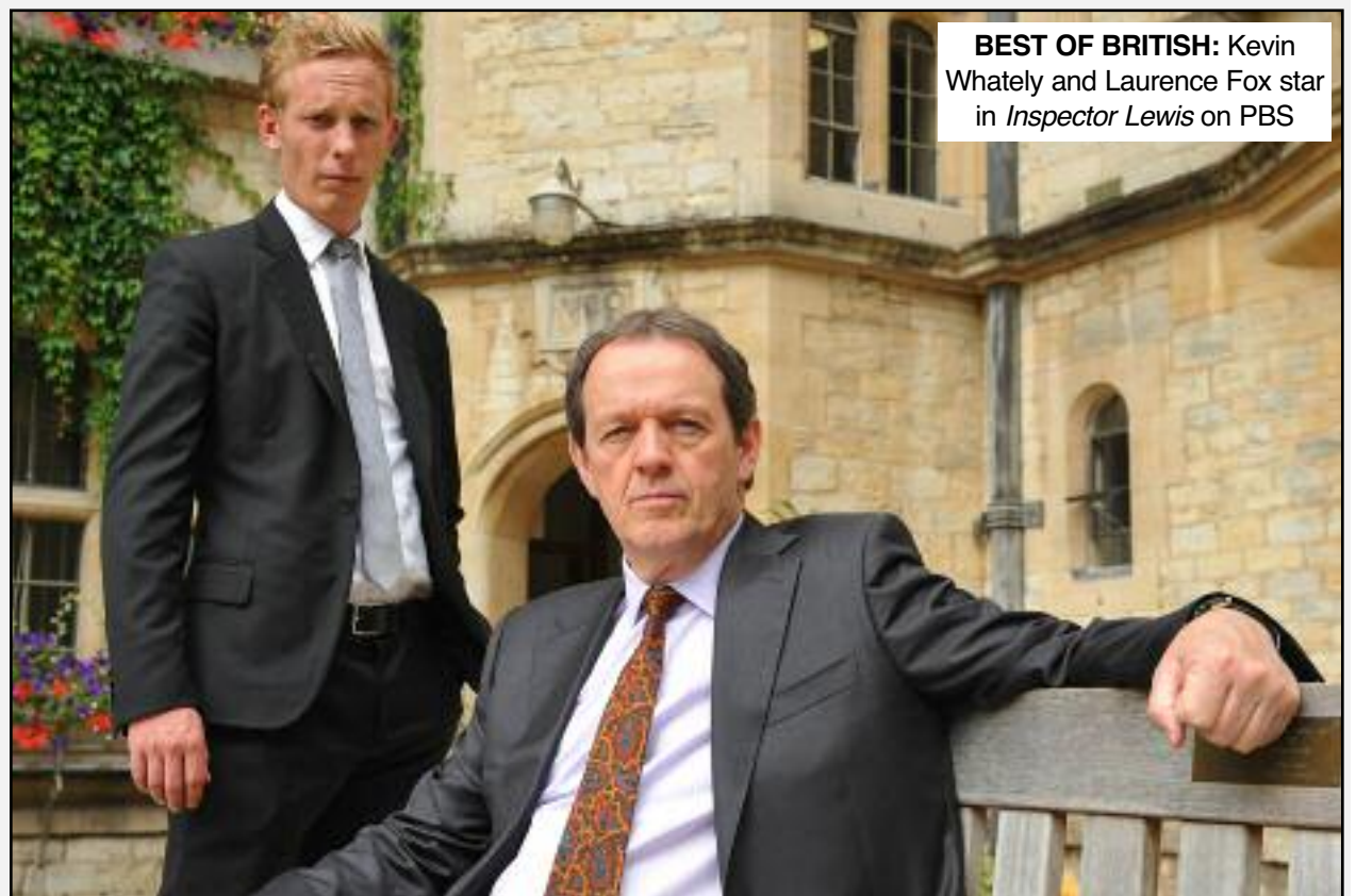
BEST OF BRITISH: Kevin Whately and Laurence Fox star in Inspector Lewis on PBS