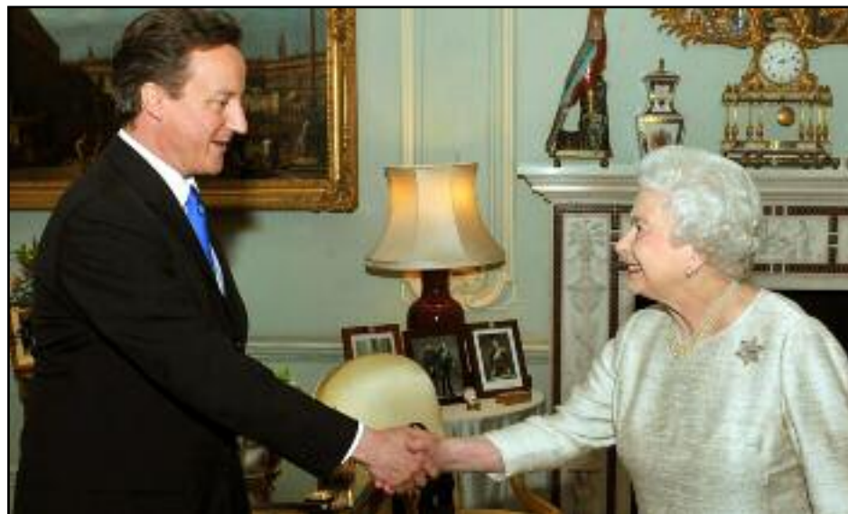
Betraying confidences: David Cameron was overheard telling former New York City Mayor Michael Bloomberg of his conversation with the Queen: "I've never heard someone tear-up like that before. It was great."

He was also overheard saying how emotional she was when he told her of the result, explaining: "I've never