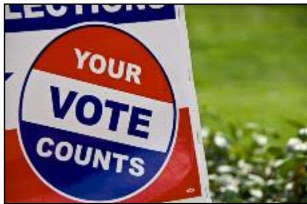
THE REFERENDUM: Never a truer word....

"Neighbors" is a bit of a theme this week as