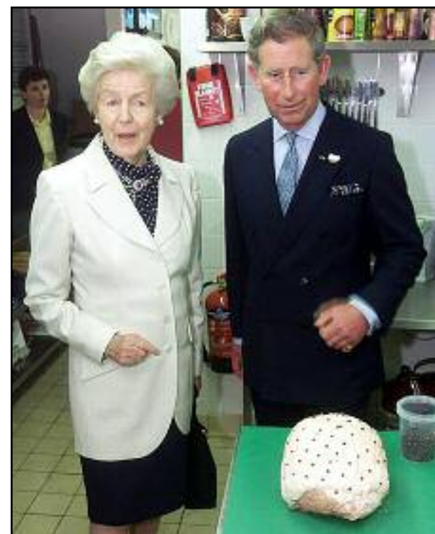
"She was a unique personality with a wonderfully original approach to life," said Prince Charles of his good friend, the Dowager Duchess of Devonshire

three children, were deeply involved in the management and planning of the 17th century stately home and its grounds.