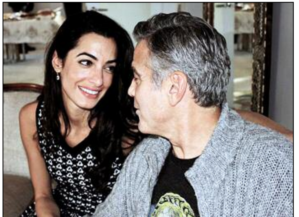
SPECIAL RELATIONSHIP: At 36, Amal Alamuddin is 16 years George Clooney's junior

The bride was born in Lebanon in 1978 before her family settled in London a few years later at the height of the Lebanese Civil War. Educated at Dr. Challoner's High School in Buckinghamshire and then at St. Hugh's College at Oxford, Amal also studied at NYU's School of Law and clerked in the United States Court of Appeals for justice Sonia Sotomayor – who has since become a member of the US Supreme Court. Before moving to chambers in London and rapidly becoming one of Britain's top civil rights lawyers, Amal has also worked in the Office of the Prosecutor at the