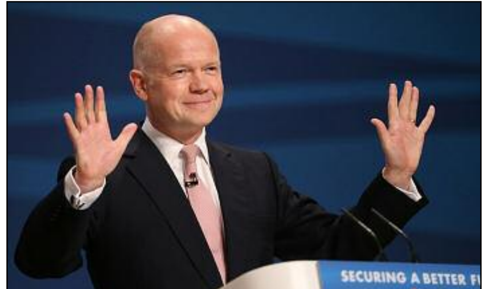
"All I can say is this: that boy became an amazing parliamentarian, a brilliant foreign secretary, our greatest living Yorkshireman and someone to whom I owe an enormous debt of gratitude - David Cameron on William Hague (above)

But Hague had the last laugh, studying at Oxford and eventually being elected to the House of Commons