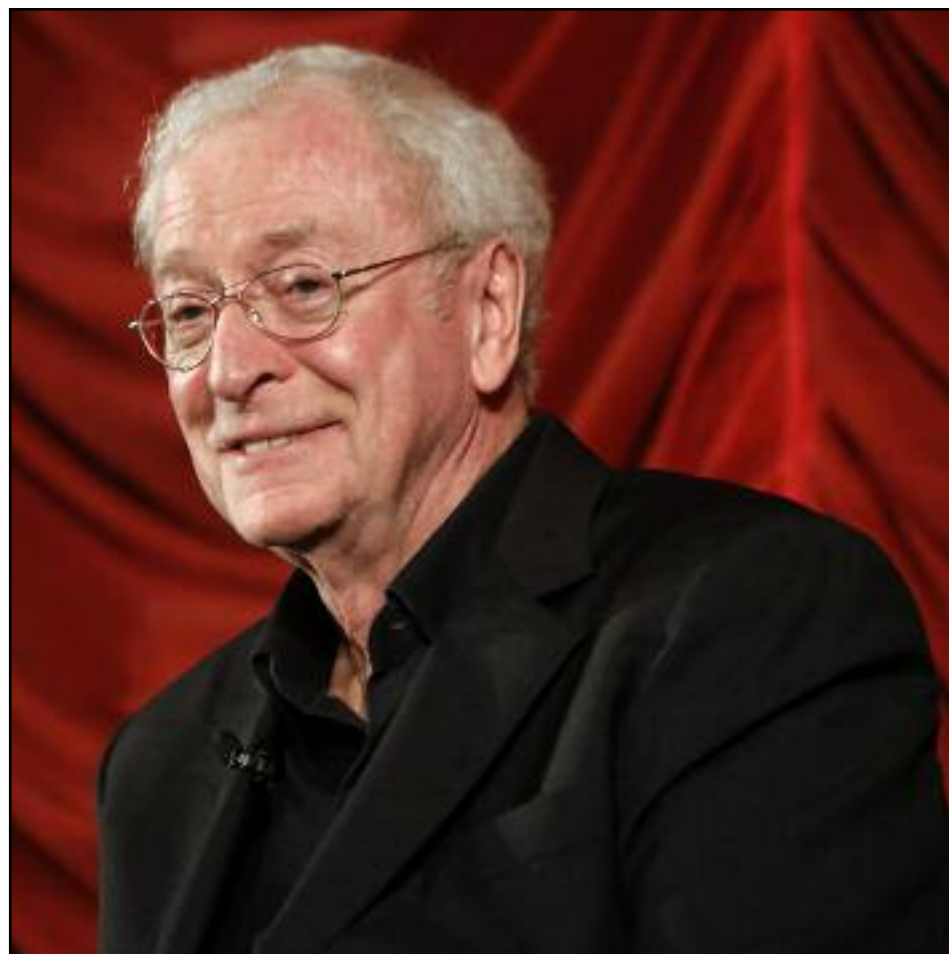
Sir Michael, 81, said: "I have no ambitions now... all I do is, I do films that I really want to do."

When asked about the difficulty of working on location, and the "opportunity" presented by other women, he added: "In my case, and it's a particular case, if you spend your entire working day with some of the most beautiful women in the world, you'd better have someone beautiful to go