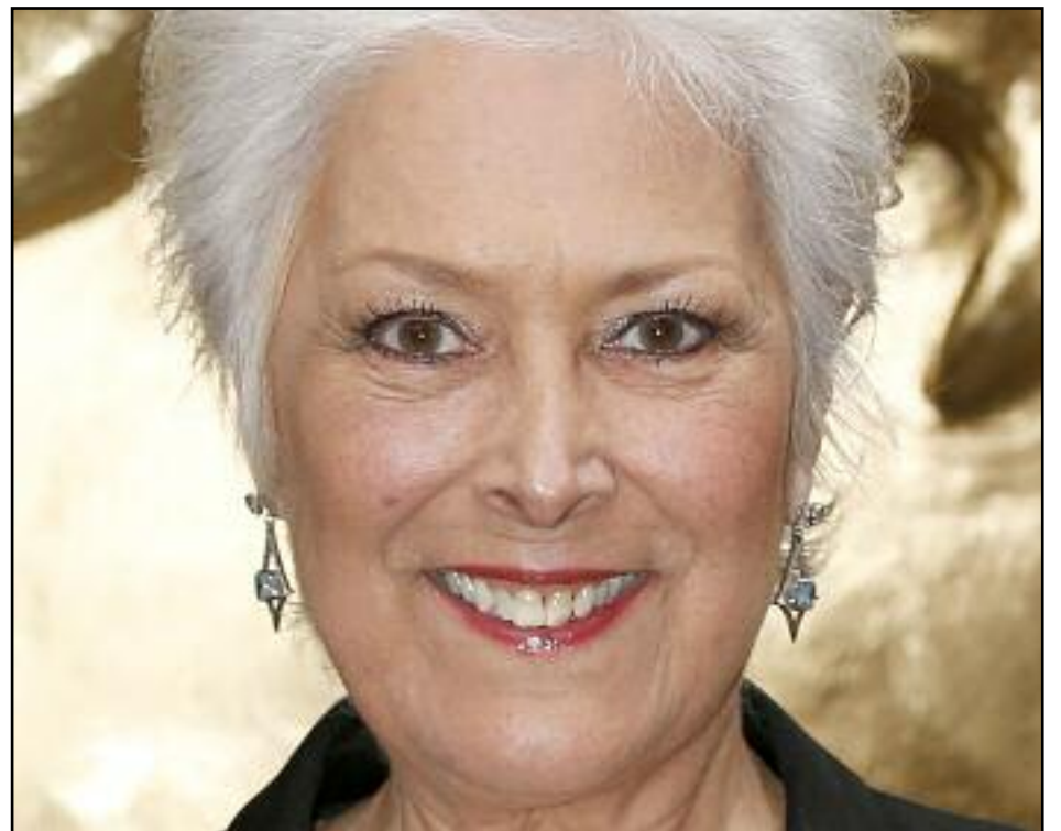
"I would love to make one more Christmas, if possible, but I want to stop taking chemo around November in order to pass away by the end of January' - Lynda Bellingham

"I'm devastated not to be able to honour my commitments to the play this year," she said in a statement.