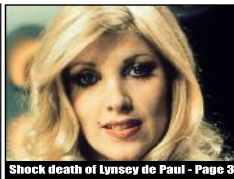
Shock death of Lynsey de Paul - Page 3