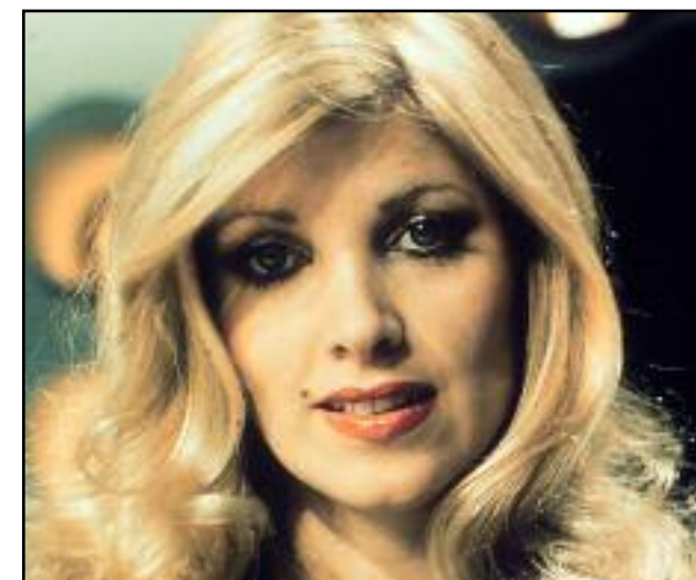
NEVER MARRIED: De Paul had relationships with actor James Coburn, Dudley Moore and Ringo Starr

De Paul never married but was romantically linked to a string of well-known men including Sean Connery,