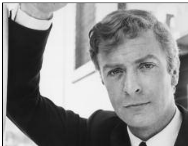
SHOOTING STAR: Michael Caine burst onto the silver screen with three classic 1960s movies, Zulu , The Ipcress File and Alfie (above)

Sir Michael, who won Oscars for his roles in