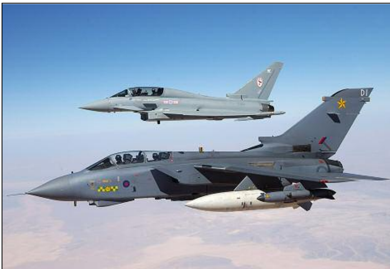
TAKING THE FIGHT TO ISIS: RAF Tornado fighters have already flown a dozen sorties to push back Isis forces in Iraq

"Obviously, these operations are just one element of our strategy. We are also working hard to deliver a training package for Iraqi forces