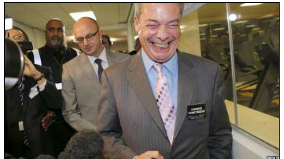
ALL SMILES: party leader Nigel Farage was in confident mood ahead of the vote