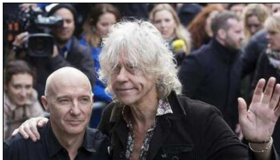
TOO MUCH OF A GOOD THING? Musicians Midge Ure (left) and Bob Geldof attend the recording of the Band Aid 30 charity single in west London on Saturday

The reader reserved the harshest criticism for the Do They Know It's Christmas video clip: "Have you no shame? You use a dying (or dead) woman as the opening scene to your music