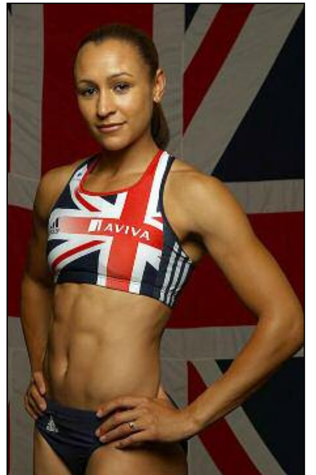
GOLDEN GIRL: Reining Olympic heptathlon champion Jessica Ennis was one of many who stood down from her role with the club after Evans was allowed to train at Bramall Lane

Evans has yet to respond to the new decision.