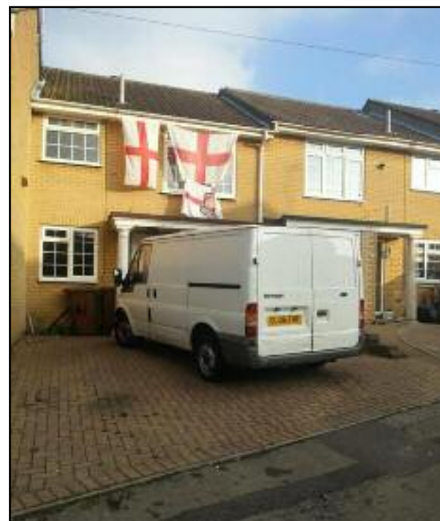
SO NOW YOU KNOW: Tweeting pictures of white vans and the flag of St. George is "derogatory and dismissive of the people"

In a statement released by the party, Thornberry said: "Earlier today I sent a tweet which has caused offence to some people."