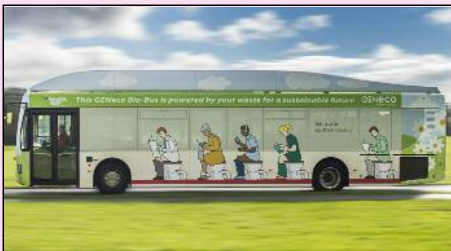
BOWEL MOVEMENT? the 40-seater currently provides a shuttle service to Bath

This week, the company also became the first in the UK to