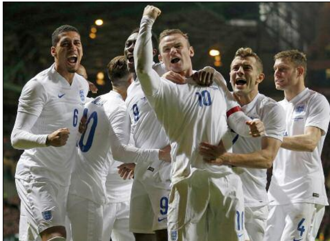
EDGING CLOSER TO SIR BOBBY: Rooney scored his 45th and 46th goals for England in Tuesday's friendly

As the clock ran down and substitutes arrived on a regular basis, Robertson gave Scotland hope with a close-range