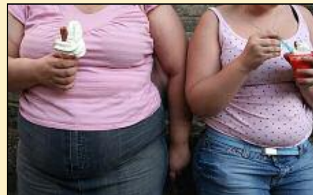
HEAVY TOLL: Obesity costs the British taxpayer £47bn annually, new figures reveal

The study blamed the growing crisis on an inadequate response from the Government, branding its policy on