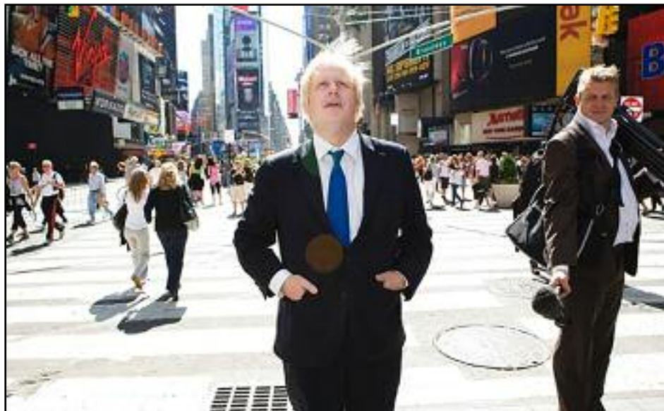
RAISING HIS PROFILE: Boris Johnson was in the USA last week promoting his new book, The Churchill Factor

continually pressed the US embassy to pay unpaid fines it has incurred for the congestion charge. The embassy has refused to do so, claiming the charge is a tax and therefore its diplomats are immune. During a visit to the UK by Barack Obama in 2011, Johnson reportedly asked him for a £5m cheque for unpaid congestion charges but the US ambassador