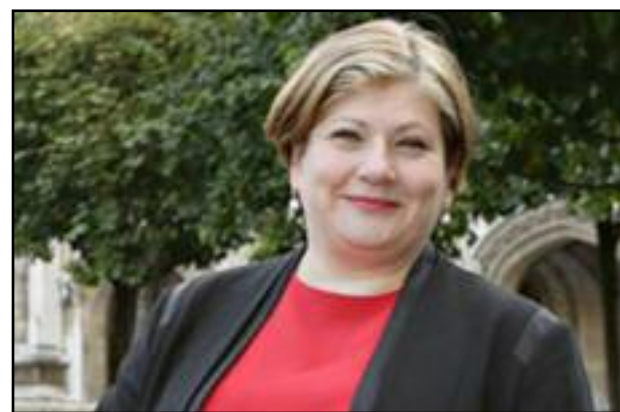
THORNBERRY: blamed 'anti-Islington' prejudice for the fuss

Just after the polls had closed in Rochester at 10pm, it emerged Thornberry had resigned.