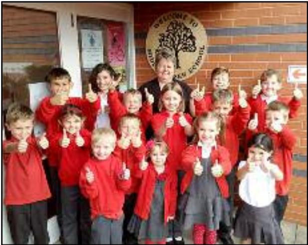
THIS HAPPY BREED: pupils at Middle Rasen Primary School in Lincolnshire

Schools are required to 'actively promote' British values such as democracy, tolerance, mutual respect, individual liberty and the rule of law.