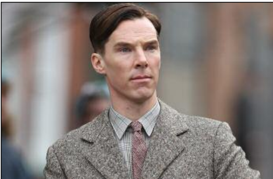
HOT STREAK: Benedict Cumberbatch is nominated for The Imitation Game

Budapest Hotel . The Wes Anderson directed film comedy or musical shortlisted for best comedy joins Birdman and the redoubtable Into the Woods , St Vincent and oft-nominated The Hundred-Foot Journey , Dame Helen Mirren is also in with a shout, as is Emily Blunt for Into the Woods .