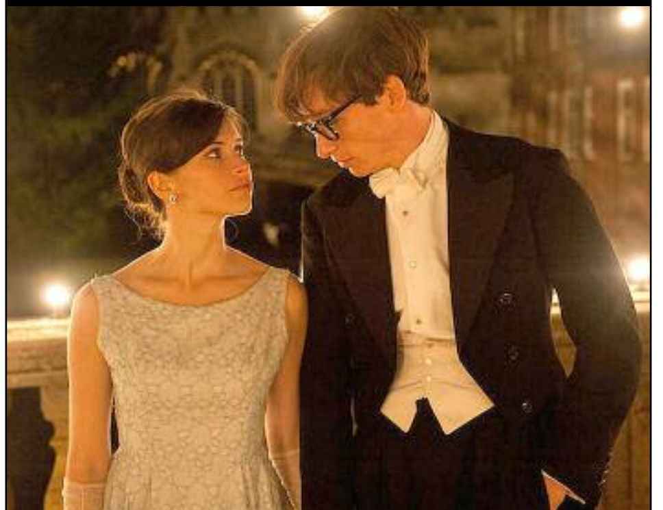
IT WAS A GOOD WEEK for Felicity Jones and Eddie Redmayne. The British pair were nominated for SAG Awards AND Golden Globes for their performances in the critically-acclaimed Stephen Hawking biopic, The Theory of Everything (see page 7)