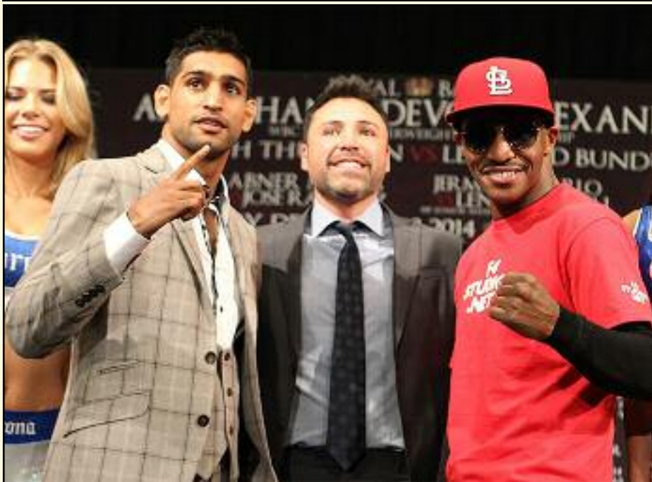
GETTING READY TO RUMBLE: Britain's Amir Khan and his opponent Devon Alexander flank promoter Oscar de la Hoya in Las Vegas on Thursday ahead of Saturday's WBC Silver Welterweight title bout at the MGM Grand Garden Arena. The fight can be seen on Showtime.