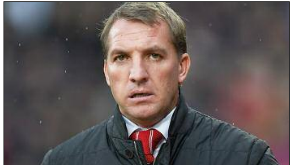
UNDER PRESSURE: Liverpool manager Brendan Rodgers has seen his Champions League ambitions come to an early end this season

"Some of Liverpool's key players have lost