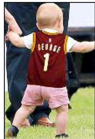
WISHFUL THINKING: James later posted this Photoshopped image of George wearing his gift

During the meeting with James, the American player presented the royals with two Cleveland jerseys. One was yellow and had the name "Cambridge" on the back with the No. 7 under it, and the other was red and much smaller with "George" printed over the No. 1 for their 1-year-old son, Prince George.