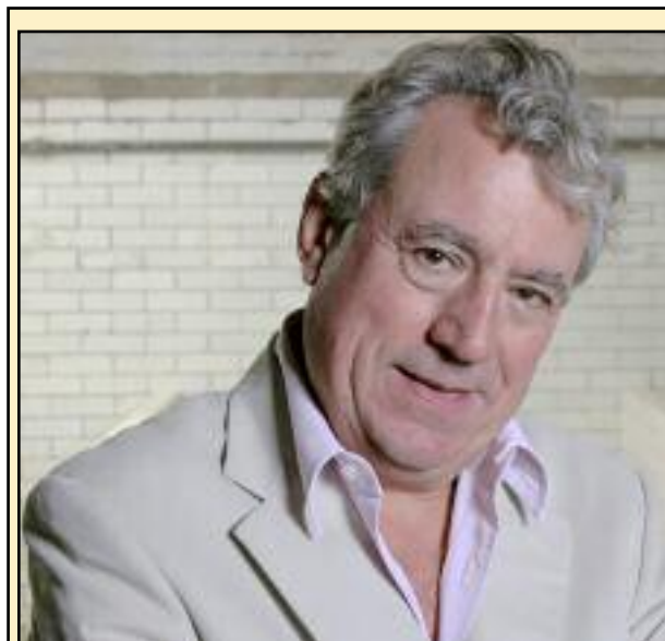
NEW PROJECT: the Python star has directed a new movie, Absolutely Anything

West Midlands Police has been working with local police in Ohio to investigate the 'abduction' but since a 'safe and well' check was carried out with the mother and daughter, nothing has happened.