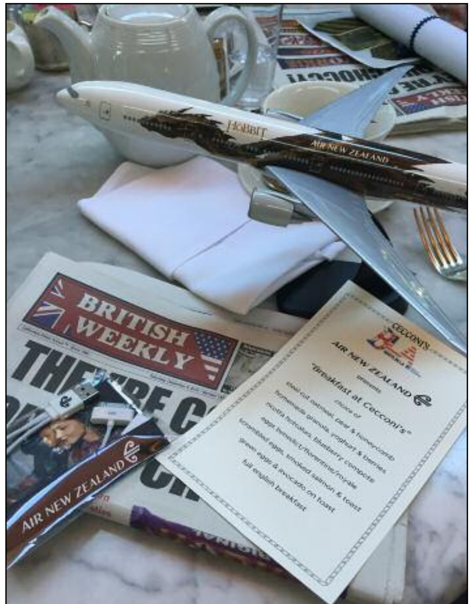
IT'S ALL FIRST CLASS HERE: This week's British Breakfast featured good reads, good grub and Air New Zealand-sponsored giveaways

Those clever folks at Air New Zealand surprised some lucky Breakfast club goers this week with tickets to see The Hobbit at the IMAX and two limited edition Hobbit model planes. Our breakfast club is always great fun and has a good turnout and next week we're doing a pre-Christmas a toy drive at breakfast club to benefit ADOPT-A-LETTER - so if you plan on coming (as always, our breakfast will be held at Cecconi's in West Hollywood at the junction of Robertson and Melrose) please consider bringing an unwrapped