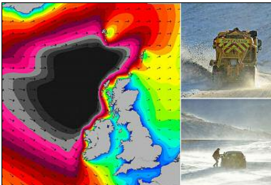
HERE COMES TROUBLE: (left) a graphic shows the extent of the high winds which battered Britain this week, bringing misery (right) to roads and rural areas

At press time Scottish cont. on page 2, col. 3