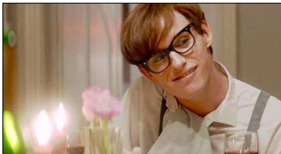
BEAUTIFUL MIND: Redmayne as Stephen Hawking in The Theory of Everything

Other British names in the mix include Ralph Fiennes, nominated for his comic turn at the center of The Grand