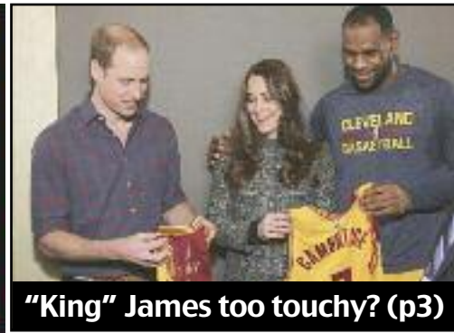
"King" James too touchy? (p3)