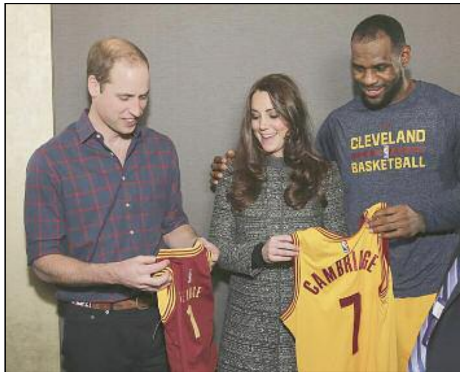
GOOD SPORTS: The Duke and Duchess of Cambridge meet with basketball superstar LeBron James in New York on Monday night

"For men this is a neck bow (from the head only) whilst women do a