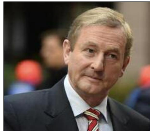
COUNTERPART: Irish Prime Minister Enda Kenny

agreement now, with a cycle of elections approaching, a great opportunity will have been lost."