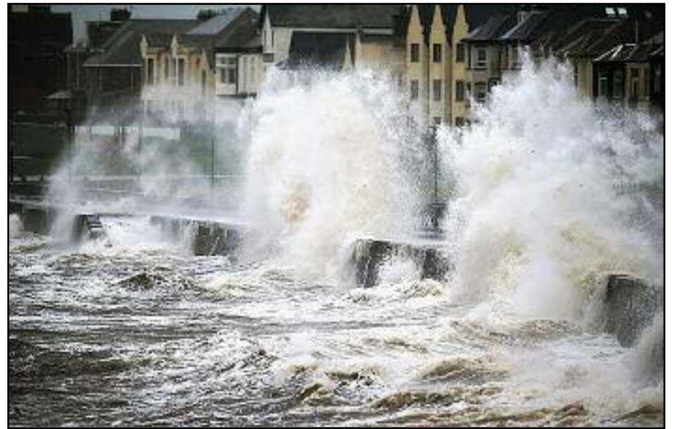
FEROCIOUS: Waves crash over the promenade wall in Prestwick, Scotland. The public were warned to stay away from the coast in northern parts of the UK including Scotland. Meanwhile, more than 17,500 homes lost electricity on Wednesday morning in the Fort William area of the Highlands.

Power shortages were reported on both sides of the border, and ferry travel to Scotland was disrupted, with a number of sailings cancelled or delayed.