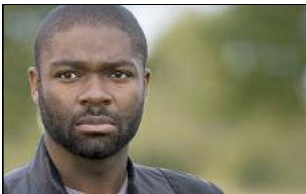
NOMINATED: David Oyelowo gets a nod for his portrayal of the Rev. Martin Luther King Jr. in Selma

The 72nd Golden Globes will be held in Beverly Hills on 11 January.