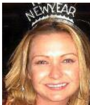
by Eileen Lee

2015 has got off to a great start for the entertainment industry! It looks like Hollywood is coming back to LA - there is a new tax incentive that will go in effect this year. It will be increased from $100 million to $330 million. Hooray for Hollywood!