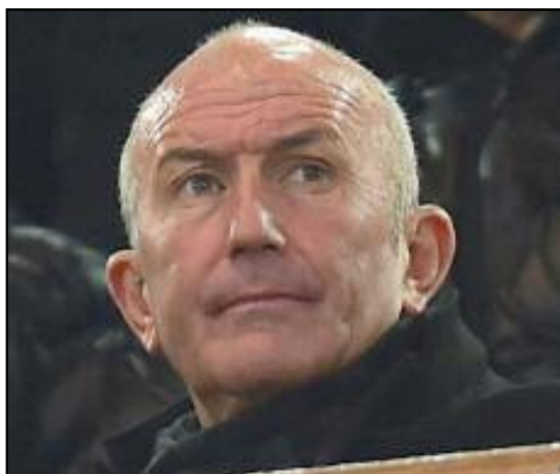
TONY PULIS: watched his new team from the stands at West Ham on New Year's Day

Pulis, with 22 years of managerial experience under his belt, proved last season that he can