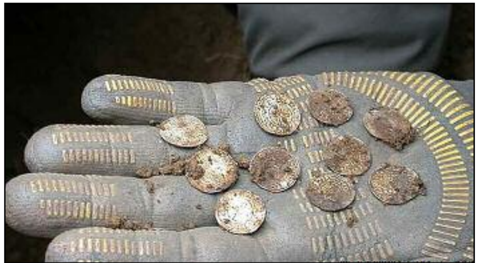
IN THE MONEY: The heads of Ethelred the Unready and Canute can be seen on the coins