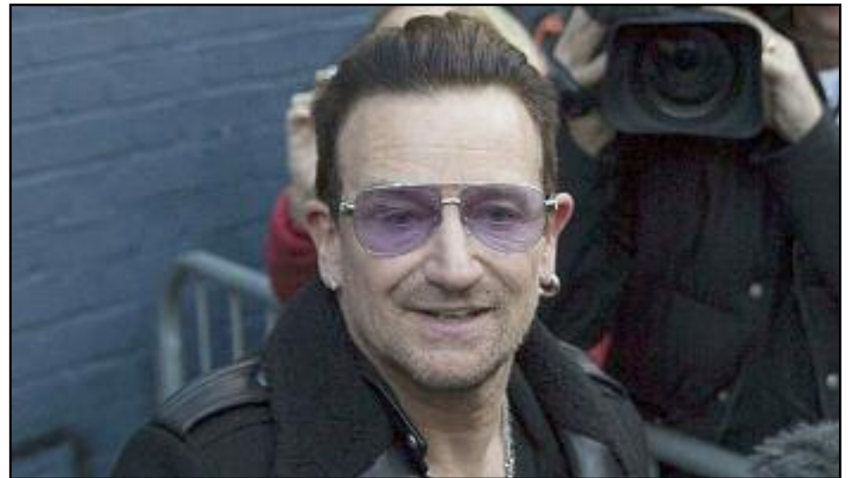
TITANIUM ELBOW: Bono's 'high-energy bicycle accident' happened one day after the recording of the Band Aid single in London

fingering the frets of my green Irish falcon or my (red) Gretsch. Just for the pleasure, aside from writing tunes.