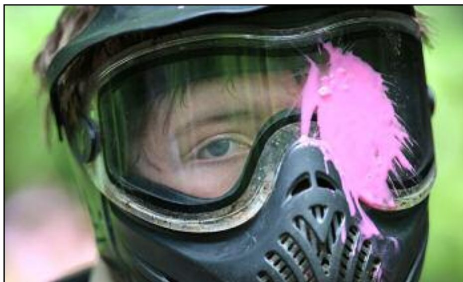
UKPaintball says it is overwhelmed at the scale of the response to its bid to employ a £40,000-a-year pro rata Human Bullet Impact Tester

being face-covered by paint while screaming so I think I can be the perfect tester."