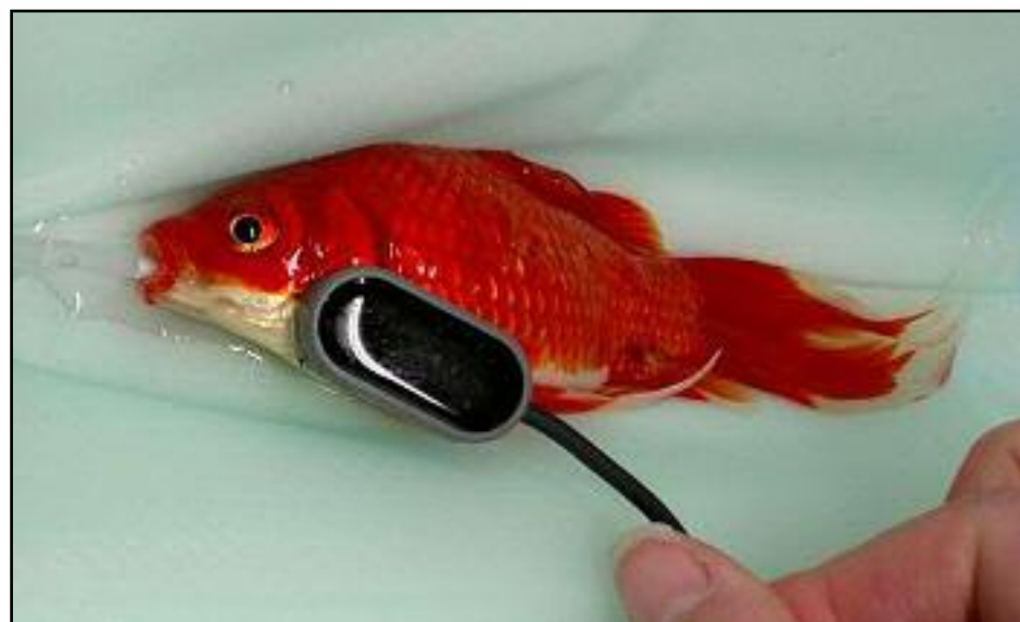
EXPENSIVE LITTLE GOLDFISH: the fish couldn't defecate and it would have eventually become toxic and died, said vet Faye Bethell at the Norfolk clinic

It was then removed from its tank and placed