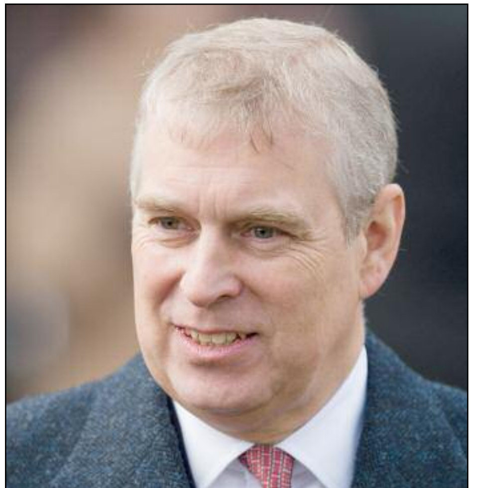
STRANGE BEDFELLOWS: Prince Andrew has previously come under fire for his friendship with US financier Jeffrey Epstein, who is accused of trafficking minors for sex

"Epstein's purposes in 'lending' Jane Doe (along with other young girls) to such powerful people were to ingratiate himself with them for business, personal, political, and financial gain, as well as to obtain potential blackmail information."