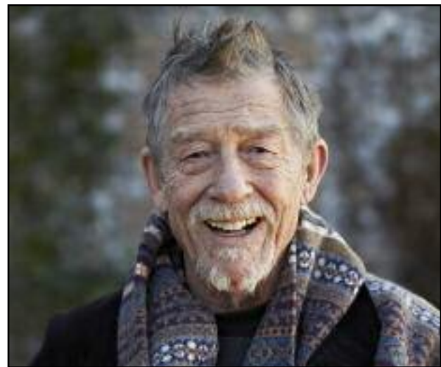
SIR JOHN HURT: a knighthood for the veteran actor