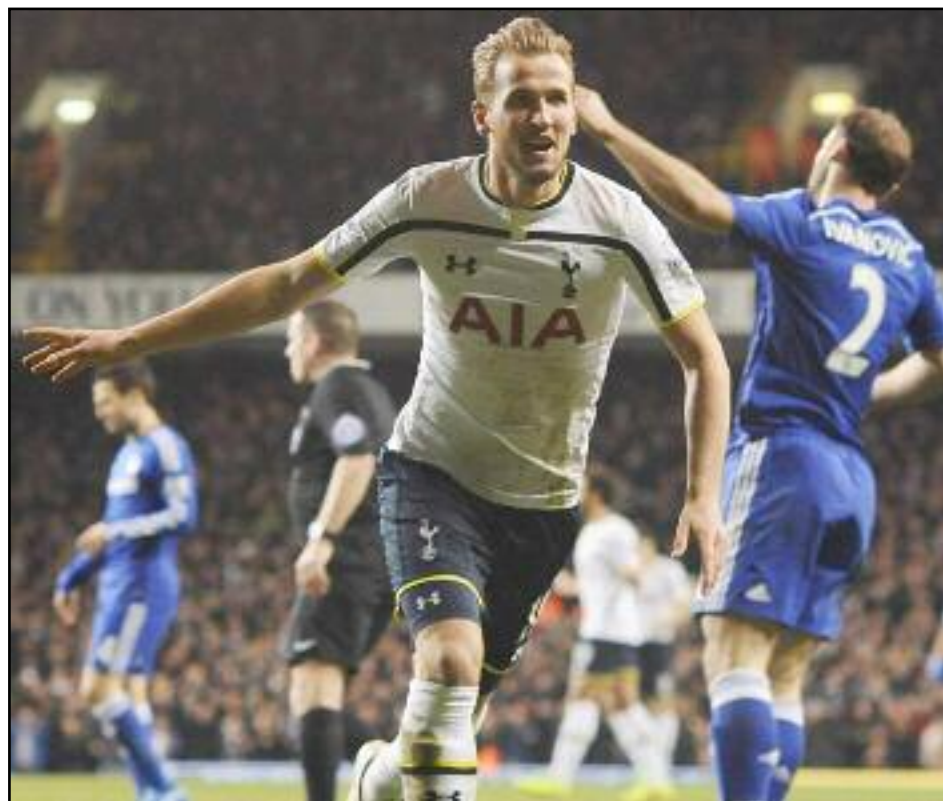
THREE POINTS LANE? Spurs striker Harry Kane put on a show-stopping performance against Chelsea on New Year's Day, scoring twice, grabbing an assist and winning a penalty as Mauricio Pochettino's men stunned table-topping Chelsea