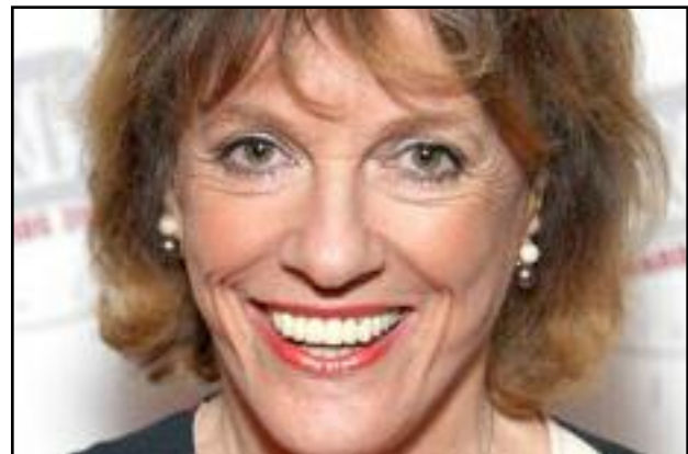
THAT'S LIFE: Esther Rantzen (above) was recognized for her services to charity while former British Olympian Steve Cram (below) gets a CBE for his work with the English Institute of Sport.