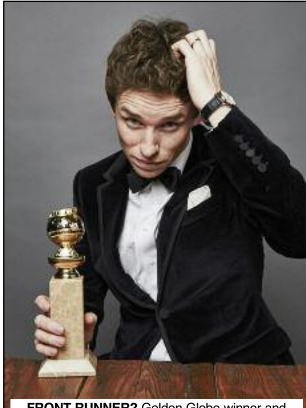
FRONT RUNNER? Golden Globe winner and Oscar nominee Eddie Redmayne

Eddie's portrayal of Hawking has already won him a Golden Globe and he will be