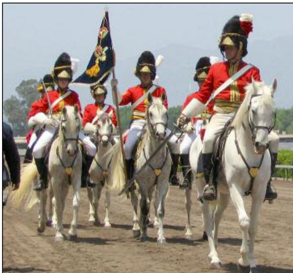
The War Horse Foundation has been presenting the 1815 Royal Scots Greys since 2002 at numerous events, Scottish Festivals and the Tournament of Roses Parade.

The organizers of the charity hope to recreate the troupe of the Royal Scots Greys, a cavalry brigade sadly now defunct but whose name will be forever linked with many of the most famous chapters in British military history. The troupe was finally disbanded in 1971 after an illustrious history spanning almost three hundred years. It was the Greys who led a pivotal cavalry charge in support of the infantry during Waterloo and captured the French eagle standard from the