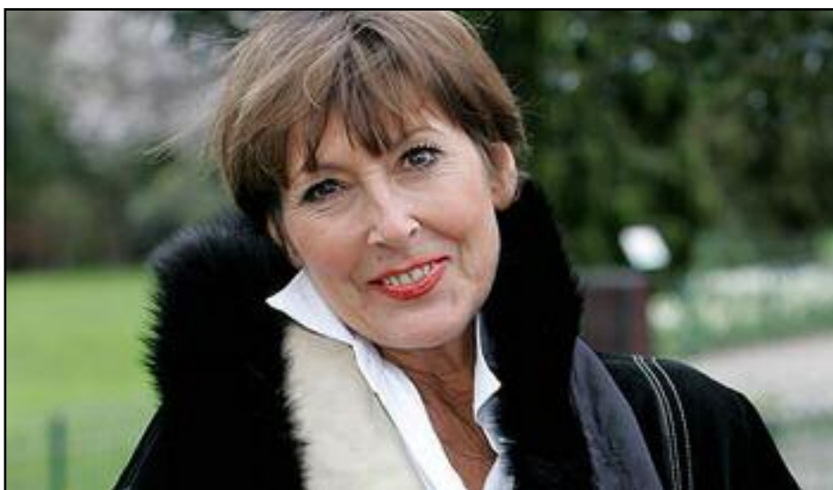
HARRIS: forced to sell her home in London's swanky Barnes to pay off debts