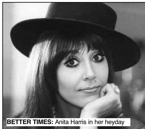
BETTER TIMES: Anita Harris in her heyday

and actresses and ex-footballers often grab the headlines, but really their financial problems are very similar to other self-employed people around the country. One of the main triggers for bankruptcy is an unpaid tax bill: it's a risk for self-employed people to fail to keep enough cash available at the end of the year to pay their tax bill."