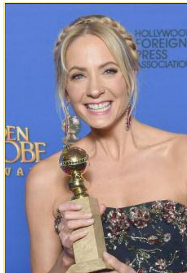
'SHOCKING': Joanne Froggatt won the Globe for her portrayal of Anna Bates in Downton Abbey