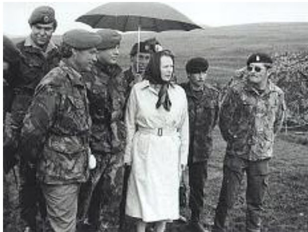
HER FINEST HOUR: on the Falklands following victory

After Baroness Thatcher died in 2013 the population of the Falkland Islands were consulted about how they wished to commemorate the leader.