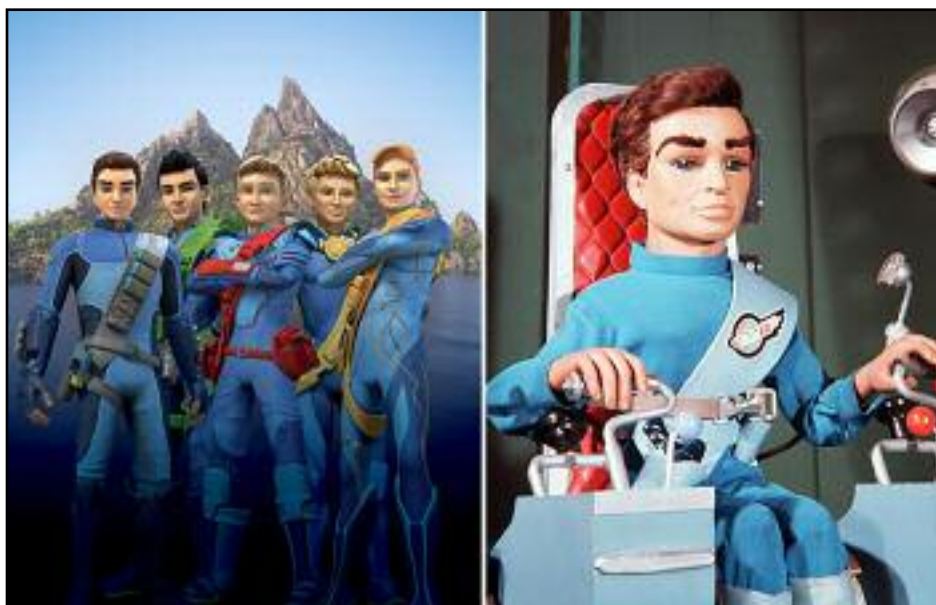
RETURN OF A CLASSIC: the new Tracey boys (left) and (right), the original Virgil

Thomas Brodie-Sangster, the child actor from Love Actually , will voice John Tracy, and Kayvan Novak will be the voice of Brains.