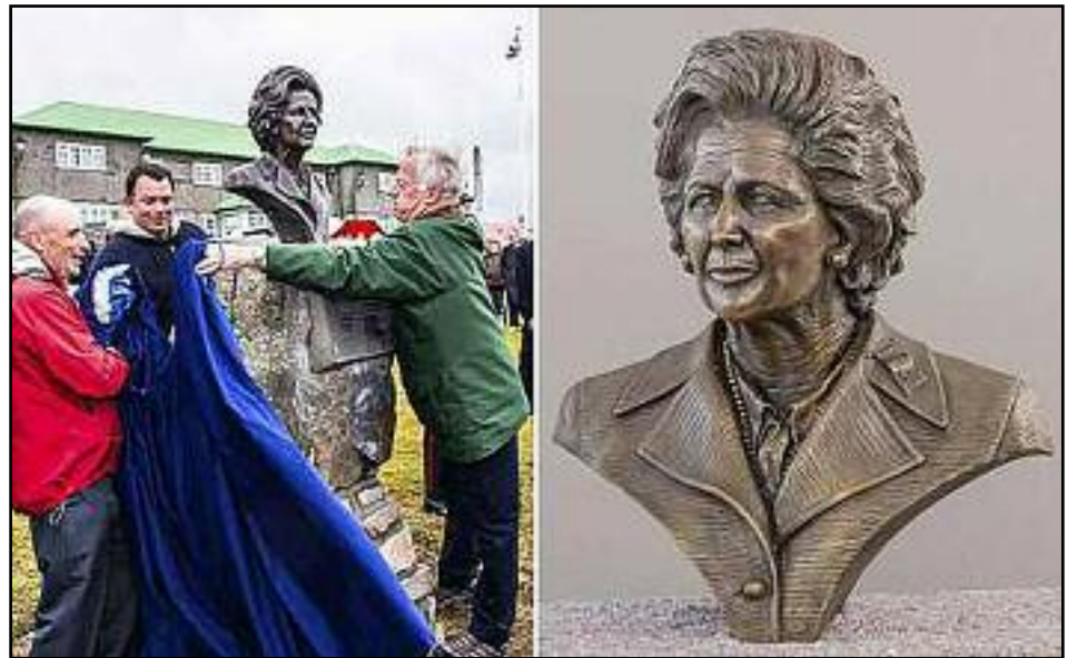
TURN RIGHT AT THATCHER DRIVE? The statue is unveiled this week