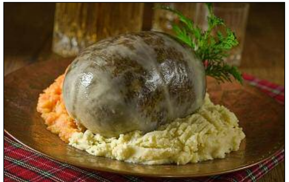
THE REAL THING: Haggis with neeps and tatties, just in time for Burns' Night...

"Would charity be better at home and if it does really deal with obesity maybe we should be cont. on page 3, col. 2