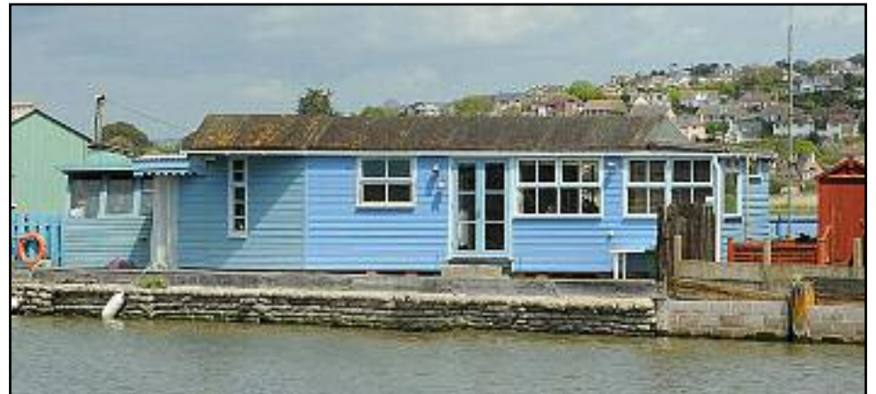
QUITE A MARKUP: the two-bedroom chalet rented for as little as £41 a night before the Broadchurch phenomenon hit

As a warning to would-be Broadchurch tourists the estate agents note that they are happy to 'arrange a viewing for those that are genuinely interested.'