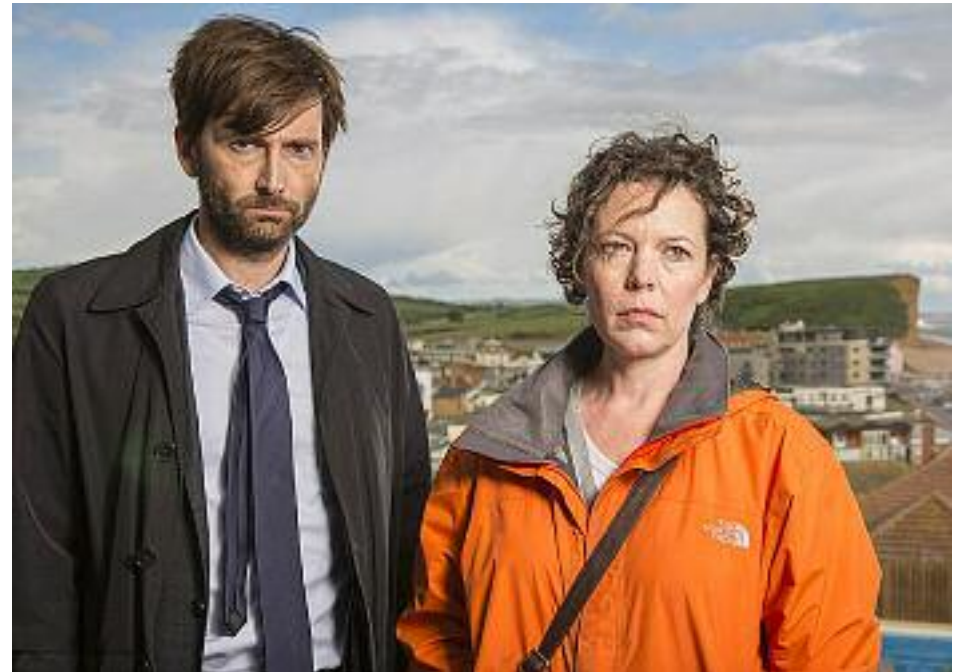
ON THE CASE: David Tennant and Olivia Colman in character