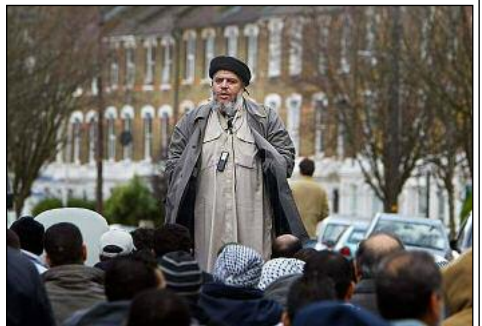
ABU HAMZA: the hook handed preacher is awaiting sentencing in a US court