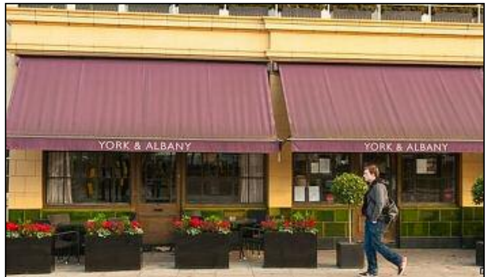
PRICEY REAL ESTATE: The York & Albany pub is located near Regent's Park