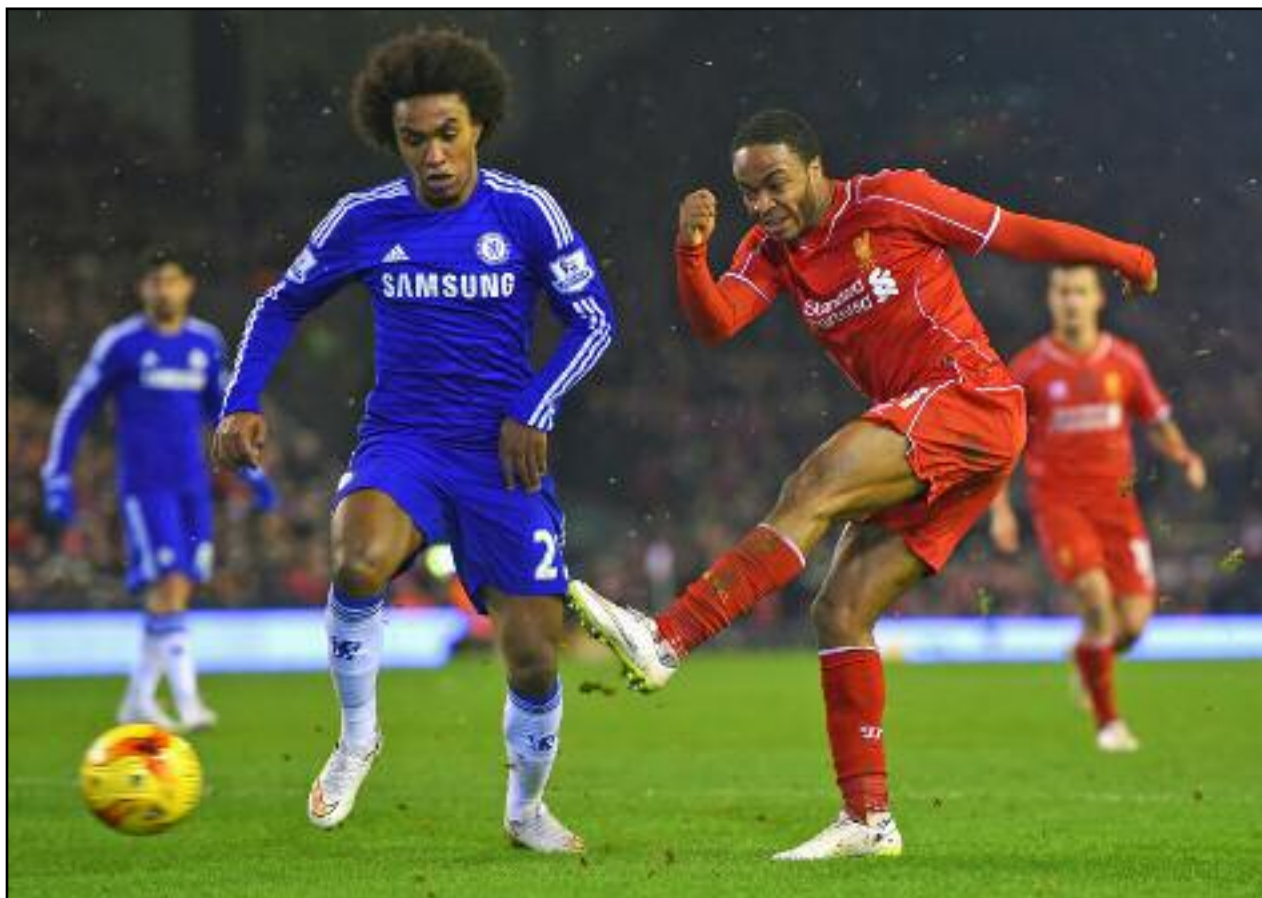
RED HOT: Raheem Sterling was a constant threat for Liverpool on Tuesday night, scoring their equalizer

And Chelsea manager Jose Mourinho now rates