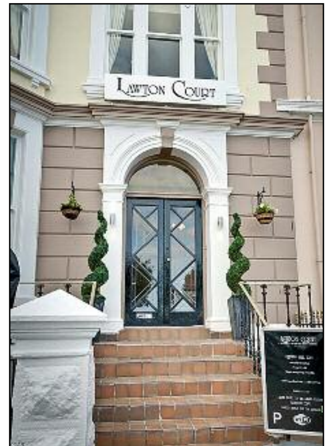
BEST BARGAIN: the Lawton Court Hotel in Llandudno

It also received second place in the World's Top