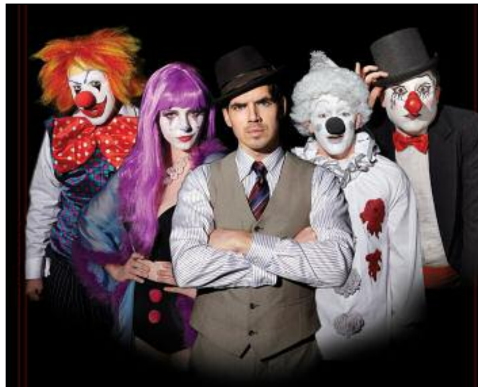
LIGHT AND SHADOW: Clown Bar at the Pasadena Playhouse may rattle your cage...