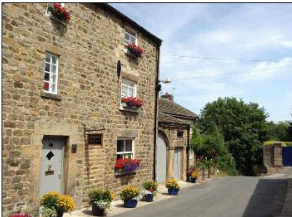
WORTH A TRIP: The Millgate Bed & Breakfast in Masham, North Yorkshire

The Haymarket Hotel in London was ranked as the UK's best hotel, while Gili Lankanfushi Maldives, on the North Male Atoll of the Maldives, took the title of the World's Top Hotel for 2015.