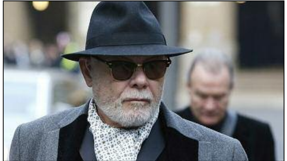
LOW PROFILE: Mr. Gadd arriving in court in South London on Thursday