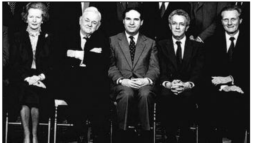
DRIES AND WETS: In an image from the first Thatcher Premiership, Brittan (center), is flanked by Margaret Thatcher, Quintin Hogg, Keith Joseph and Michael Heseltine

Cabinet minister, law, and latterly in London after a long European Commissioner business. battle with cancer. We and peer - together with “Leon passed away shall miss him a distinguished career in last night at his home in enormously.”