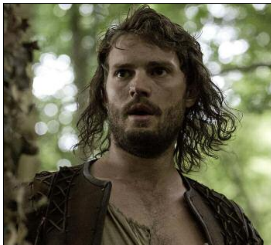
New Worlds: Dornan stars in the new miniseries from Acorn TV

The Northern Irish star made his feature debut in Sofia Coppola's Marie Antoinette , and played Sheriff Graham/The Huntsman in ABC's Once Upon a Time . However, unlike his