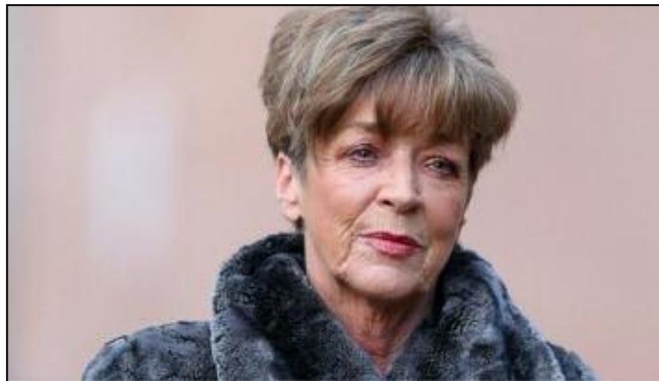
POPULAR VETERAN: Anne Kirkbride was a regular in the world's longest-running TV soap opera for 42 years