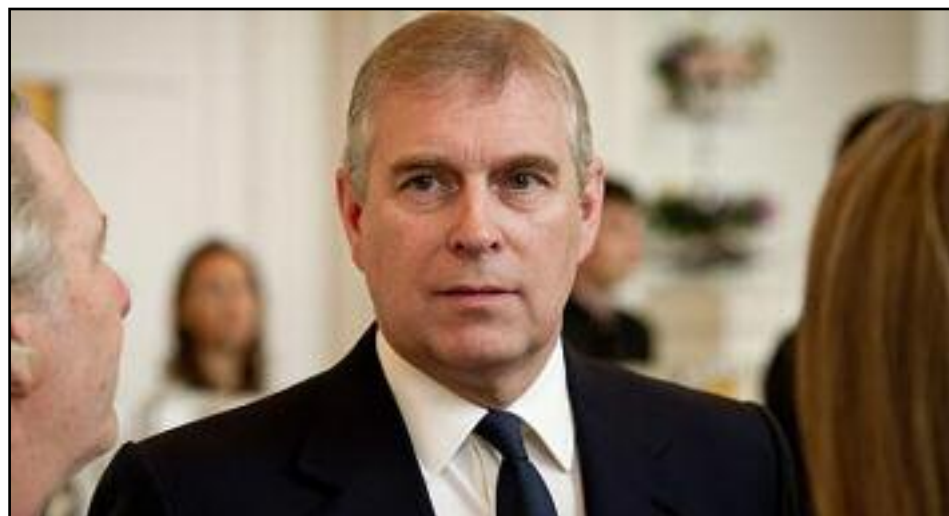
FIRM DENIAL: Buckingham Palace has strenuously denied any suggestion of impropriety with underage minors by Prince Andrew

In a sworn affidavit, Ms Roberts, who is now 31, said: "I have seen Buckingham Palace's recent 'emphatic' denial