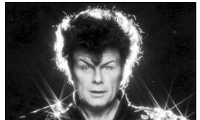
HAIR APPARENT: The court heard Glitter went bald early and hated having his wigs touched

The other charges Mr Gadd, from Marylebone, central