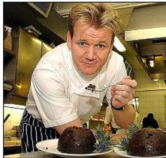
GORDON RAMSAY: the chef said his signature had been forged on a document

He refused to grant a declaration that the rental guarantee was not