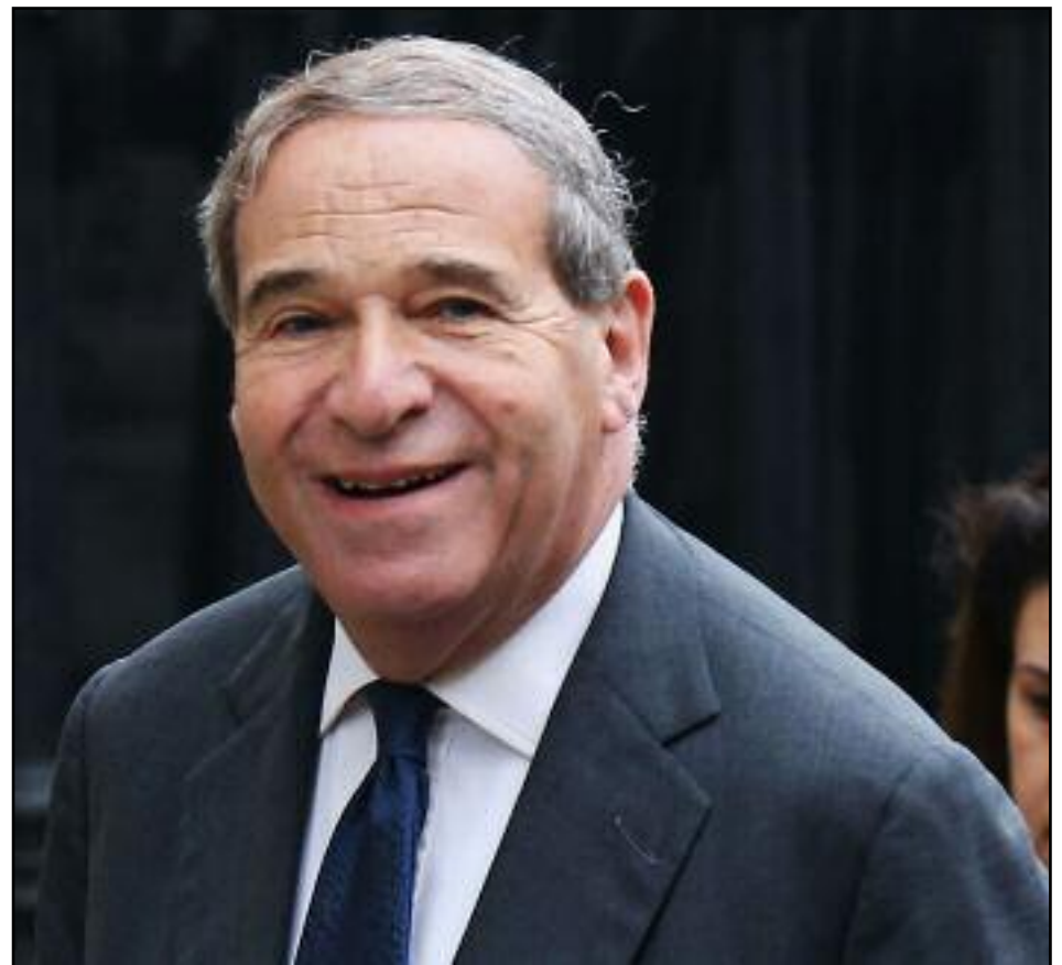
VERSATILE: Leon Brittan also enjoyed successful careers in the law and business, as well as serving as European Commissioner

They added: “We also salute his extraordinary commitment to British public life as a member of Parliament, minister,