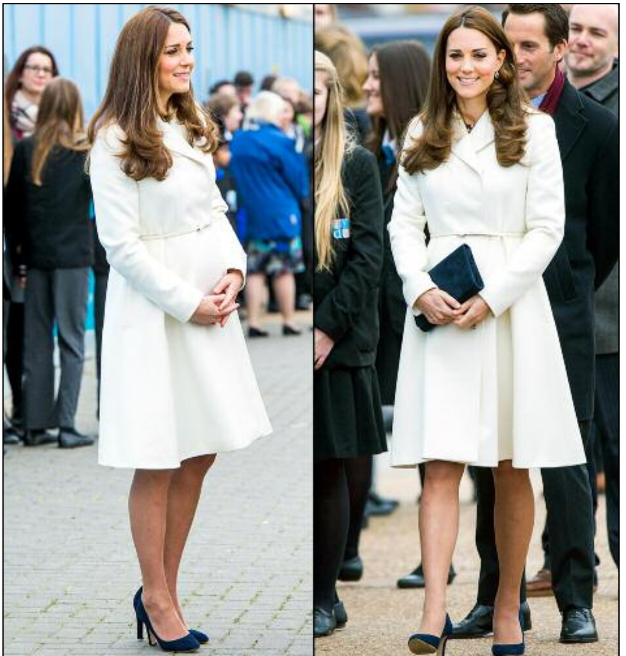
BLOOMING MARVEL: The Duchess of Cambridge visited Portsmouth's Ben Ainslie racing center on Thursday