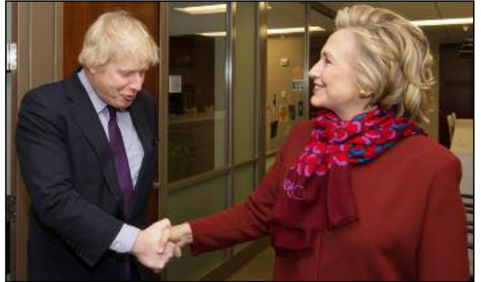
ATONEMENT: Johnson praised Hilary Clinton's 'goodness and generosity'

His personal attack continued: "She's got dyed blonde hair and pouty lips, and a steely blue stare, like a sadistic