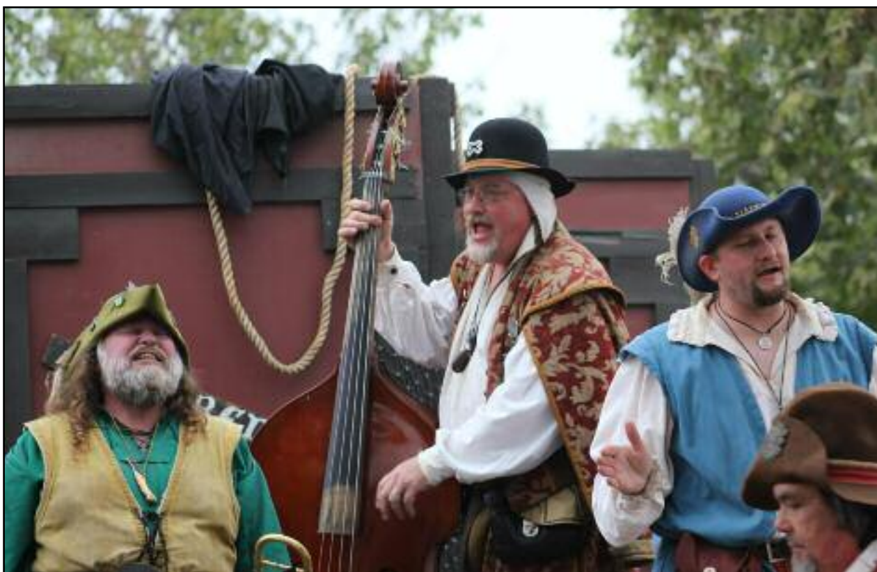
OH THOSE POXY BOGGARDS: Entertainment will be provided by the popular (and somewhat bawdy) troupe

"The celebration of Saint David's is more than commemorating the life of an ancient monk. This is a celebration and a reminder of where we come from. One of the greatest features of