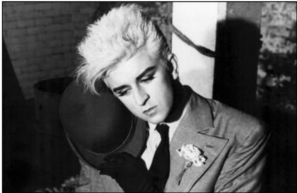
PEAKING EARLY: Steve Strange at the height of his fame in 1981

record, Fade To Grey , peaked at number eight in the UK Singles Chart the following year and reached number one in both Germany and Switzerland.