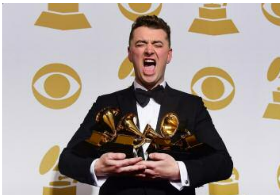
WINNING STREAK: Sam Smith took home four Grammys (above) for his debut LP "In the Lonely Hour", and later posted on Instagram of his over-the-top celebrations (below, right): 'I am on another level of hungover right now.'

Nominated in six categories in his debut Grammy Awards, Smith