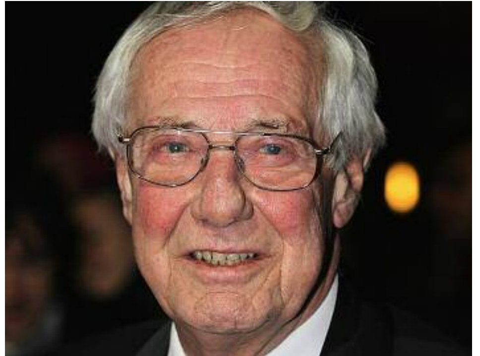
VETERAN: Barry Norman presented BBC 1's Film programme for 26 years before moving to Sky in 1998. He continues to write about film and watch cricket. He is perhaps most famous for his catchphrase "And Why Not?"

Writing ahead of Sunday night's ceremony, Norman said: