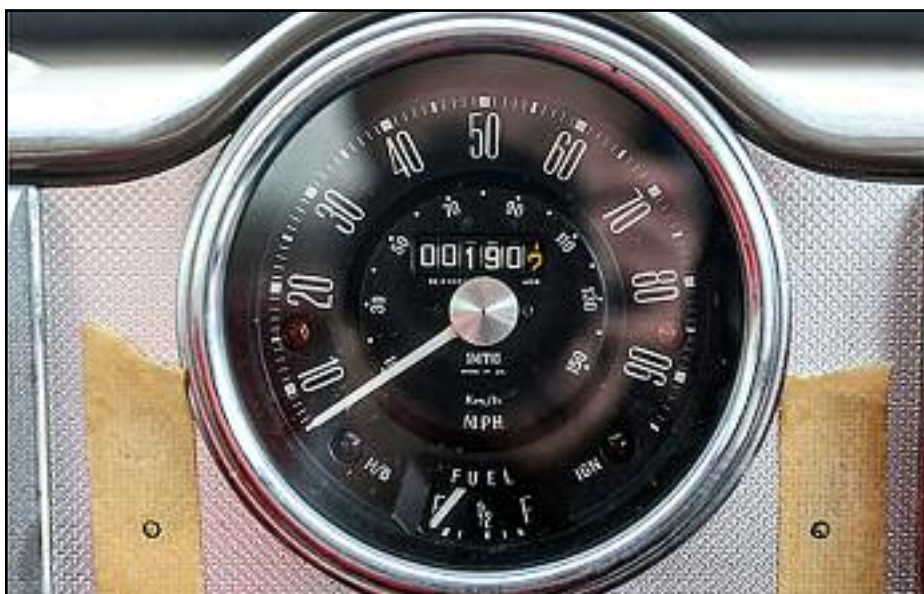
HARDLY RUN-IN: the odometer on the 1968 Morris Minor showed just 190 miles

The confectionary, which is also called 'Cambridge Beauty Chocolate' comes boxed as a three week supply, individually wrapped, and will only be available in high end retailers from next month.