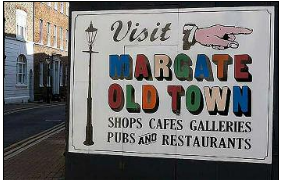
DEAR OLD MARGATE: the faded resort town is enjoying a red-hot property market

The report said this chimes with other studies showing that the London housing market has "slowed sharply" since last summer.