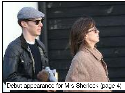
Debut appearance for Mrs Sherlock (page 4)