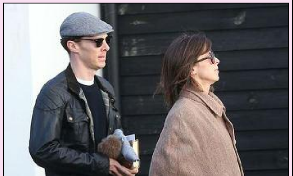
JUST MARRIED: Benedict Cumberbatch and wife Sophie in the Isle of Wight

The couple went to some lengths to keep their wedding under wraps, including sending