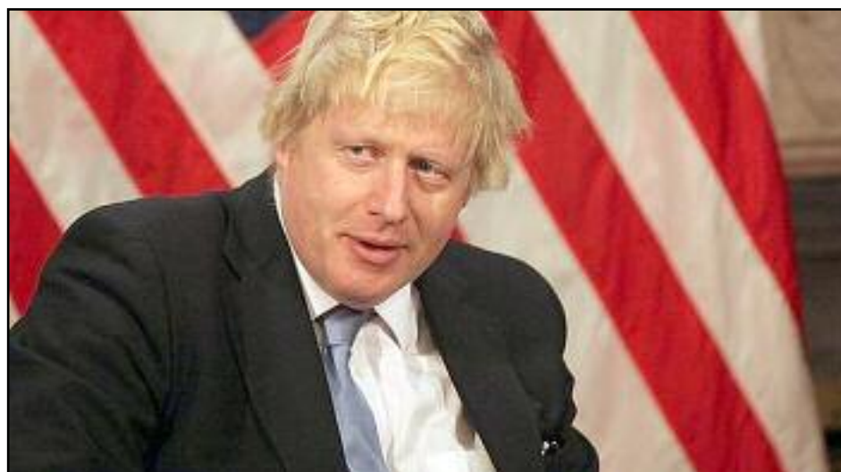
ON THE HOOK: Johnson described his US tax bill as "absolutely outrageous".

renewed in November 2012 but he had previously stated that he would give it up after being told in 2006 that, as a native born American, he could only use a US passport to travel in that country, and not his British one.