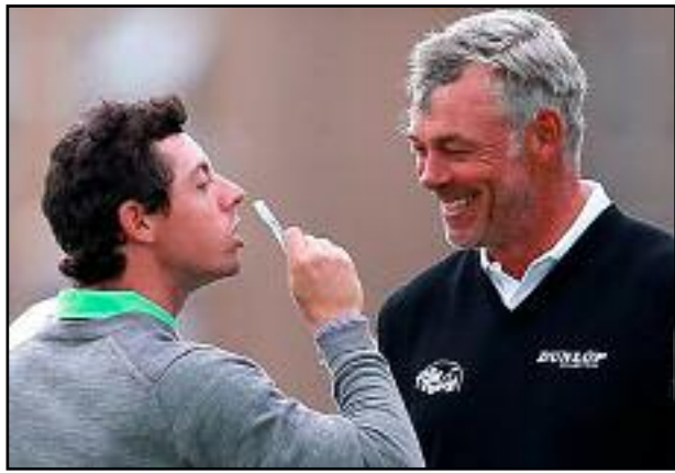
HAPPY DAYS: Rory McIlroy and Darren Clarke during Europe's 2012 Ryder Cup triumph at Medina