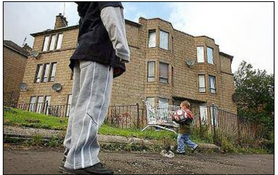
BLEAK OUTLOOK: Healthy life expectancy in Britain's poorest areas lags an astonishing 18 years behind the richest neighbourhoods, a new study has found

By contrast a boy born the same day in one of the least deprived 10 per cent of areas would have