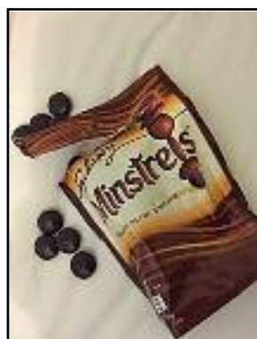
No. 5: Great British choccy

8. A good haircut. I stumbled upon a great barbers in London called Man Made, in St. George's Street, where I had a great haircut and shave, and most importantly great advice