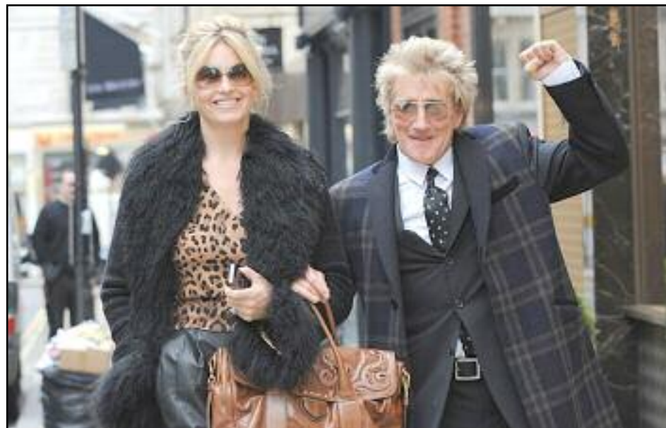
PUNCHING ABOVE HIS WEIGHT? Rod Stewart with wife Penny Lancaster

"He will star very much as the dad, and it