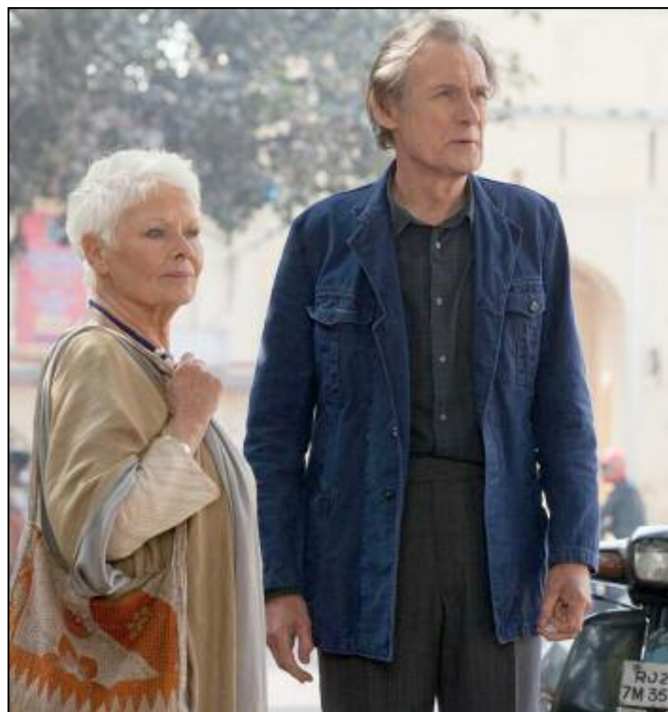
TAKING THEIR TIME: Dench and Nighy return as Evelyn and Douglas

is a master class in nuance and performance.