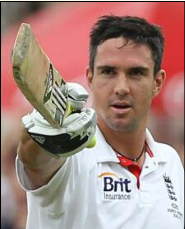
BOYCOTT ALL OVER AGAIN? the Kevin Pietersen saga continues to drag on for sorry England