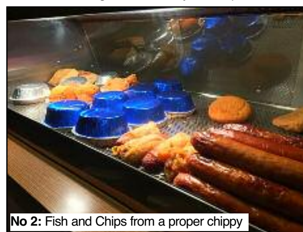
No 2: Fish and Chips from a proper chippy

Night-time", "Assassins" and Mike Bartlett's "Bull." 10. Walking. Whether it's markets, cobbled streets or running for the last bus, in the UK we tend to walk a lot. Sometimes out of