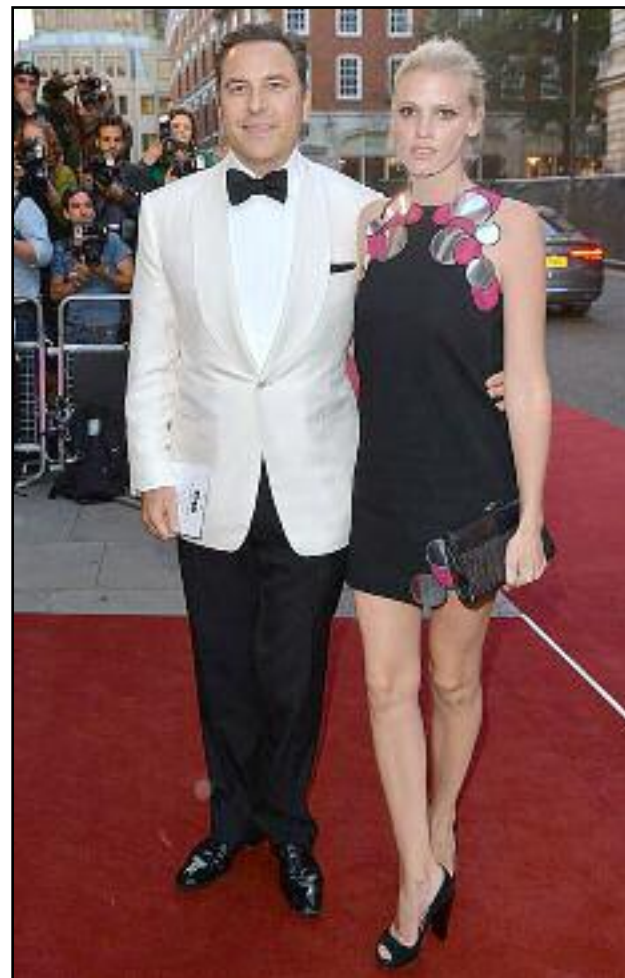
LOST IN TRANSLATION: David Walliams and his Dutch wife Lara have agreed to a trial separation

He wrote: "Some wonderful news. My beautiful wife Lara is pregnant. We are having a baby! It is due next year and we both couldn't be happier. Dx."