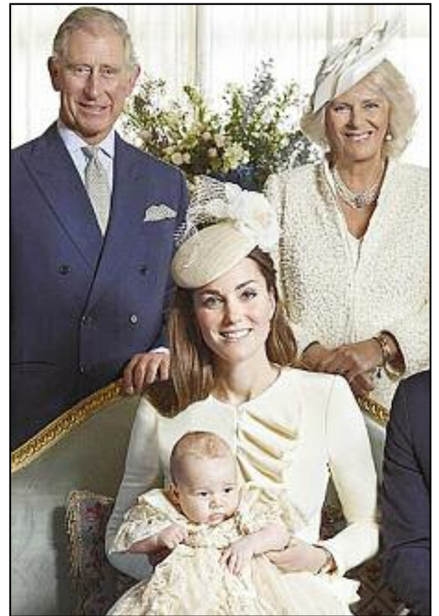
SHOVED INTO THE BACKGROUND? Charles has reportedly lamented his lack of access to Prince George

Yesterday, when asked when Charles had last seen little George, a Clarence House spokesman unusually issued a statement: 'We would not comment on the specifics of private arrangements. 'His Royal Highness enjoys an excellent relationship with his grandson.'