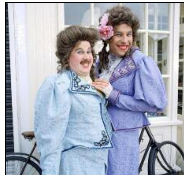
BRITISH TRADITION? David Walliams (right) and Matt Lucas don familiar garb for a Little Britain sketch