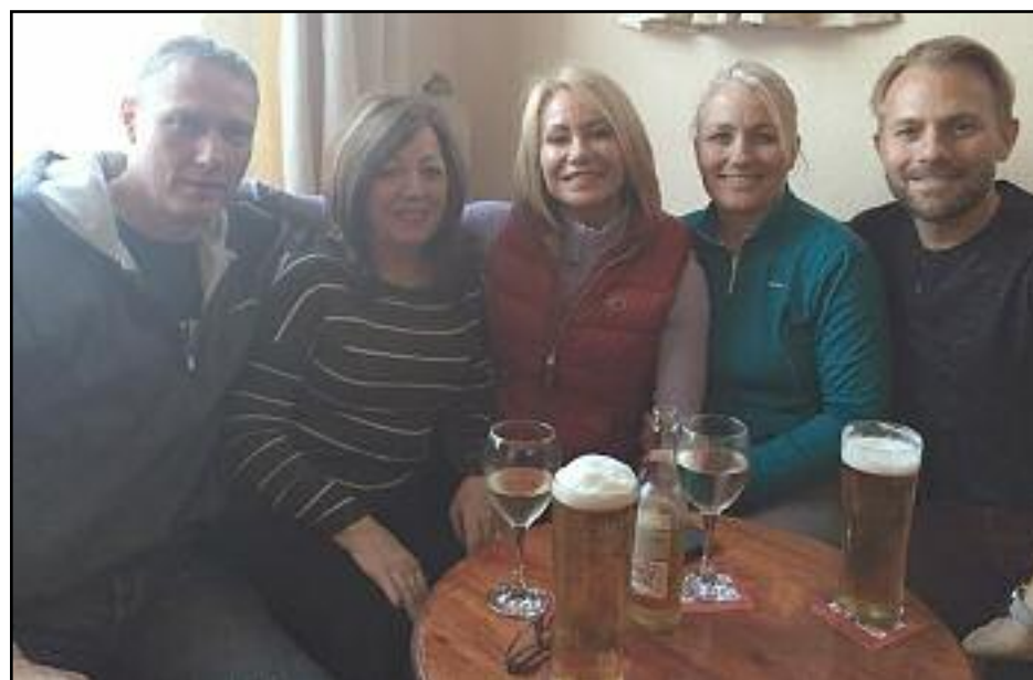
No. 1: is there anything better than a chin-wag with the family over a pint?

the West End or the Young Vic, London really does have the best choice. I was lucky to see three very different but all brilliant plays. "The Curious Incident of The Dog in The