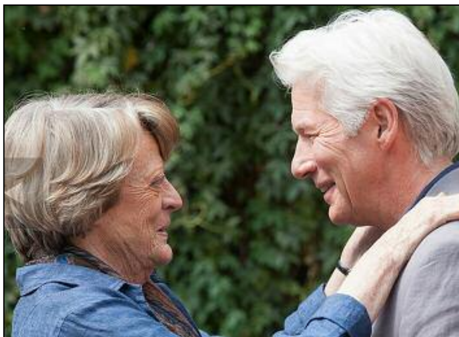
OLD HANDS: Maggie Smith and Richard Gere shine in the Marigold Hotel sequel

Character growth is wonderfully designed while retaining the very traits we fell in love with within each individual character. Nothing, however, is as magical as watching Judi Dench and Bill Nighy together as Evelyn and Douglas. You quickly find yourself tacitly urging them both onward into a more permanent and deepening relationship every time they appear on screen. Nighy is simply charming with a bumbling schoolboy nervousness and Dench is perfection, capturing the hesitancy of a first love. Their pairing (love interests of each other for the fourth time on screen)