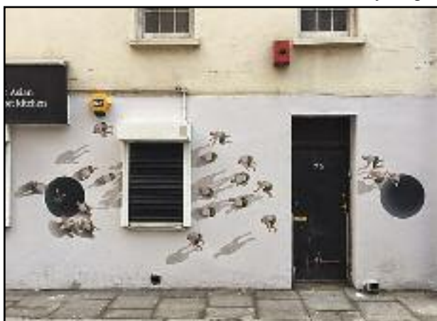
No. 6: Tasteful Graffiti Art. We are a creative race...

the West End or the Young Vic, London really does have the best choice. I was lucky to see three very different but all brilliant plays. "The Curious Incident of The Dog in The