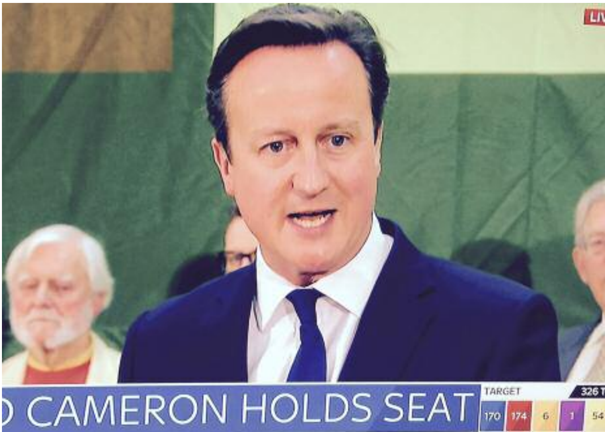
CAMERON: "the only poll that counts is the one on election day".

absolute majority is 326, but because Sinn Fein MPs have not taken up seats and the Speaker does not normally vote, the finishing line has, in