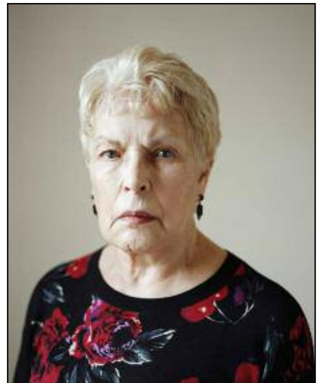
RENDELL: creator of the Inspector Wexford series

However, she was forced to resign after filing a story about a local sports club dinner that she hadn't attended. Her