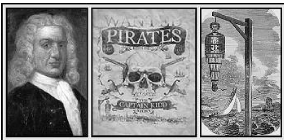
NOTORIOUS: William Kidd cut a larger-than-life figure for much of his brief career, which ended with his being hung by the River Thames in 1701. His body was then displayed in a metal cage to dissuade those who might be tempted to copy his exploits

Crown to tackle piracy and capture enemy French ships, but turned to piracy himself.