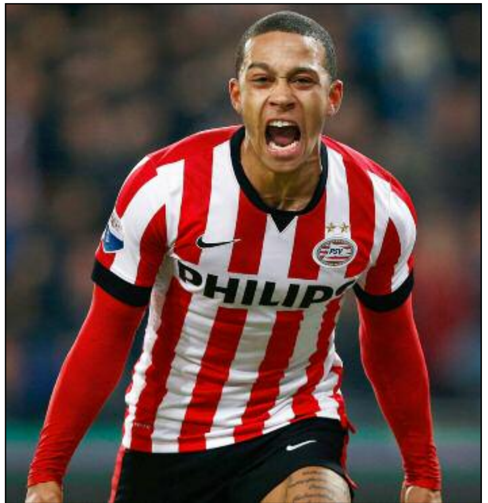
SWEET MUSIC? Memphis Depay scored 21 goals this term at PSV Eindhoven

"We obviously lose a fantastic player, which is of great value to the team. But PSV grants