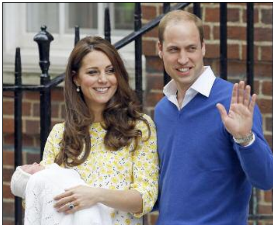
THE LONG WAIT IS OVER: Kate and William with their new daughter Charlotte. The family are scheduled to spend the next few weeks at Anmer Hall in Norfolk.

The Queen and other senior royals were told