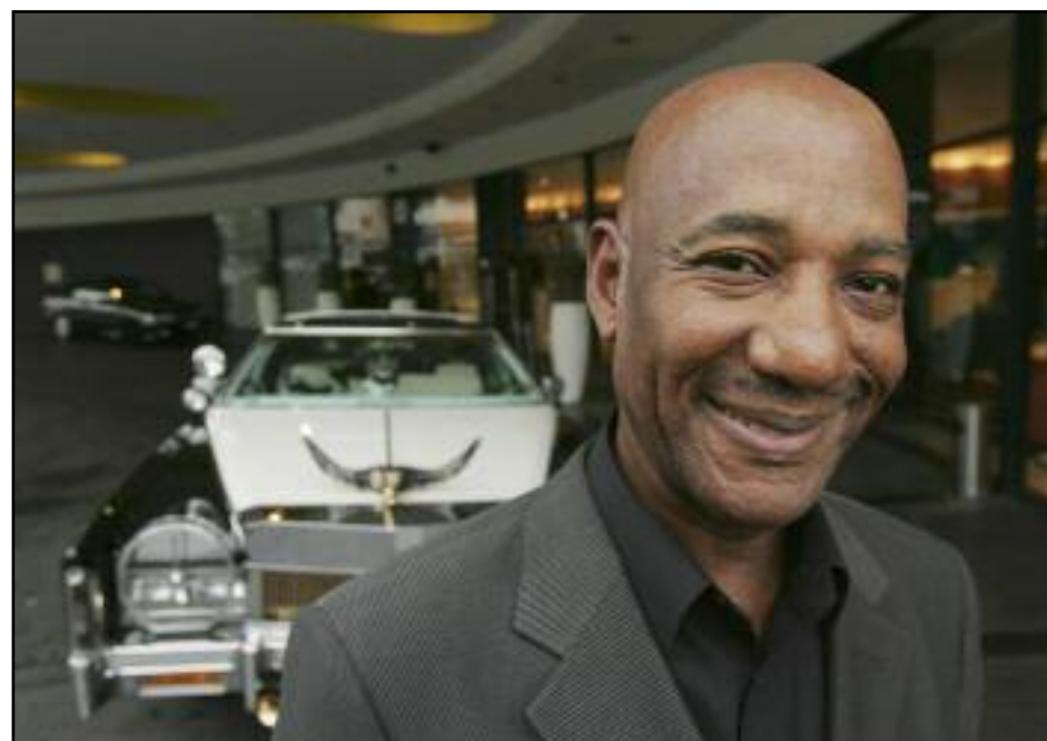
ERROL BROWN: the singer enjoyed at least one hit a year in the UK for 15 years

Late record producer and hitmaker Mickie Most signed up Brown