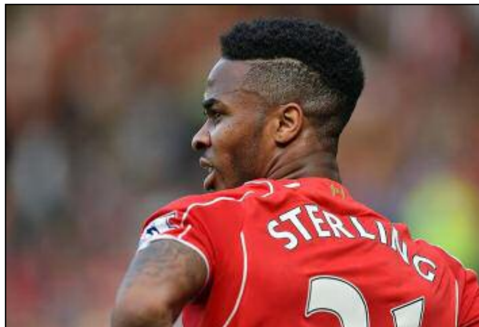
TURNING HIS BACK ON ANFIELD: relations between the star and the club have turned sour, and a big money move to one of Liverpool's rivals looks imminent