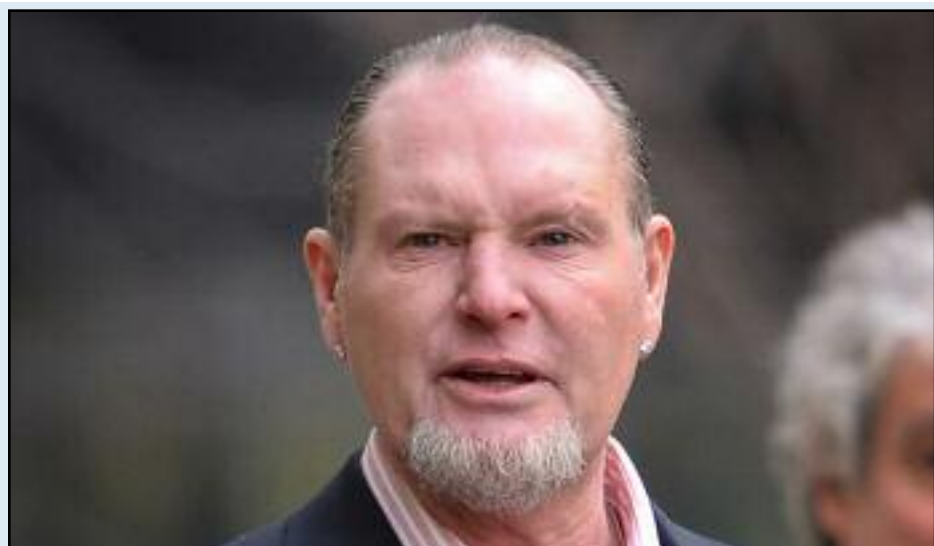
GAZZA ON THE MIRROR: "these guys have ruined my life. I have no life."