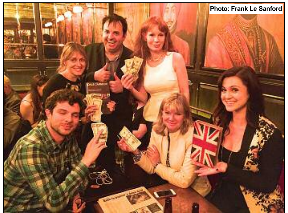
WINNING! The victorious team at our weekly pub quiz milk the moment