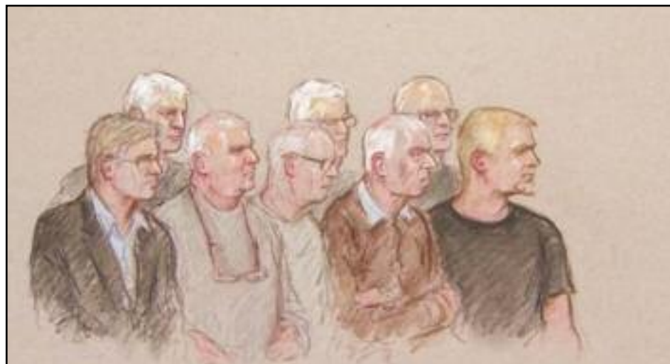
DIAMOND GEEZERS: attention was focused on the age of the defendants at Westminster Magistrates' Court, which ranged from 48 to 74

Detectives from the Met's Flying Squad arrested the men on