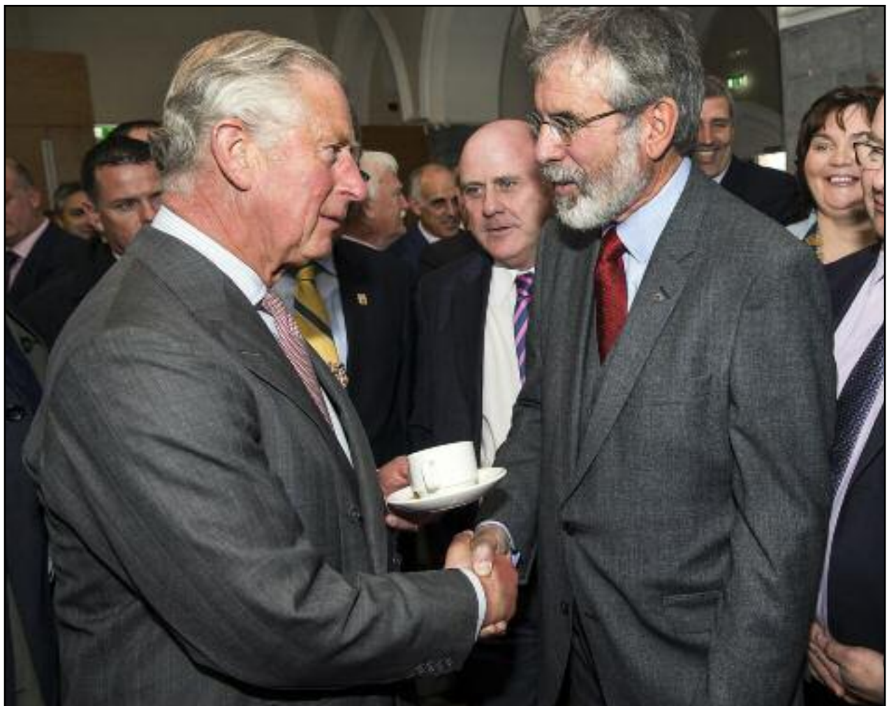
NO GREAT SHAKES? Prince Charles presses the flesh with Sinn Fein president Gerry Adams

As Mr Adams was meeting Prince Charles, one of his party's MP's, Paul Maskey, was attending a protest over Parachute Regiment shootings in the Ballymurphy area of west Belfast in the early