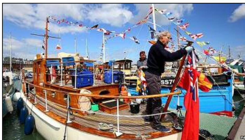
NOT FORGOTTEN: Hundreds of small vessels crossed the Channel between 26 May and 4 June 1940 to rescue hundreds of thousands of Allied troops

There are not many veterans still alive but a small number like Sgt Oates will make the