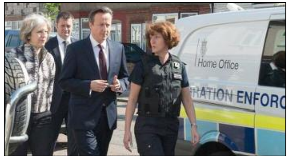
Cameron: the Prime Minister has pledged to restrict welfare and benefits for migrants

But while Britain remains part of the EU, its ability to place constraints on