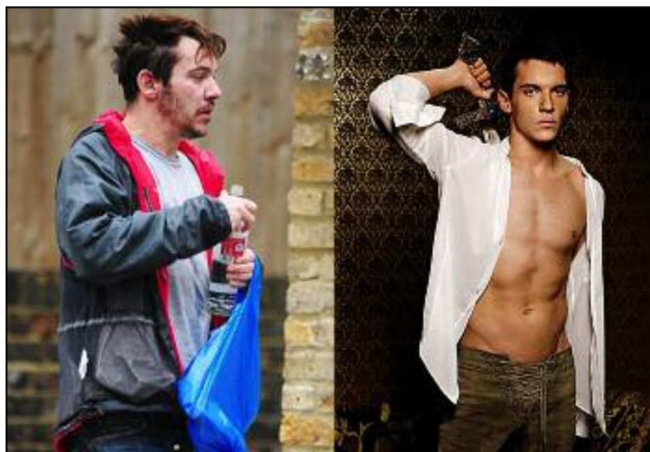
DECLINE AND FALL: Jonathan Rhys Meyers (left), looked in a sorry state as he was captured on a London street this week, in stark contrast to his role as Henry VIII in the Showtime series The Tudors (right) just eight years ago