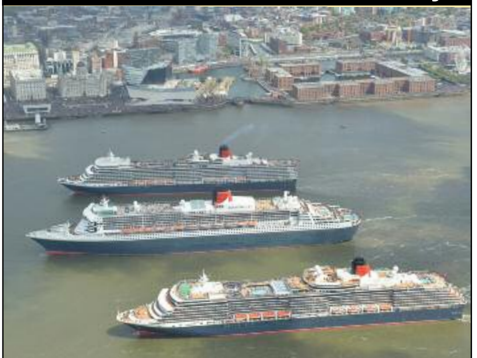
LINER NOTES: The Queen Mary 2, the Queen Victoria and the Queen Elizabeth came together for the first time in Liverpool this week to mark the 175th Anniversary of the cruise line Cunard (story, page 5)