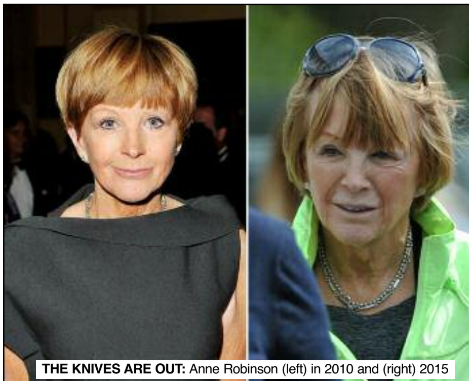
THE KNIVES ARE OUT: Anne Robinson (left) in 2010 and (right) 2015