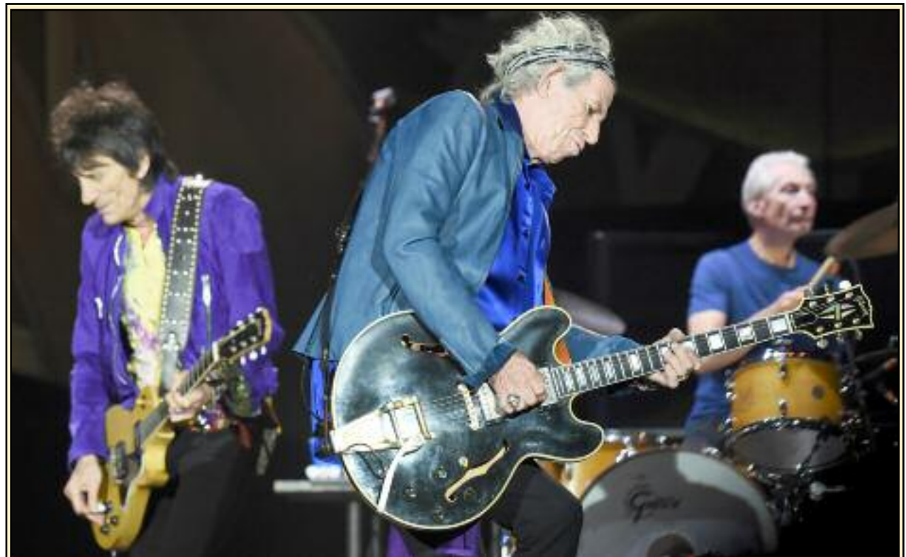
ROCK OF AGES: Ronnie Wood, Keith Richards and Charlie Watts of The Rolling Stones perform onstage during their Zip Code tour at Petco Park on Sunday in San Diego.