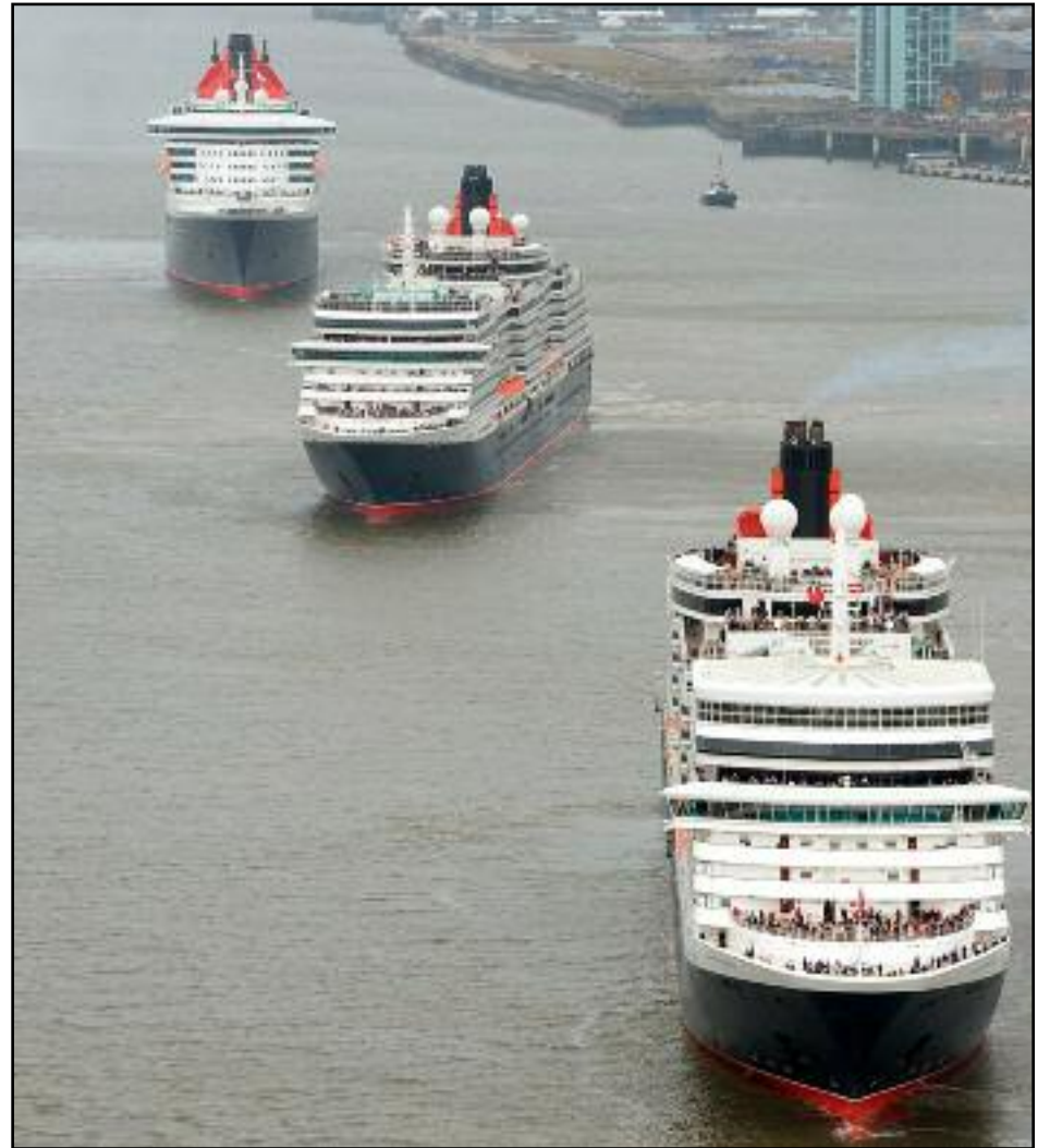
QUITE A SHOW: the Queen Mary 2, the Queen Victoria and the Queen Elizabeth delight the crowds in Liverpool on Monday

"Getting that close to the ships' manoeuvres, the heart of the city with the Three Graces as the backdrop - we always thought it would be incredibly special, but I think it surpassed