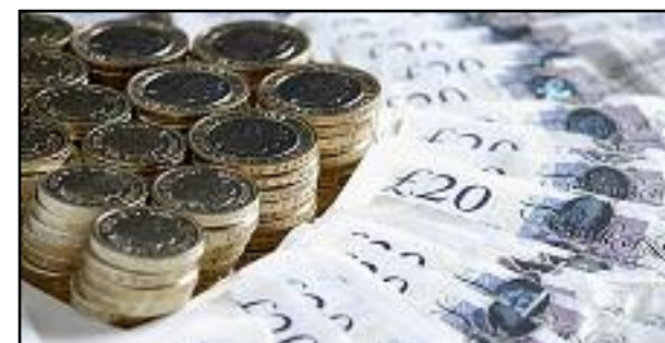
GOOD TIMES: Brits are splashing the cash

Manchester saw a 3.4 per cent drop while in