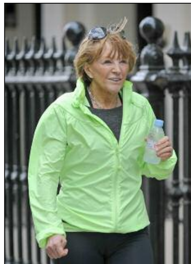
NO COMMENT: Anne Robinson in London this week

“I wouldn’t be surprised if she’s had a neck lift to keep her jaw nice and defined. The treatments and procedures have worked well for her but age and gravity can’t be kept at bay forever.”