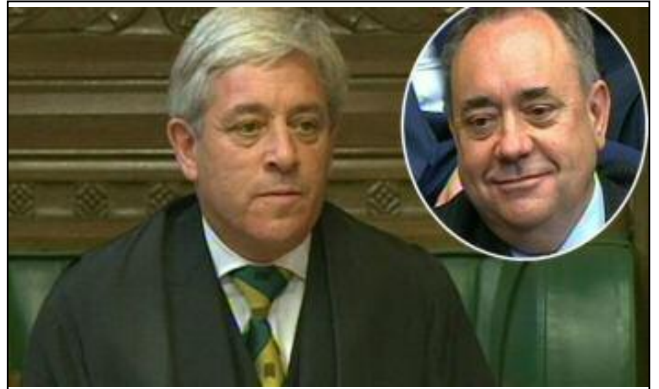
I would invite them to show some respect for the traditions of this chamber of the House of Commons - Speaker John Bercow (inset: Alex Salmond)

The Speaker ignored the first two instances but intervened after the third