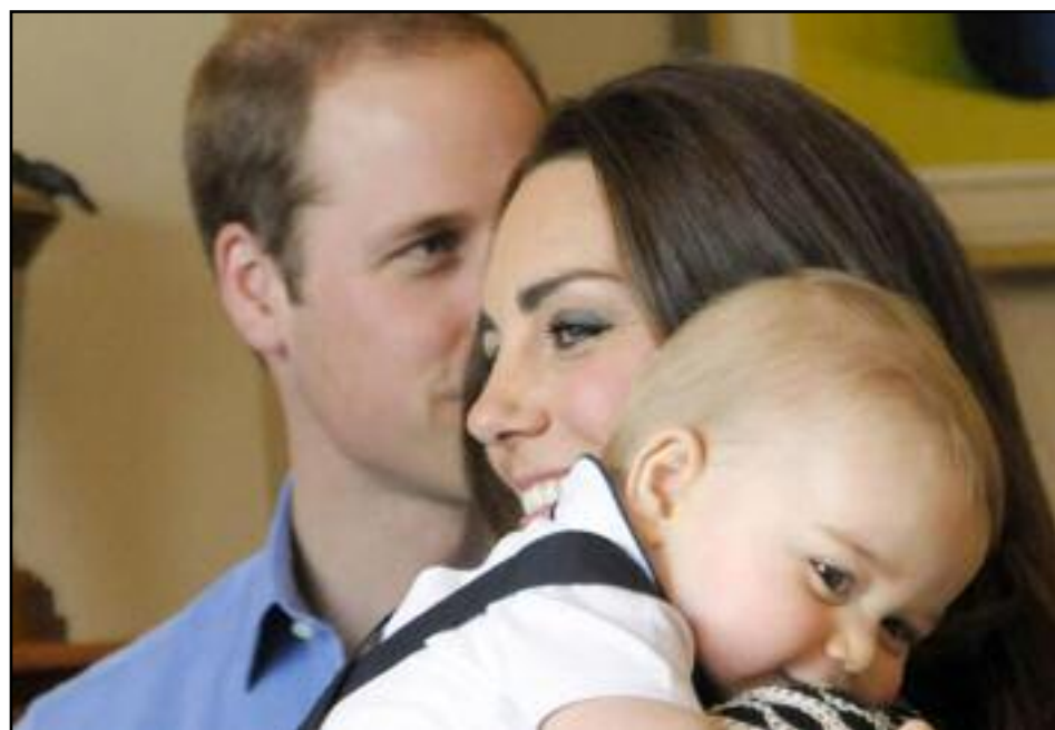
ROYAL APPROVAL? William will seek the Duchess of Cambridge's permission before he takes Prince George to his first Aston Villa match

William said he decided to support Villa while at school because he did not want to follow "run of the mill" teams such as Manchester United or Chelsea, which most of