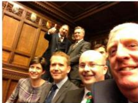
STICK FOR SELFIES: Some new MPs have been blasted for their social media antics

Selfie. Not of @NicolaSturgeon standard, but happy faces all the the same #snp @theSNP