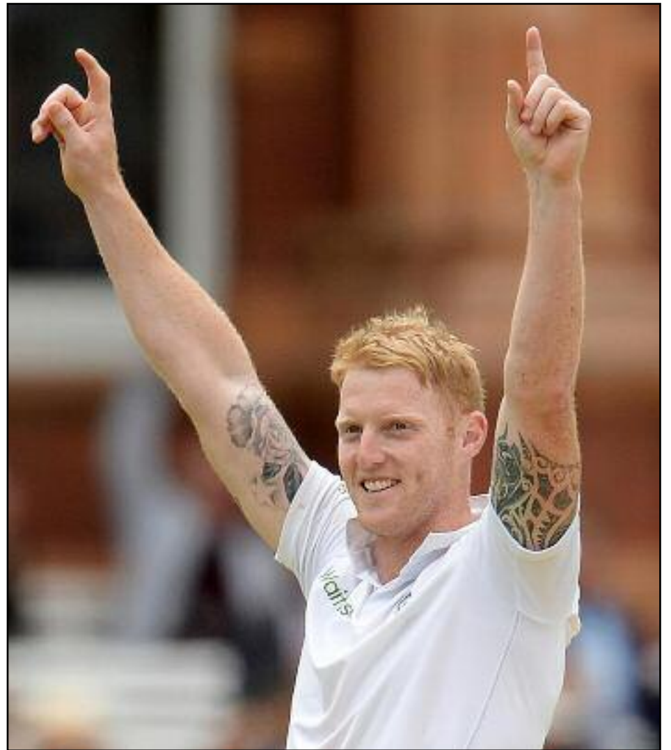
THIS WEEK'S HERO: Ben Stokes was in blistering form with both bat and ball at Lords as England won the First Test against New Zealand