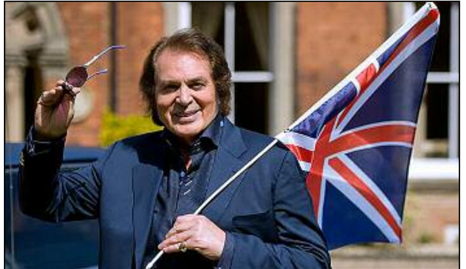
SCORING A ZERO: Engelbert finished second from bottom in 2012

The last time the UK won the competition in 1997, Katrina & The Waves performed their song Love Shine A