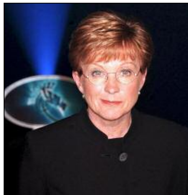
THE WAY SHE WAS: Anne Robinson in 2006