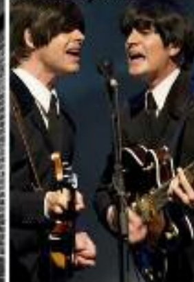
The People's Concert LLC

September 26, 2015 1:00 PM Strawberry Fields 11003 Rooks Road, Pico Rivera California 90660 www.facebook.com/beatlesfestival2015