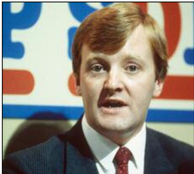
THE WAY HE WAS: Charles Kennedy shortly after winning election in 1987