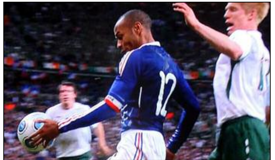
ANY QUESTIONS? Henry handballs ahead of the vital goal for France in the infamous World Cup qualifier in Paris in 2009

The spokesman added that the FAI was to repay the money if Ireland qualified for the 2014 World Cup in Brazil, which they failed to do. Fifa wrote off the loan on 31 December 2014. The Aviva Stadium was the only major ground redeveloped during that period.