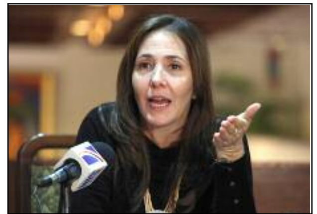
WELL CONNECTED: Mariela Castro Espin is the director of the Cuban National Center for Sex Education in Havana and an activist for LGBT rights in Cuba

We also bumped into one of Britain's national treasures, comedienne Catherine Tate at the Dancing with Films festival screening of her new film SuperBob in West Hollywood.