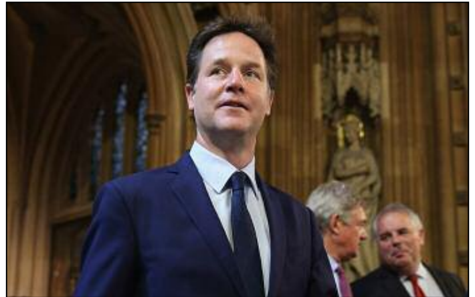
PAYBACK: Mr Clegg banned Liberal Democrat ministers from attending the Winter Olympics in Sochi in protest at Russia’s new anti-gay legislation.