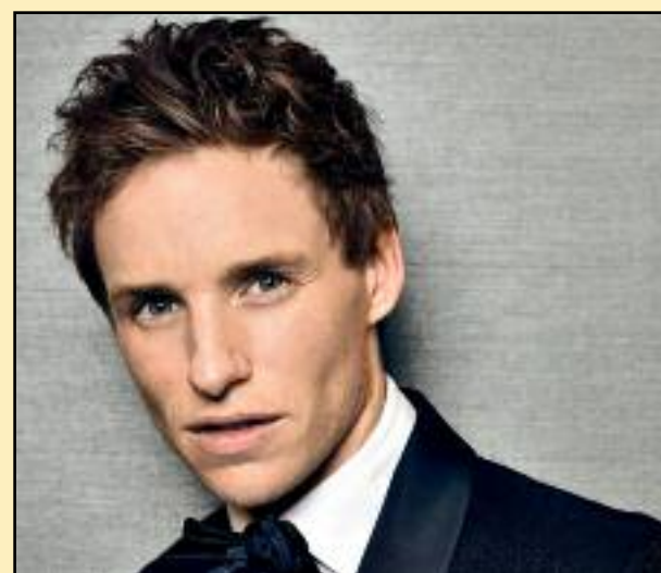
REDMAYNE: the Oscar-winner is on a hot streak...

This has been an incredible year for Redmayne. His portrayal of Stephen Hawking in