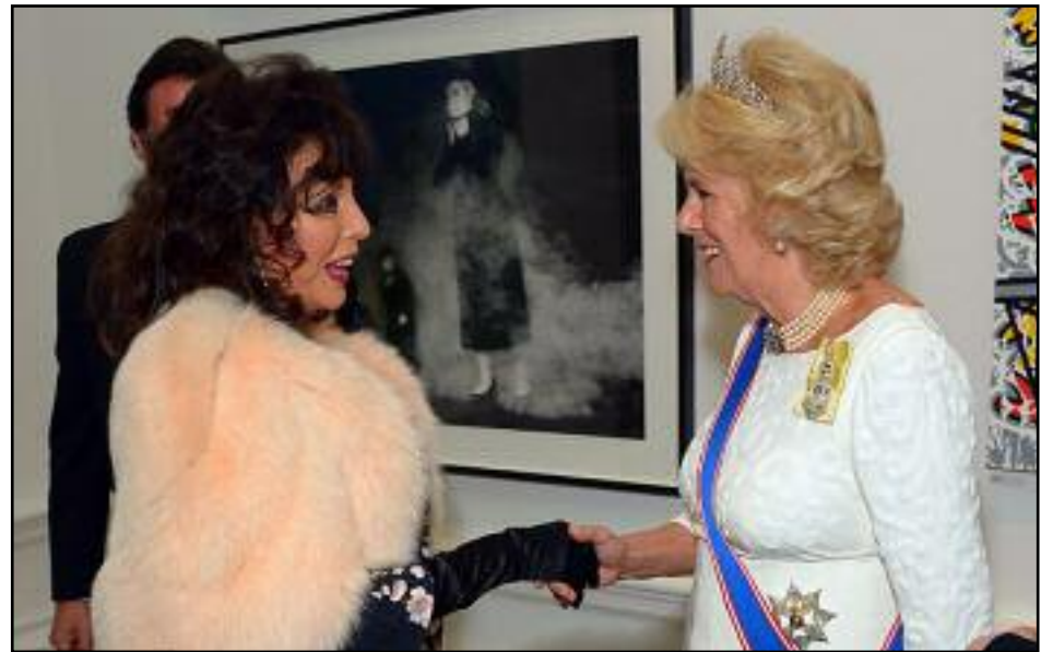
POWER COUPLE: the star and the royal were introduced as Camilla took her place as the guest of honour at the Royal Academy's gala dinner

famously allows artists to 'touch-up' their paintings before the public arrive.