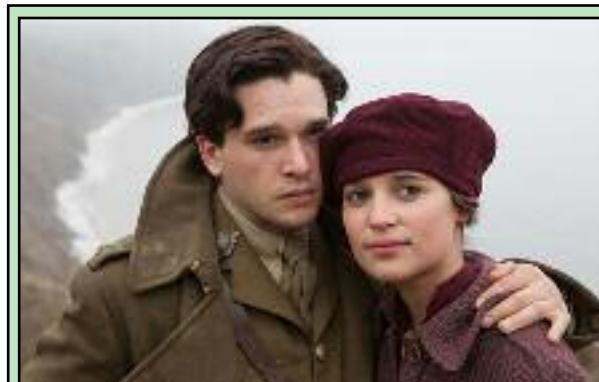
GOODBYE TO ALL THAT: Kit Harrington and Alicia Vikander star in a new version of the WWI classic

“This research suggests that both sides of the referendum campaign might want to be wary of those who are keenest to lead the charge for them.”