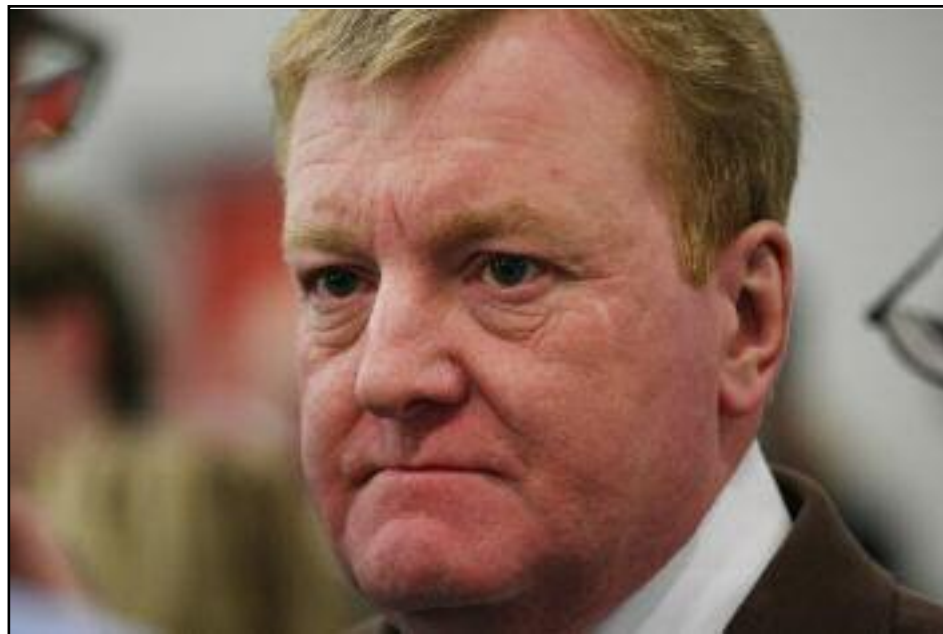
KENNEDY: his career was cut short by a very public drinking problem

Kennedy led the party to an improved showing in the 2001 general election, when it captured more than 18% of the vote and, more importantly, 52 seats. His success was repeated in the 2005 election four years later, during which the party announced its