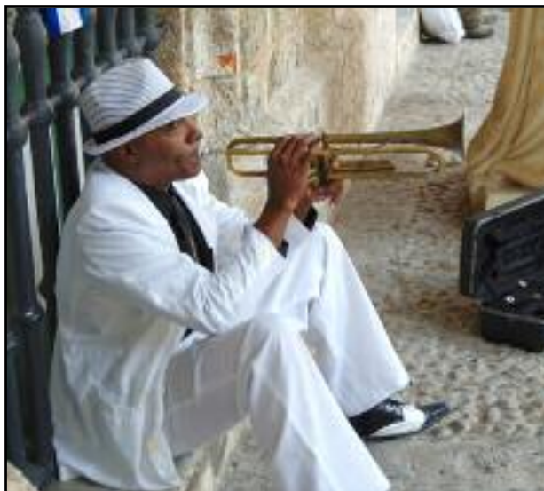
STREET LIFE: there is music everywhere in Havana

much, from the history, the education and politics. We were very fortunate to meet with Cuba's president Raul Castro's daughter, Mariela Castro Espin, who is an advocate for LGBT rights. We also enjoyed a private dinner with Ricardo Alarcón de Quesada who is a Cuban statesman. He served as Cuba's Permanent Representative to the United Nations (UN) for nearly 30 years and later served as Minister of Foreign Affairs from 1992 to 1993. He's very happy the embargo has been lifted, but doesn't want America to think they can come in and start telling the how to run their country. (fair enough!)