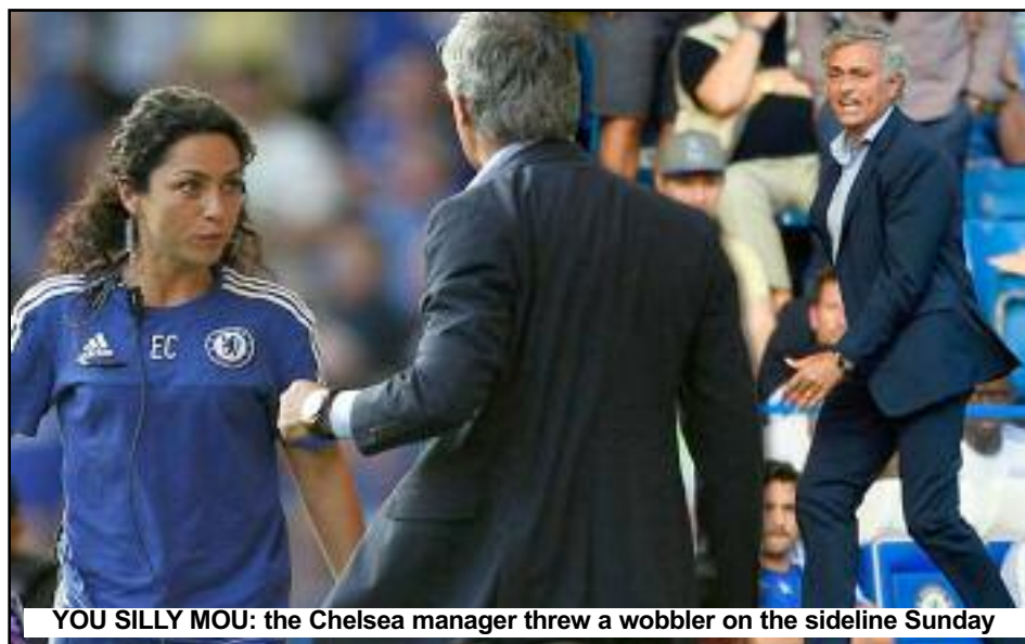
YOU SILLY MOU: the Chelsea manager threw a wobbler on the sideline Sunday

JOSE MOURINHO found himself at the center of yet another controversy this week as he was bitterly criticized for demoting team doctor