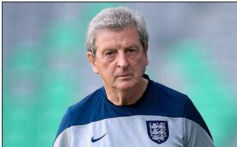
HODGSON: the England manager's contract expires at the end of Euro 2016