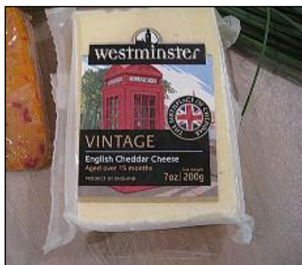
RAW MATERIALS: Trader Joes usually has some good English cheese

month and started with a Sainsburys, Marks & recce/field trip - this Spencers, Tesco and for entailed visits to Waitrose, good measure Morrisons.