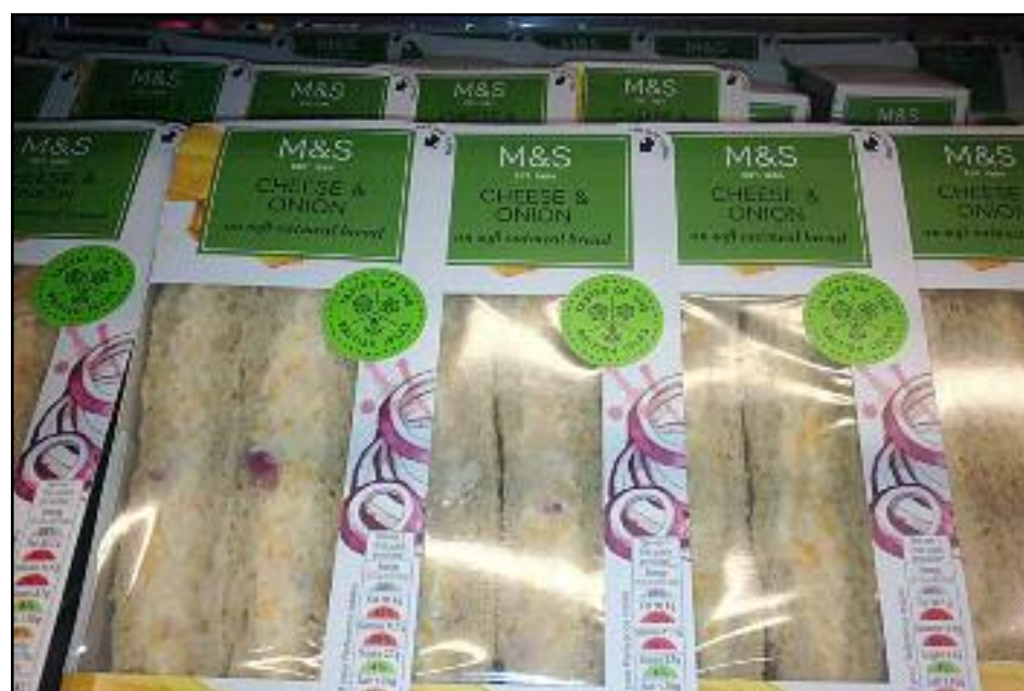
THE GOLD STANDARD: the M&S cheese & onion sandwich

Upon researching the recipe I discovered that the cheese & onion sandwich is so popular that some grocery stores even sell the filling as a standalone product. So I thought it was only fair for me to share my discoveries with you. I took advantage of being in London this