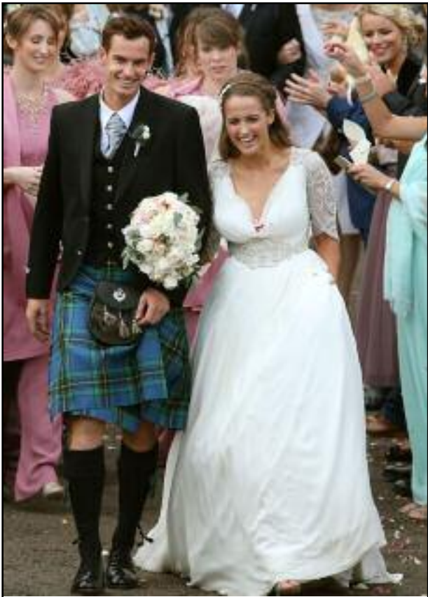
ANDY AND KIM: married in Dunblane in April