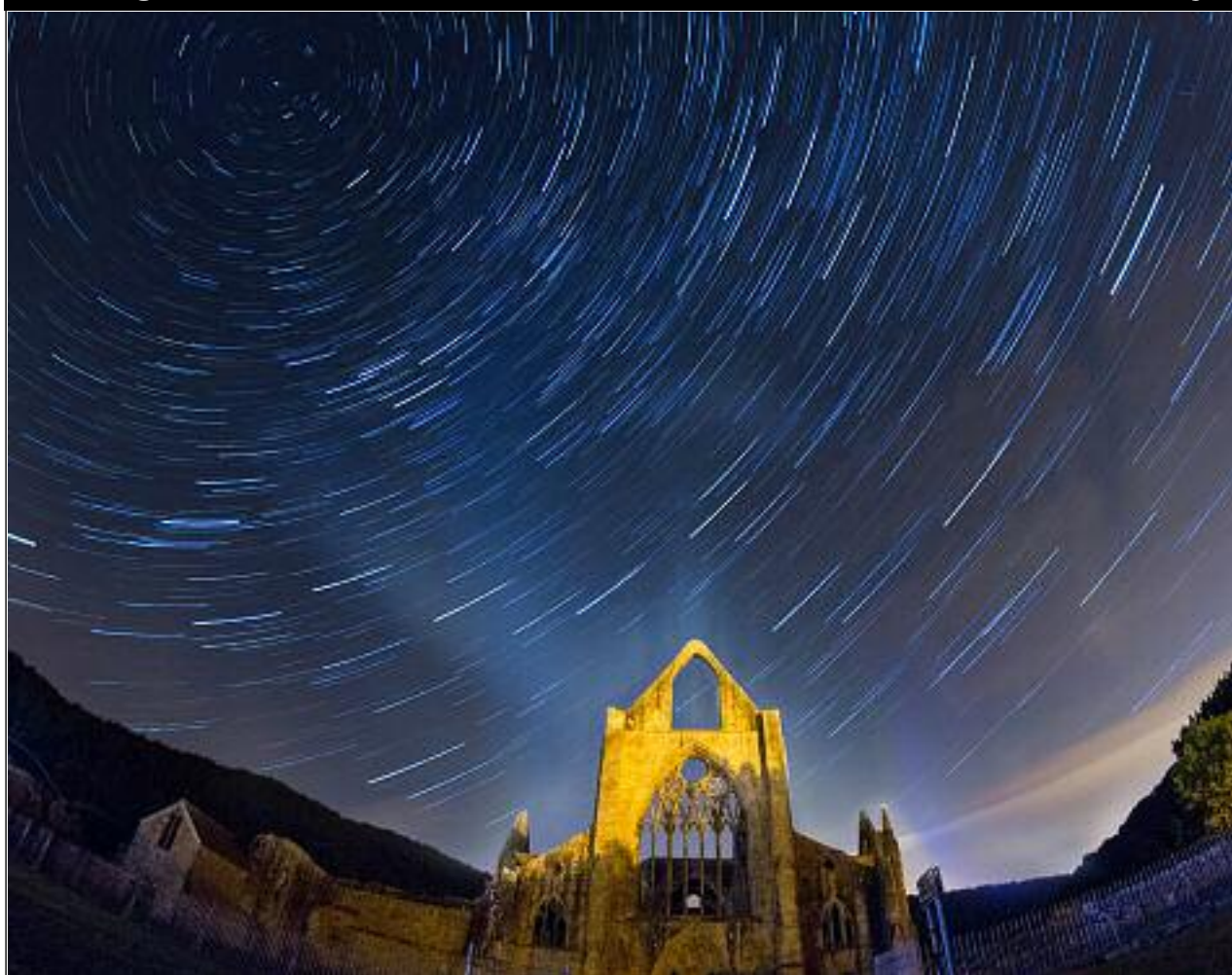
NATURE'S MAJESTY: The Perseid Meteor shower as seen from Tintern Abbey in Monmouthshire on Wednesday. Stargazers in the Midlands and the North enjoyed the country's best view of this week's dazzling celestial display