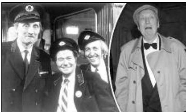
DEFINING ROLE: Lewis with Reg Varney and Bob Grant in On the Buses, which ran from 1969 to 1973