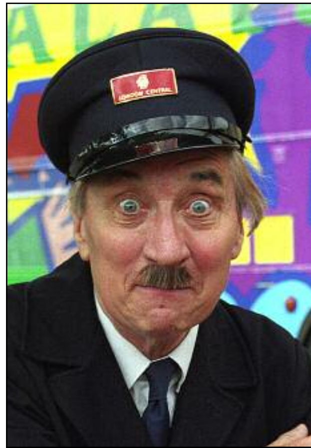
LITTLE HITLER? Lewis's resemblance to a certain German dictator was part of the show's appeal

His break out role in On The Buses came in 1969, and the series ran