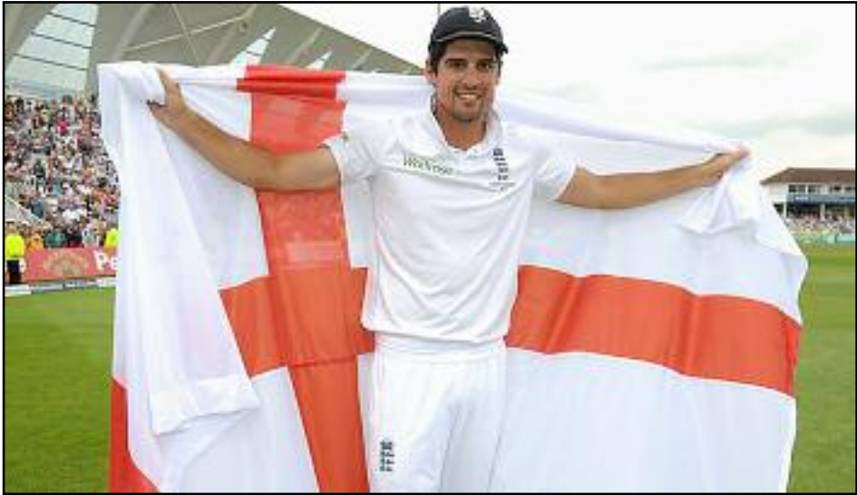
HOW DID WE GET HERE? Alastair Cook celebrates regaining the Ashes at Trent Bridge