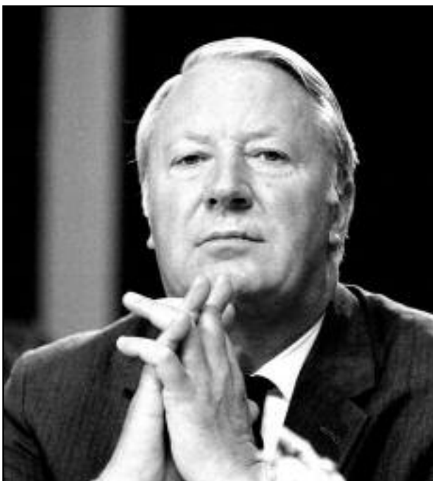
LIFELONG BACHELOR: Seven forces are now investigating sex abuse claims against the former PM