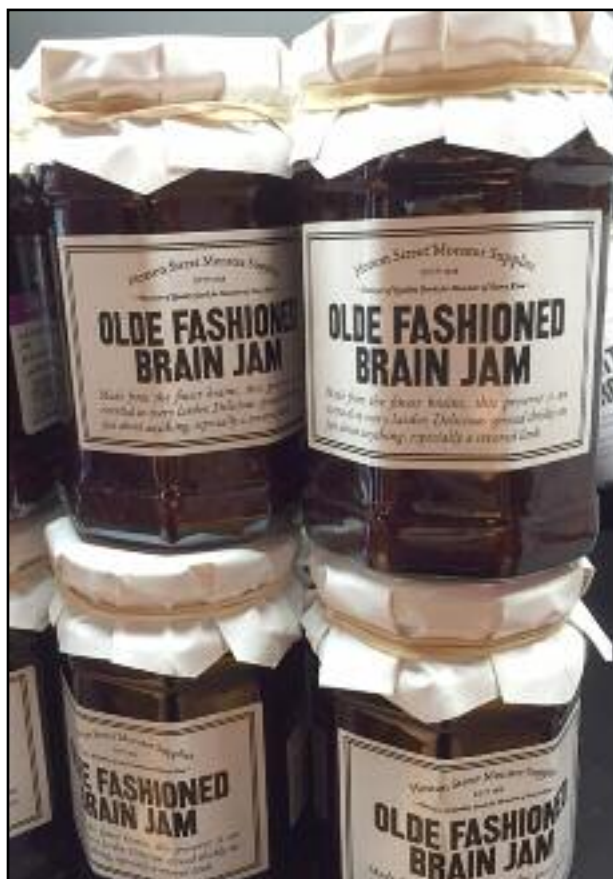
ZOMBIE PRESERVES: Brain jam is always a good choice if you're stuck for an original gift

goodies, which are mostly variants of popular British sweets, include Olde Fashioned Brain Jam, Cubed Earwax Toffee, A Vague Sense of Unease, Creeping Dread, The Heebie-Jeebies, Banshee Balls and The Collywobbles. We really do have a macabre sense of humor, don't we?