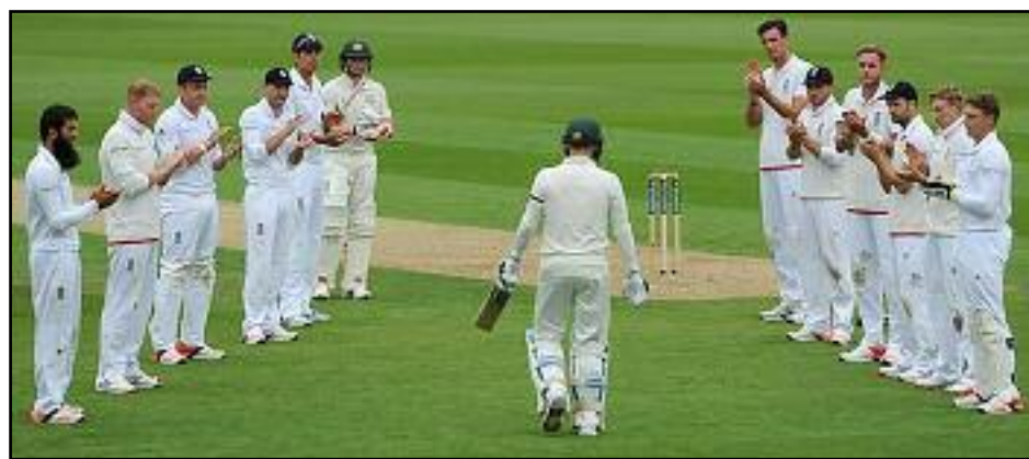
END OF AN ERA: in his last Test appearance, Australia skipper Michael Clarke was applauded to the crease by the England team at The Oval