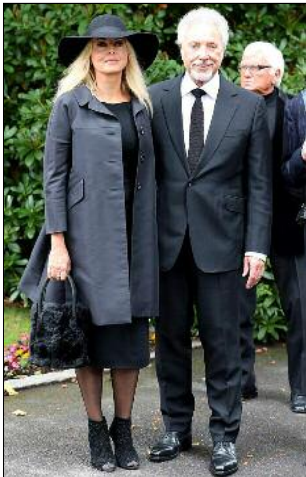
MOURNERS: Carol Vorderman and Tom Jones

He added: "The people of Liverpool really, really love her, her heart is here and now she's here as well."