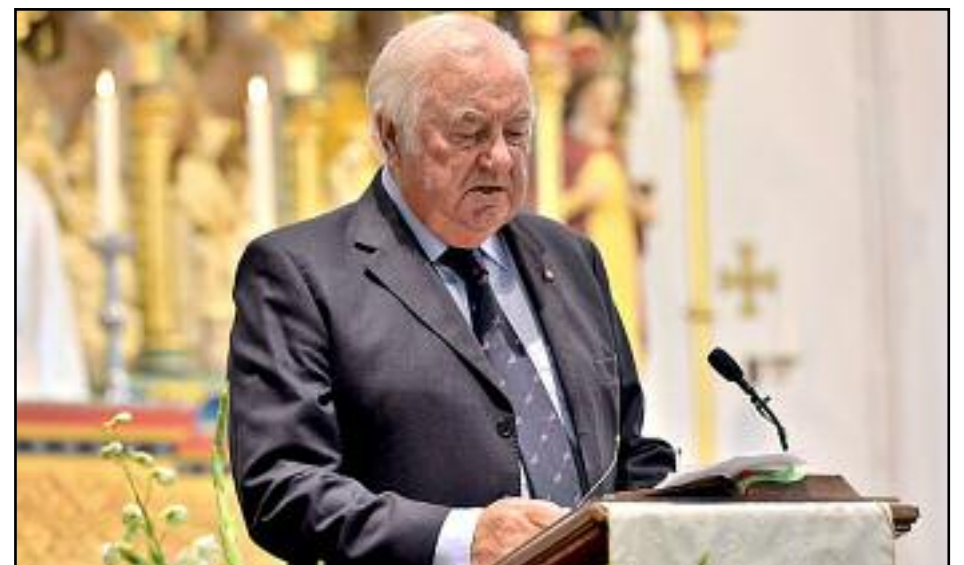
HOMEBOY: Comedian Jimmy Tarbuck was among the readers at the service