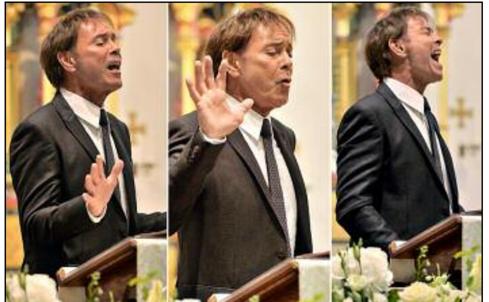
OLD FRIEND: Sir Cliff Richard gave an emotional rendition of his song Faithful One mother".

Comedian Les Dennis said the nation has "lost a friend, a sister, a