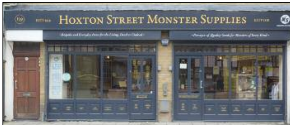
ONLY IN ENGLAND: The wonderful Hoxton Street Monster Supplies store

One truly amazing and very British place is Hoxton Street Monster Supplies , which sells 'bespoke and everyday items for the Living, Dead or Undead'. Their