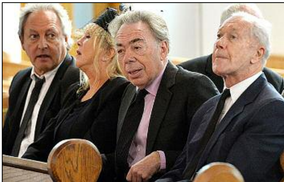
SHOWBIZ ROYALTY: Lord Andrew Lloyd Webber paid his respects on Thursday