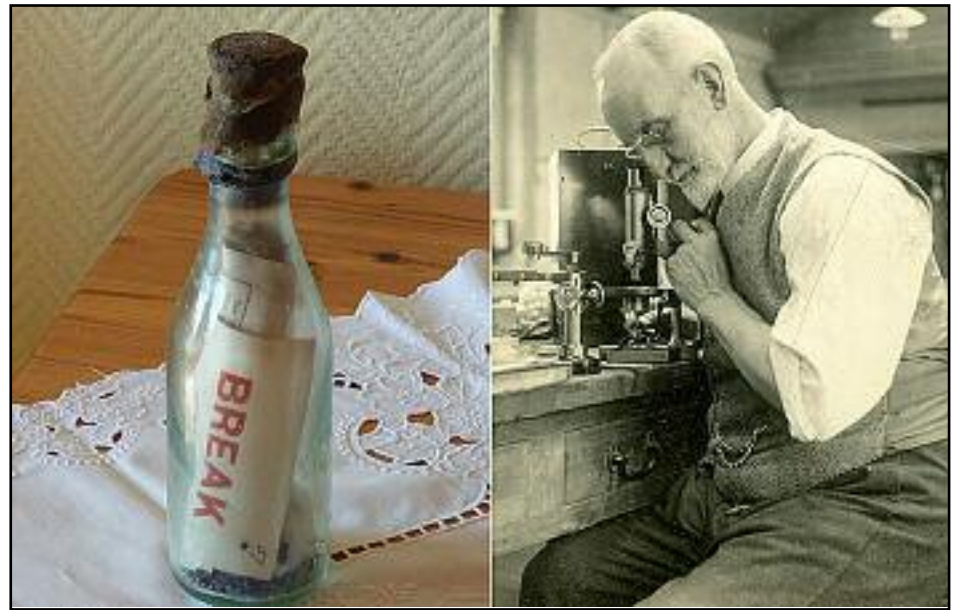
HIGH TECH THEN: The oldest message in a bottle in the world, (left) and George Parker Bidder who released the bottle into the North Sea between 1904 and 1906

"We're still waiting for confirmation from the Guinness Book of