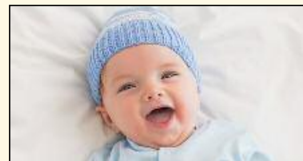
WHAT'S IN A NAME? posh is still better, apparently

"Ten years ago, the ONS was quite happy to announce in its press release that Mohammed – then apparently the preferred spelling – had