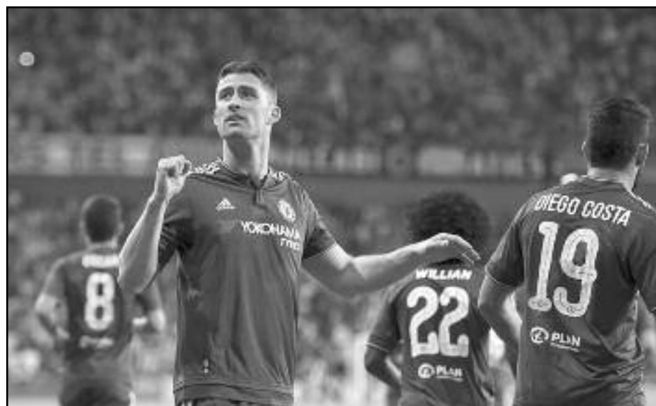
STRIKE ONE: Gary Cahill's strike put Chelsea ahead in Israel on Tuesday

Campbell can still be raw sometimes but he has good acceleration and his first thought is always to head goalwards. He had cut in from the right, with the ball on his left boot, and his angled pass sliced open the Dinamo defence. Sánchez darted in to take the ball around the goalkeeper Eduardo and scooped his shot high into the exposed goal.