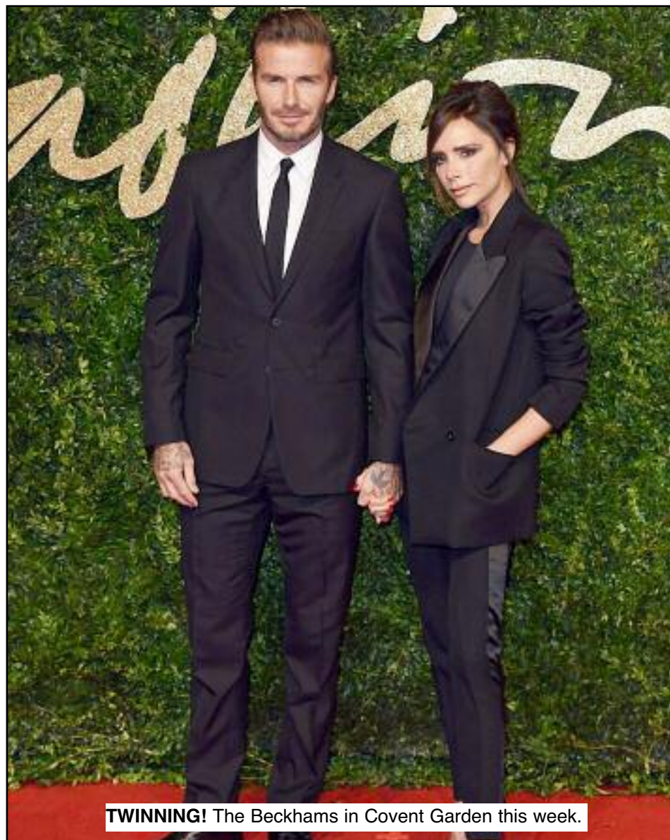
TWINNING! The Beckhams in Covent Garden this week.

As for David, he did what he does best. He stayed quiet, smiling broadly, letting his wife enjoy the lion's share of the attention. In other words, he was taking one for the team, yet again..