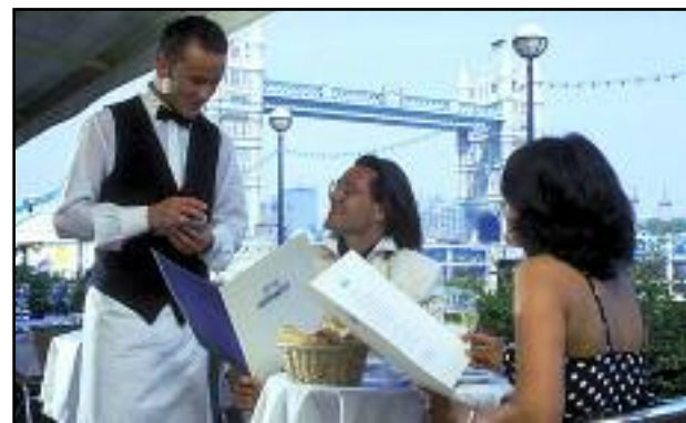
CAPITAL NOURISHMENT: Londoners still spend the most when it comes to eating out