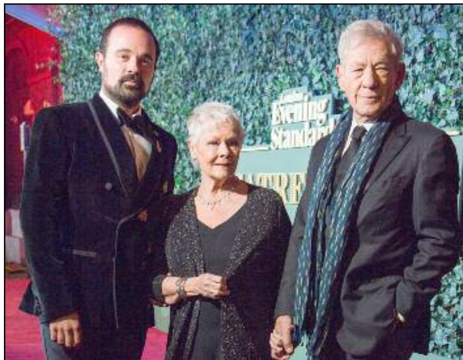
STANDARD FARE: Evening Standard publisher Evgeny Lebedev with Dame Judi Dench and Sir Ian McKellen at Sunday night's awards at the venerable Old Vic