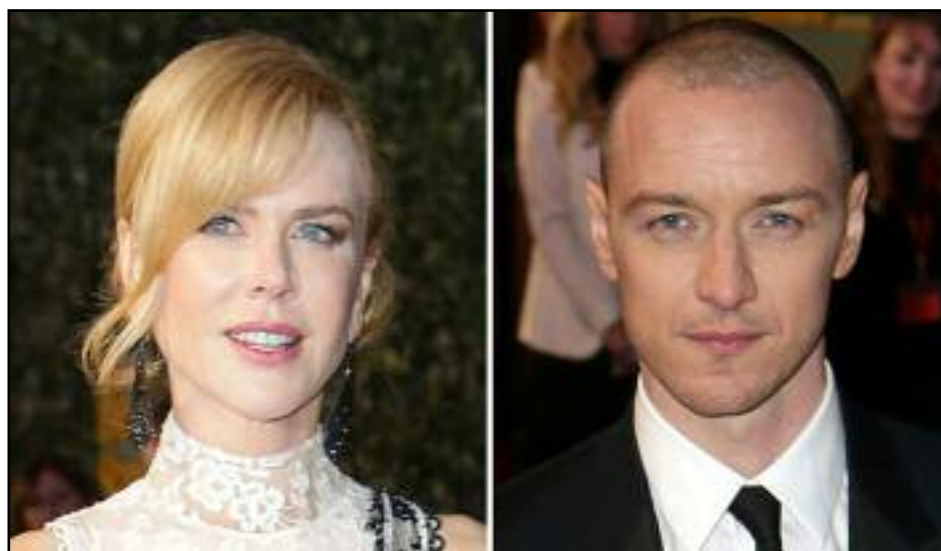
TAKING THE LEAD: Nicole Kidman picked up the Best Actress gong for the play Photograph 51 , while McAvoy got the nod for his turn in The Ruling Class

Gemma Arterton was named best newcomer in