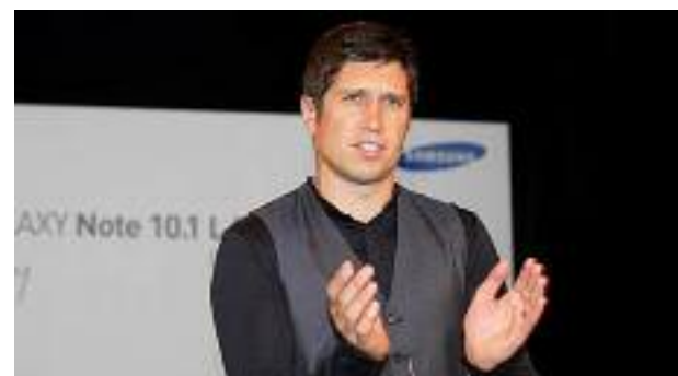
AMBASSADOR: Bolton, home of former model and now heartthrob TV presenter Vernon Kay, is the nation's capital of smooth, according to the report

By contrast, people in Stoke-on-Trent are the least likely to treat themselves to dinner, spending 80% less than the UK average.