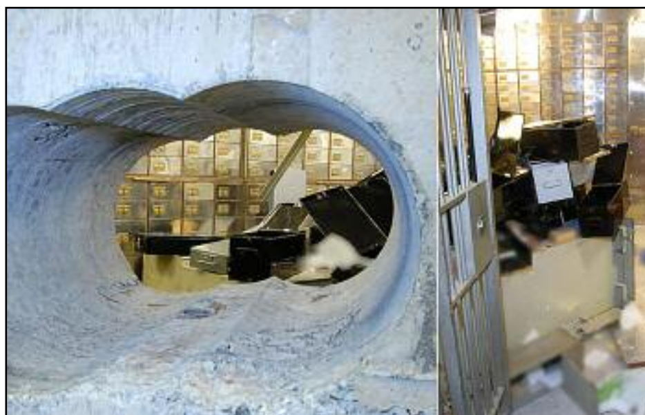
EXPERTS: The thieves used a drill to bore a hole 20in deep into the vault

Once inside the building, the men disabled the lift, leaving a handwritten "out of order" note, to allow them a short drop down the lift shaft to the basement below.