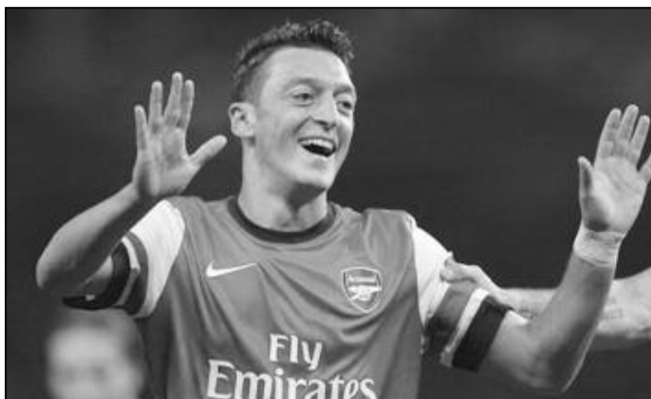
MESUT OZIL: another influential performance for Arsenal on Tuesday night

Arsenal's Champions League hopes are still alive after they eased to a 3-0 victory against Dinamo Zagreb at Emirates Stadium on Tuesday night.