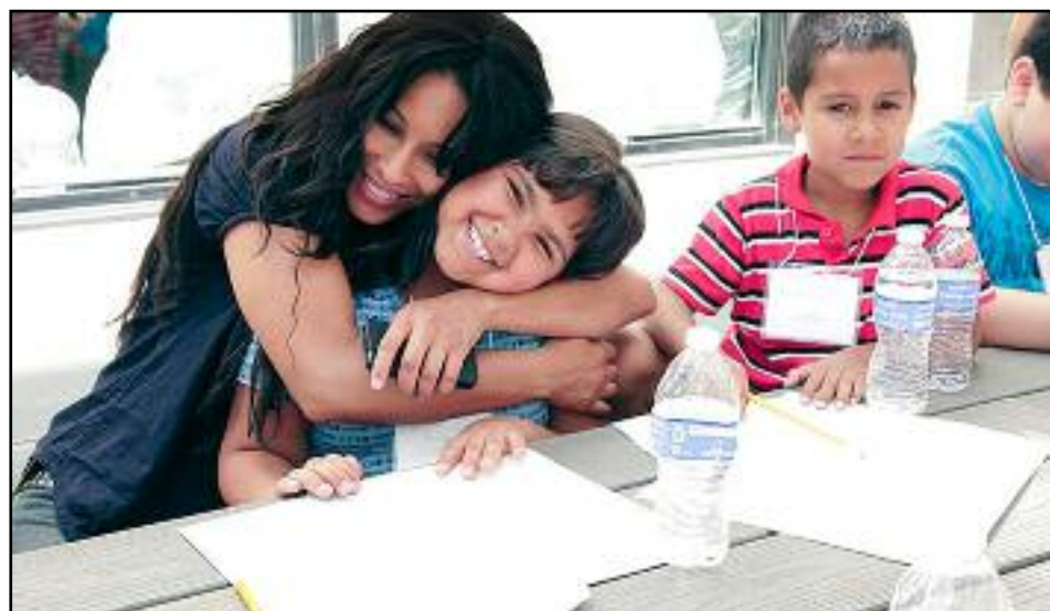
ADOPT A LETTER: It makes all the difference in the world...