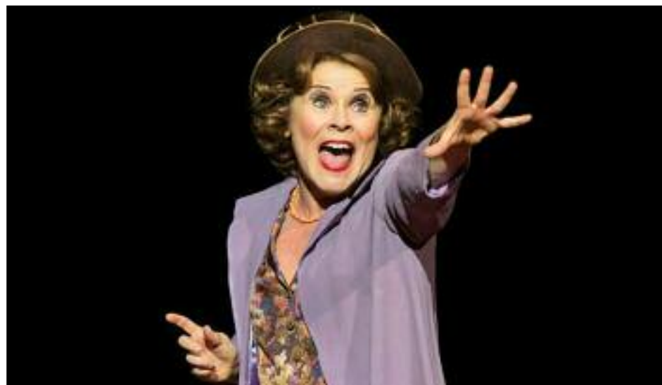
POPULAR CHOICE: Imelda Staunton got a standing ovation as she scooped the Best Musical Performance prize for her role as Mama Lee in Gypsy