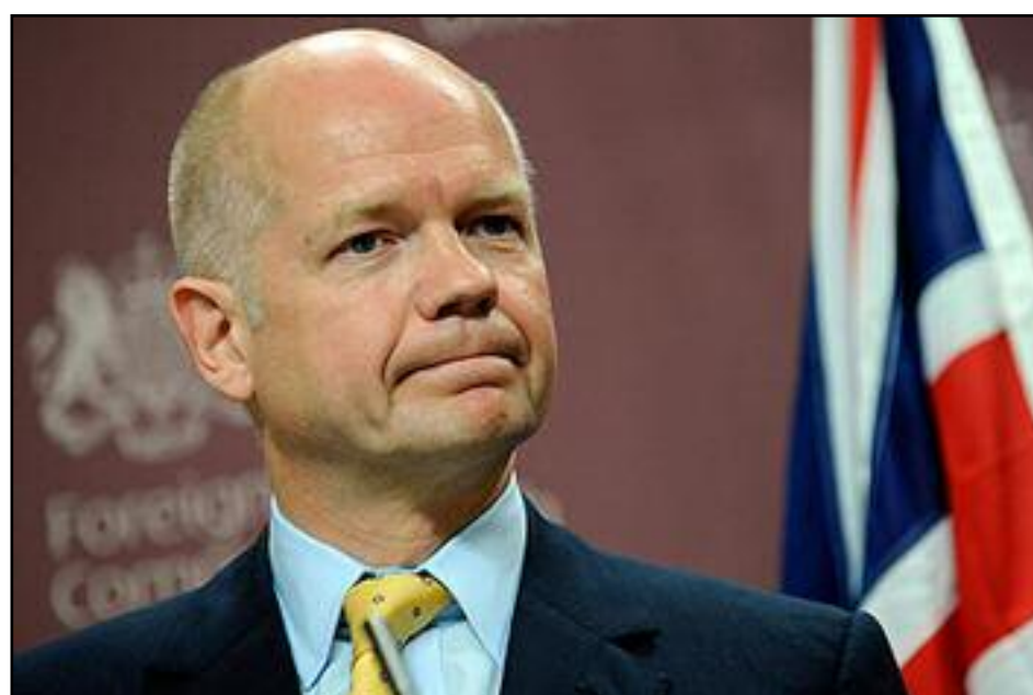
HAGUE: "A subdivided Syria might now be the only one that can be at peace."

He added: "A subdivided Syria might now be the only one that can be at peace."