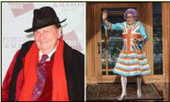
CONTROVERSY: Barry Humphries and his alter-ego, Dame Edna Everage