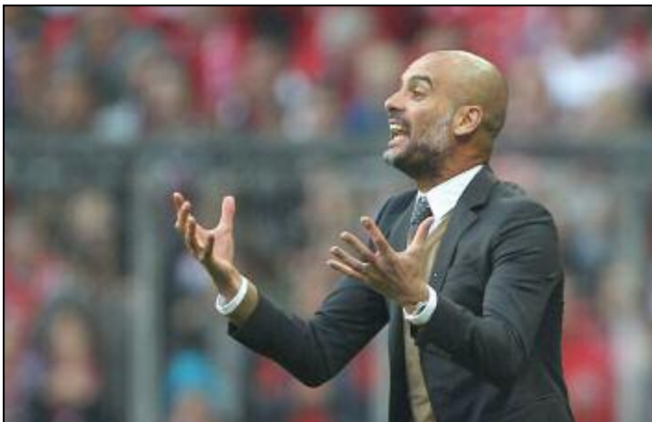
MAGIC MAN: Pep Guardiola's announcement that he will manage in England next season is expected to spark a bidding war among the Premiership's biggest clubs

Pep Guardiola will likely spark a bidding war between English football's biggest clubs following his announcement that he will leave Bayern Munich at the end of the season to try his luck in the Premier League.