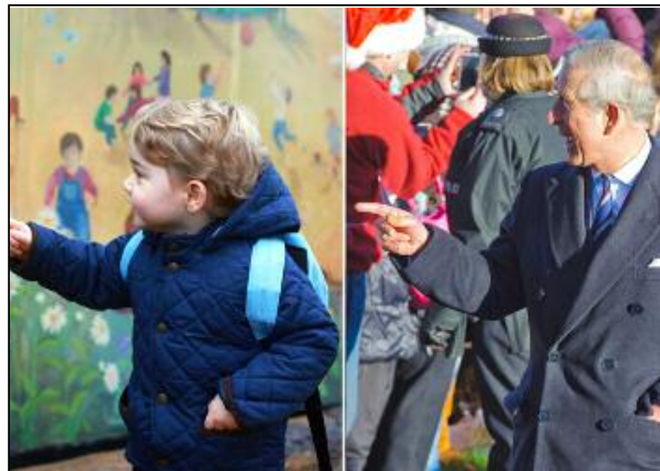
JUST LIKE GRANDPA: with one hand in his pocket and the other pointing, Prince George seems to have already picked up the royal body language

After meeting his new classmates, Prince George will have been given a choice of activities, in keeping with the Montessori method of nursery