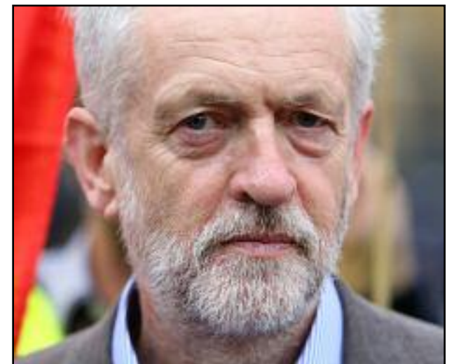
CORBYN: remaking the Shadow Cabinet in his image

Mr McFadden said Mr Corbyn had told him he thought his comments were "an attack on him and that he had come to the conclusion because of that and one or two other things that I shouldn't continue".