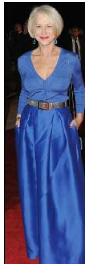
BEST OF BRITISH: Dame Helen Mirren in Palm Springs

Dame Helen's blonde edgy cropped bob, gave her red carpet look a modern glow and her stunning pink-lipped smile helped add yet