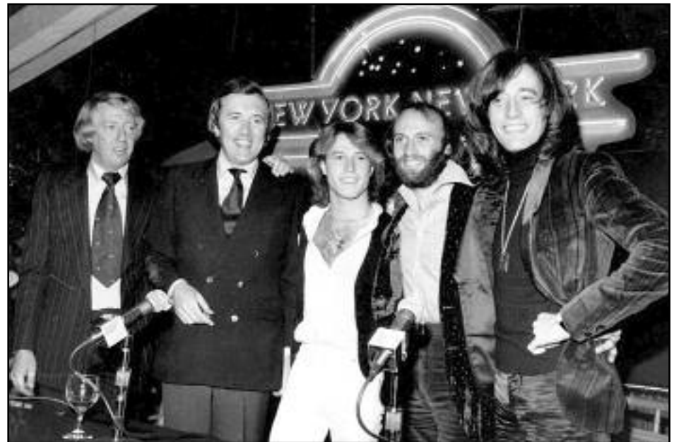
GLORY DAYS: Stigwood with David Frost, and Andy, Maurice and Robin Gibb

After an unpromising spell as an orderly at a sanitarium, Stigwood moved into regional theatre before spotting John Leyton a handsome young singer who he believed could propel him to the big time. After changing the singer's name to John St Cyr and landing him a part on a popular TV soap opera of the time, Stigwood saw his young charge's debut single, Johnny Remember Me , top the British charts, propelling Stigwood onto the A-list of music managers in 1960s London, where he made plenty of enemies with his aggressive attempts to poach talent from other managers. One day he crossed the wrong man, when he tried to lure the Small Faces from Don