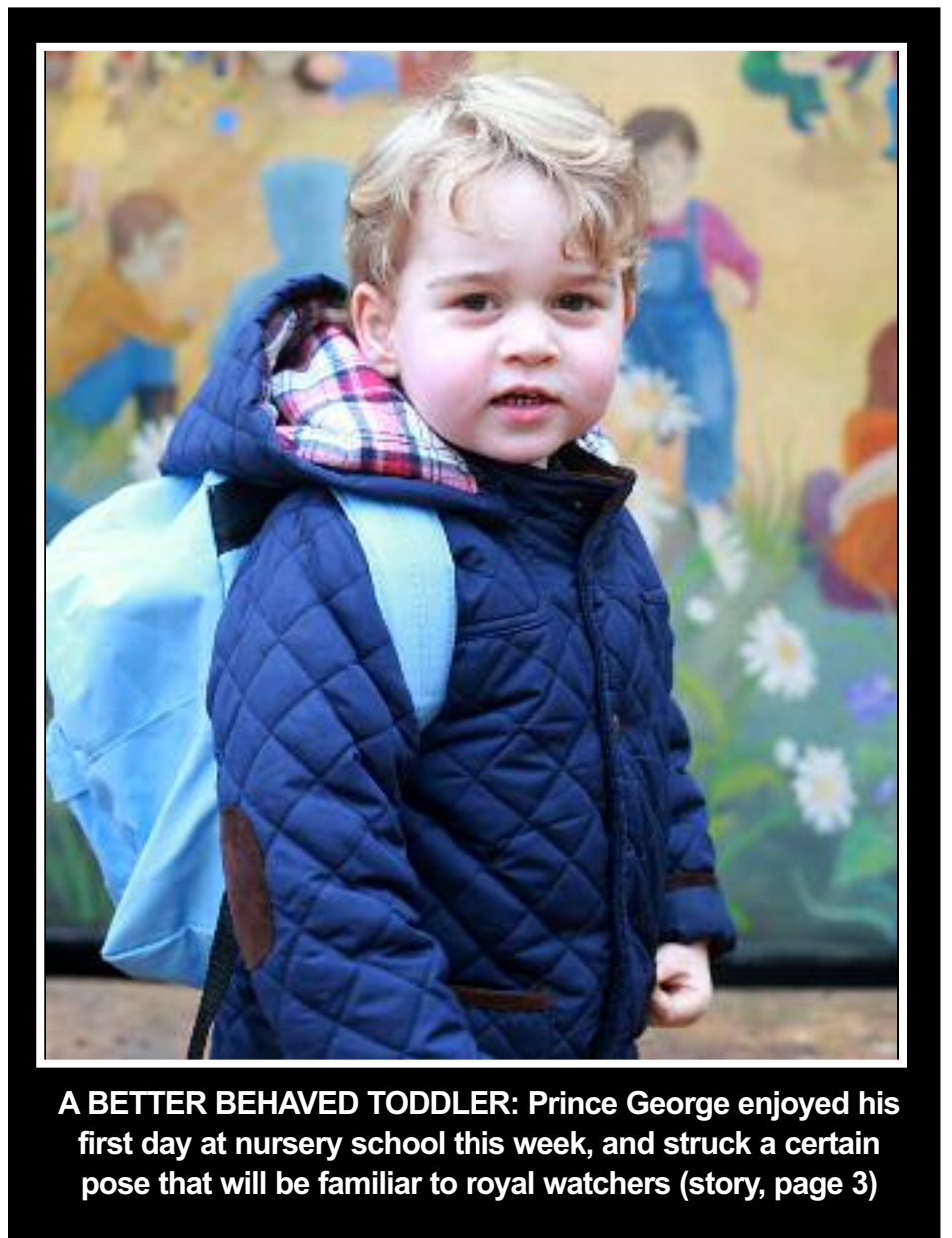
A BETTER BEHAVED TODDLER: Prince George enjoyed his first day at nursery school this week, and struck a certain pose that will be familiar to royal watchers (story, page 3)