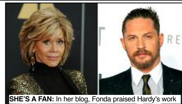
SHE'S A FAN: In her blog, Fonda praised Hardy's work

Hardy, who got his big break in the HBO series Band of Brothers , will