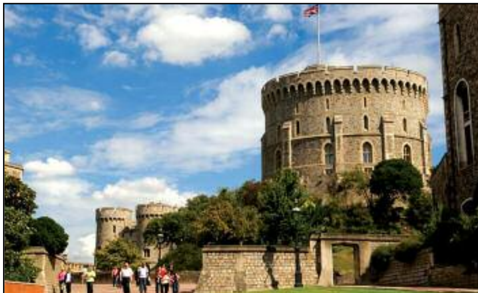
'It's been remarked on that it seems a little like something that a hotel chain might do. And we are definitely not that' - Windsor Castle source

"The jury is so divided on the issue. You are just as likely to go to a grand house or royal residence and find a duvet on the bed as you are to go to a very good hotel and find them still using sheets, blankets and eiderdowns. There is no hard and fast rule on it. It is very much a matter of personal preference," she told the paper. "Many like to use a duvet and throw a bedspread on it in order to retain that traditional look."