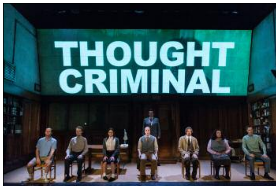
DEEPLY UNSETTLING: 1984 opens Jan. 13th at Santa Monica's Broad Stage

The doomed Winston Smith is a lowly party apparatchik in the Ministry of Truth whose job is to rewrite history to reflect today's party line, which could, of course, change tomorrow. Disillusioned and scared, Smith secretly hates Big