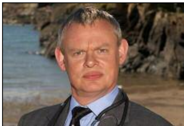
CURMUDGEONLY MANNER: Clunes as Doc Martin

of his successful London practice after he suddenly develops a fear of blood. Arriving in the sleepy Cornish village of Portwenn, where he spent many happy holidays as a child, Doc Martin (as the locals insist on calling him, to his annoyance) inherits a clinic in disarray and an incompetent receptionist. He then proceeds to rub