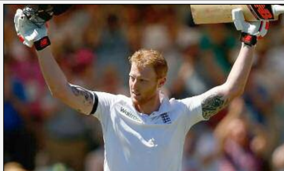
HISTORY MAN: Ben Stokes hit the fastest double century for England and the second fastest in history, on day two of the second Test with South Africa in Cape Town. Stokes, in his 21st Test, resumed on 74 and raced to 200 in 163 balls to beat Ian Botham's 220-ball record. Jonny Bairstow (150) struck his maiden Test century and shared in a stand of 399, a sixth-wicket world record. Only New Zealand's Nathan Astle has reached a Test double hundred more quickly than Stokes, off 153 balls against England in 2002.

The depth to which England bat was their salvation, chiefly in the shape of Bairstow, who followed his 150 not out in the first innings with an unbeaten 30 during a stand of 43 with the