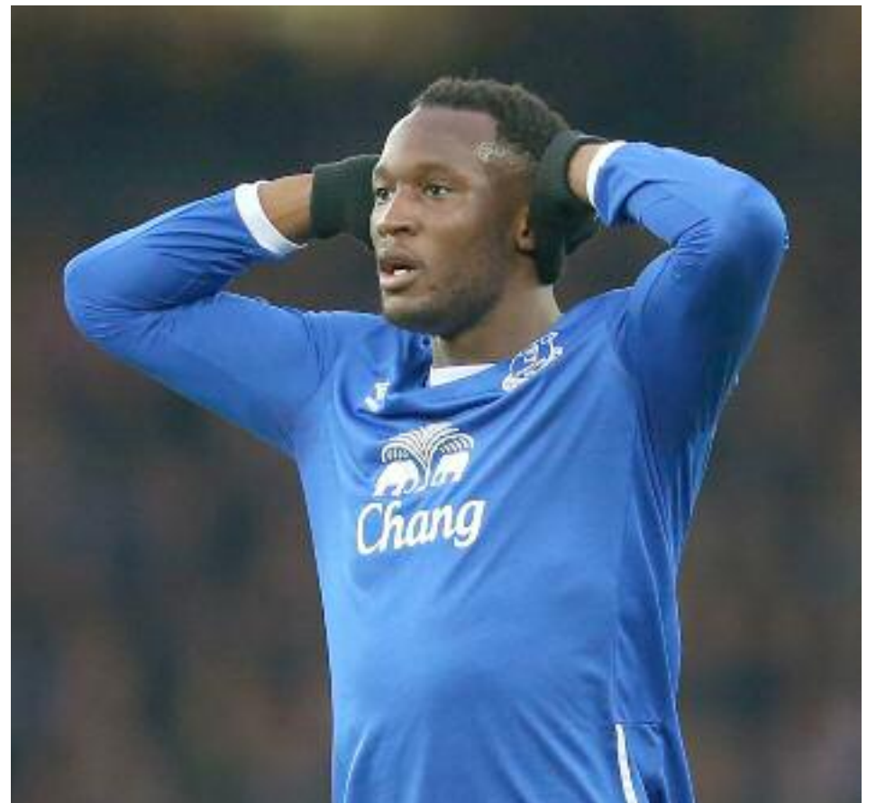
ADVANTAGE BLUE: The Everton striker's winner gave his team a narrow advantage over Manchester City in the Capital Cup semi final this week. Manchester United are rumored to be preparing a £40m bid for the Belgian star and it was a clear penalty referee after the game - we have to win 1-0 at home. I still think we are able to play in the Capital One Cup final."

"Everton's first goal was absolutely offside