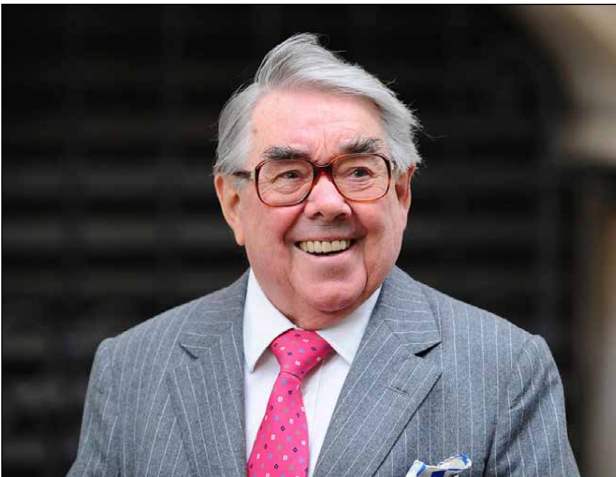
AND IT'S GOODNIGHT FROM HIM: Corbett enjoyed a successful TV career that spanned five decades

actor John Cleese, who worked with Corbett on The Frost Report ,