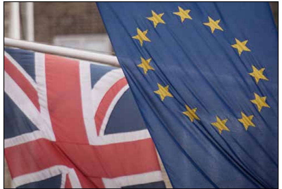
ENDANGERED UNION: ahead of the June 23rd vote, sentiment in Scotland remains far more pro-EU than south of the border.

The DUP has been accused of scuppering the dinner by refusing to attend, a claim the party rejected, saying it had no objection to the event happening, but will not be there.