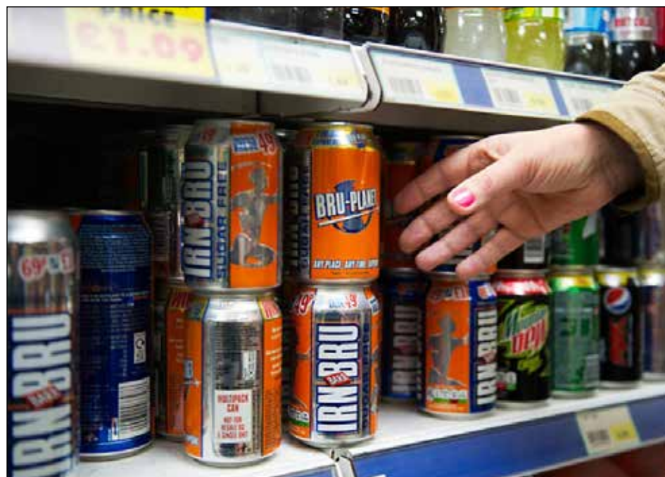
SCOTTISH INSTITUTION: But Irn Bru is changing its ways...

Parts of the soft drinks industry are understood to be considering taking legal action against the Government through European courts on the basis that other types of food and drink, such as fruit juice and milkshakes,