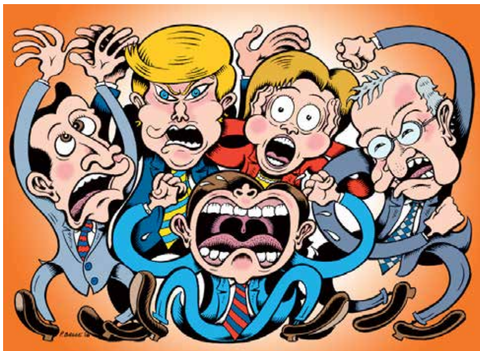
FOOD FIGHT: and depressingly, there's still many months to go...

Anyway I noticed that in LA we have a lot of subgroups or