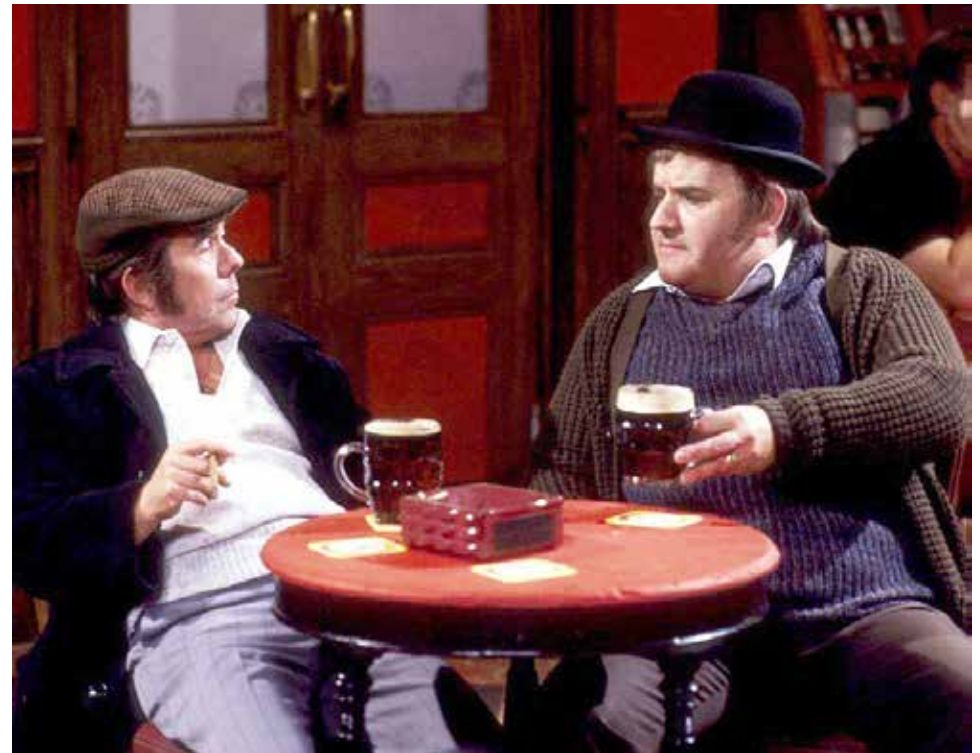
BEST OF BRITISH: Ronnie Corbett's place in British comedy history was cemented by the success of his long-running BBC TV show, The Two Ronnies

One of their most enduring sketches was the famous hardware shop "fork handles" skit. When on his own, Corbett specialised in long, rambling jokes delivered from an outsize armchair with his legs dangling in the air.