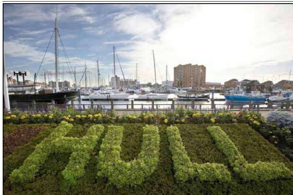
CIVIC PRIDE: the view from the Hull marina

The firm also makes Strathmore mineral water and St Clement's fruit juices.