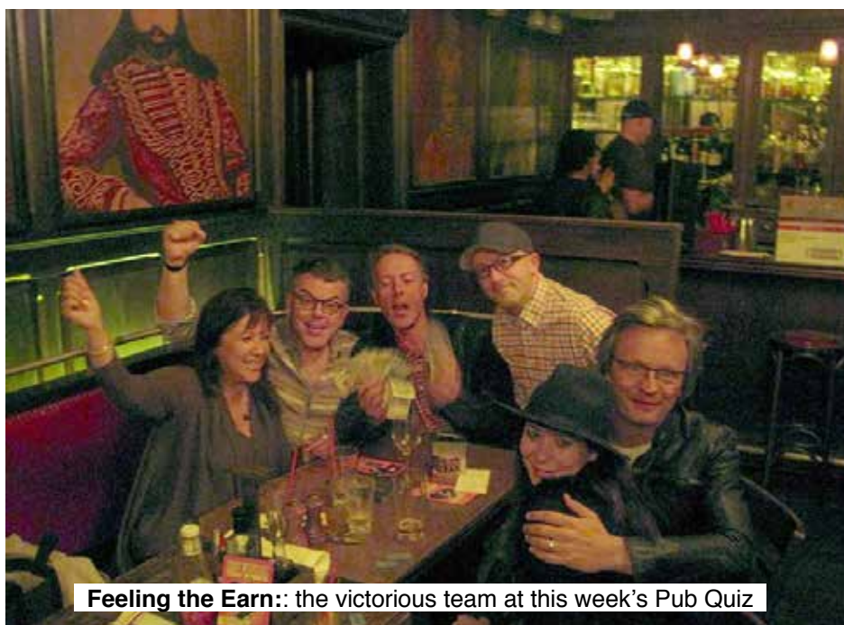
Feeling the Earn:: the victorious team at this week's Pub Quiz