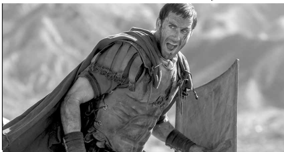
FIENNES ON CLAVIUS: "He's probably at the end of his military career. He's exhausted. He's probably suffering from some form of post-traumatic stress..."

(a longer version of this story can be found at british-weekly.com )