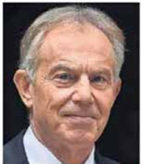
Former Labour PM Tony Blair

Murdoch 'devastated' by Blair-Deng friendship