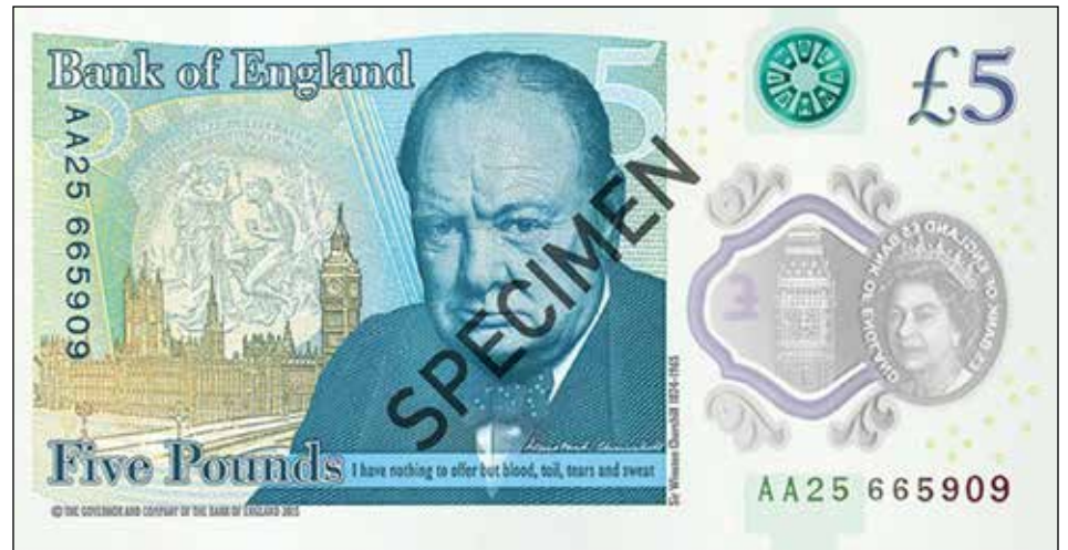
CONTINUITY AMID CHANGE: Churchill gets pride of place on the new £5 note

The polymer fivers are also 15 per cent smaller than the paper notes. The BoE said it was