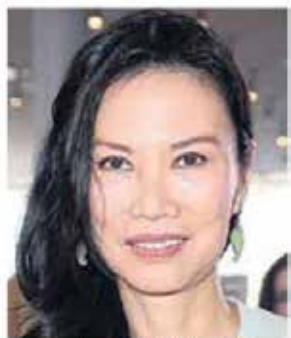
Murdoch ex-wife Wendi Deng

■ Mel and Sue exit after show's shock move to Channel 4