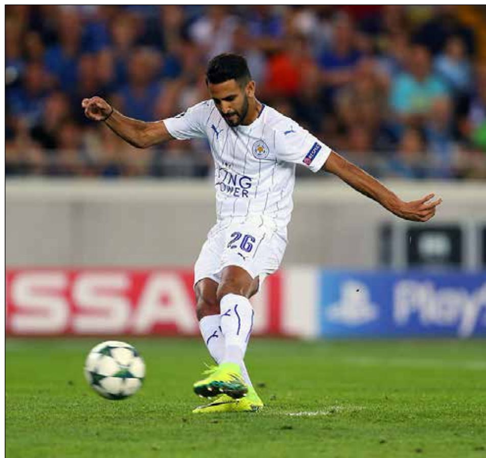
HE'S BACK: Riyad Mahrez scored a sublime free kick Wednesday night

Eight years ago this September, Leicester