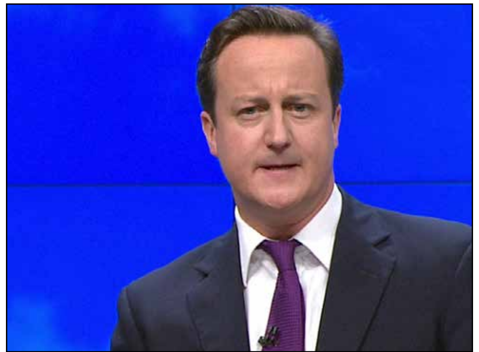
David Cameron: the former Prime Minister, who stepped down as an MP this week, was blamed for the power vacuum in Libya which aided the rise of ISIS

the future, proclaiming: "Your friends in Britain and France will stand with you as you build your country and build your democracy for the future."