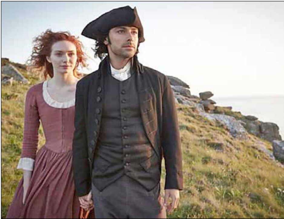
THE WILD, WILD WEST COUNTRY: Eleanor Tomlinson as Demelza and Aidan Turner as Ross Poldark promise to brighten your autumn nights

As Season Two opens, Ross stands accused of murder and "wrecking" - luring a cargo ship to the rocks for plunder. It's a capital offense, the judge is unsympathetic, hostile witnesses have been bribed and Ross appears headed for the gallows. It's just the first in a string of suspenseful episodes every bit as precipitous