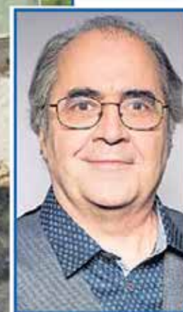
Danny Baker slammed 'tawdry' Channel 4 while Lord Sugar, below, said deal was 'greedy'