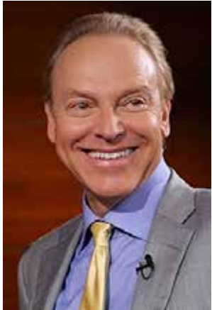
Large of the Orange County Business Journal