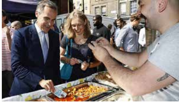
IT CAN TAKE THE HEAT: Mark Carney dips a new plastic £5 note into a tray of food as he buys lunch at a Whitecross Street market stall in London.

He made no comment when asked about the possibility of the fiver ruining the curry. The notes are expected to last two and a half times longer than their paper counterparts, and according to Mr Carney "can better withstand being repeatedly folded into wallets or scrunched up inside pockets".