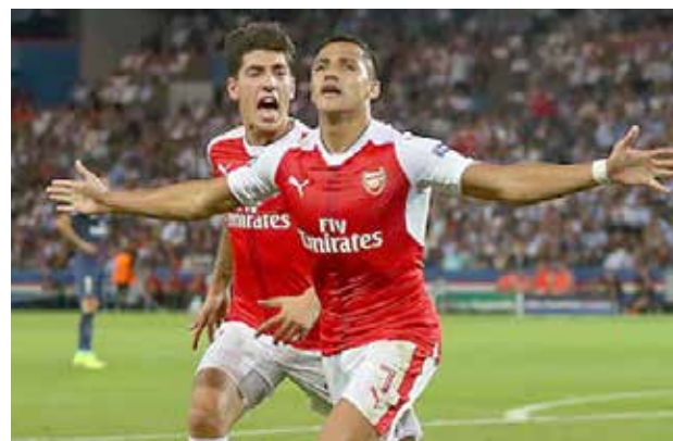
MAGIC MAN: Sanchez celebrates his equalizer in Paris

Anything more than a point for Arsenal would have been harsh on PSG, who outperformed their Premier League opponents