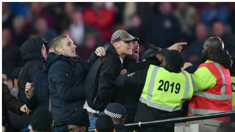
HERE WE GO AGAIN: confrontations between fans marred the Hammers' win

Kompany suffered a groin strain in September but has been dogged by thigh and calf issues, prompting his playing time to fall from around 2,700 minutes in 2013-14 to 1,700 last season.