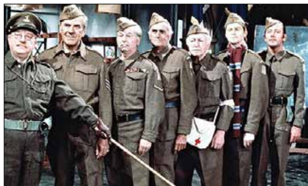
COMEDY GOLD: Perry's creation Dad's Army ran for nine years and 80 episodes on the BBC

It was an experience on which he would later draw when he conceived Dad's Army , basing