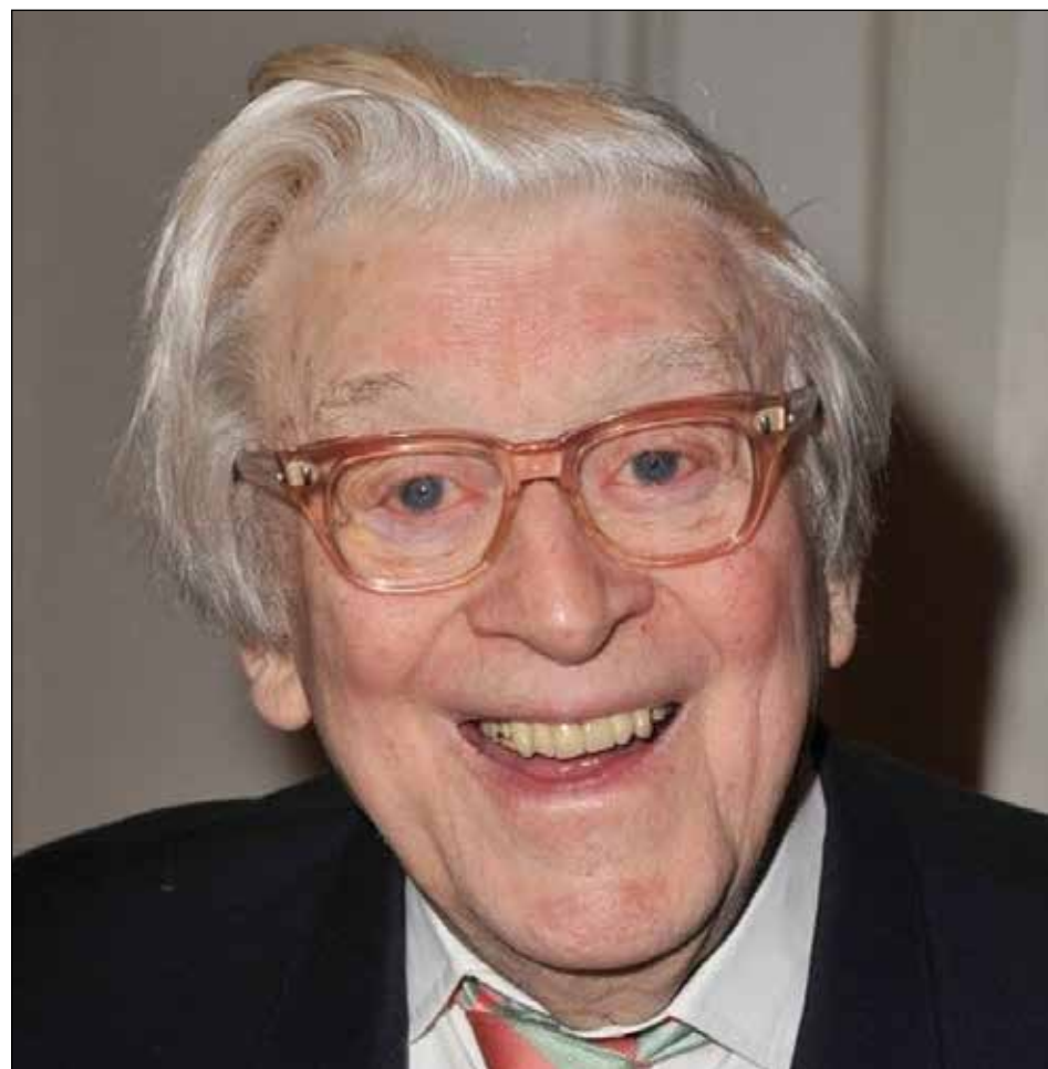
JIMMY PERRY: drew on his experiences in the Home Guard and in Burma

Perry himself had envisaged playing the spiv, Private Walker, but