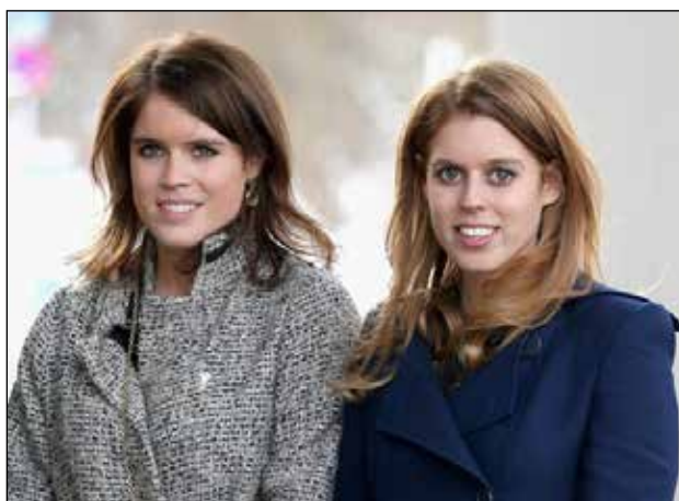
EUGENIE AND BEATRICE: neither of Andrew's daughters have found professional success

The 90-year-old monarch has been caught in the middle of the royal rift and has been at such a loss over what to do about her warring sons that the Government has had to help smooth things over.