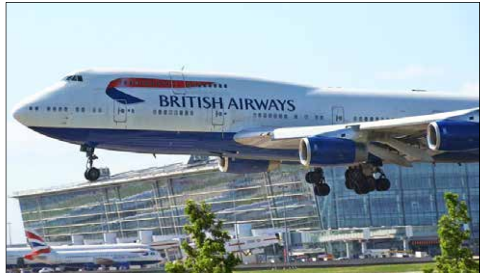
MORE TO COME: the new runway will not open until 2025 at the earliest

A public consultation will now be held on the effects of airport