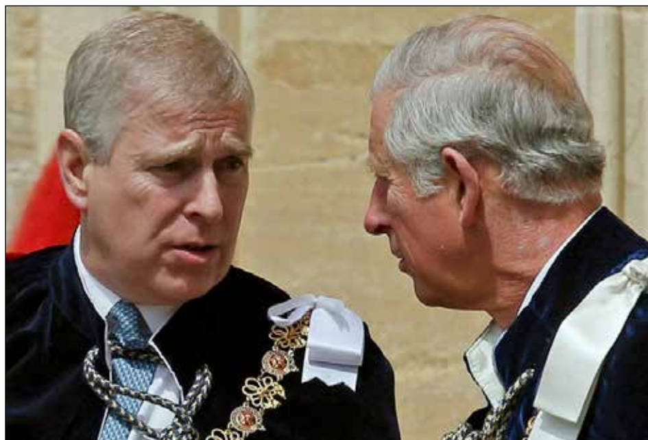
BROTHERS IN ARMS: Prince Andrew disagrees on the proper roles for Eugenie and Beatrice, arguing that they both deserve to play a full royal role

He raised the matter directly with Charles, who suggested someone in Government should break it to his younger brother that while he will continue to play a formal role in the Royal Family in the future, his daughters