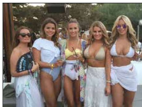
Sticking up for Essex Girls (Page 5)

Immigration Attorney Steven Landaal • Green Cards through Marriage and Family • Employment Visas • Monthly Payments Available Tel: (310) 395-2828 See our ad on Page 3