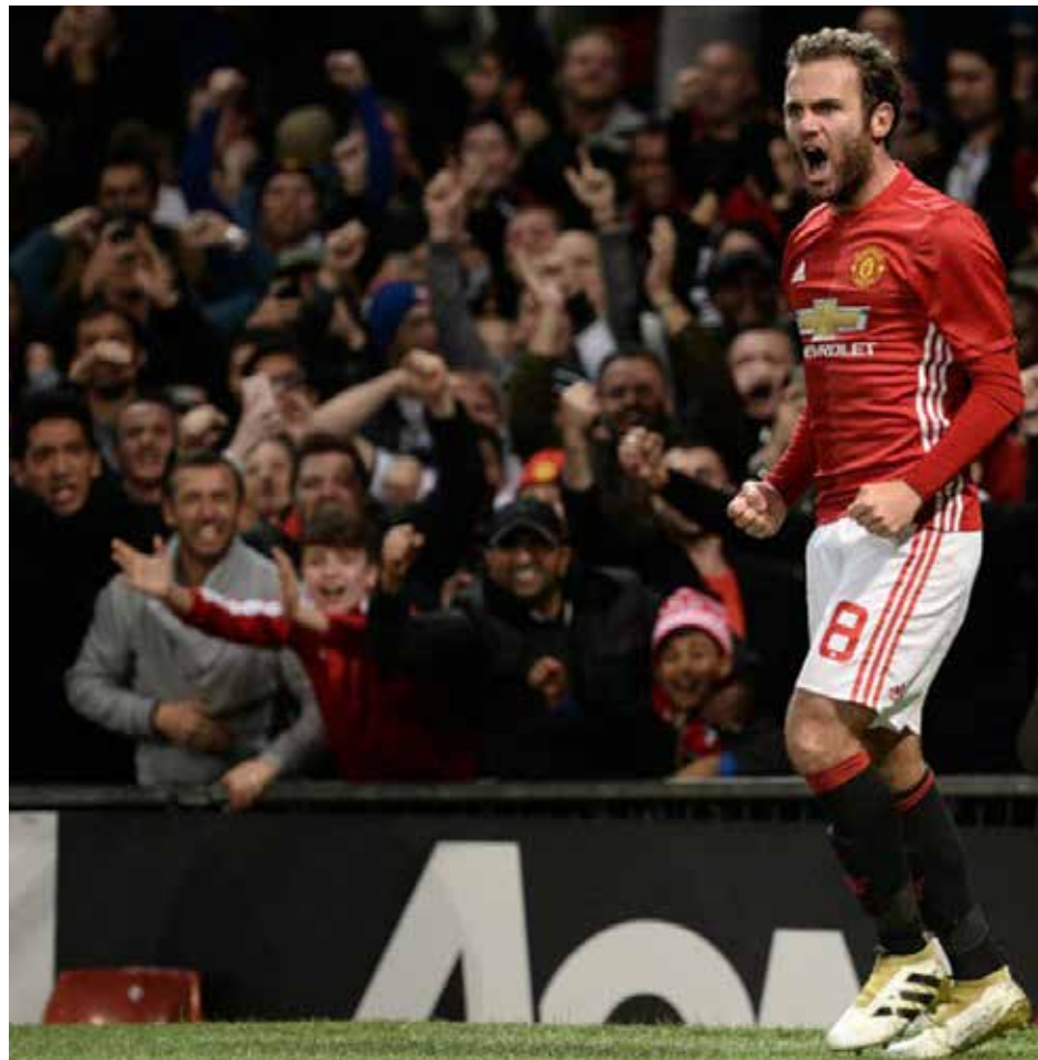
MATA OF FAITH: United's narrow win sets up a quarter final date with West Ham

He could also face more time without captain Vincent Kompany, who, making only his second start of the season, asked