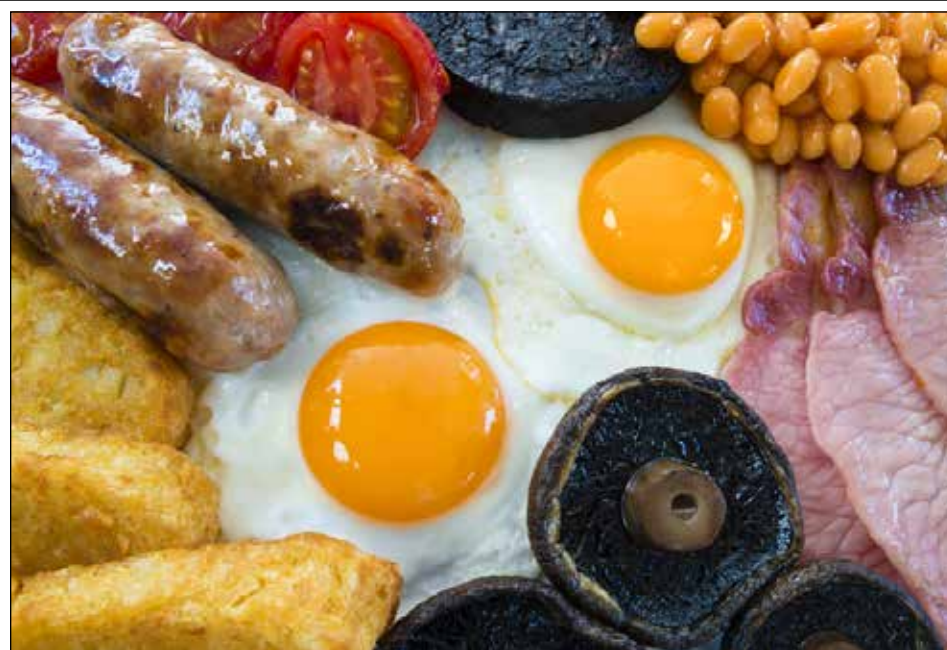
LUCKY US: we get the full English, they get the obesity

politeness and profanity at the same time,' she stated.