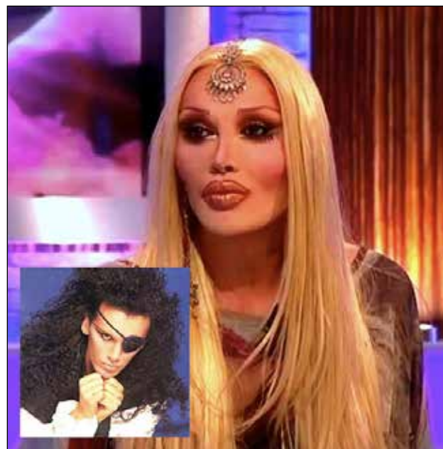
CHAMELON: Pete Burns in recent years and (inset) how he looked in his 1980s heyday

Born in Cheshire, England, to a turbulent home life, Burns, 57, turned to pop music at a young age, starting his first band while working at a Liverpool record store before founding