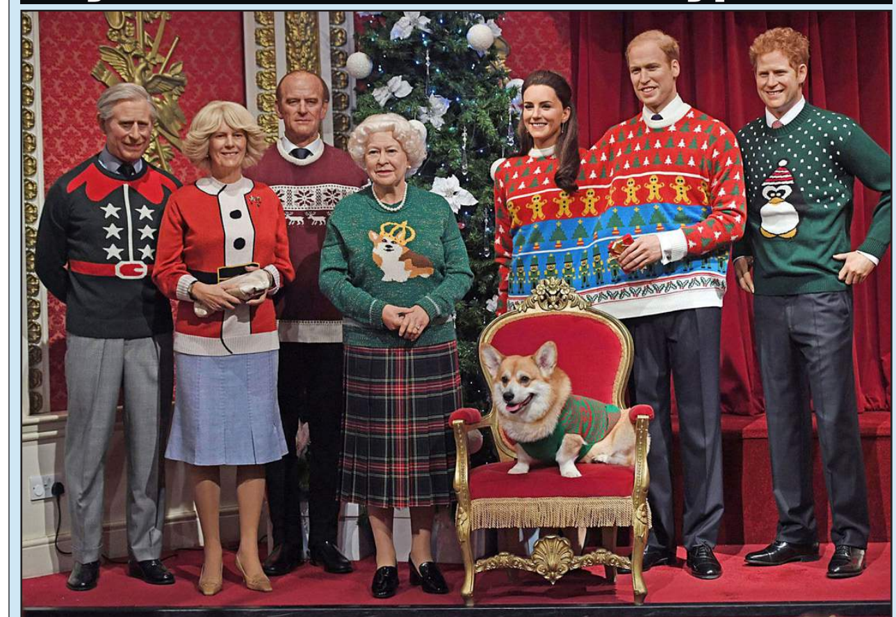
NOT ALL FAKE: The royal wax doppelgangers were joined by four real corgis

Here's the Royal family - or their waxworks at least - as you've never seen them before.