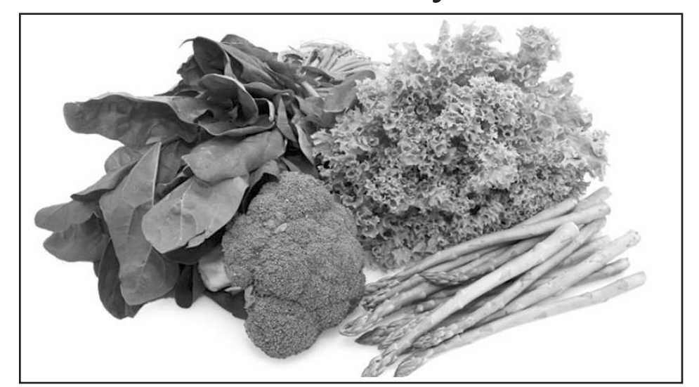
Spinach, broccoli and asparagus can be vital parts of an Alkaline diet

Highly Acidic (PH2-3): Lemon juice, vinegar, sodas, energy drinks, carbonated water, sweets, cakes etc. Medium Acidity: (PH4-5): Alcohol,