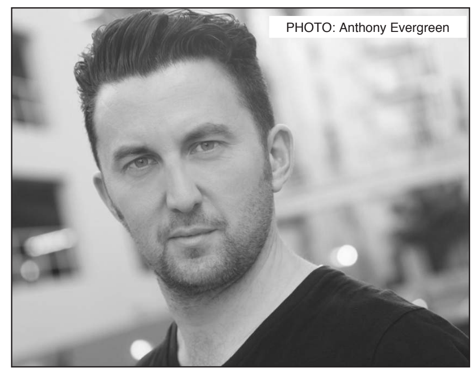
FREED FROM CONVENTION? "(LA) is a great place to broadcast, whether it is performances, teachings or other kinds of art."

What would you suggest to others who are thinking about making the move here? Do not expect Los Angeles to come to you. If you get a magical job offer then great. I found it worked best by showing up, meeting people, making myself available, and not expecting anything to happen. There is a great value to just getting here, shaking hands, and being around. My number one piece of advice would be to set up a pilot trip of two or more weeks - the longer the better - because LA