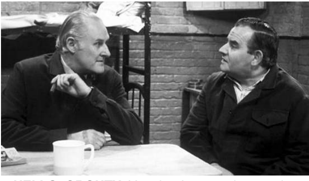
HELLO, GROUTY : Vaughan's menacing turn in Porridge was perhaps his most memorable role

Merchant Ivory's film The Remains of the Day