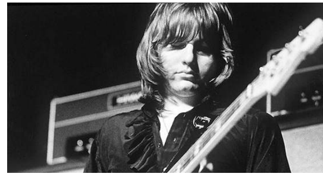
GREG LAKE: 'long and stubborn battle with cancer'

Palmer, ELP made their live debut at the Guildhall in Plymouth in 1970 before giving a careermaking performance at the Isle of Wight Festival.