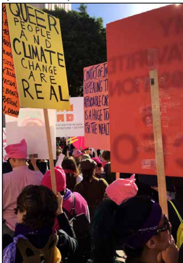
NOT GOING QUIETLY: the scene in downtown LA