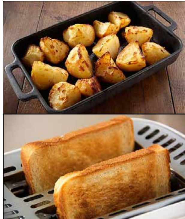
NATIONAL STAPLES: scientists are telling Britons to 'go for the gold' with roasted potatoes, and avoid toasting our bread until it is dark. Both increase levels of acrylamide, which may be harmful....

Using the slogan "go for gold", it also warned that people should set a timer for 25 minutes to ensure