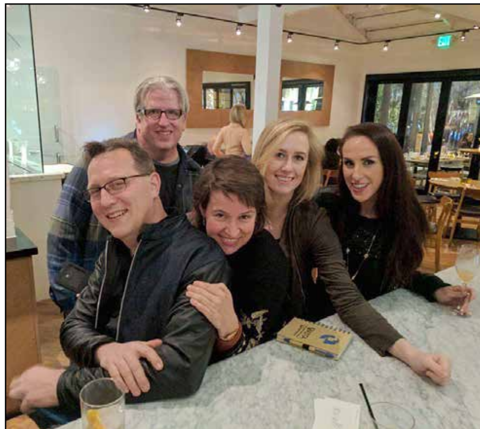
WORK ON THEIR HANDS: The "Moonlight" team for this year's Toscars

Last weekend I travelled with approx 750,000 people to DTLA to participate in the "Women's March". A movement seen all over the world, from London to Sydney, from New York to Chicago and Washington DC. It was a peaceful protest to let our current administration know that women's rights are human rights and to send a message loud and clear that we won't stand for a totalitarian leader who doesn't care for his people. Even though it