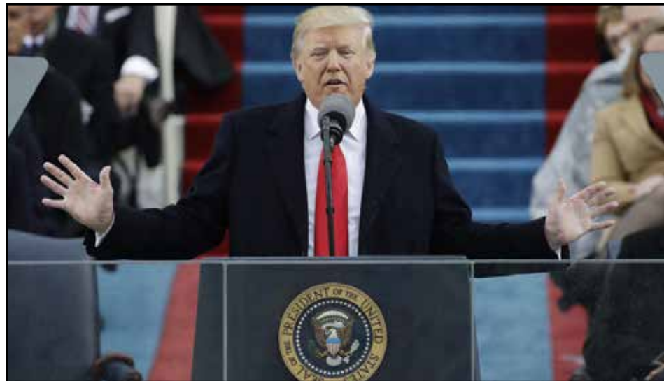
"An impulsive braggart and bigot," is how The Guardian described Mr. Trump