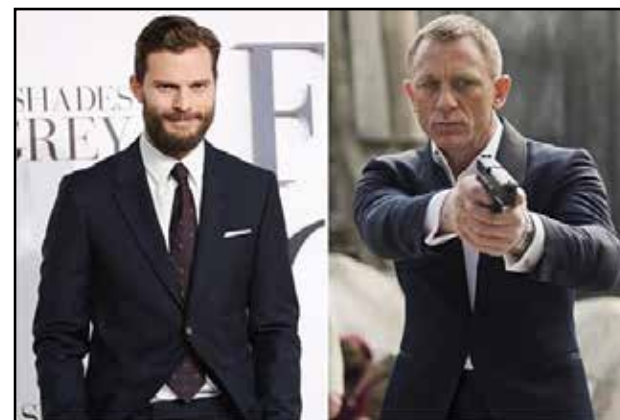
HEIR APPARENT? Jamie Dornan and Daniel Craig

Producer Barbara Broccoli, daughter of Albert R. Broccoli, the man who first brought Bond to the screen