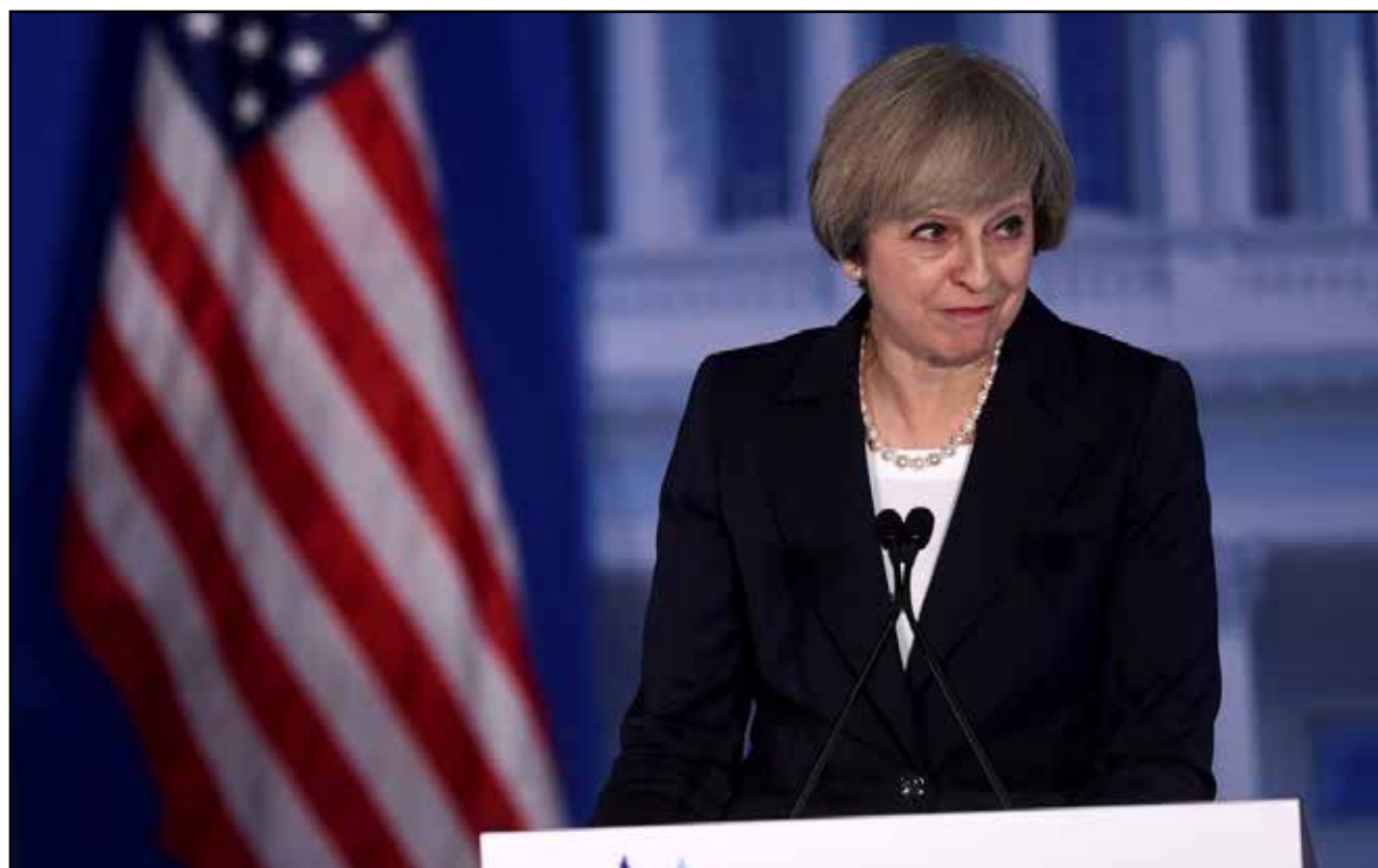
THERESA MAY: "The days of Britain and America intervening in sovereign countries in an attempt to remake the world in our own image are over."

Despite the positive relationship between Mr