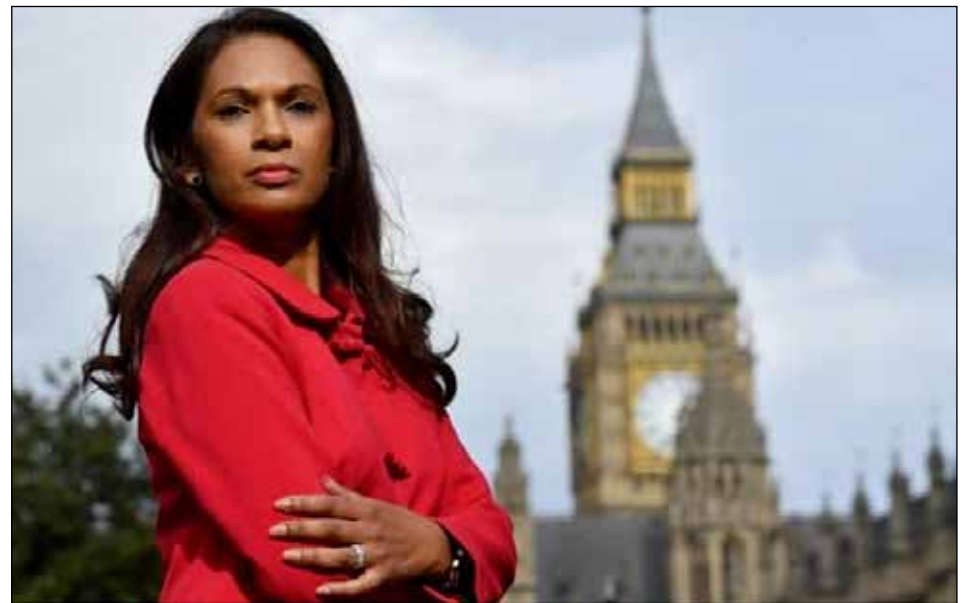
VICTORY: campaigner and investment manager Gina Miller

"That agreement shall be negotiated in accordance with Article