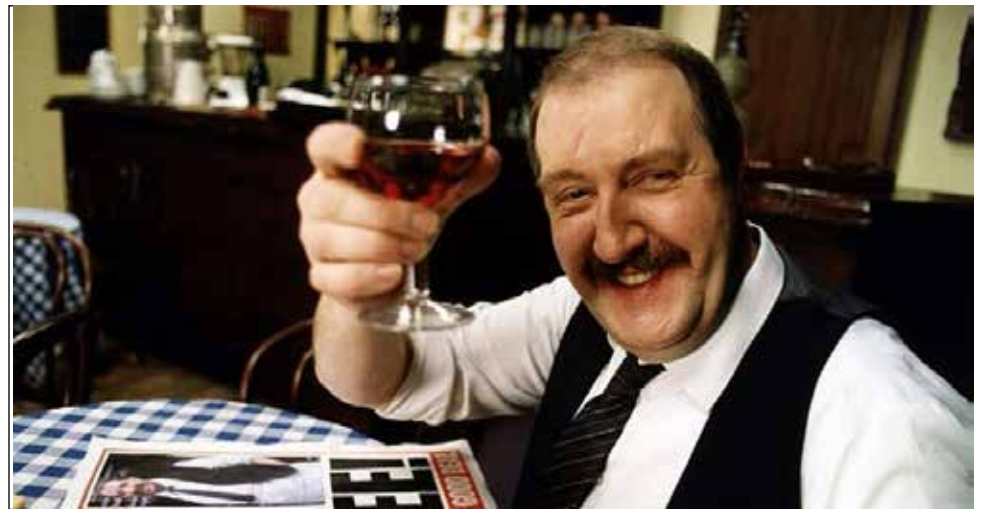
CAREER-DEFINING ROLE: 'Allo 'Allo ran on the BBC from 1982 to 1992

Born in Huddersfield in 1941, Kaye described himself in his