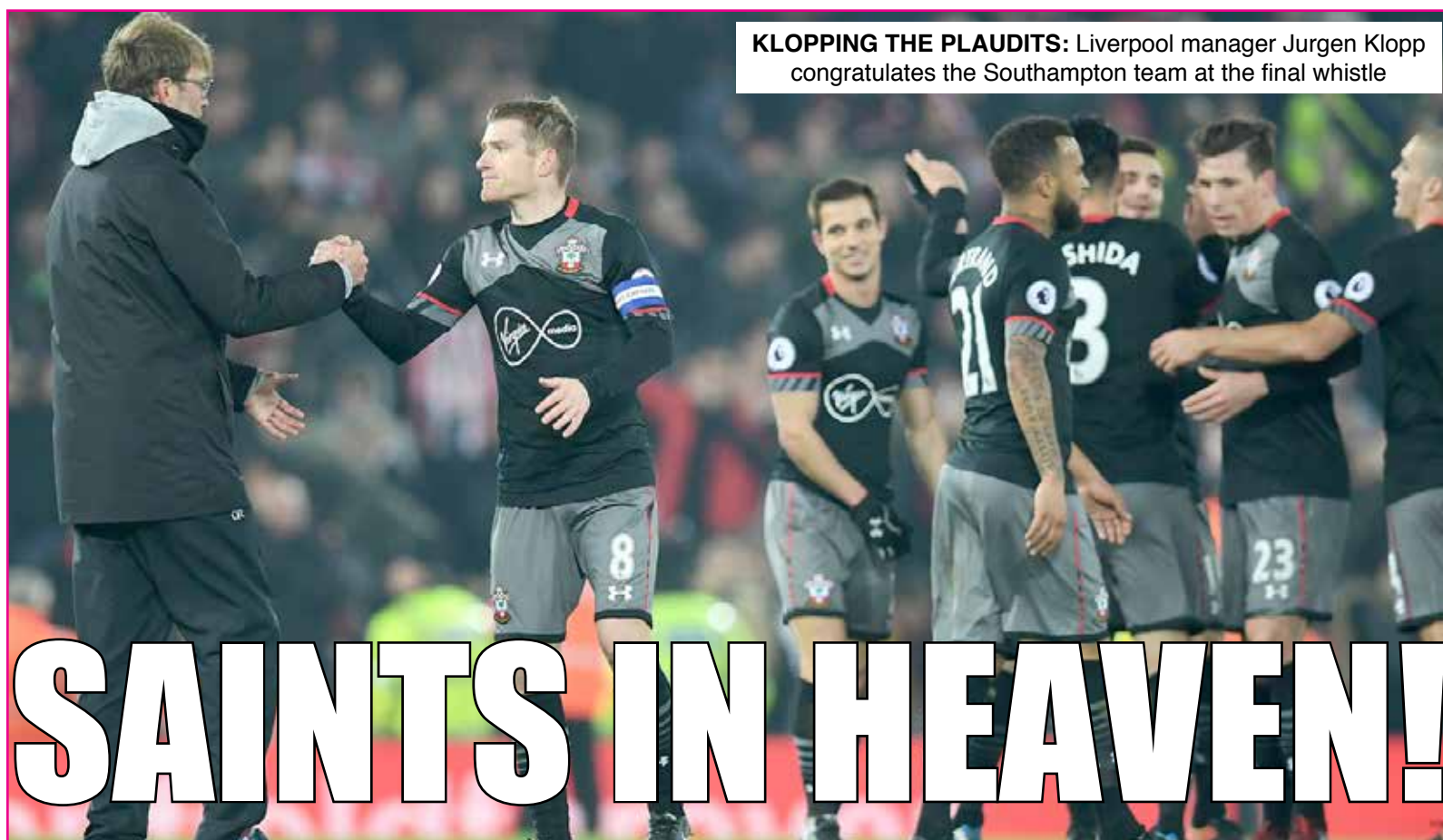
KLOPPING THE PLAUDITS: Liverpool manager Jurgen Klopp congratulates the Southampton team at the final whistle

And it was all done without their talisman and key defender Virgil van Dijk, out through injury. Southampton were dangerous on the break in the first half and then, when they needed to be, were superbly organised, disciplined and determined defensively before breaking for Republic of Ireland international Long to strike the killer blow.