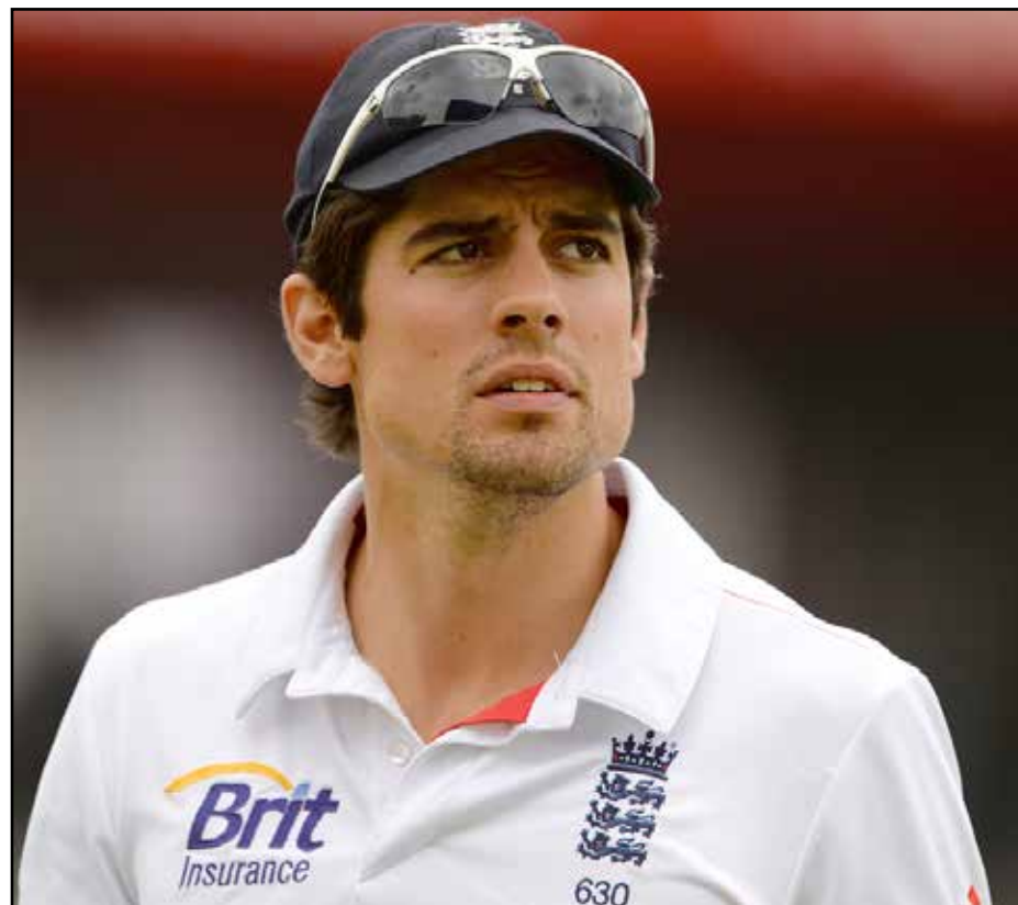
HIGHS AND LOWS: Cook enjoyed two Ashes wins as well as series wins in India and South Africa before this winter's dismal tour of India

"Obviously, the decision was what we thought was the best for