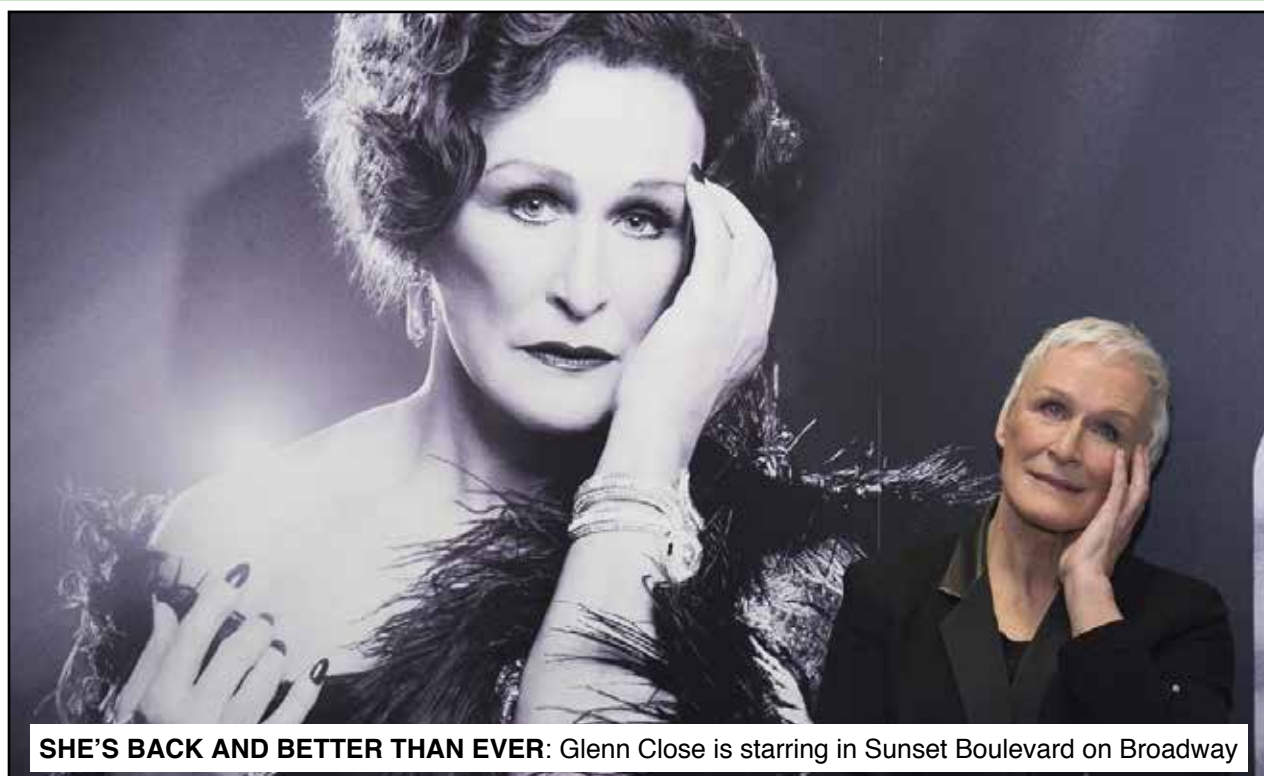
SHE'S BACK AND BETTER THAN EVER: Glenn Close is starring in Sunset Boulevard on Broadway

After a couple of days back in the City of Angels I'm suffering from some