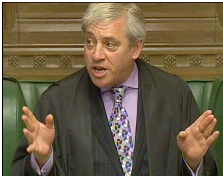
WIDESPREAD SUPPORT: the Speaker's reservations about Donald Trump were echoed by many in the Labour Party this week

"Then I, born in Aden, Yemen, of Goan-Indian