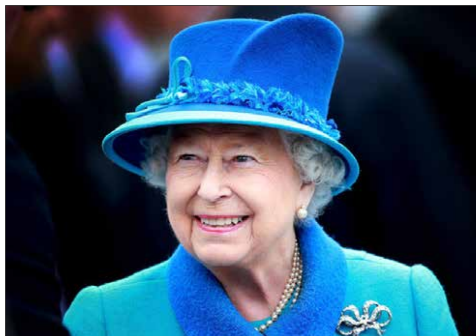
NOT ONE TO MAKE A FUSS: Her Majesty this week

celebrations, including a party on The Mall, was held for her official birthday in June.