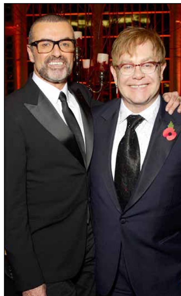
KINDRED SPIRITS: George and Elton

not only was he a good friend, but he was probably one of the most brilliant songwriters this country's ever produced, and certainly one of the best vocalists ever. One of the best in the world."