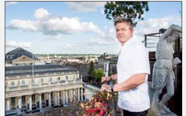
FRENCH WITHOUT FEARS: Gordon Ramsay

Opened in the heart of the city by Ramsay just 17 months ago, the restaurant combines British produce with French culinary style. Scallops and langoustine from Scotland often sit alongside Noir de Bigorre ham on the