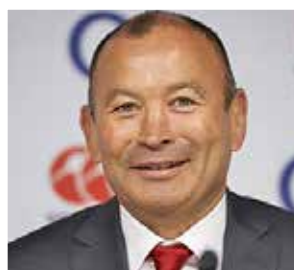
JONES: "The Welsh are a cunning lot."

Wales had requested that the roof be closed for every home match during the Six Nations Championship but the protocol is such that there has to be