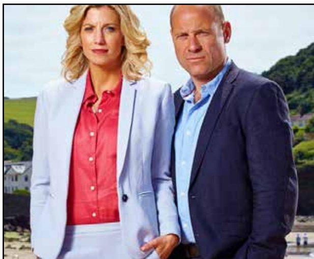
GREAT BRITISH MYSTERY: Claire Goose and Matt Bardock star in The Coroner