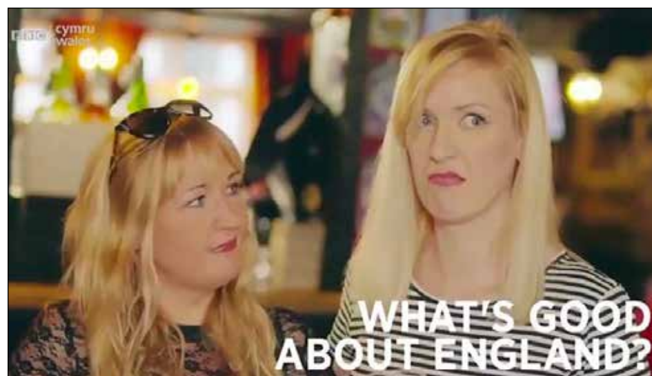
WHAT'S GOOD ABOUT ENGLAND? cue blank stares in the Six Nations ad which caused quite a stir in the UK this week

trailers are seen as a bit of a wind-up and go down well with Wales viewers.