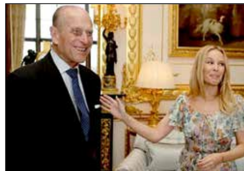
The Prince and the Showgirl? Page 3