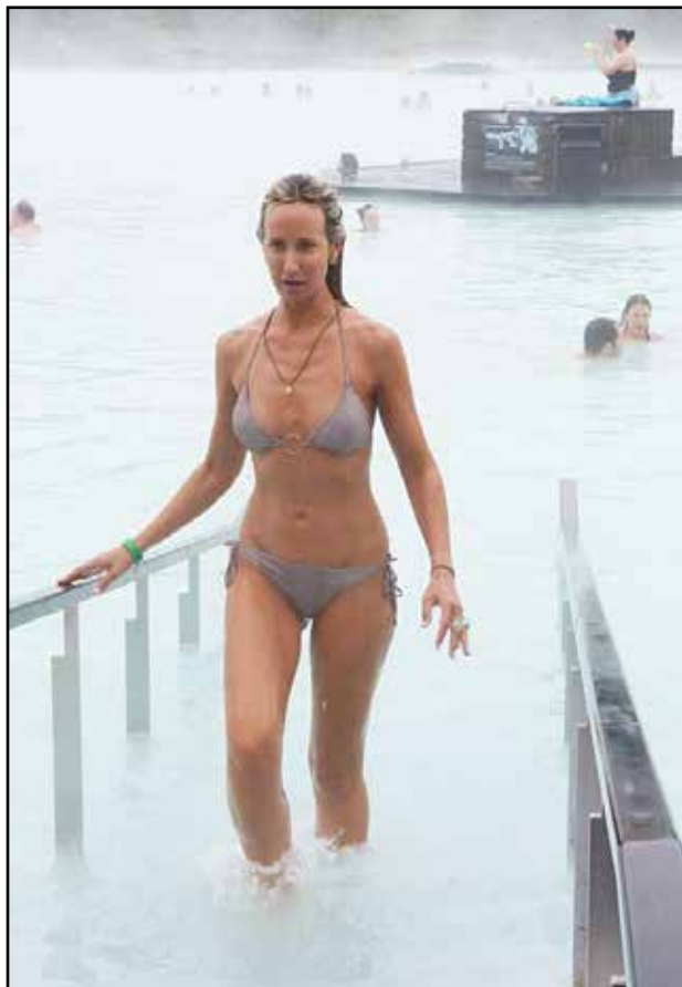
RED HOT IN ICELAND: Lady Victoria

I reckon Lady V looks rather hot in the cold... (smirk).