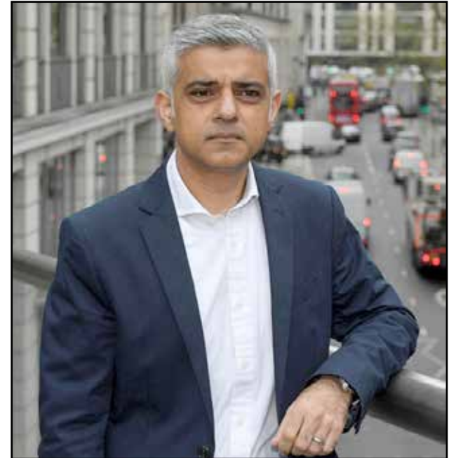
SADIQ KHAN: The Mayor said there is 'no place for racism' in the party

The veteran socialist and Corbyn ally argued he had evidence to back up his offensive views