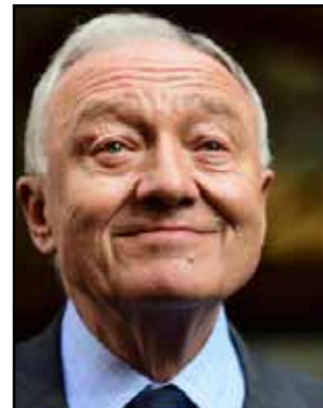
LIVINGSTONE: "Like sitting through a court in North Korea."

six million Jews", Red Ken said in an on-air meltdown.