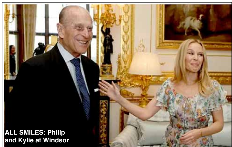
ALL SMILES: Philip and Kylie at Windsor

The Duke of Edinburgh turned his charm on Kylie Minogue when he met the pop star during a private audience at Windsor Castle on Monday evening.