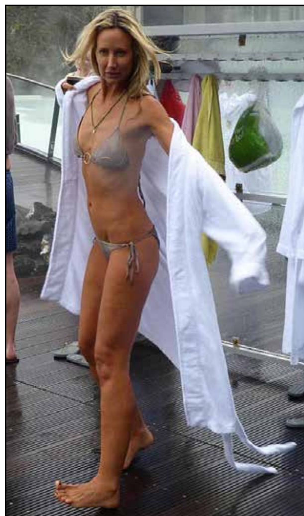
BEST FOOT FORWARD: LVH wraps up against the chilly Icelandic air...