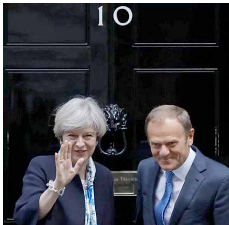
AT THE THRESHOLD: May welcomes Tusk to Number 10 this week

But Downing Street said in a statement on Mrs May's meeting with Mr Tusk: "The PM made clear that on the subject of Gibraltar, the UK's position had not changed: the UK would seek the best possible deal for Gibraltar as the UK exits the EU and there would be no negotiation on the sovereignty of Gibraltar cont. on page 4, col. 5