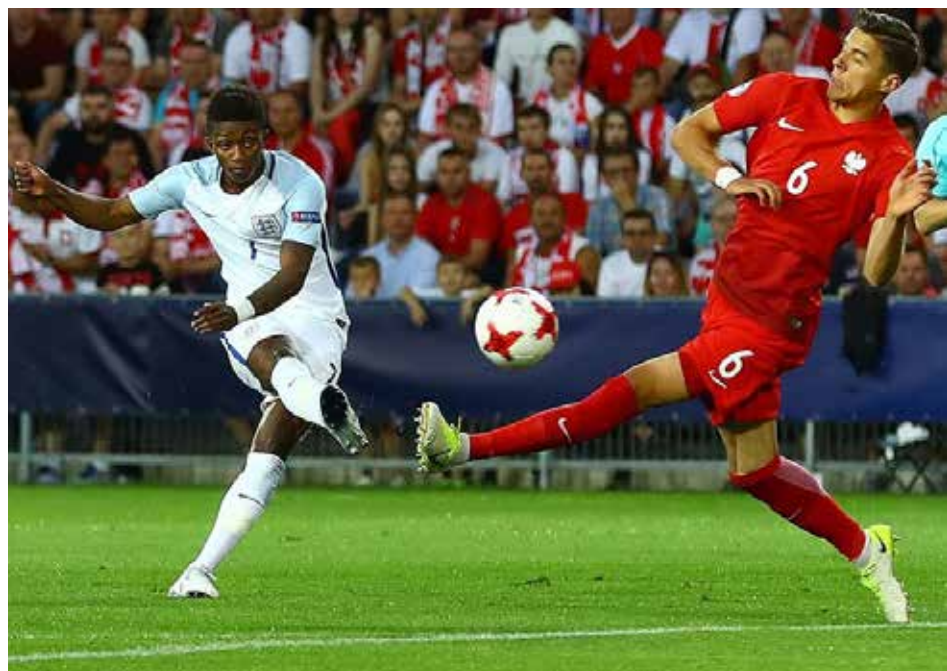
STRIKE ONE: Demarai Gray opened the scoring for England on Thursday