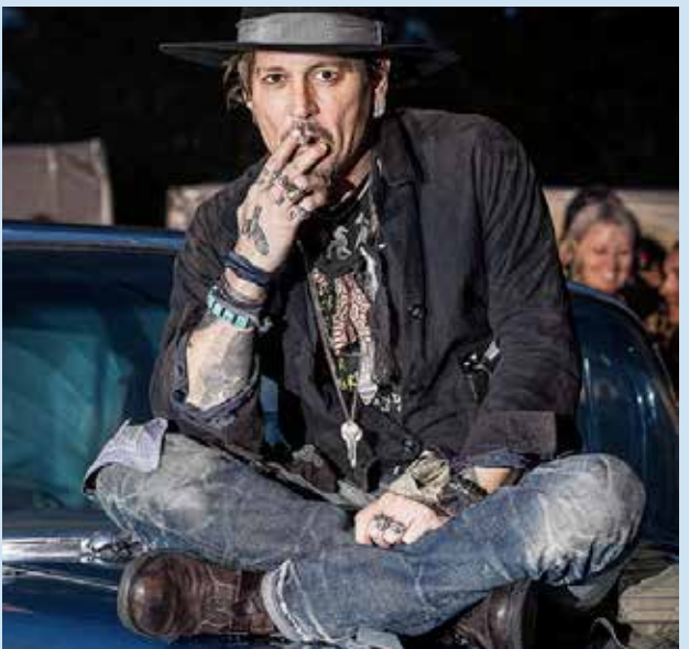
JOHNNY DEPP: the actor is promoting his film The Libertine at the famous festival in Somerset

Actor Johnny Depp appeared to threaten US President Donald Trump during a speech at the Glastonbury Festival on Thursday. “Can you bring Trump here?” he asked the audience, as he introduced a screening of his film The Libertine. After receiving jeers from the crowd, he added: “You misunderstand completely. When was the last time an actor assassinated a president?” “I want to clarify,” he added, “I’m not an actor. I lie for a living [but] it’s been a while. Maybe it’s about time.”