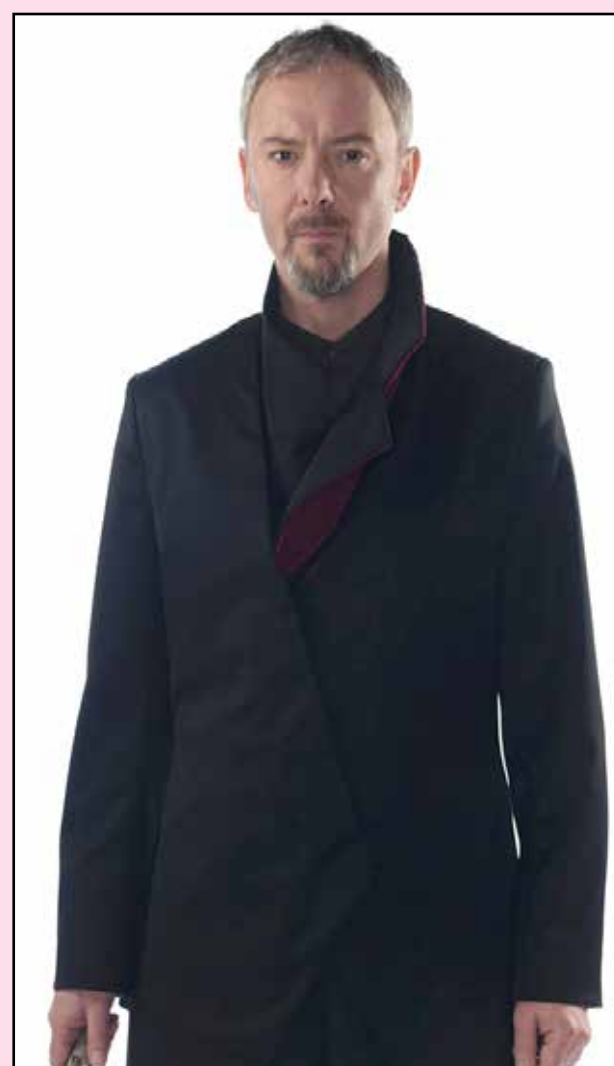
STRONG MEDICINE: acclaimed actor Simm plays the Doctor's longtime antagonist, The Master

The Doctor and co arrive on a huge spaceship that's 400 miles long and 100 miles wide and about to be sucked into a massive black hole. Viewers will