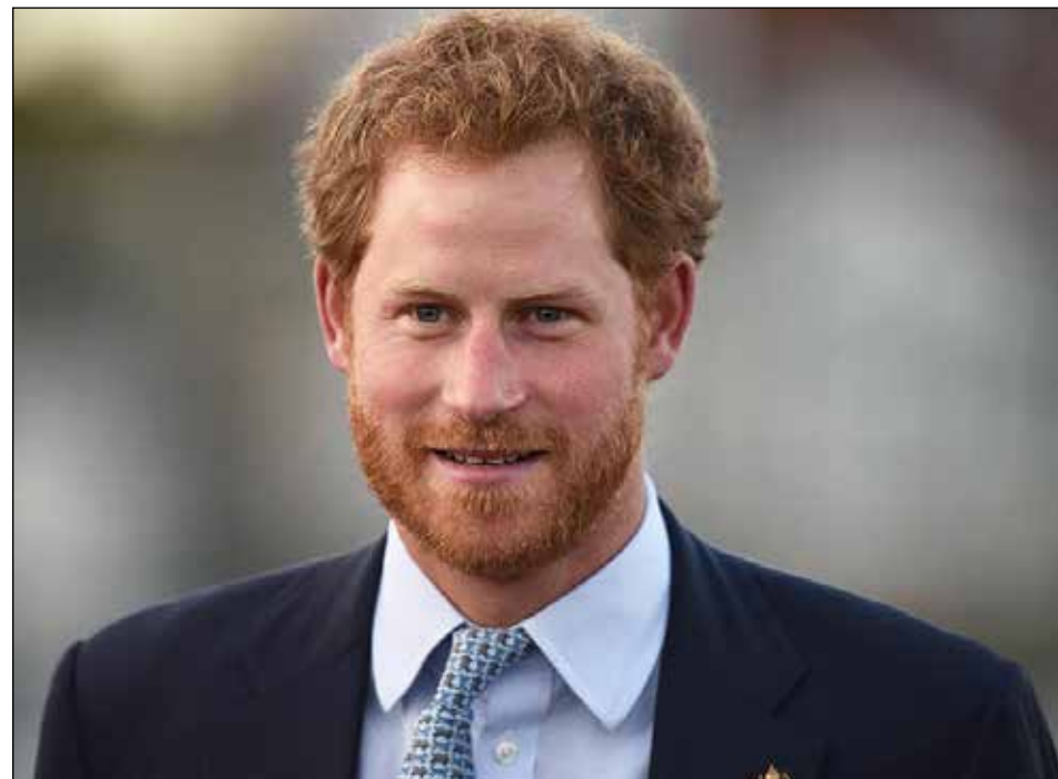
HARRY ON THE MONARCHY: 'We don't want to dilute the magic'

"The Queen has been fantastic in letting us