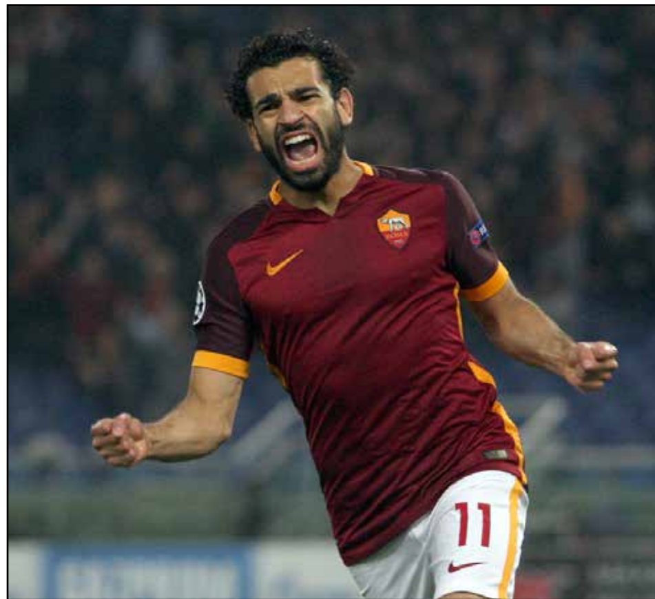
SECOND TIME LUCKY?: Salah struggled to make an impact in English football after signing for Chelsea in 2014. He moved to Roma two years later.

That fee will be decided by a tribunal after he rejected a new contract at Stamford Bridge, with the fee expected to be about £3m.