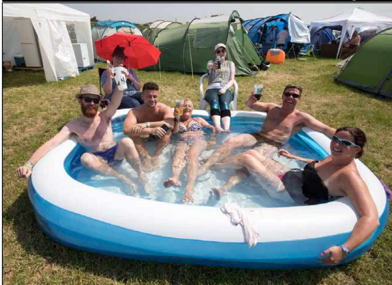
POOLING THEIR RESOURCES: Sunburn was more a concern for revellers this week than the infamous Glastonbury mud, as the famed festival kicked off on Wednesday amid 90-degree heat. Much of Britain sweltered amid record temperatures - and bad air warnings - in midweek. (see page 2)