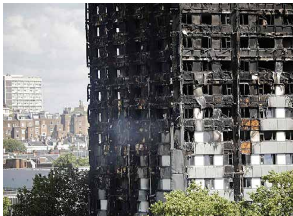
DEATH TRAP: combustible cladding used to improve the Grenfell Towers' appearance has been cited as a key cause of the large death toll in the fire

London, has said it is removing cladding from five tower blocks, but those five – or not all of them – are not thought to be included in the Government figure.