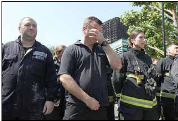
FIGHTING BACK TEARS: firefighters observe Monday's minute of silence for the Grenfell victims