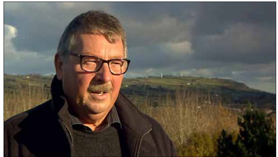
East Antrim MP Sammy Wilson said the Conservatives "can't rely on our vote".