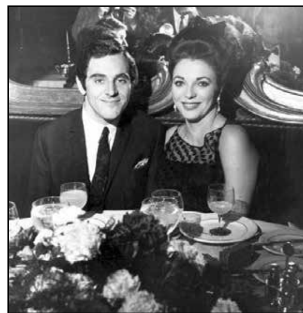
POWER COUPLE: Newley and Collins in 1969

Mercy Humppe And Find True Happiness? was "a confession of paedophilia". Newley directed and starred in the film as the leading character Merkin, while Dame Joan played the female lead Polyester Poontang.