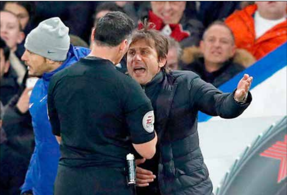
TEMPER TEMPER: Antonio Conte was sent to the stands Wednesday night