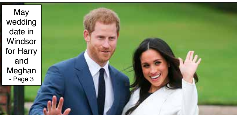
May wedding date in Windsor for Harry and Meghan - Page 3

California's British Accent™ - Since 1984