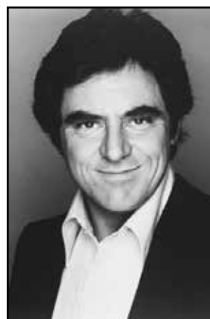
NEWLEY: 'drawn to youthfulness'