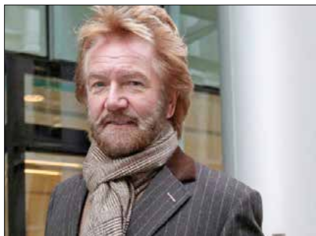
NOEL EDMONDS: seeking £300m in damages