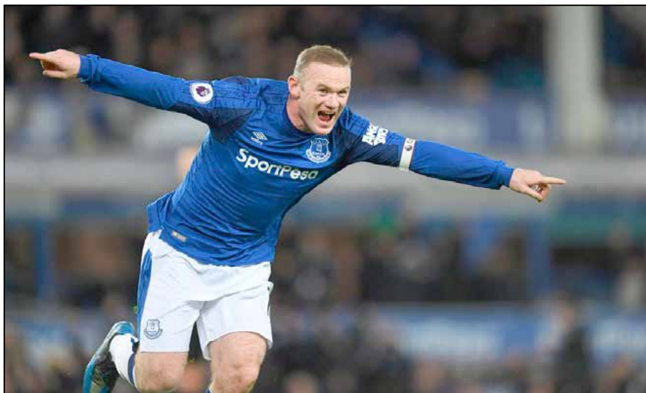
OFF TO A FLYER: Rooney celebrates his remarkable third goal at Goodison Park Wednesday night

But caretaker manager David Unsworth - who will return to coaching the club's under-23s - signed off his eight-game spell since Ronald Koeman's sacking in October with a deserved