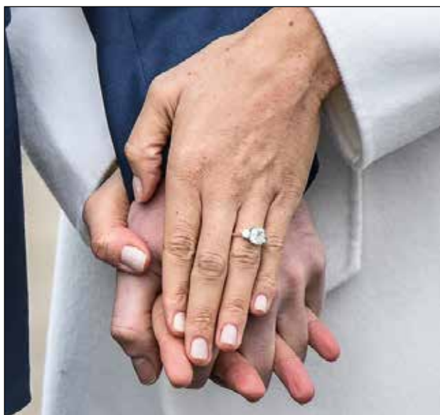
ROCK OF WINDSOR: Meghan's engagement ring

Harry was following in the footsteps of his grandfather Prince Philip in designing the