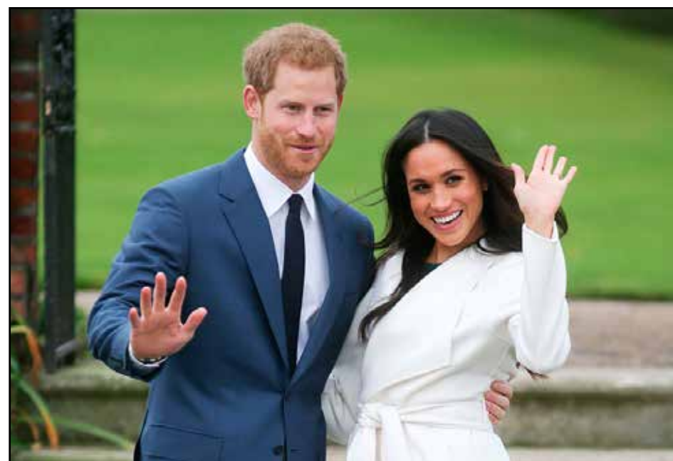
UNLIKELY START: the pair met on a blind date arranged by a mutual friend

Harry, 33, has been dating the American actress, 36, who found fame in the US legal drama Suits since July 2016. Their 16-month romance blossomed when they met through a mutual female friend in London and went on a blind date. They fell in love spending time together at her home in Toronto and his at Kensington Palace during breaks in her filming schedule and his royal duties. In a revealing television interview the pair admitted neither knew who the other was when they went on their first date. Meghan has moved into Harry's two-bedroom cottage at the palace where he proposed