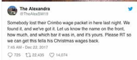
CHRISTMAS REUNION: the Tweet which led to a grateful immigrant getting his money back