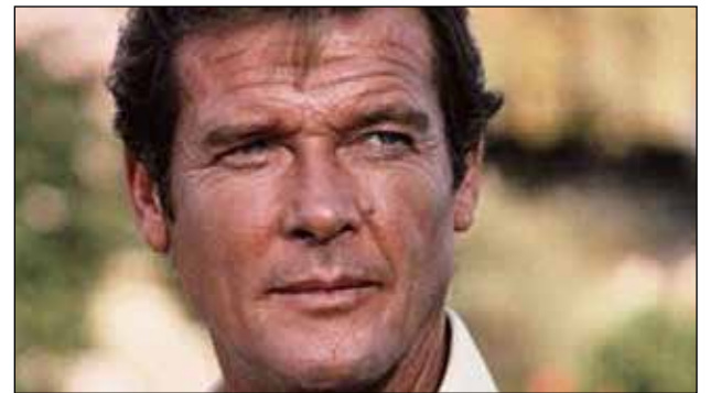
ONE OF THE GREATS: Sir Roger Moore

Jonathan Demme , director, died 26 April, aged 73.