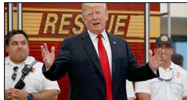
DONALD TRUMP: Unpopular in Britain. Bigly

He told The Guardian : "Some of the things that have been said by religious leaders seem