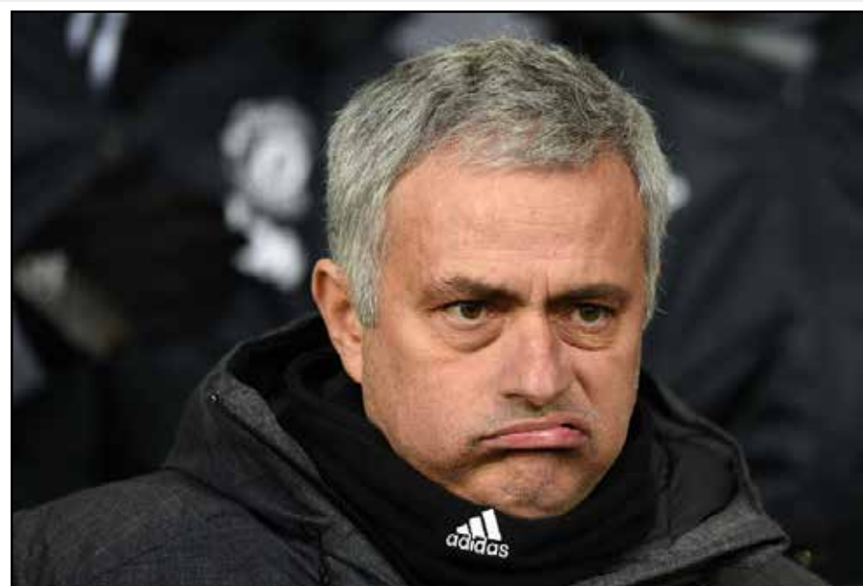
NOT HAPPY: two consecutive draws has left Mourinho's men 15 points adrift

United, do you think Milan is not as big as us? You think they are not as big as we are? Do you think Real Madrid are not as big as we are? You think Inter Milan is not as big as we are? There are many big clubs and you say big clubs, I know