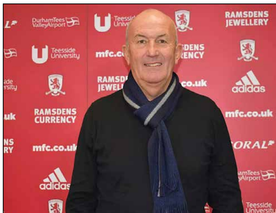
PULIS: "I really am looking forward to this."

established himself as a manager of Premier League calibre, having led Stoke City to promotion in 2008/09 and keeping the side afloat until he left in