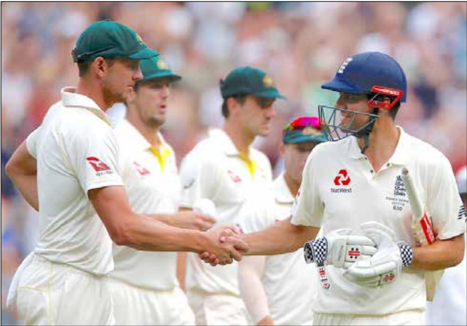
CLASS IS PERMANENT: the Australian team lined up to congratulate Cook following his epic unbeaten knock at the Melbourne Cricket ground

Alastair Cook made the highest-ever score by a visiting batsman at the MCG to give England firm control of the Boxing Day Test.