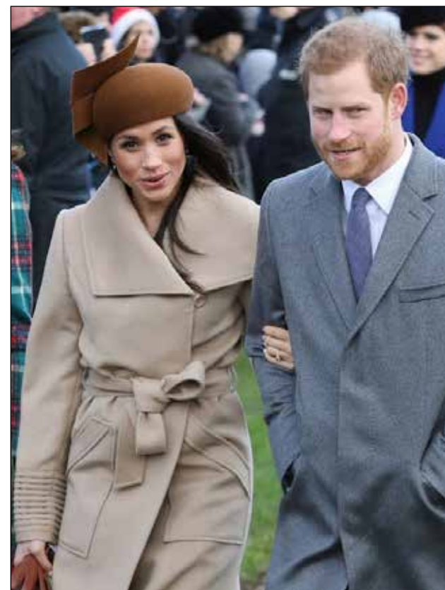
CONFIDENT START: Meghan sported a wide-collared camel wrap coat by Canadian brand Sentaler

Ms Markle and the Duchess share a taste for Sentaler, having both worn designs by the brand in the past. The Duchess wrapped up in a short,