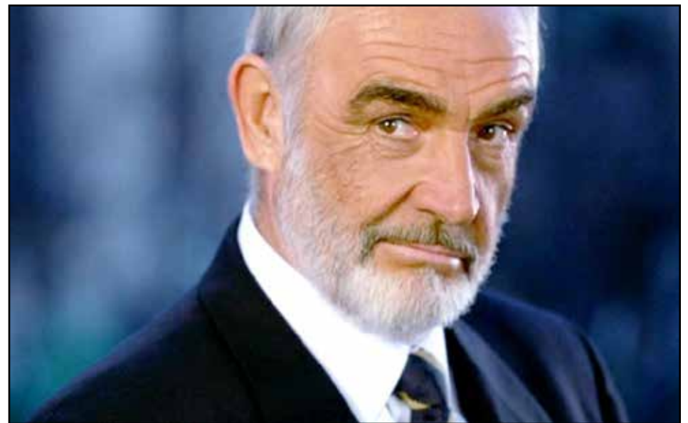
CANNY SCOT: Connery is determined not to let others cash in on his image