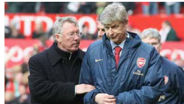
FERGIE AND WENGER: many epic battles

Sir Alex Ferguson was full of praise for his counterpart on