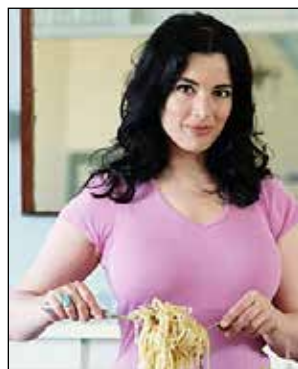
NIGELLA: 'great elasticity', apparently

"She's also lost weight in recent years. But