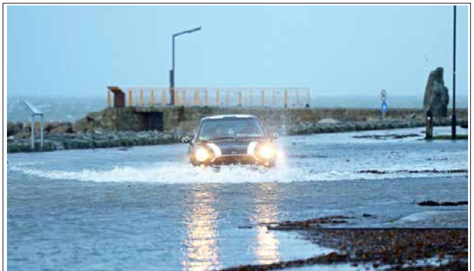
WATER HAZARD: Storm Eleanor first came ashore near Salthill, Co. Galway