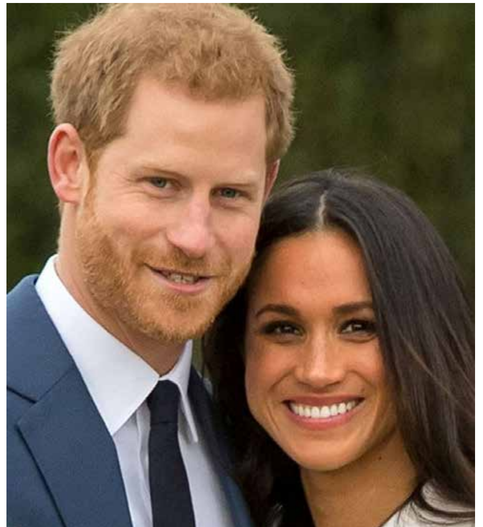
ROMANTIC GETAWAY: Harry and Meghan are thought to have spent New Year's Eve with Prince Albert and Princess Caroline

Philip cracked the edgy joke as he led a procession of Royals and guests to morning service at St Mary Magdalene Church. The 96-year-old was chatting to Princess Anne when he spotted the tall man in his 30s with a hipsterstyle long ginger beard. An onlooker in the crowd said: "Philip was