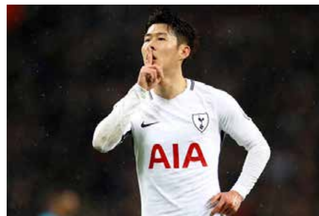
Son Heung-Min: stunning equalizer

The Spurs manager said after the game: "We only scored once - and the most difficult chance. I'm very