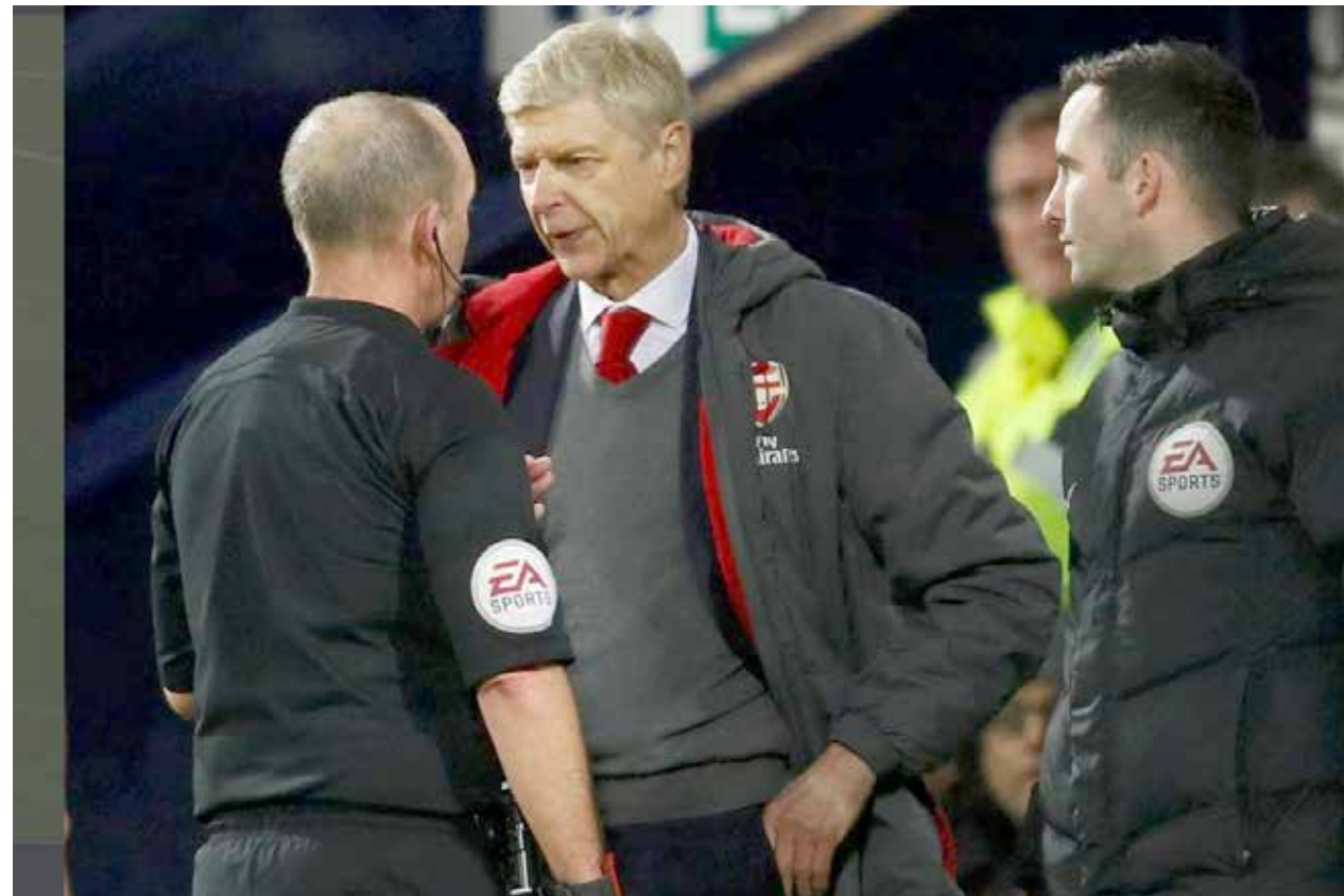
SEETHING: Wenger argues with Mike Dean after a late penalty cost Arsenal a win against West Brom

Yet a stadium ban will prohibit him entering any part of Forest's City Ground on Sunday — or