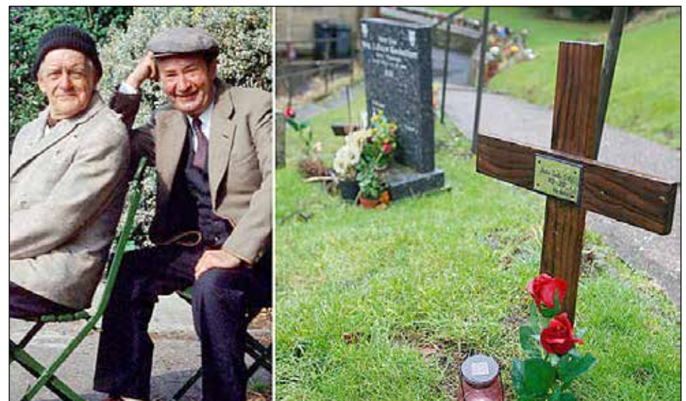
COMPO AND CLEGG: Bill Owen and Peter Sallis are buried side by side in their beloved Yorkshire Dales

He said: "Lunchtime procedures with minimum recovery time are increasingly popular with young, professional women in their twenties, thirties and forties."