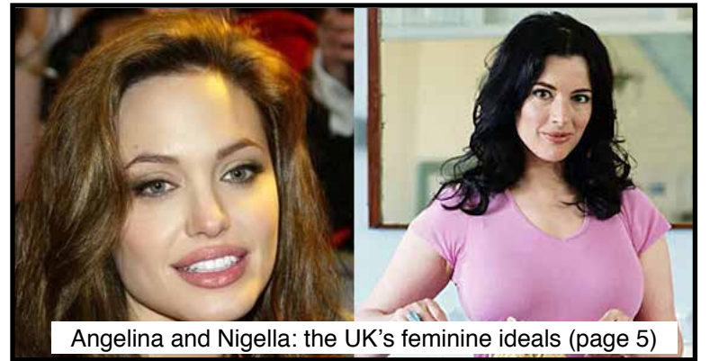
Angelina and Nigella: the UK's feminine ideals (page 5)

California's British Accent™ - Since 1984