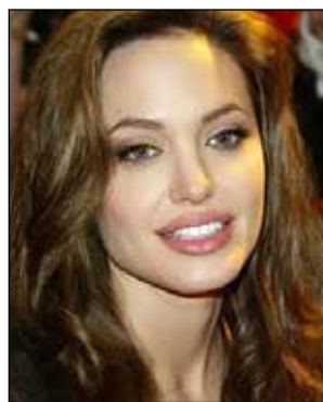
ANGELINA: 'the perfect face'

instead of looking gaunt her skin is glowing with health, so she obviously has great elasticity.