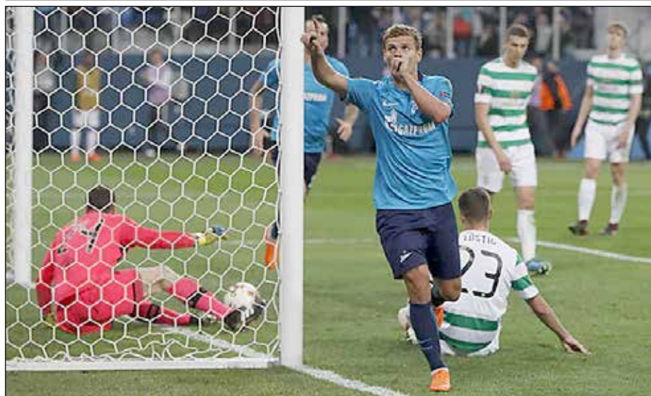
TOO EASY: Aleksandr Kokorin scored Zenit's third goal in an emphatic victory for the Russian side on Thursday night

Potter joins a select club as only the sixth English manager to win a game at the Emirates, along with Alan Curbishley, Phil Brown, Harry Redknapp, Michael Appleton and Garry Monk.