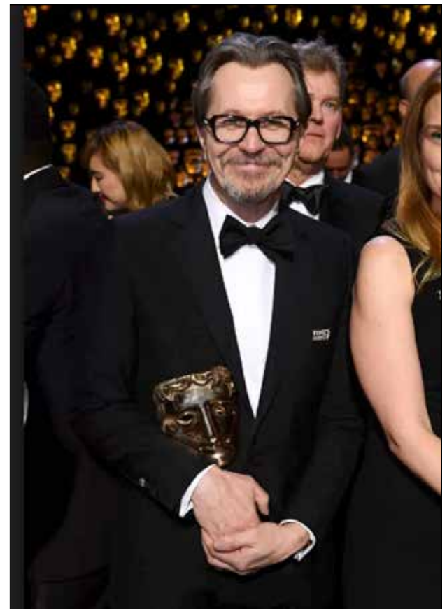
BIG WINNER: Gary Oldman won the Best Actor award for his performance in Darkest Hour