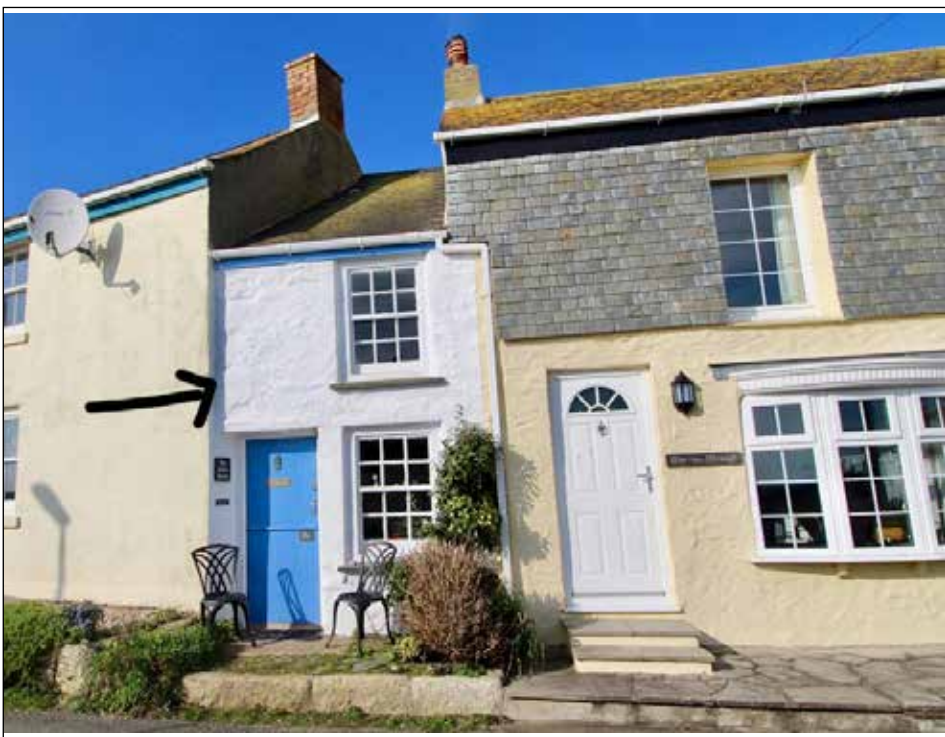
NO ROOM TO SWING A CAT: the interior (left) is cramped while outside (right) the tiny home fits neatly between two fisherman’s cottages