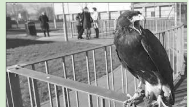
KEEPING THE PEACE: Porthmadog's hawk