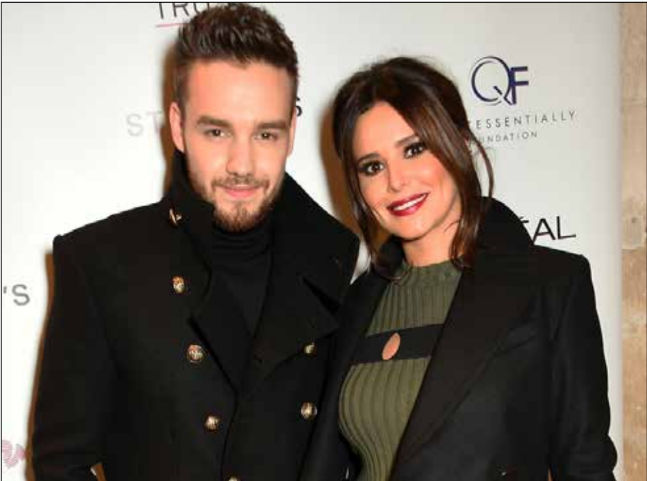
LIAM AND CHERYL: the pair met in 2016 and had a baby a year later.

Born and raised on Tyneside, Cheryl shot to fame in 2002 after winning a place in the girl group Girls Aloud, after participating in the ITV reality show Popstars: The Rivals. Since then she’s rarely been out of the public eye, marrying England footballer Ashley Cole and then suffering national humiliation when the star defender very publicly cheated on her. Cheryl then married – and divorced – French playboy Jean-Bernard Fernandez Versini, before