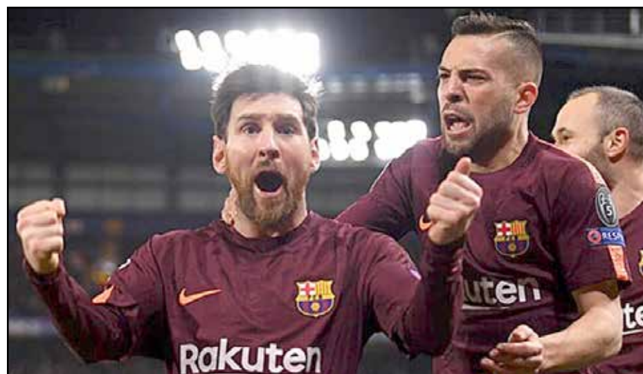
ABOUT TIME: Leo Messi broke his long barren spell against Chelsea with the equalizing goal fifteen minutes from time at Stamford Bridge on Tuesday

The return leg takes place at the Nou Camp on Wednesday, 14 March. Chelsea last played