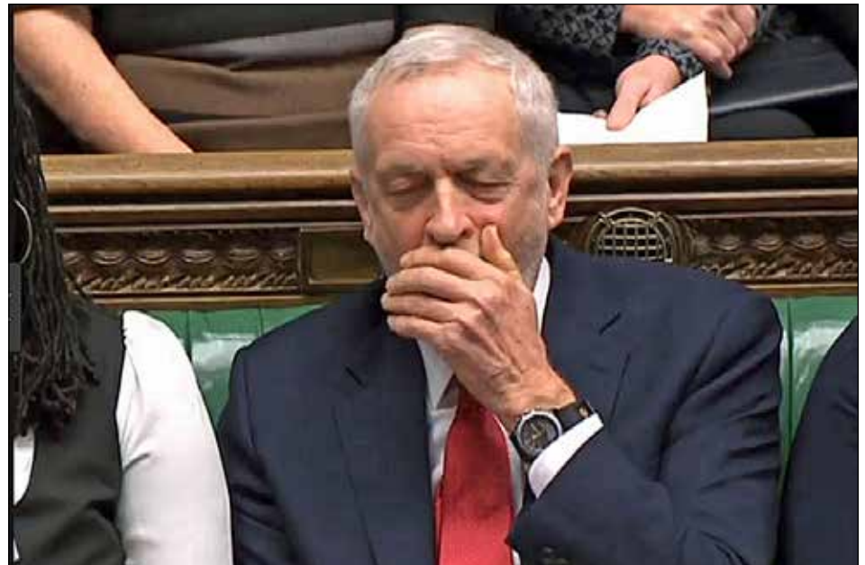
NOT AMUSED: the Labour leader feigned a yawn when he was ribbed by the Prime Minister about 'liking Czechs' in the House of Commons this week

"Now I know he likes Czechs but really!"