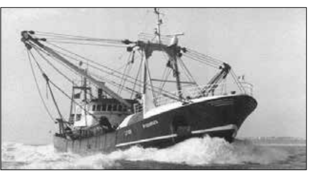
FISHY BUSINESS: one Tory backbencher described the EU'S common fisheries policy as 'disastrous' for British fishermen

to reassure them about the agreement, he said: "I think it's very important that the rules between our formal date of leaving and the end of the implementation period do not have an unfair effect on our fishing communities.