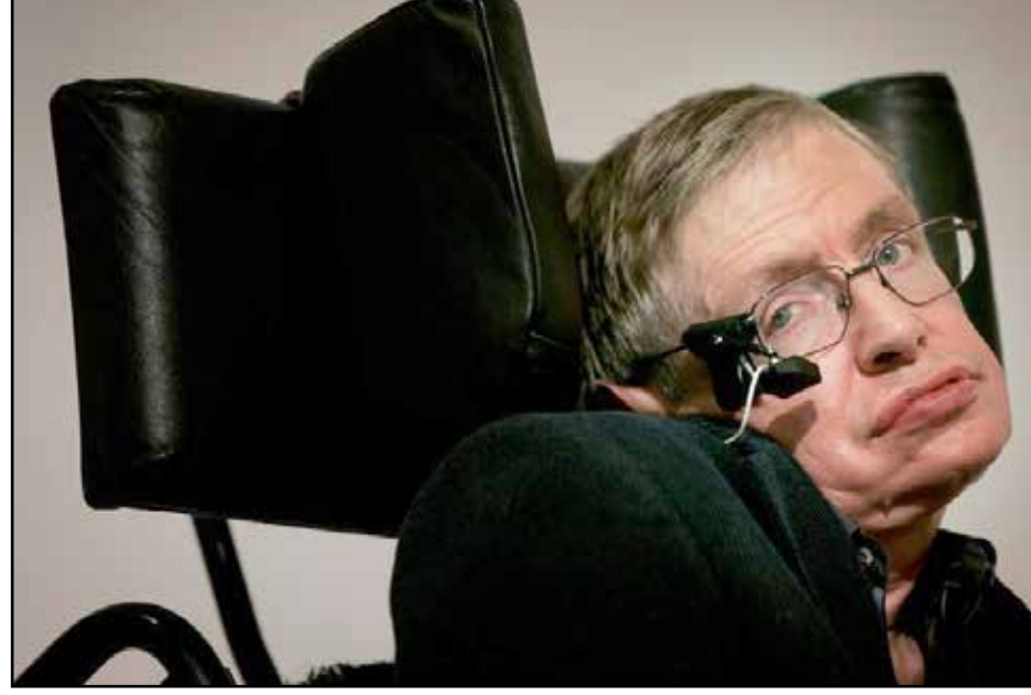
SIR STEPHEN HAWKING: 'an inspiration to millions'

California's British Accent<sup>™</sup> - Since 1984