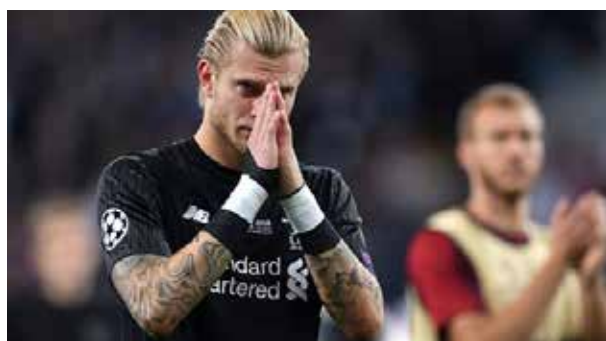
KARIUS: horrific error in Champions League final

Karius has also been stunned by the level of abuse aimed at him on social media because of his continued blunders since his nightmare in the Champions League final. He was at fault again for Borussia Dortmund's third