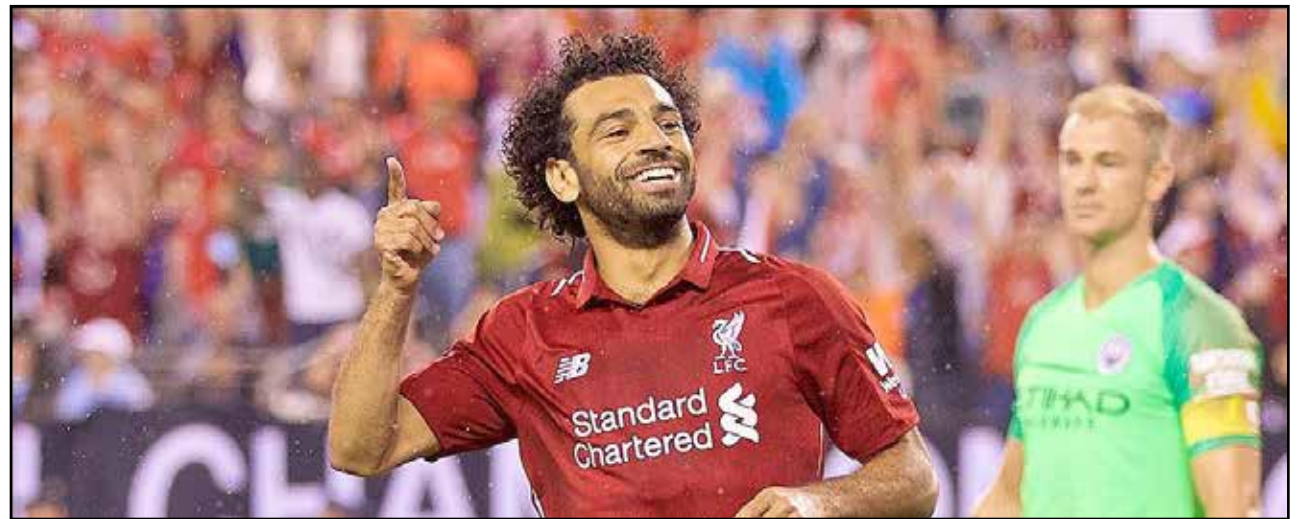
SALAH: happy return for Liverpool this week on their pre-season tour