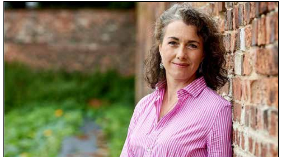
DIVISIVE ISSUE: Sarah Champion was accused of racism after writing an article about sexual abuse by British Pakistani men

"Two or three of my friends are mired in addiction at the moment and I've learned there's nothing you can do until they actually say, 'OK, I'm going to do something about it. I need help.'"