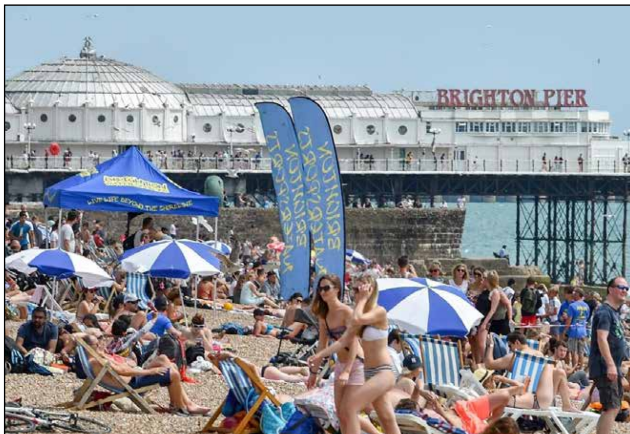
WHEW: WHAT A SCORCHER! Britons flocked to the seaside to beat the heat this week

But thousands of sunseekers cheerfully ignored the advice to seek shelter flocking to beaches, rivers, parks and lakes. One defiant sunbather tweeted: “As long as you stay hydrated and wear the