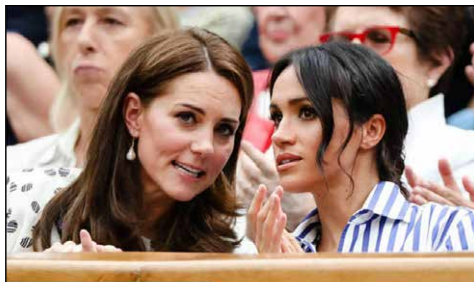
FAST FRIENDS: Kate and Meghan at Wimbledon

"A reconciliation is completely off the table at the moment," the source that Daily Mail describes as a "close friend" to Meghan told the outlet. "There's no chance right now—he's been a complete