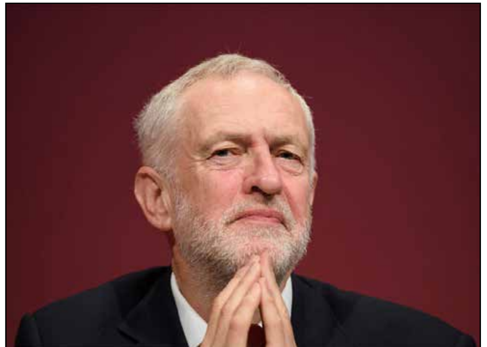
JEREMY CORBYN: the Labour leader is under fire

Semitism is 'widespread' in the Labour Party and that was what my comments were trying to refer to, but we do have a problem which needs stamping out.