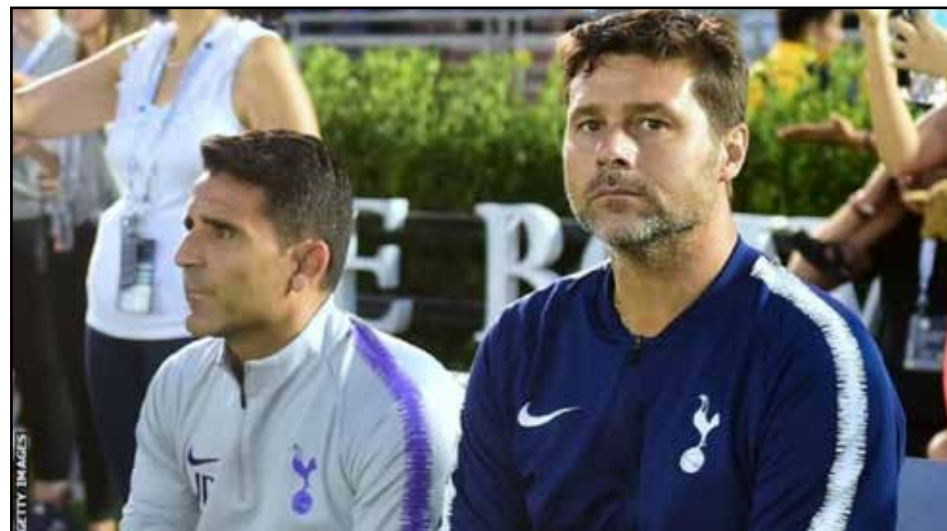
POCHETTINO: "I cannot tell you if we're going to sign one, zero, two or three or four."

There was uncertainty over his future after he