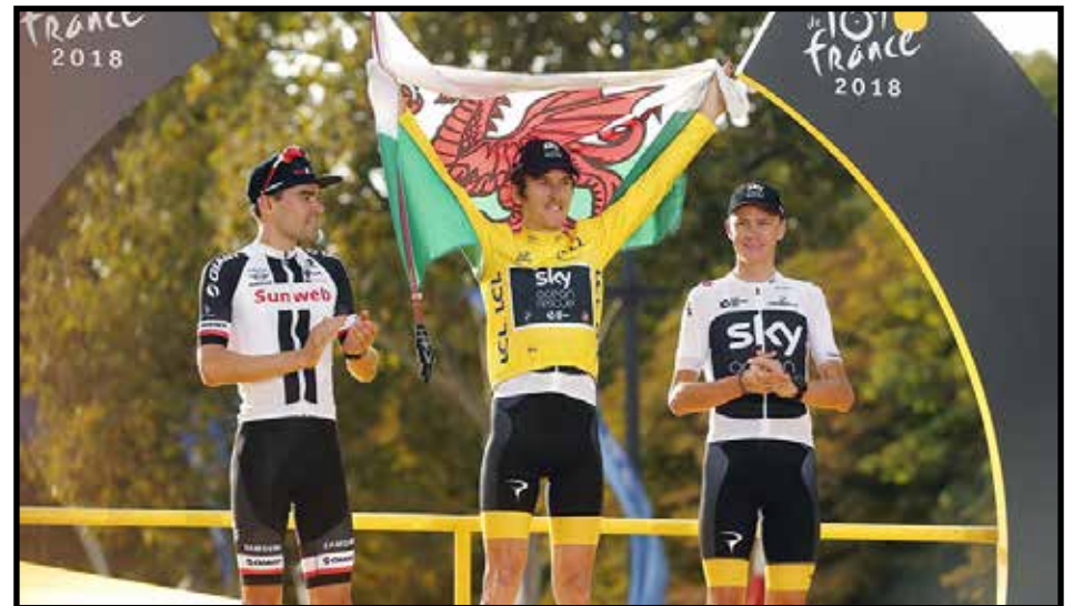
GERAINT THOMAS: The Welshman won the world's most famous cycle race by almost two minutes

Team Sky led the peloton into Paris, having allowed France's Sylvain Chavanel to ride clear for one lap in his