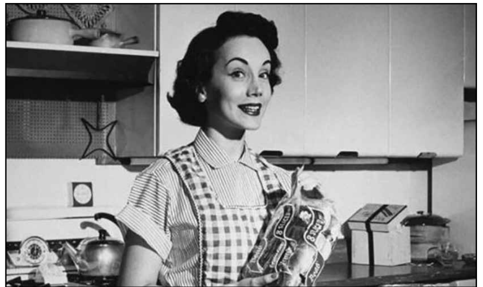
BYGONE AGE: 70 per cent of women admitted they lack the practical skill sets expected of their mothers and grandmothers as housewives.

"Nearly 80 per cent said they would rather pay for convenience, such as buying birthday cakes instead of baking them at