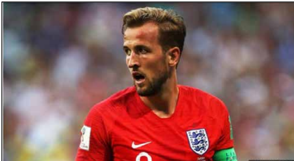
The image of the England striker Harry Kane means the £5 note is now worth £50,000