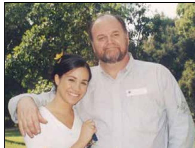
DADDY'S GIRL: Meghan with Thomas Markle

A source close to royal aides told The Mirror in a report published yesterday that there are three options the royals