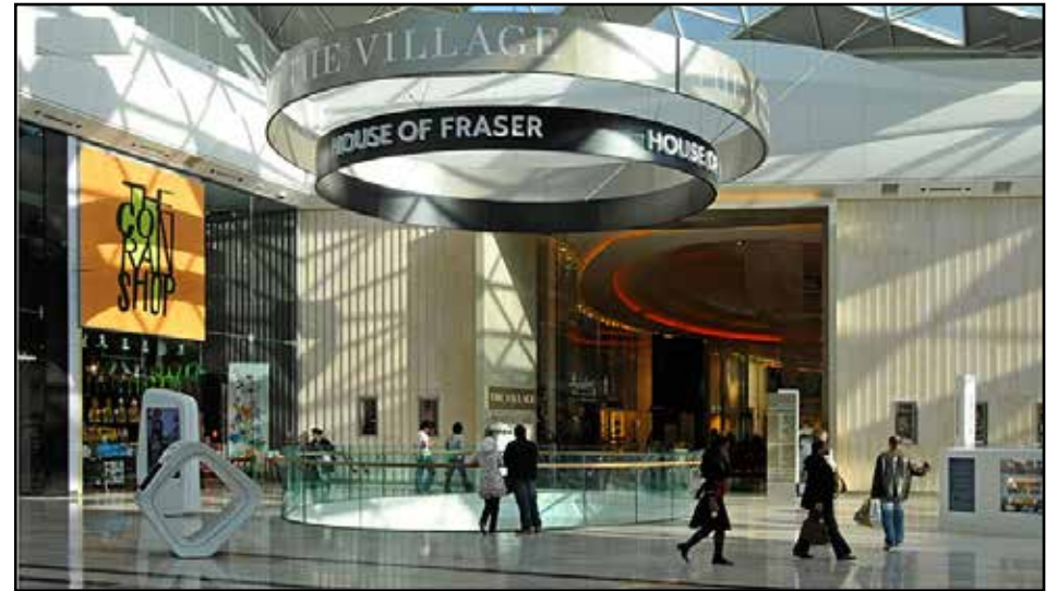
HOUSE OF FRASER: The struggling retailer has announced plans to shut 31 of its 59 stores and seek rent reductions on other outlets