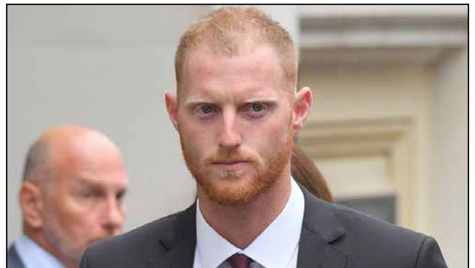
STICKY WICKET: Ben Stokes outside Bristol Crown Court on Tuesday

she had gone to tell Mr Corbyn he was "perceived as being anti-Semitic". She denied reports she had sworn at him.