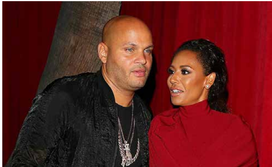
ACRIMONIOUS SPLIT: Stephen Belafonte and Melanie Brown

"I went through a long year-and-a-half, two years of almost being asked to give up the rights to my daughter, financial things. And you know what? I stuck with it. There was nothing but lies told about me ... That means, that guess what? It's settled, done.