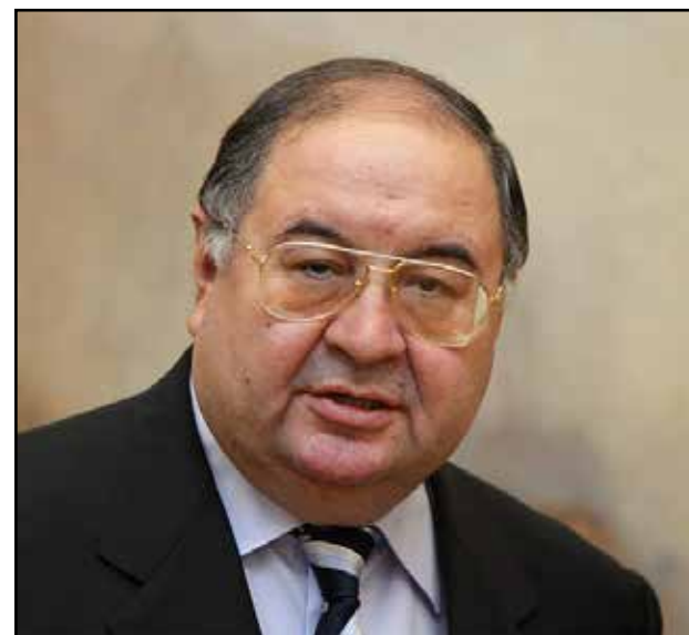
USMANOV: the Uzbek-born magnate has been locked in a power struggle with Kroenke for several years

"Stan Kroenke taking the club private will see the end of supporters owning shares in Arsenal