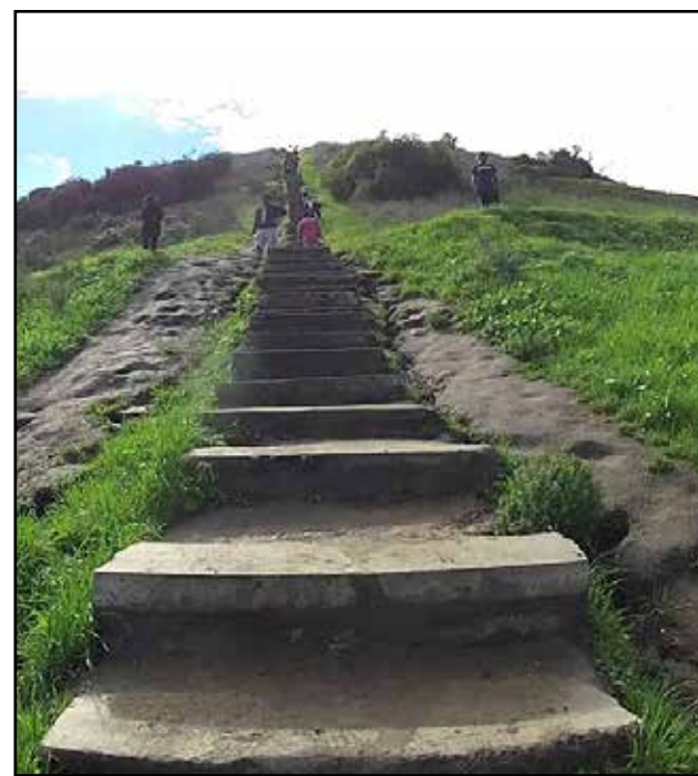
BALDWIN HILLS: get up those stairs...

It might be a little late to get that summer beach bod you desired, but you