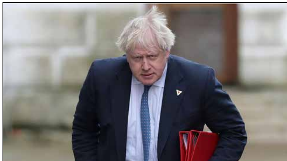
THERE HE GOES AGAIN: Johnson was writing in the Daily Telegraph language".

A former Tory chairman, Lord Pickles, said Mr Johnson, who was foreign secretary until resigning last month over Brexit, risked "closing down" the debate with his "illiberal