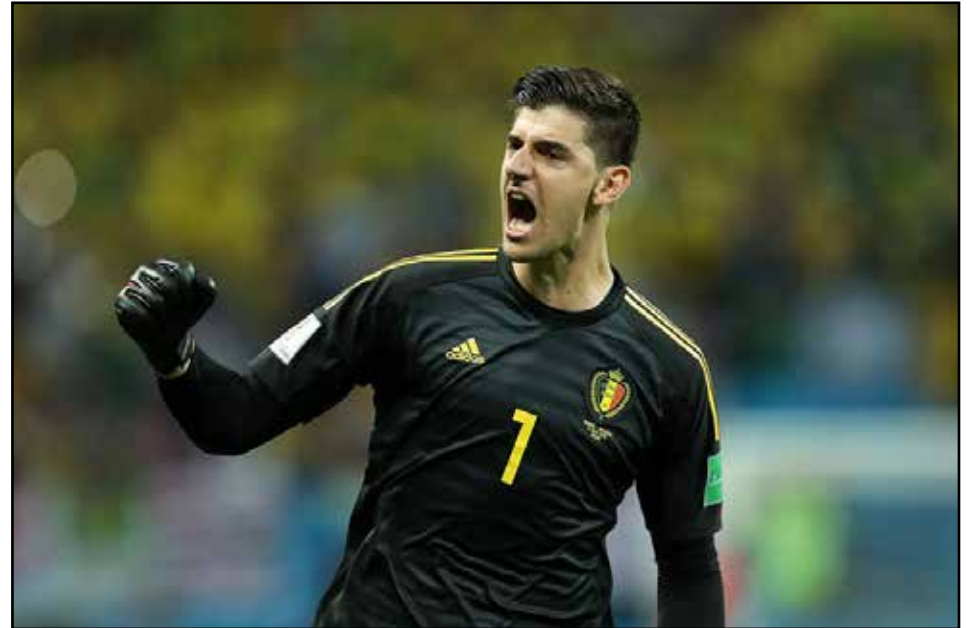
COURTOIS: Real Madrid agreed a reported £31m fee that will also see Mateo Kovacic spend a year on loan in London.

Courtois played a total of 154 appearances for Chelsea, winning the Premier League on two occasions.