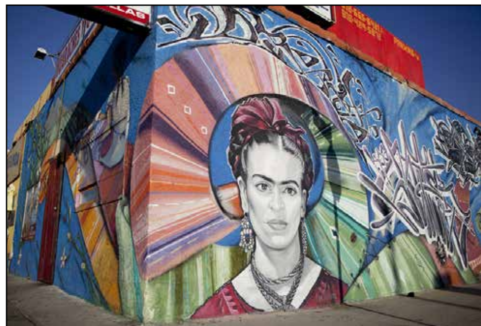
FRIDA VIEW: one of the many murals in Pacoima's Mural Mile

Yoga is the perfect practice for people of all ability levels. You'll improve muscle strength, gain greater tone and flexibility, lose weight, reduce stress and just generally feel better about yourself. Ideally, you'd would give a little something to take one of the following yoga classes, but it's not required: Yogala in Echo Park offers at least one donation-only yoga class every weekday; Yoga Circle Downtown offers a number of donation-only classes, as does Santa Monica's Power Yoga. Runyon canyon also offers donation only yoga!