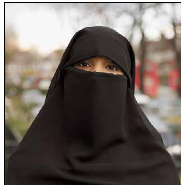
COVER-UP: a burka wearer in London

Lord Sheikh, a senior Tory peer and former adviser to David Cameron, called for Mr Johnson to have the whip removed over the comments. He told BBC2's Newsnight: "Take the whip from him. Why not? He's not a super human being, he's a member of the party. The party chairman, the prime minister has the right to take the whip."