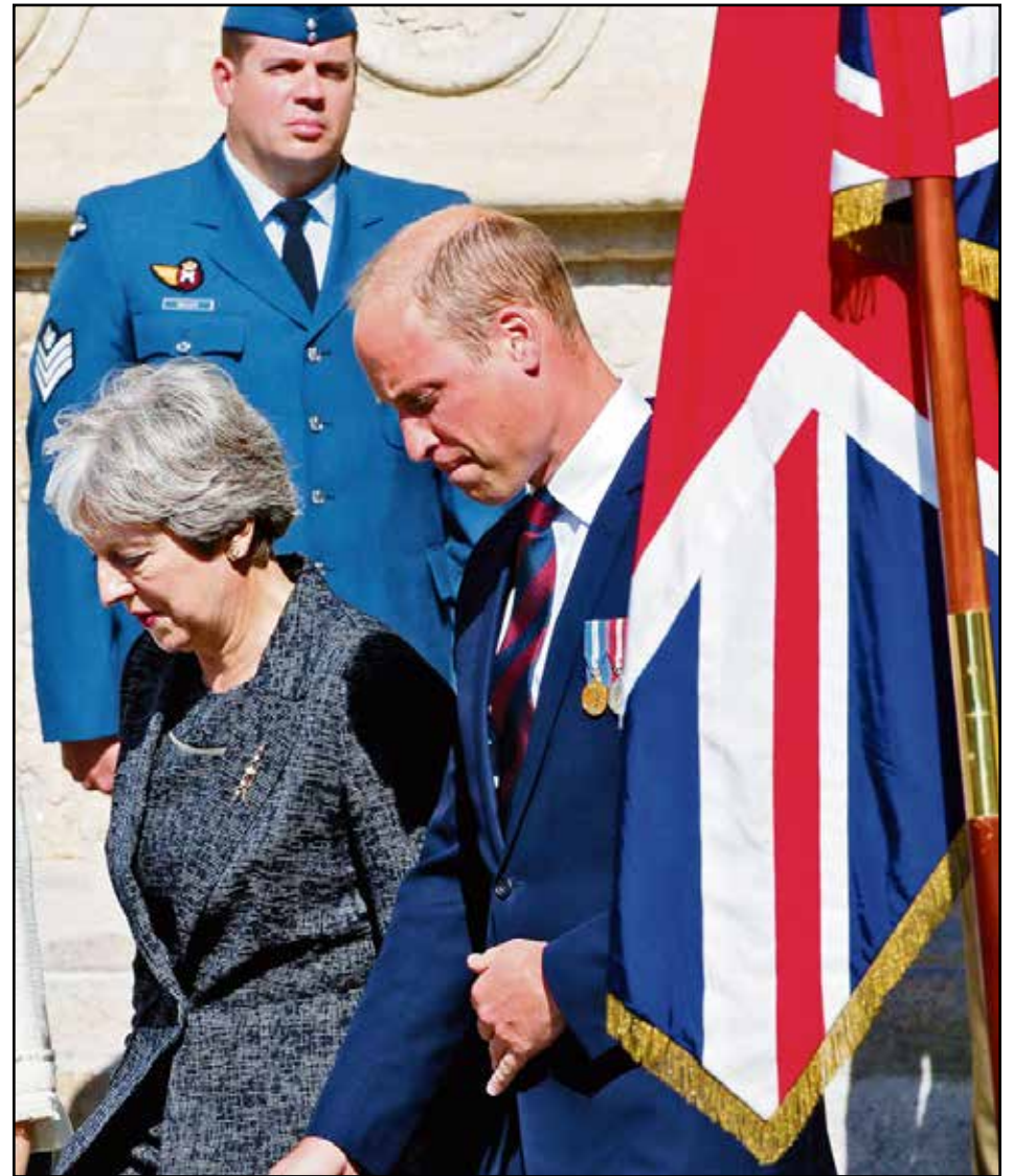
The Prime Minister, pictured with the Duke of Cambridge, paid tribute to the "courage, bravery and skill" of the troops who fought at Amiens.

"So there's sadness but also pride that he took part in a key battle that brought ultimately the Allied victory and no doubt about it, shortened the war as well."