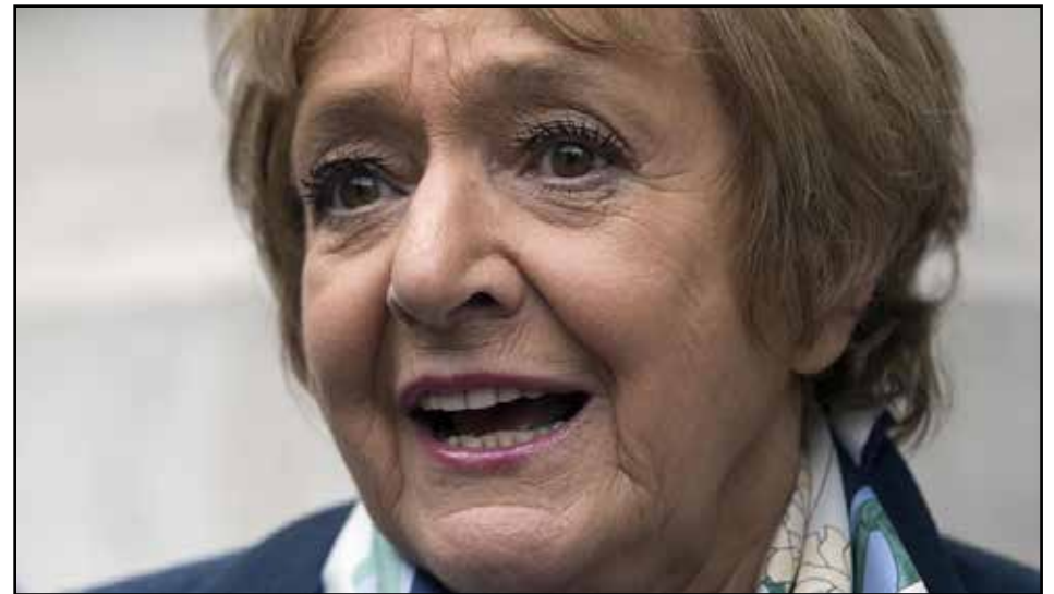
MARGARET HODGE: The Labour MP lost family members in the Holocaust

Some Labour figures, including the shadow defence secretary Nia Griffith, had called for the investigation into Dame Margaret to be dropped - and shadow chancellor John McDonnell said Labour needed to "move on".