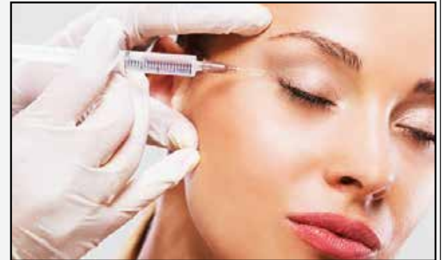
Superdrug said the treatments will be administered by nurses "trained to the highest standard"

woman was permanently blinded in one eye in Australia from a dermal filler injection at a clinic where there was no doctor physically present."