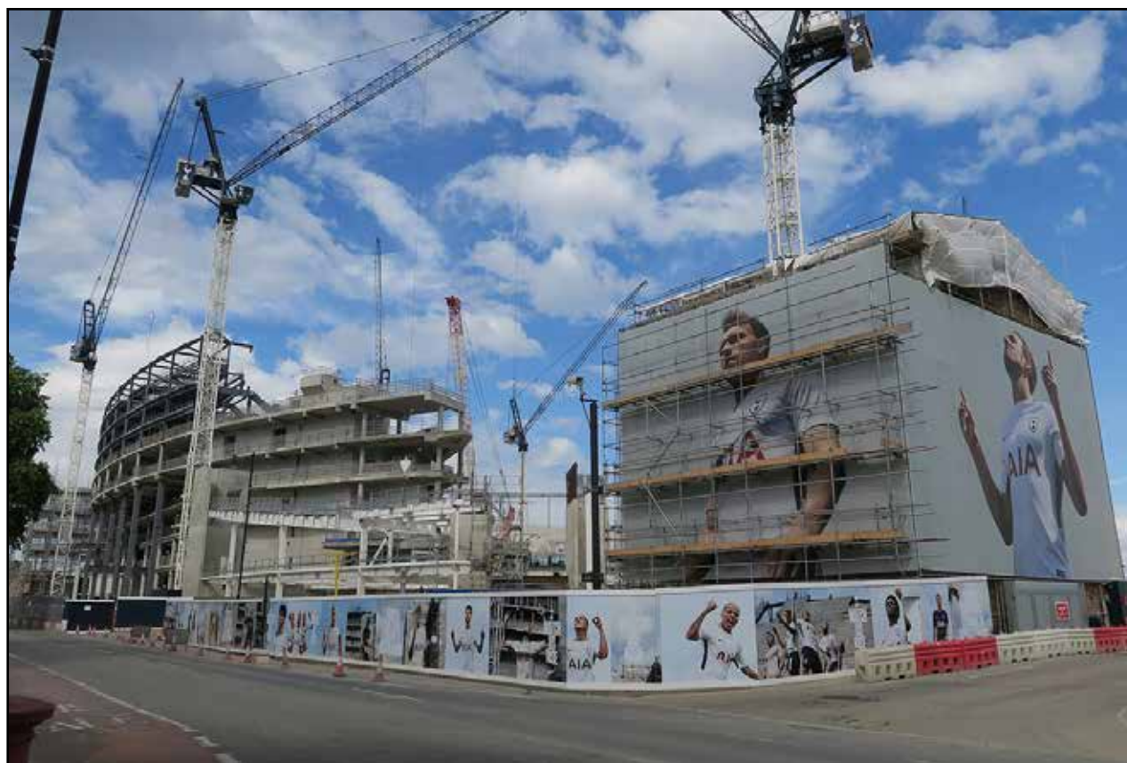
Spurs' planned debut at the new White Hart Lane has been switched to Wembley