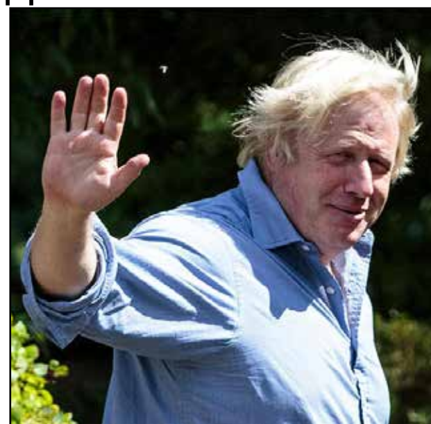
BORIS JOHNSON: no response yet to flurry of criticism that greeted his article in the Daily Telegraph

The controversial Conservative MP faces a disciplinary investigation after saying women in burkas looked like "letter boxes" or "bank robbers". The traditional red pillarbox in Hadleigh, Essex, was draped in a bin bag with a "Free Boris" sign at its foot. Mr Johnson is yet to respond to the row, prompted by an article he wrote in a newspaper last week.