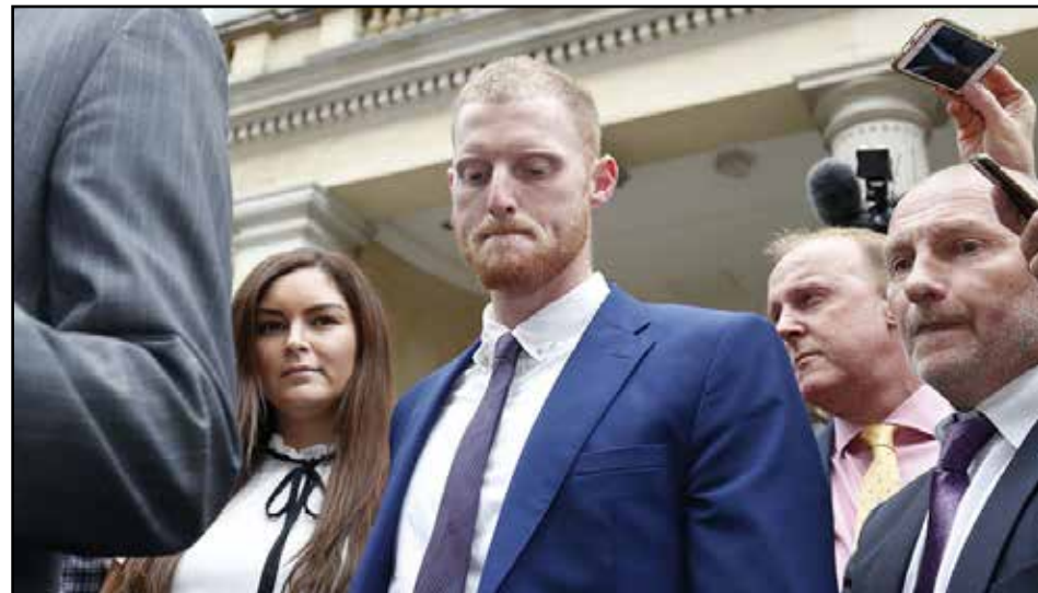
STOKES: 'This is the end of an 11-month ordeal,' said his solicitor