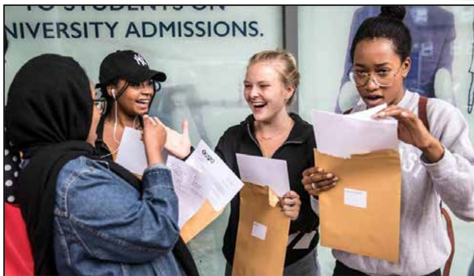
Students at Kensington Aldridge Academy, next to Grenfell Tower, open their A-Level results on Wednesday morning