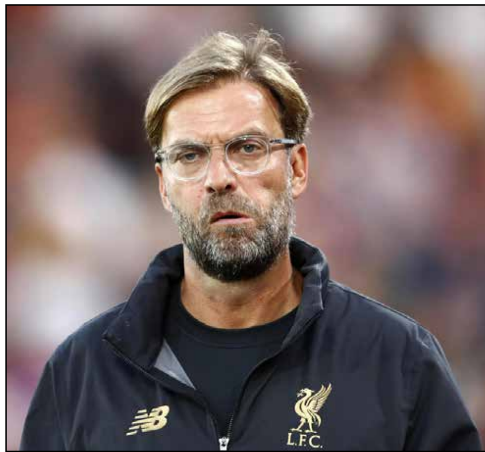
“It is too strong to say anything after two match days.” - Jurgen Klopp

“We probably did enough to get a result,” Hodgson told BBC Sport. “I don’t think it was a penalty. I’m angered that a good result was taken from us.”