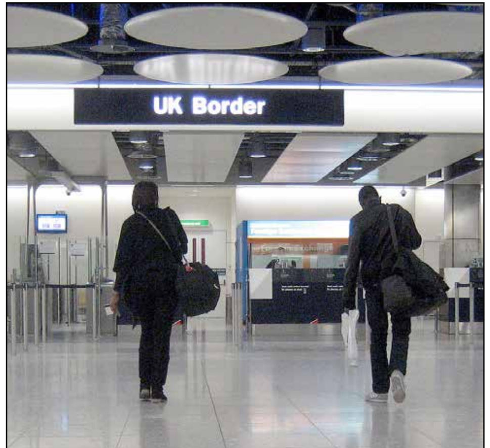
BUT THEN AGAIN: despite the rise in applications for citizenship, the number of migrants from Poland and seven other countries has fallen significantly

Net migration remains almost three times the government's target despite the number of people arriving from the EU being at their lowest in six years, according to the latest Office for National