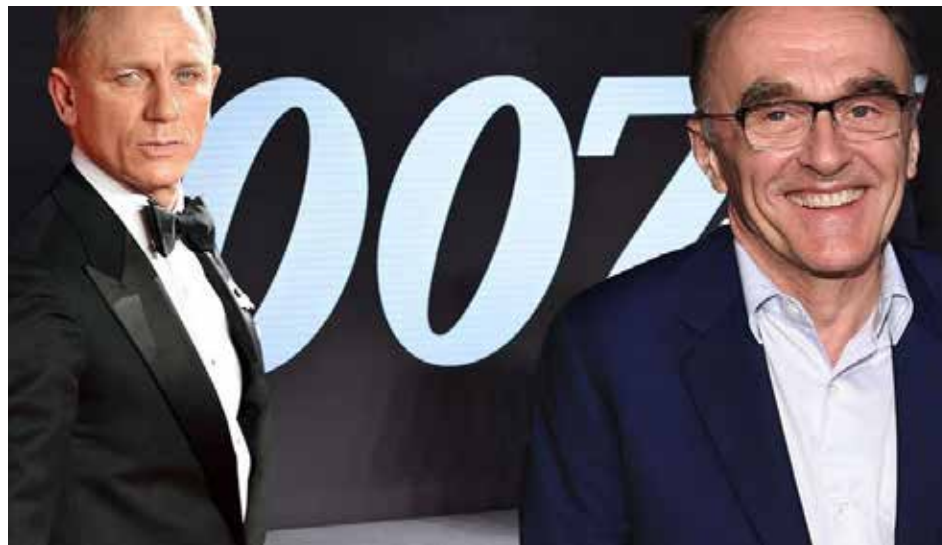
'NO MORE BONDAGE': Danny Boyle (right) had jumped ship, and star Daniel Craig has insisted this will be his last outing as the iconic British agent