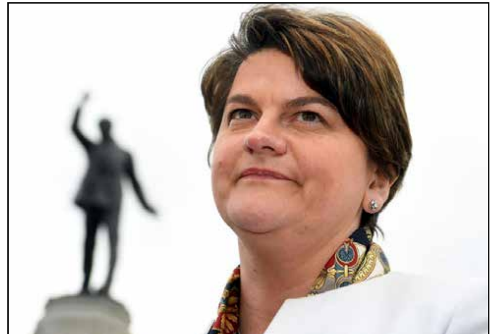
"There is only one problem party and let's call it out - that's Sinn Fein," said DUP leader Arlene Foster

Arlene Foster, the DUP leader who was first minister when power-sharing collapsed, also