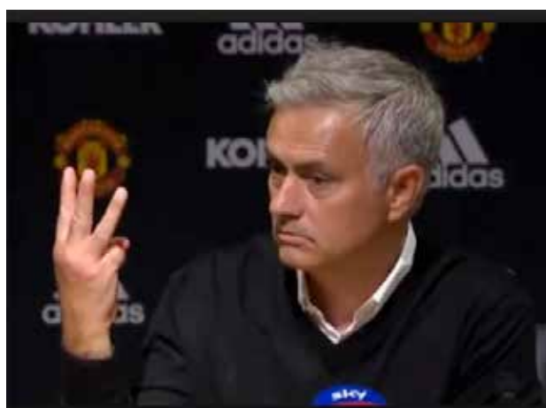
MELTDOWN: Mourinho's press conference following United's 3-0 loss on Monday to Spurs was a car crash

Asked about United's defensive problems in the post-match news conference, he raised three fingers and said: "Do you know what this