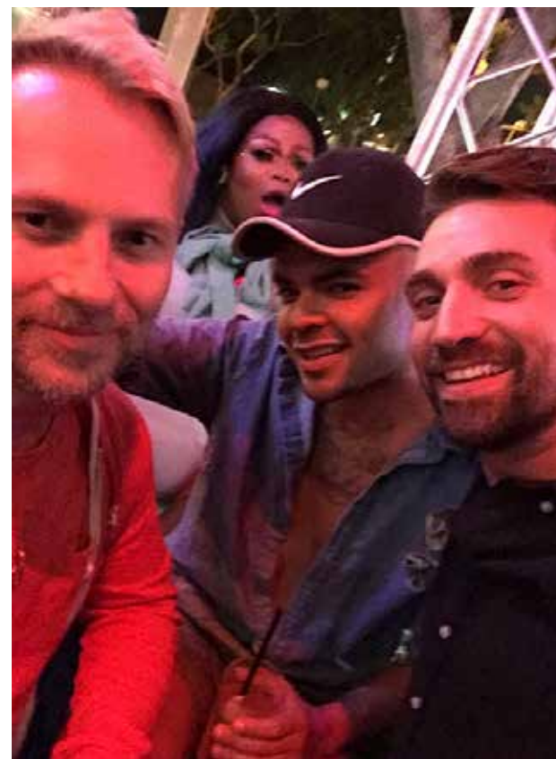
ALL FUN AND GAMES: until that last cocktail kicks in....

that is making me most upset. What went on between 1am-2am on Sunday morning? How did I end up in that car? Did the robbers put me in the vehicle? Was I running away from someone and found an unlocked car to hide out in and passed out? I don't have those answers but did end up talking to the owner of the vehicle today.