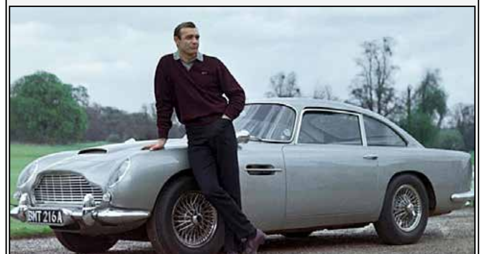
Aston Martin has come a long way since James Bond and Goldfinger in 1964

James Bond's favorite carmaker is planning to go public.