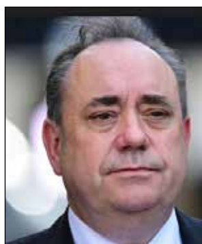
SALMOND: the former first minister quit the SNP this week

Mr Salmond also launched a crowdfunding appeal to pay his legal costs, which surpassed its £50,000 target in a few hours but has been heavily criticised by