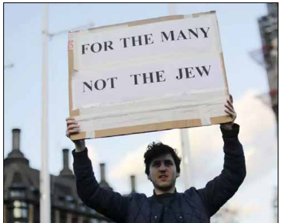
RISING TIDE? A demonstrator makes his feelings plain at Westminster this week