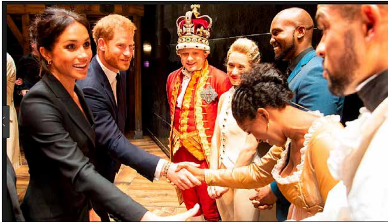
Harry and his wife Meghan at the musical, which raised £300,000 for the HIV charity he co-founded in 2006.

Posting a clip of the performance on Twitter,