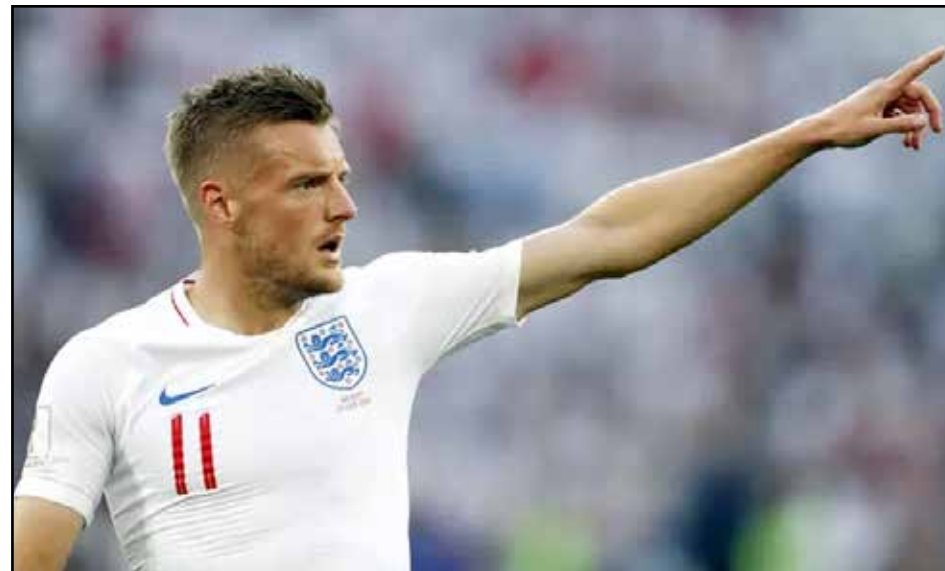
VARDY: "I'm not getting any younger and you can see, to be fair to the gaffer, he wants to make it more youthful, which obviously had its benefits during the World Cup."

Gary Cahill also spoke with Southgate after the World Cup and indicated