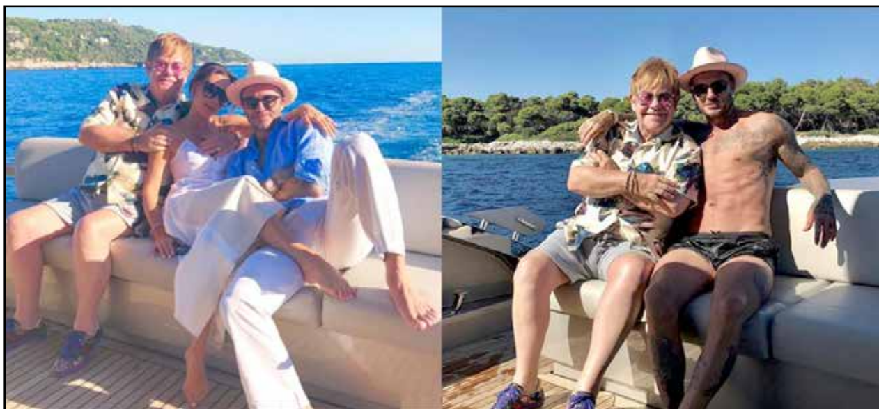
THE HIGH LIFE: Sir Elton John, Victoria Beckham and husband David cavorting in the South of France

picture: "Two great legends, one boat, one love...everyday is paradise."