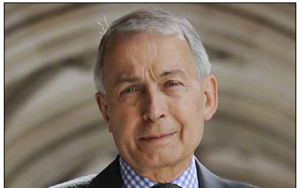
"The leadership is doing nothing substantive to address this erosion of our core values." - Frank Field, MP for Birkenhead

Asked if he was "jumping before being pushed" following the confidence vote, he replied: "No, they're 30-odd people who voted against me... the idea that 30-odd people could decide the fate of what will be the choice that Labour Party voters get next time is absurd."