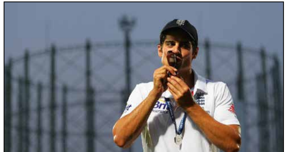
CAPTAIN FANTASTIC: "When it was tough I didn't throw the towel in," Cook said.

Pietersen later made allegations of a bullying culture in the England squad.