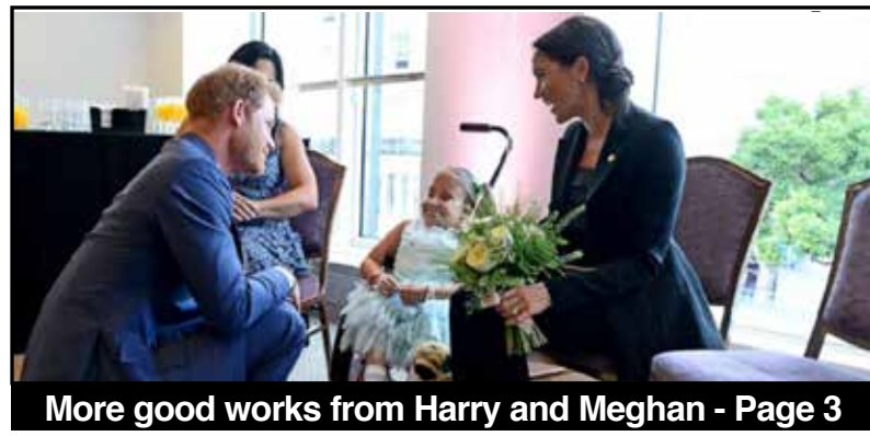
More good works from Harry and Meghan - Page 3

California's British Accent™ - Since 1984