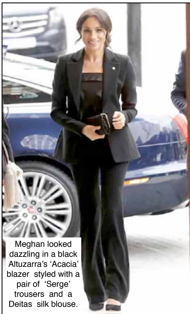
Meghan looked dazzling in a black Altuzarra’s ‘Acacia’ blazer styled with a pair of ‘Serge’ trousers and a Deitas silk blouse.