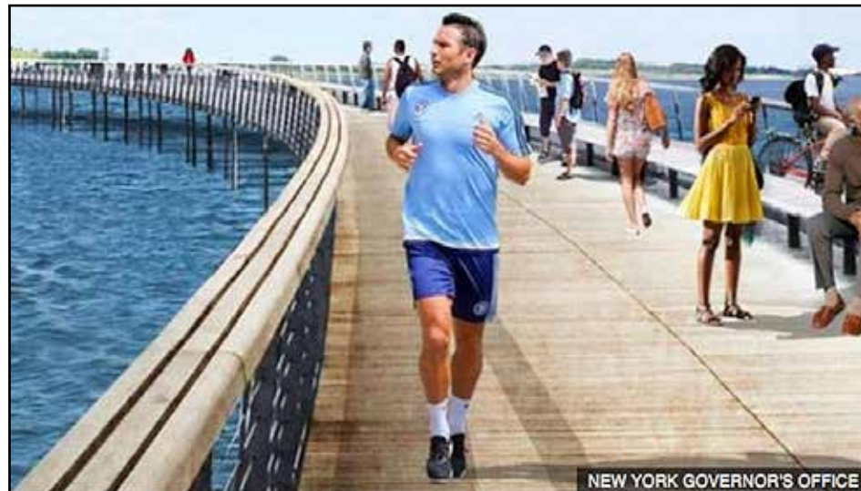
PERFECTLY FRANK? Governor Cuomo's office's press release was far from it...

However, Lampard is not the first public figure to have their image