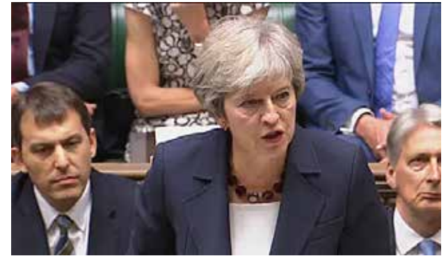
May described the incident in Salisbury as "a sickening and despicable act."

Tory backbencher Dominic Grieve, a former attorney general and now chairman of