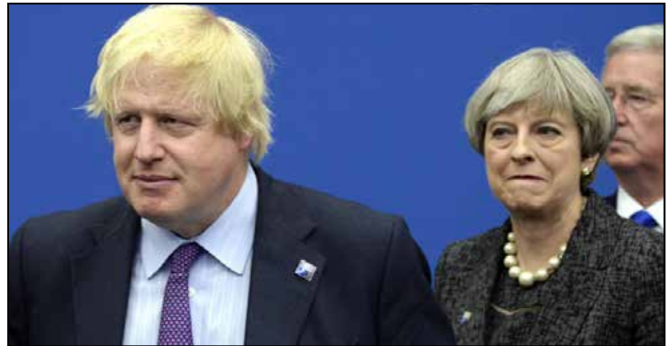
SHOWDOWN: Boris Johnson is expected to launch a full scale challenge to Theresa May's leadership within months

Downing Street said the Russian charge d'affaires was summoned to the Foreign Office to be told of the situation. The Russian ambassador is not currently in the country.