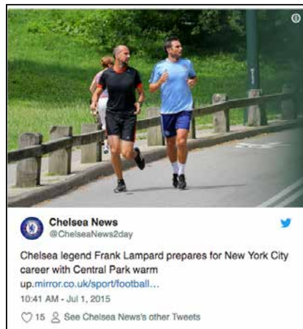
ORIGINAL: The Chelsea News tweet featuring Lamps

And in 2014, a BBC article about male obesity featured an image of a man's waistline, which turned out to be of then-Schools Secretary Ed Balls from 2008.