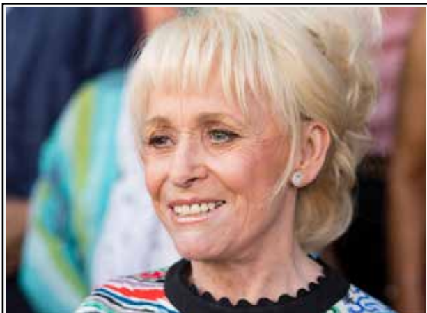
Veteran: Windsor's career has spanned six decades