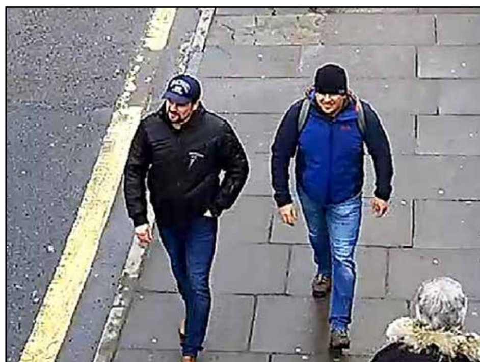
DEADLY DUO: the pair were caught on CCTV in Salisbury shortly after Mr. Skripal's front door knob was smeared with the deadly nerve agent

The pair, who travelled on Russian passports with visas, visited Britain several times in