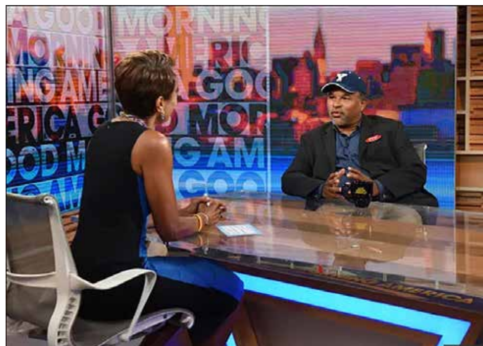
TURNING IT AROUND: Geoffrey Owens on Good Morning America

It is obvious that the purpose of this was to shame Mr Owens, who in their eyes had fallen from grace. However, the plan backfired and Owens, who was initially embarrassed, managed to pick himself