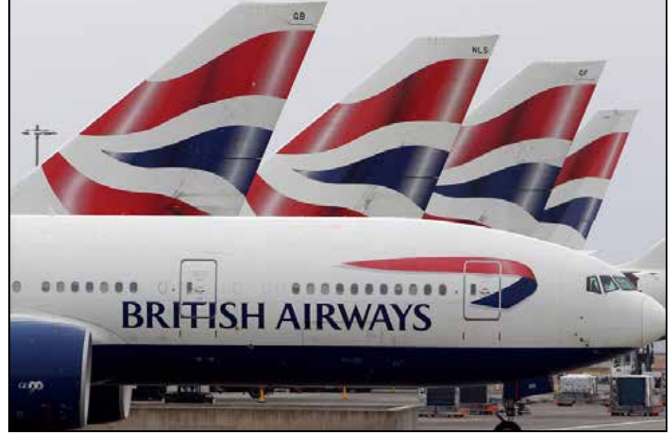
ROOM FOR IMPROVEMENT: BA is the fourth busiest transatlantic carrier

on fuel-efficient Boeing 787 Dreamliners for transatlantic routes, was the most efficient airline, with 44 passengerkilometres per litre. This was 33 per cent higher than the industry average.