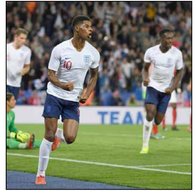
RASHFORD: second half strike for England

England, as they had to do, improved after the break and the decisive goal came in the 54th