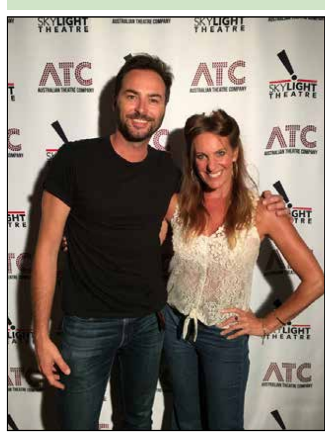
BIG DOWN UNDER: BiLA can recommend Swansong,, the one-man show at the Skylight Theare in Los Feliz

The British Weekly, Sat. September 15, 2018