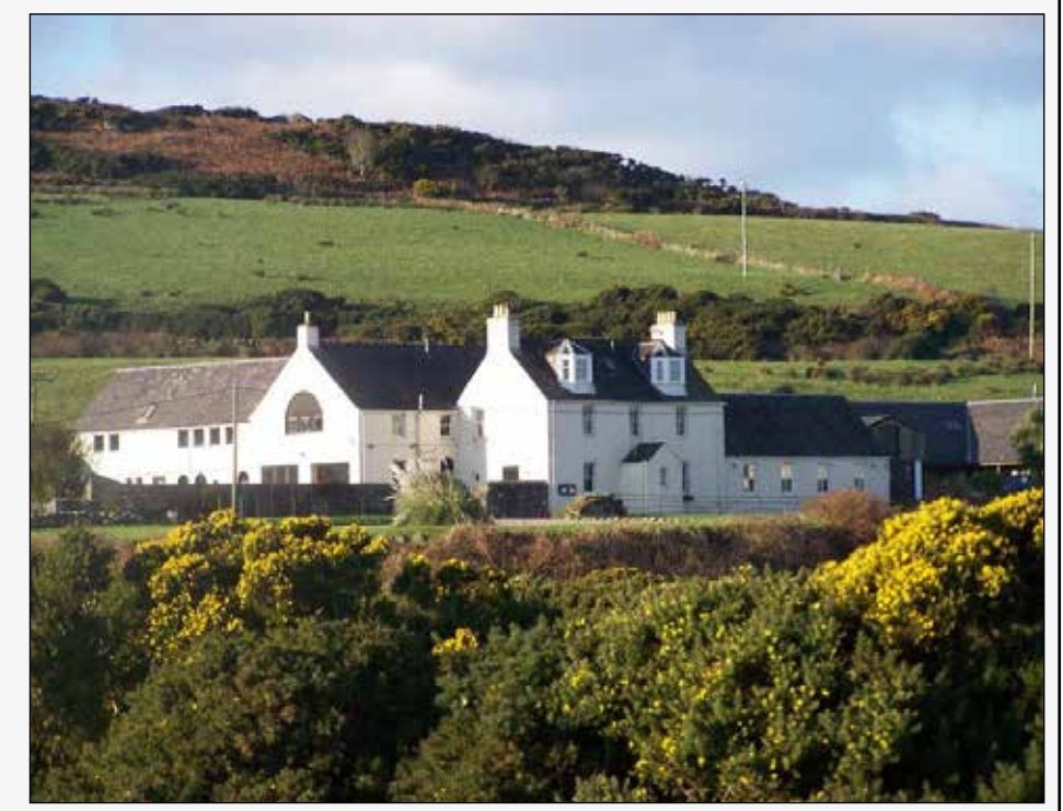
RICH PICKINGS?: The Gigha Hotel 'was full of guests' Saturday night

Police Scotland said: "Between 10pm on Saturday, September